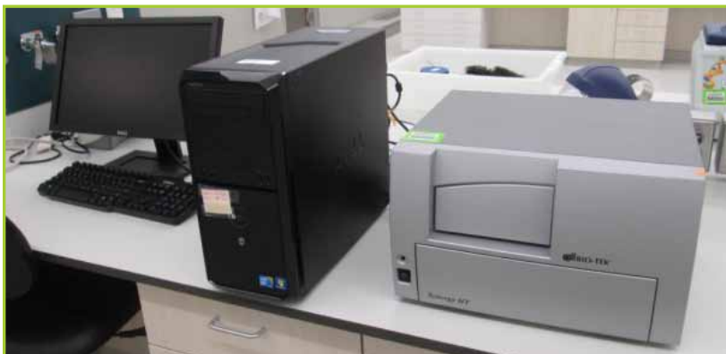
BIO-TEK SYNERGY HT MULTI-DETECTION MICROPLATE READER FLUORESCENCE, TRF, ABSORBANCE AND LUMINESCENCE MICROPLATE READER EQUIPPED WITH UV-VIS FLUORESCENCE AND LUMINESCENCE FOR TOP- AND BOTTOM- READ ASSAYS, PC NOT INCLUDED