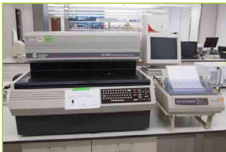
BECKMAN COULTER LS 6500 MULTI-PURPOSE SCINTILLATION COUNTER