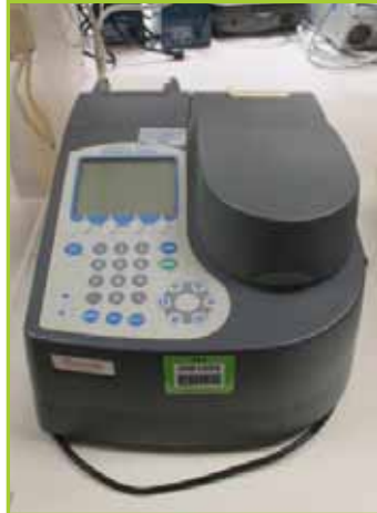
THERMO ELECTRON GENESYS 10 BIO UV-VIS SPECTROPHOTOMETER