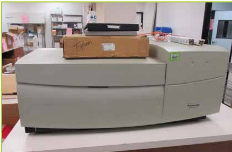
MOLECULAR DEVICES TYHOON 8600 VARIABLE MODE IMAGER WITH ADDITIONAL STORAGE PHOSPHOR SCREEN AND MANUALS