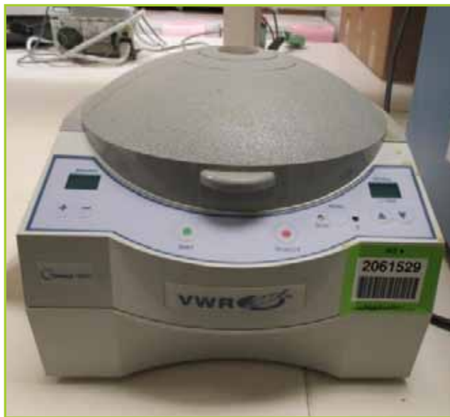
VWR GALAXY 16DH TABLE TOP CENTRIFUGE