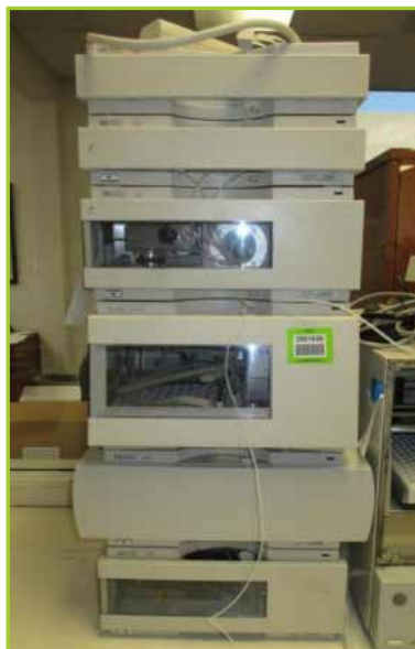
AGILENT / HP LOT INCLUDES (6PC)