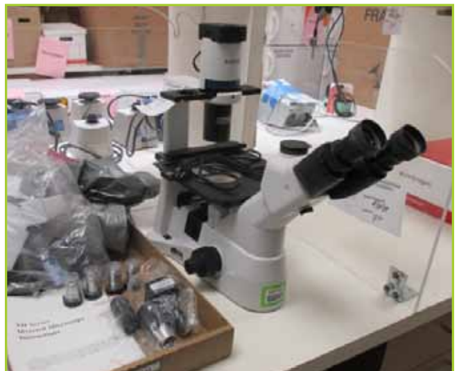
AMSCOPE INVERTED MICROSCOPE WITH X,Y STAGE; (6) OBJECTIVES; MD700 DIGITAL CAMERA; ACCESSORIES INCLUDED