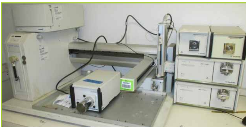
GILSON LOT INCLUDES (8PC) HPLC CONSISTING OF: (1) 215 AUTOSAMPLER; (1) 156 UV-VIS DETECTOR; (1) 811C MIXER; (1) 819 VALVE INJECTOR; (2) 306 PUMP; (1) 807 MANOMETRIC MODULE; (1) 806 MANOMETRIC MODULE