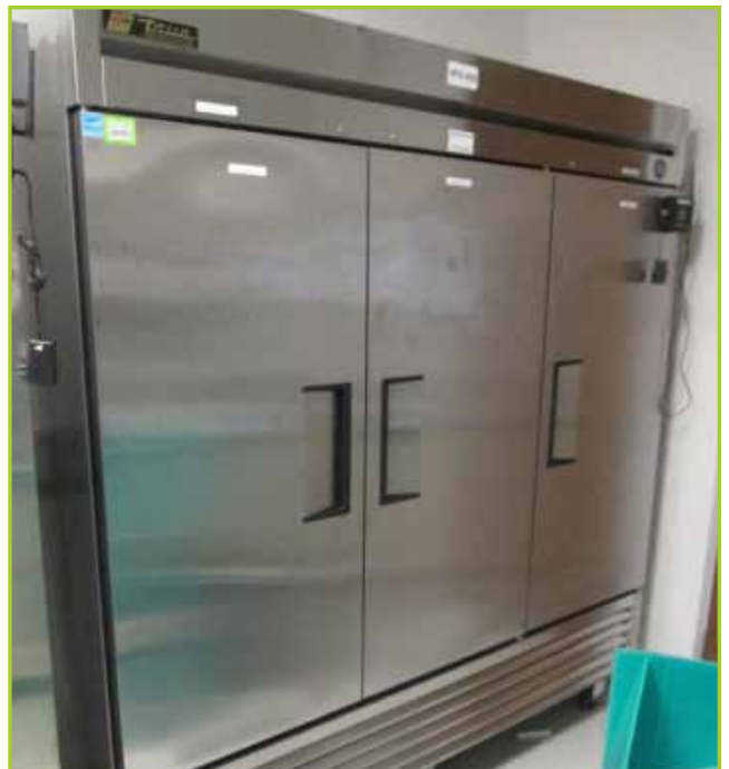
T-72 79" SOLID DOOR REACH-IN REFRIGERATOR, 1/2 HP, 115V, 1 PH, 9.6A