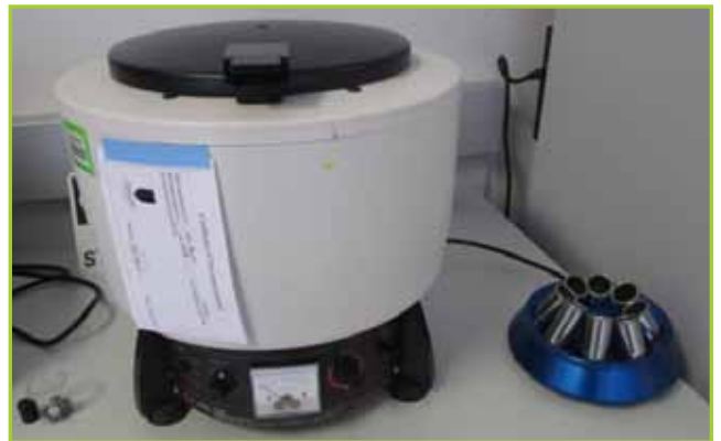
INTERNATIONAL EQUIPMENT COMPANY HNSII CENTRIFUGE