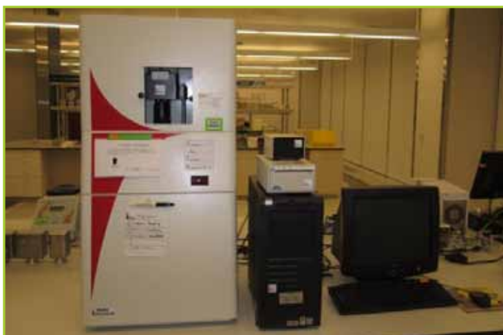
ALPHA INNOTECH 2.1.3 IMAGING CABINET

GO ONLINE FOR A COMPLETE LISTING INCLUDING: STORAGE TANKS, PUMPS, PIPETTES, POWER SUPPLIES AND MORE.