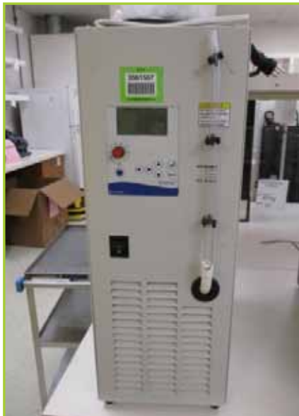
FISHER SCIENTIFIC ISOTEMP CHILLER

STARTING: JUNE 25, 2014 – 7:00 AM EST | ENDING: JUNE 26, 2014 – 10:00 AM EST | LOCATION: SAN DIEGO, CA