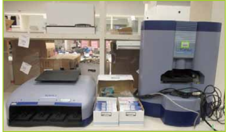
FLUIDIGM PROTEIN CRYSTALLIZATION SYSTEM CONSISTING OF: (1) TPZ-AIX AUTOINSPEX WORKSTATION S/N# AIX-00124 AND (1) TPZ-FID CRYSTALLIZER S/N# FIDX-00307; (1) TOPAZ TPZ-AIX AUTOINSPEX WORKSTATION S/N# AIX-00124; ACCESSORIES AND DOCUMENTATION INCLUDED