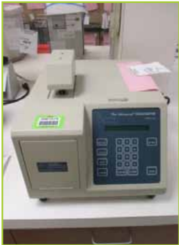
ADVANCED INSTRUMENTS 3D3 OSMOMETER