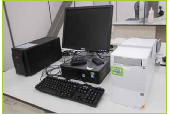
AGILENT G2939A 2100 BIOANALYZER