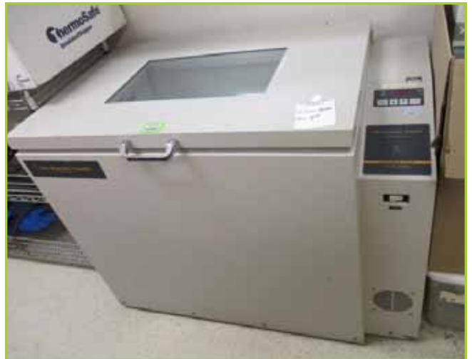
NEW BRUNSWICK C25 INCUBATOR SHAKER