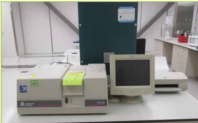
BECKMAN COULTER DU 640 SPECTROPHOTOMETER WITH MONITOR AND PRINTER