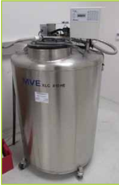
MVE XLC 810HE-F LIQUID NITROGEN STORAGE TANK

STARTING: MARCH 19, 2014 – 7:00 AM EST | ENDING: MARCH 20, 2014 – 10:00 AM EST | LOCATION: JERSEY CITY, NJ