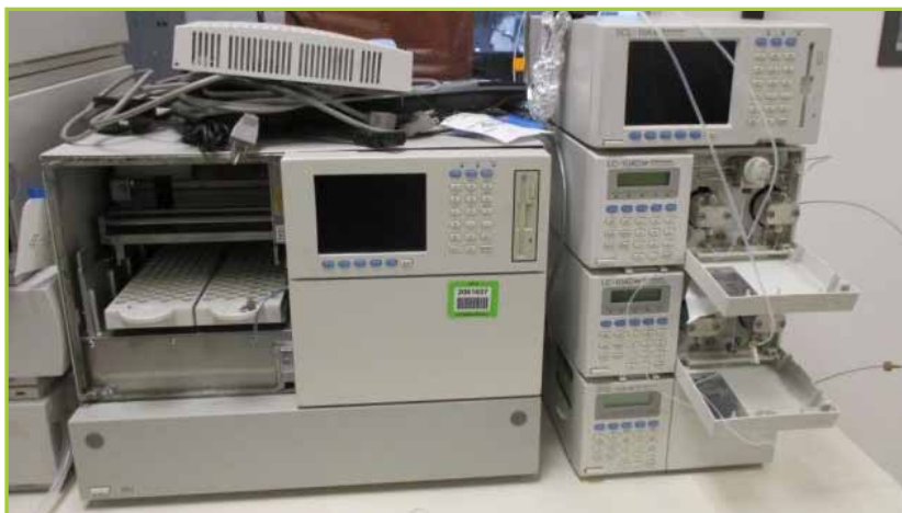
HIMADZU LOT INCLUDES (5PC) HPLC CONSISTING OF (1) SIL-HT AUTO SAMPLER (BROKEN DOOR); (1) SCL-10A SYSTEM CONTROLLER; (2) LC-10AD PUMPS; (1) SPD-10A UV-VIS DETECTOR. HIT# 2061637