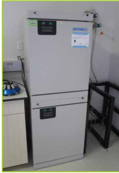
HOTPACK 305751 DOUBLE STACKED CO2 INCUBATOR