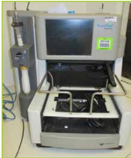
(2) TELEDYNE COMPANION COMBIFLASH