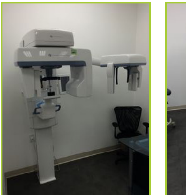
INSTRUMENTARIUM OP300 2D DENTAL IMAGING SYSTEM