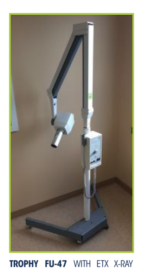
TIMER X-RAY CONE ON ARTICULATING