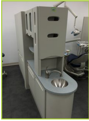
MIDMARK CENTER CONSOLE WITH SINK AND DRAWER, NO X-RAY ARM