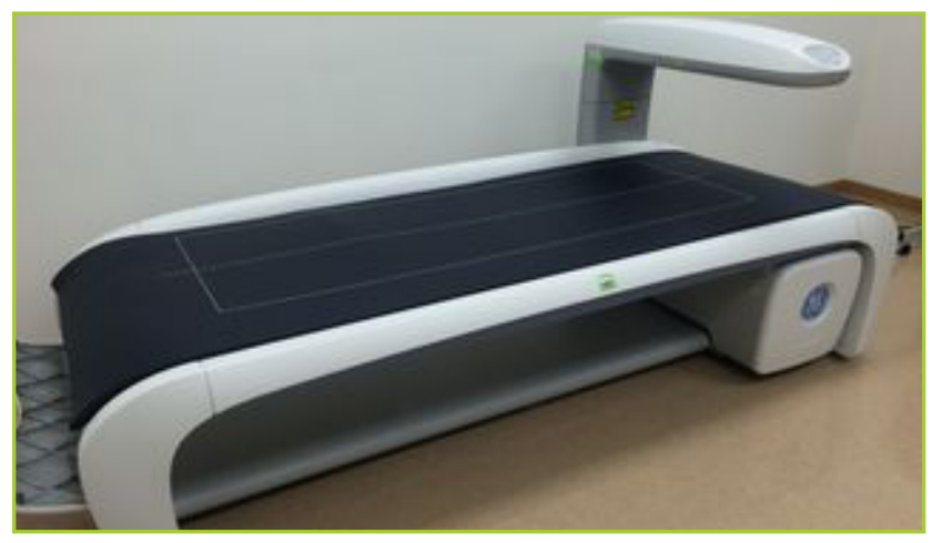
GE HEALTHCARE LUNAR MODEL 40782 BONE DENSITOMETER WITH DESK TOP PC