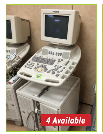
PHILIPS ENVISOR C MODEL M2540A ULTRASOUND SYSTEM