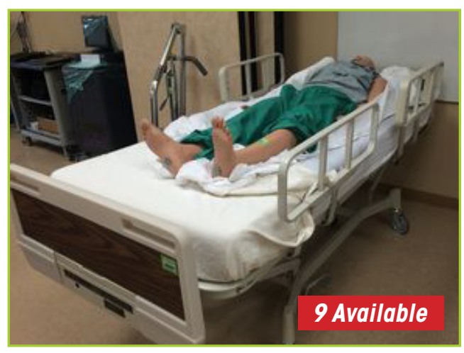
HILL-ROM CENTRA CENTURY SERIES, ADJUSTABLE HOSPITAL BED