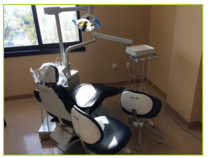
A DEC PRO31 TEACHING CHAIR WITH DCI EQUIPMENT TOOL TRAY