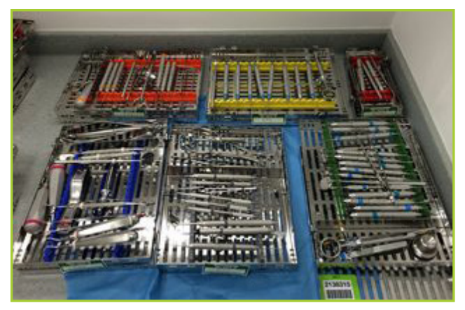
ASSORTED DENTAL INSTRUMENT SETS, INCLUDING EXAM, RESTORATIVE, PERIO, SURGERY AND C&B

LARGE QUANTITIES OF WHEELCHAIRS & OXYGEN TANKS, DUMMIES & MANNEQUINS, PRACTICE SKELETONS, BASSINETS & CARTS, PHONES, SMARTBOARDS, OFFICE & LOBBY FURNITURE AND MUCH MORE!