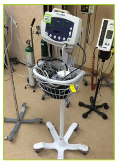
WELCH ALLYN 53NTO, WITH SPO2, BP CUFF, AND TEMPERATURE MONITOR