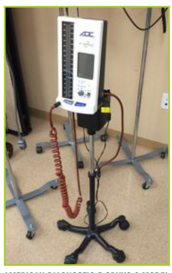
AMERICAN DIAGNOSTIC E-SPHYG 2 MODEL 9002, BLOOD PRESSURE MONITOR