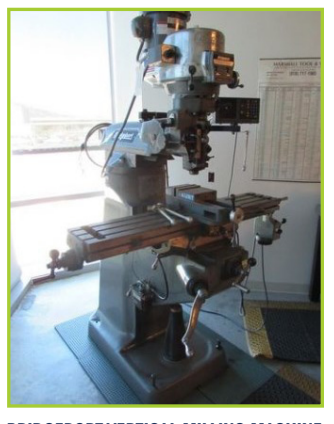
BRIDGEPORT VERTICAL MILLING MACHINE