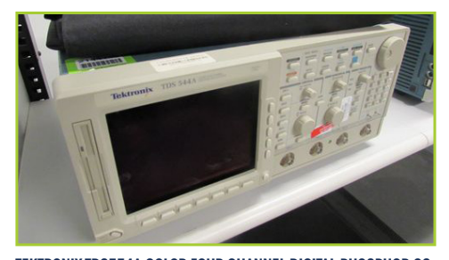
TEKTRONIX TDS554A COLOR FOUR CHANNEL DIGITAL PHOSPHOR OS-CILLOSCOPE. OUTPUT-500 MHZ, 1GS/S, INPUT- 90-250V, 47-63 HZ