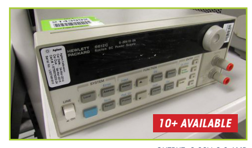
HP 6612C SYSTEM DC POWER SUPPLY. OUTPUT- 0-20V, 0-2 AMP, INPUT- 120V, 50-60 HZ