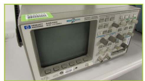
(2) HP 54645D MEGA ZOOM MIXED SIGNAL OSCILLOSCOPE. 100-MHZ, 2-16 CHANNELS, WITH MODEL 54650A HP-IB INTERFACE MODULE