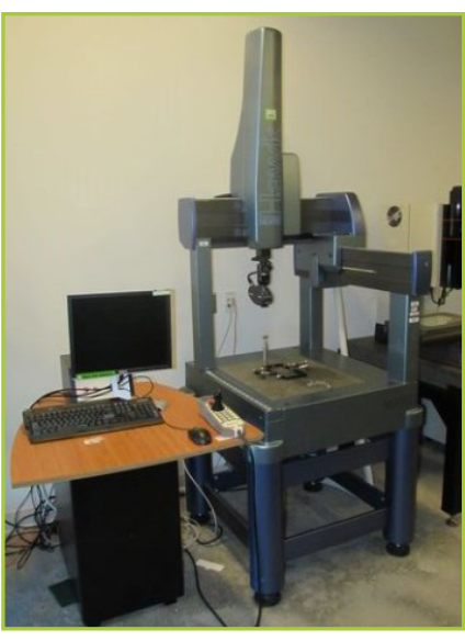
COORDINATE MEASURING MACHINE. NEXTEC HAWK, WITH RENISHAW M1H PROBE, NEXTEC WIZPROBE, PENDANT, & COMPUTER, YEAR 2001