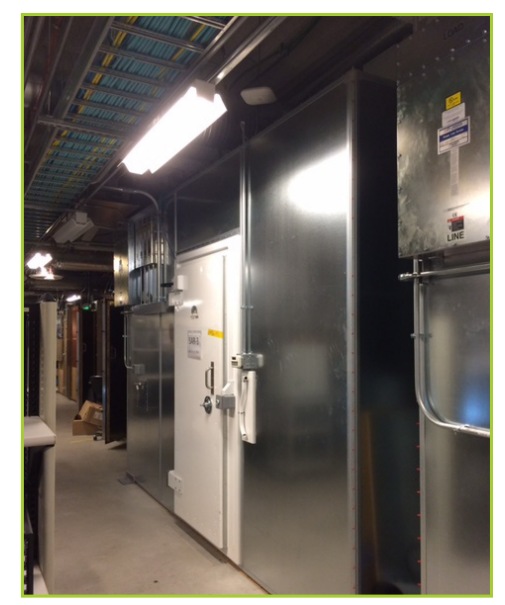
NUMEROUS RF SCREEN ROOMS AND ACOUSTICAL TESTING CHAMBERS INCLUDING ECKEL AND SATIMO ANECHOIC CHAMBERS (ACOUSTIC TESTING), ETS-LINDGREN SHIELD ROOMS, LINDGREN RF ENCLOSURES