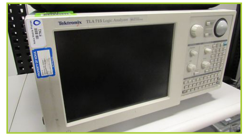
TEKTRONIX TLA715 LOGIC ANALYZER. DUAL MONITOR PORTABLE MAINFRAME, OPTION 1S