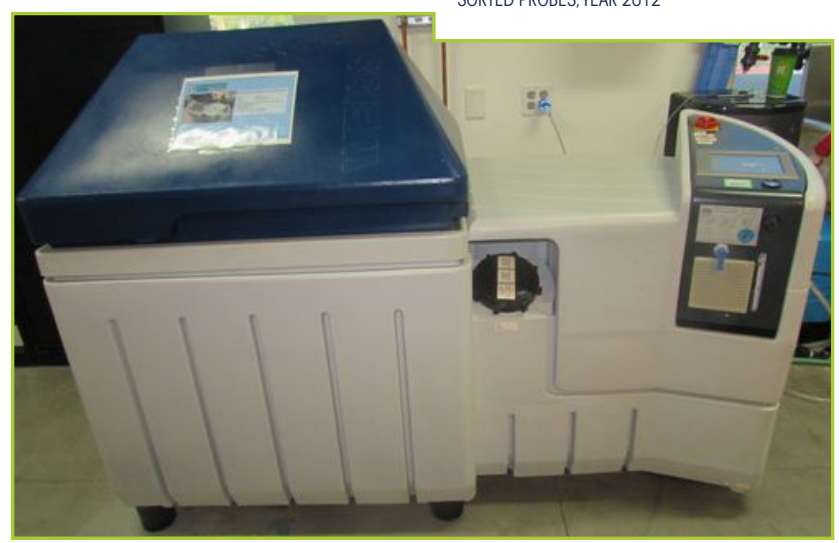
WEISS TECHNIK SC 450 ALTERNATING CLIMATE TEST CHAMBER. 34" X 23-1/2" X 28-1/2" CHAMBER