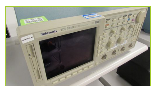
TEKTRONIX TDS784D FOUR CHANNEL DIGITAL PHOSPHOR OSCIL-LOSCOPE, OPTION 2M