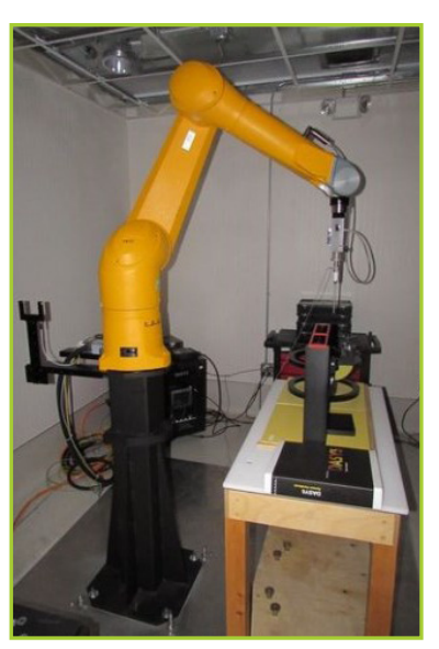
SPEAG (STAUBLI) TX90 XLSPEAG 6-AXIS ROBOT. DASY5, WITH SPEAG AMMI MEASUREMENT SERVER, CS8C CONTROLLER, PENDANT, COMPUTER, & AS-SORTED PROBES, YEAR 2012