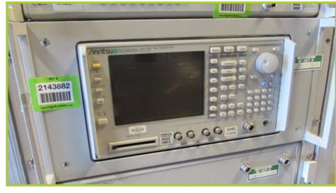
ANRITSU MS8609A DIGITAL MOBILE RADIO TRANSMITTER TESTER OPTIONS 01, 08, 04, & 47, OUTPUT- 9 KHZ-13.2 GHZ