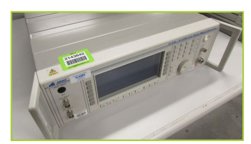
IFR SYSTEMS 2042 LOW NOISE SIGNAL GENERATOR 10 KHZ-5.4