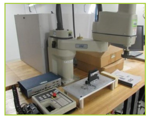
ADEPT COBRA 600 AIB COMPACT ASSEMBLY ROBOT. WITH CX SMART CONTROLLER, PENDANT, (2) ASSEMBLY CHASSIS, & COMPUTER MONITOR, YEAR 2004