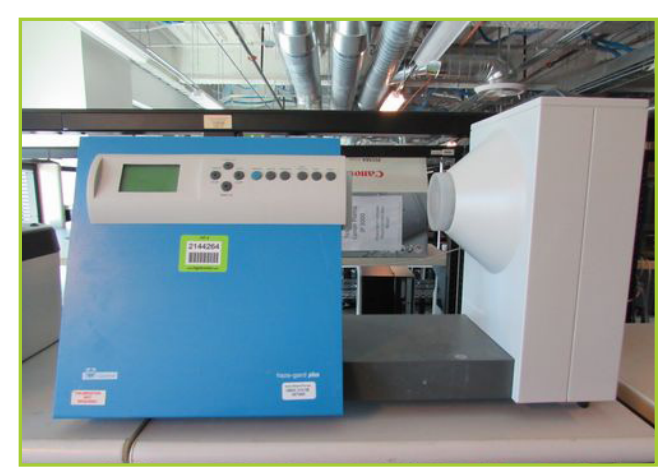
BYK-GARDNER 4725 HAZE GUARD PLUS TRANSPARENCY METER

LABEL PRINTERS, TEST RACKS, CONFERENCE STATIONS, HERMAN MILLER AERON CHAIRS, AV EQUIPMENT, RF ENCLOSURES, PORTABLE TOOLBOXS, LAB CHAIRS, PUSH CARTS, STORAGE CABINETS AND MORE!