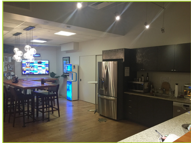
HIGH END KITCHENETTE INCLUDING REFRIGERATOR, DISHWASHER, AND OTHER APPLIANCES