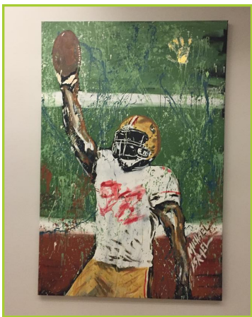
MICHAEL ISRAEL (1) MIXED MEDIA ON CANVAS 4' X 6' / INCLUDES CERTIFICATION