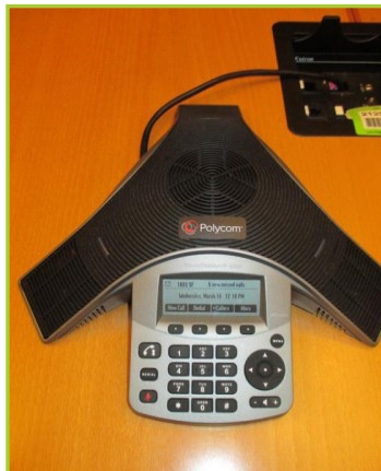
POLYCOM SOUNDSTATION IP 5000