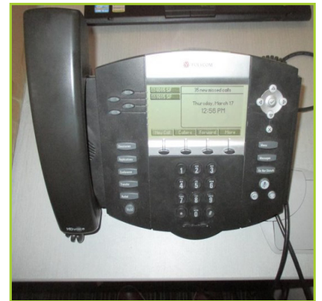
(35) POLYCOM SOUNDPOINT 550