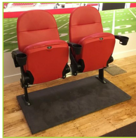
(2) ICONIC RED LEATHER STADIUM SEATING WITH FLOOR MOUNT