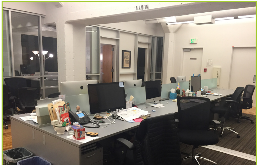
LARGE SELECTION OF OFFICE FURNISHINGS INCLUDING DESKS, CHAIRS, TABLES, AND MORE