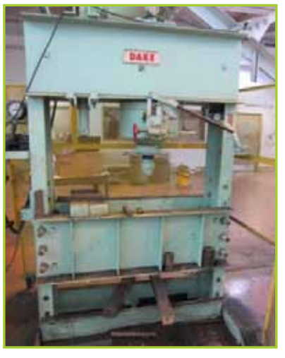
DAKE 125X 125 TON HYDRAULIC PRESS