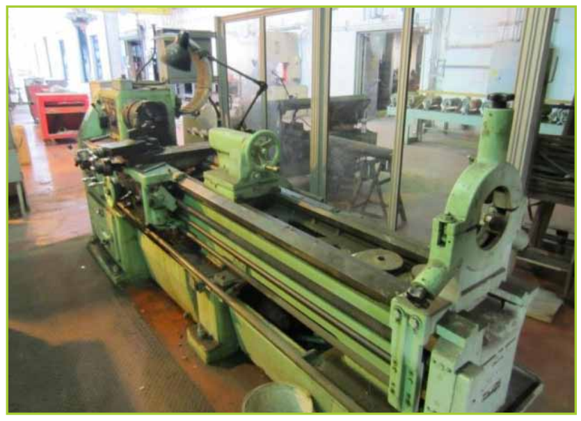
YAMAZAKI MAZAK 18 18" ENGINE LATHE. 84" BED, 575V. WITH CABINET WITH TOOL RESTS, AND EXTRA CHUCK, WORK BENCH & SNAP ON TOOL BOX WITH VARIOUS CUTTERS