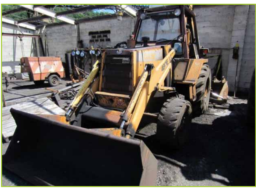
CASE 480E LOADER W/BACK HOE. YR 1988. 5,382 HRS. 4WHEEL DRIVE.