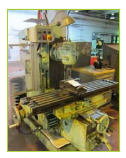
GREAVES CINCINNATI VERTICAL MILLING MACHINE.