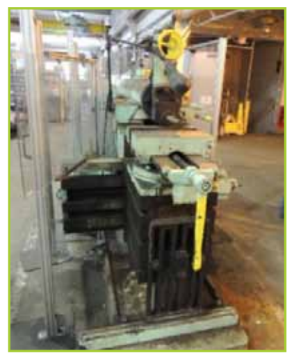
OHIO MACHINE TOOL SHAPER, P/N 1819, VISE DEEP STEEL FACED JAWS, TABLE 16"X26"