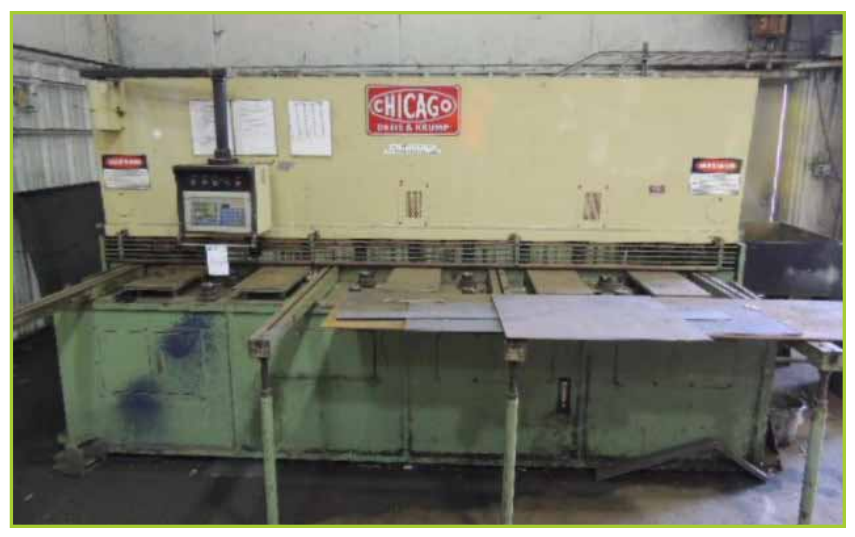
CHICAGO DREIS & KRUMP HS31130 SHEAR, ALLEN BRADLEY CONTROLS, TABLE 120" LENGTH, 1/4" STEEL, 1/8" STAINLESS, FOUR STOCK SUPPORT ARMS