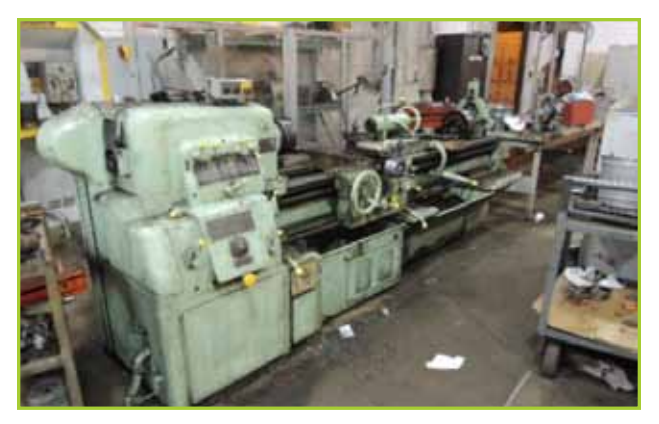
MONARCH LATHE YR. 10/1952, 16", 18.5" SWING, 78" CENTER TO CENTER, 550V. (2) CART'S AND (1) CABINET WITH TOOLING