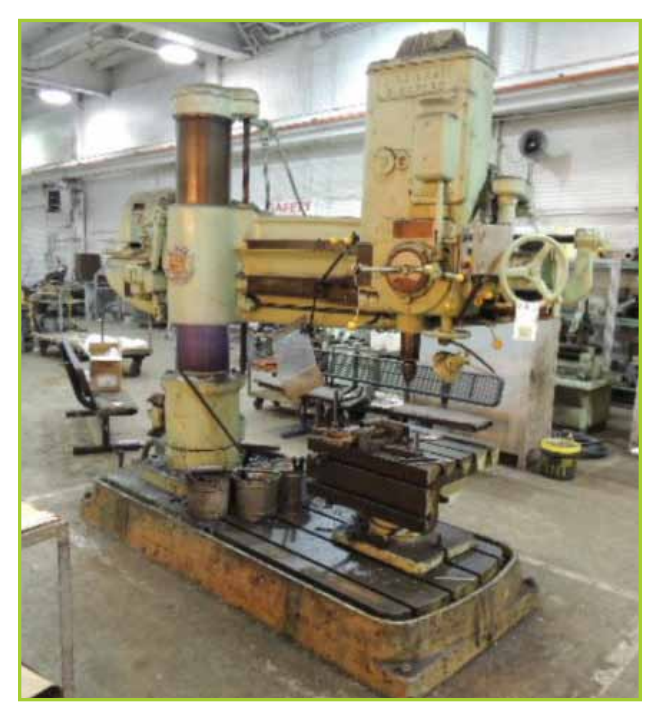
CINCINNATI BICKFORD SUPER SERVICE RADIAL DRILL , 13^{\circ} COLUMN, 32^{\circ} HEIGHT, 6^{\circ} ARM, 575V, TILT TABLE 28^{\circ} X2 4^{\circ}

STARTING: SEPT. 15, 2015 – 7:00 AM EDT | ENDING: SEPT. 18, 2015 – 10:00 AM EDT | LOCATION: WATERFORD, OH