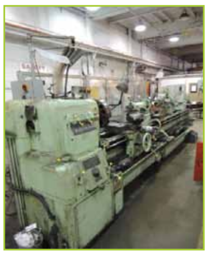
MONARCH LATHE YR. 11/1952, 20", 26.5" SWING, 144" CENTER TO CENTER, 550V. (1) CART (1) CABINET W/TOOLING