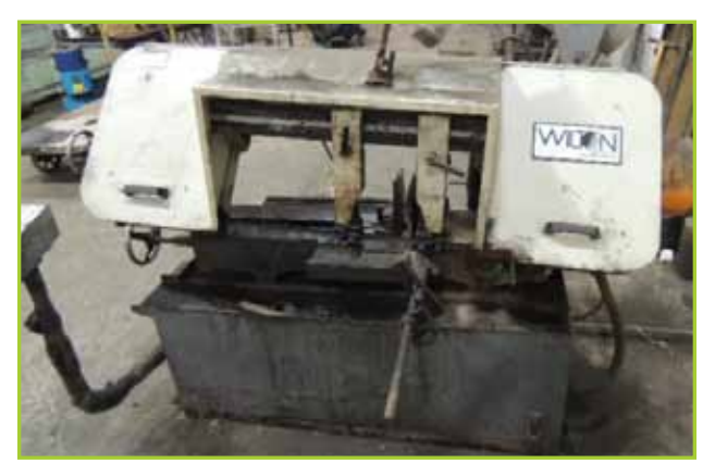
WILTON 8007060 BAND SAW, 1" BLADE X.037X156",RPM 90-370, 3HP 3PH 550V, INDUCTION MOTOR