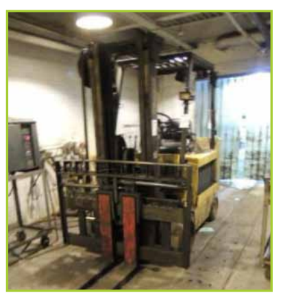
HYSTER E 100XL3S ELECTRIC FORKLIFT. 48V, CAPACITY 8700LB. LIFT HEIGHT 131.9", 72" FORKS