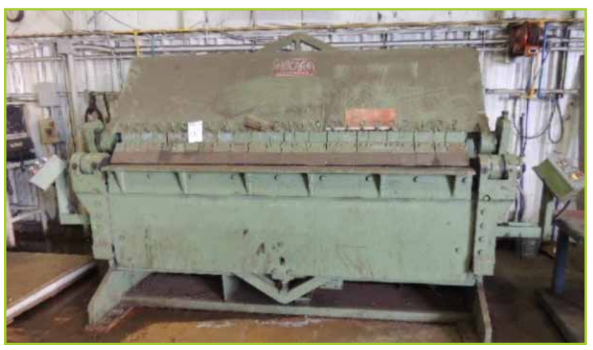
CHICAGO DREIS & KRUMP PBP 8250-6 PRESS BRAKE, POWER CLAMPING, TOP ADJUSTMENT, POWER BENDING, 96'