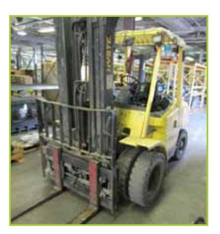
HYSTER H70XM 6K GAS FORKLIFT. YR 2002, HRS 2216