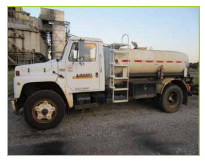
INTERNATIONAL 1954 WATER TRUCK. 466 DETROIT DIESEL, 1986, 170" WB. VIN # 1WTLDUXL7GHA51795