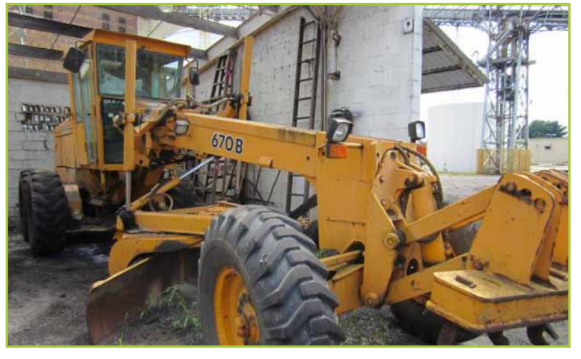
JOHN DEERE 670B GRADER. YR 1989. 3,468 HRS.