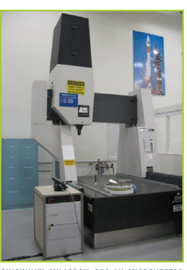
CINCINNATI MILACRON G80 LK MICROVECTOR BRIDGE TYPE CMM MACHINE, 3 AXIS