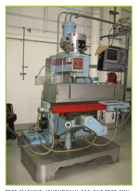
TREE MACHINE JOURNEYMAN 310 CNC TREE MILL-ING MACHINE, 3-AXIS, X-27", Y-14", Z-5", 10" X 44" TABLE, 60-4200 RPM SPINDLE SPEED, (1995)