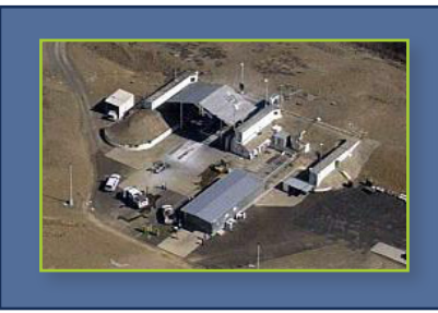
SITE #6 2001 Aerojet Rd. Cordova, CA 95742