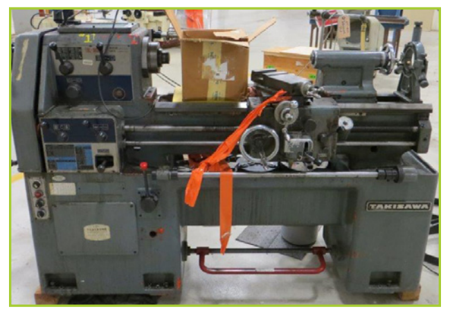
MONARCH 10EE TOOLROOM LATHE, 12-1/2" X 20", 460VAC, (1990)