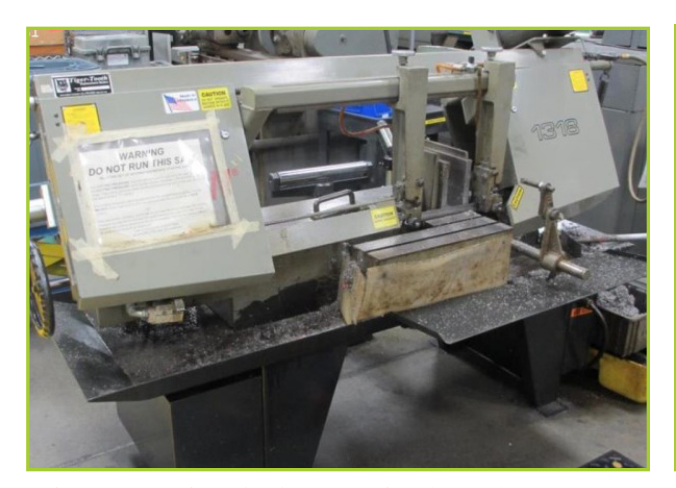
ELLSAW 1318 BANDSAW HORIZONTAL BAND SAW, SIZE: LENGTH 5 FEET, WIDTH 3 FEET, HEIGHT 3 FEET, WEIGHT: ~300LBS