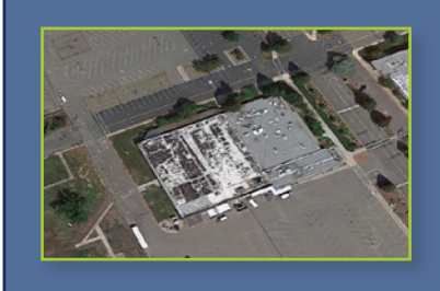
SITE #5 8900 De Soto Ave. Canoga Park, CA 91304