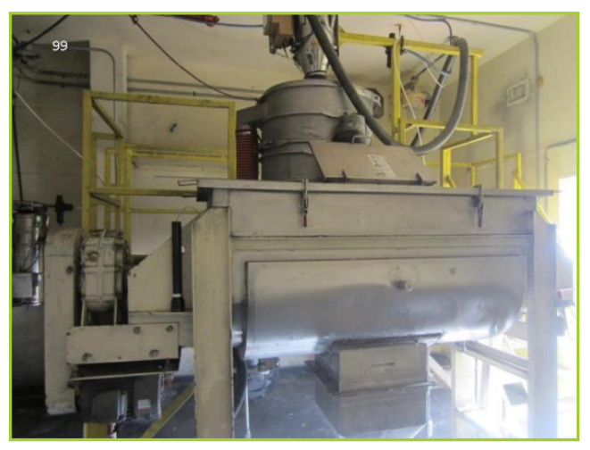
RIBBON BLENDER, STAINLESS STEEL. INSIDE MEASURES 2 FEET 2-1/16 INCHES WIDE BY 5 FEET 5-29/32 INCHES LONG