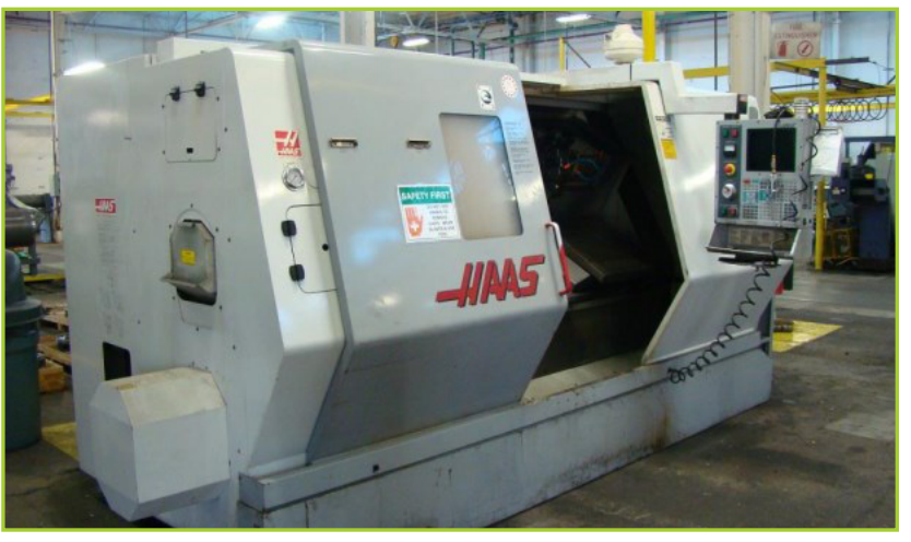
HAAS SL-40 HAAS 2-AXIS SLANT BED CNC LATHE, 15" MMK POWER CHUCK. AUTOMATIC CHIP CONVEYOR 10 STATION TURRET, DIMS 190"L X 92"W X 89"H, WGT 25,000 LBS, MFG 2001