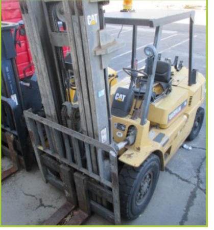
CATERPILLAR GP40 HEAVY DUTY GAS-POWERED FORKLIFT, TYPE G 6200LBS LOA