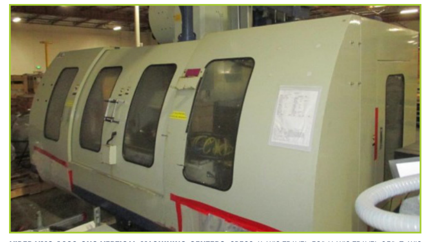
VIPER VMC-1230 CNC VERTICAL MACHINING CENTERS. SPECS: X-AXIS TRAVEL 50", Y-AXIS TRAVEL 25", Z-AXIS TRAVEL 25"; TOOL POSITIONS 20 ATC; SPINDLE SPEED 6000 RPM, SPINDLE TAPER 50 TAPER; HORSE POWER 20 HP; WGT. 23,700 LBS