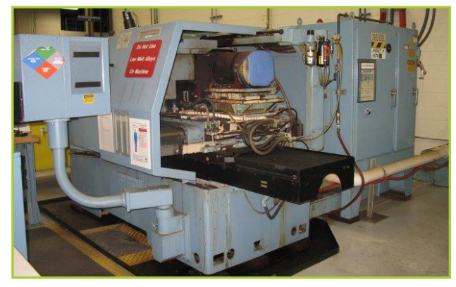
CINCINNATI MILACRON HEALD 2EF CINTERNAL CNC MULTI SURFACE GRINDER, SWING OVER TABLE 28", SWING W/ WORK HEAD @ 90 DEGREE- 17", GRINDING STROKE 17", TRAVEL 20", CROSS SLIDE 9", WORK SLIDE 16"

LARGE QUANTITIES OF MACHINE TOOLS, WASHING SYSTEMS, PUMPS, COMPRESSORS, GRANITE TABLE, CABINETS, AND MUCH MORE!