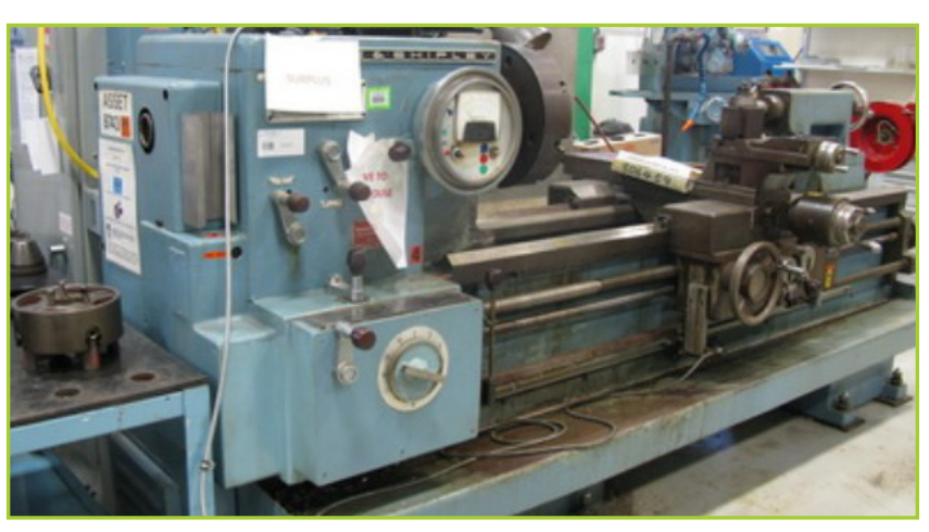
LODGE & SHIPLEY 2013/17 LATHE, 24" X 83", W/ SONY DIGITAL READOUT, 2 CHUCKS - 4-JAW & 3-JAW