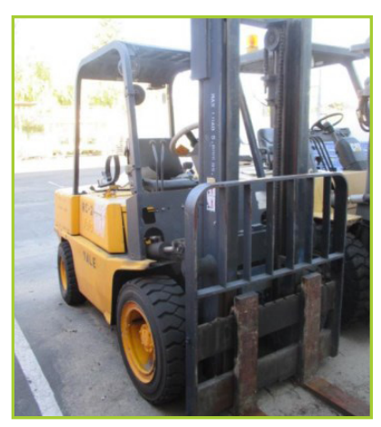
YALE GPO60RDNUAVO86 HEAVY DUTY POWERED FORKLIFT, TYPE G 5800LBS LOAD