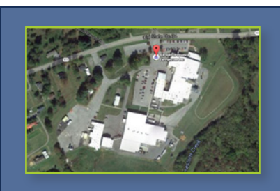
SITE #2 1367 Old State Rte 34 Jonesborough, TN 37659