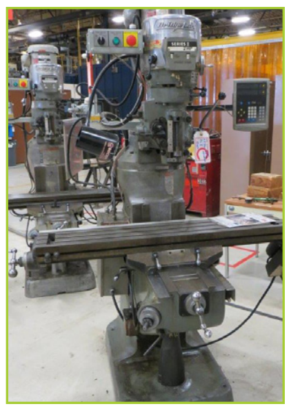
BRIDGEPORT SERIES II VERTICAL MILL, VARIABLE SPEED