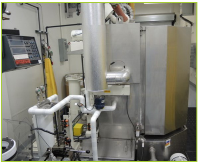
PROCECO LTD. PC 42X42-E-1000-2-RD-HBO-SS PARTS WASHER, TANK 1 VOLUME - 165 GAL, TANK 2 VOLUME - 45 GAL, 7'-6" W X 8'-3" L X 8'-3" H, 1000LB MAX. LOAD CAP, (2011)