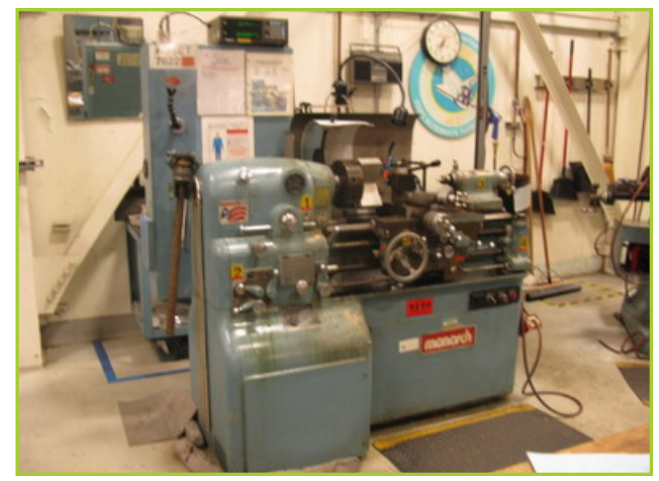
MONARCH 10EE TOOLROOM LATHE, 12-1/2" X 20", 460VAC, 3-PHASE, 60 HZ, 13 AMP, (1990)