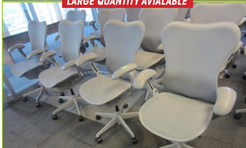
HERMAN MILLER MR133AAF CHAIRS, GRAY COLOR. YEAR NEW: 2006