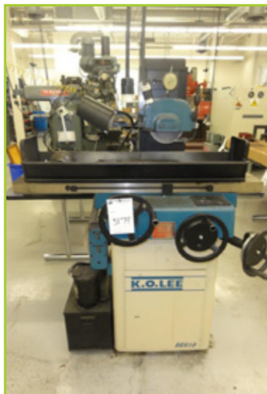
K.O. LEE SE618 SURFACE GRINDER