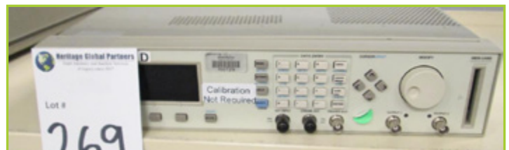
AGILENT 8110A PULSE GENERATOR