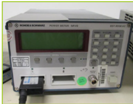
RHODE & SCHWARTZ NRVD POWER METER