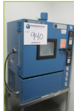
THERMOTRON S-1.2C ENVIRONMENTAL TEST CHAMBER