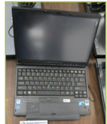
FUJITSU LIFEBOOK T2020 LAPTOP