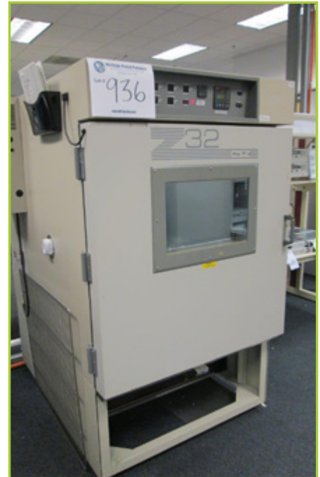
CINCINNATI ZH-32-3-H/AC ENVIRONMENTAL TEST CHAMBER