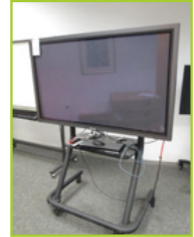
PIONEER PDP-614MX 61" HDTV