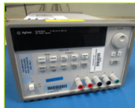
AGILENT E3632A DC POWER SUPPLY