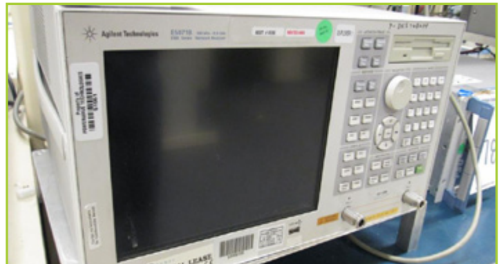
AGILENT E5071B ENA SERIES NETWORK ANALYZER

Large Quantity of Receivers, Antennas, Repeaters, Amplifiers, and Much More. Go Online For Complete Asset List.