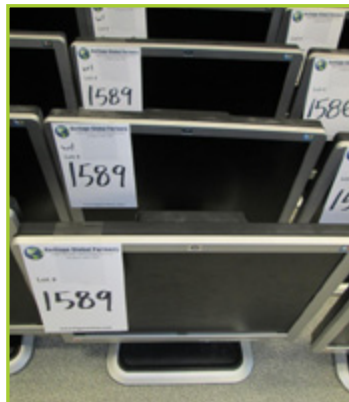
HEWLETT PACKARD L1710 17" FLAT PANEL