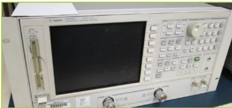
AGILENT 8753ES S-PARAMETER NETWORK ANALYZER