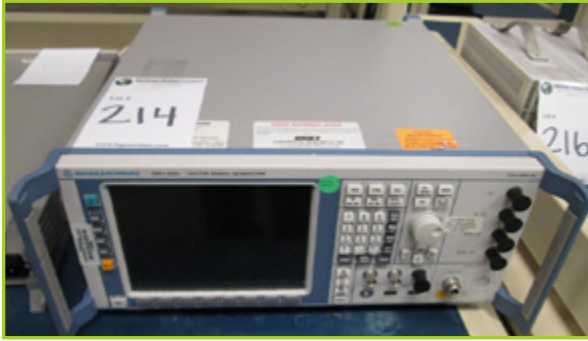
RHODE & SCHWARTZ SMU 200A VECTOR SIGNAL GENERATOR