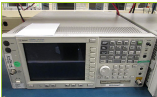
AGILENT E4445A PSA SERIES SPECTRUM ANALYZER