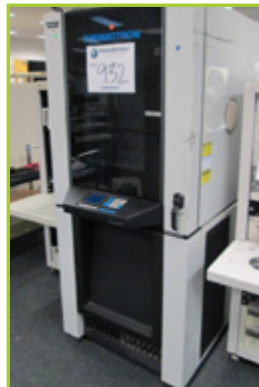
THERMOTRON SE-300-2-2 ENVIRONMENTAL/TEMP CYCLE CHAMBER