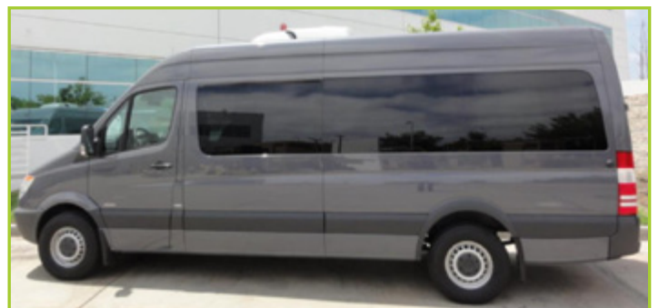
MERCEDES BENZ SPRINTER 2500 2011 12-PASSENGER VAN