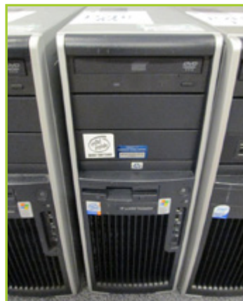
HEWLETT PACKARD XW4400 WORKSTATION