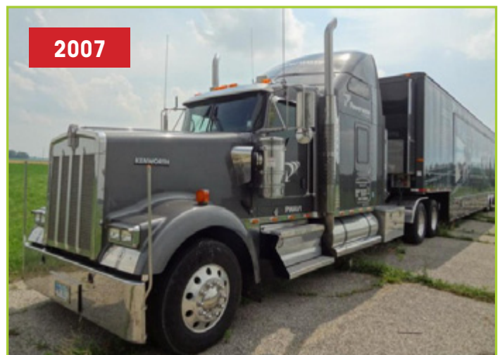
MILITARY GRADE RAPID MOBIL CELLPHONE TOWER

1 – 1989 Utility Trailer, 65,000 GVW, 48' x 102" Wide Reefer Trailer w/ Thermo King Super II S Reefer Refrigeration Unit, Aluminum, Mfg. 04/89, VIN# IUYYS2489KT193411