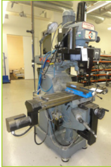
CLAUSING/KONDISA VERTICAL BORING MILL