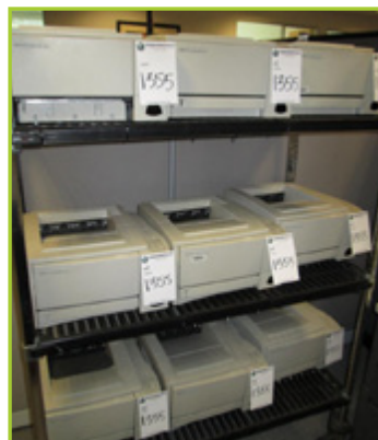
HEWLETT PACKARD 2100 LASERJET PRINTERS