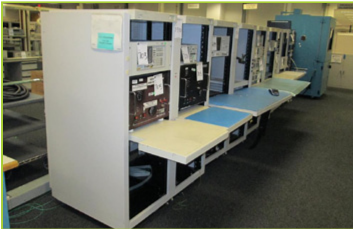
LARGE QUANTITY OF ASSORTED TEST AND MEASUREMENT EQUIPMENT AND ASSORTED SERVER CABINETS