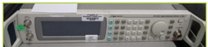
AEROFLEX IFR 3416 SIGNAL GENERATOR