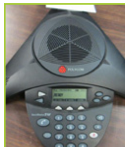
POLYCOM SOUNDSTATION 2