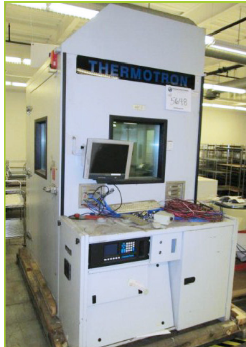
THERMOTRON AST-35-LN2 ACCELERATED TEST SET SYSTEM