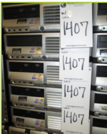
HEWLETT PACKARD DC7100 SFF LOT

Computer Monitors and Printers from HP, Dell, Lenovo, Samsung, Lexmark, and others. Go Online For Complete Asset List.