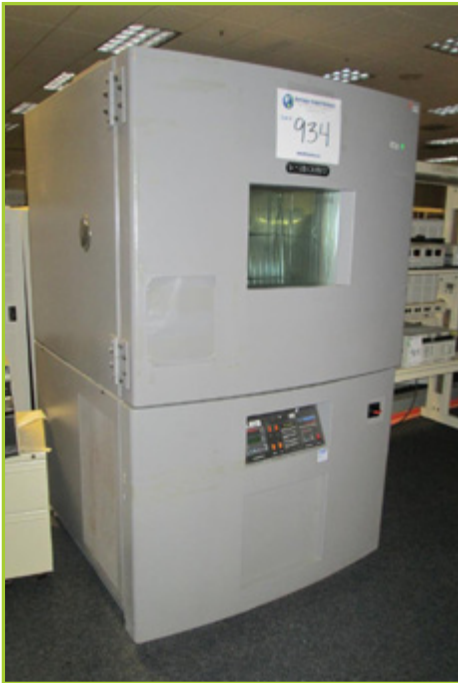
TEST EQUITY 1020C TEMPERATURE CHAMBER

Large Quantities of Microscopes from Olympus, Meji, Unitron, Leica, Vision Engineering, Zeiss, and others. Go Online For Complete Asset List.