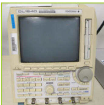
YOKOGAWA 701510 DIGITAL OSCILLOSCOPE