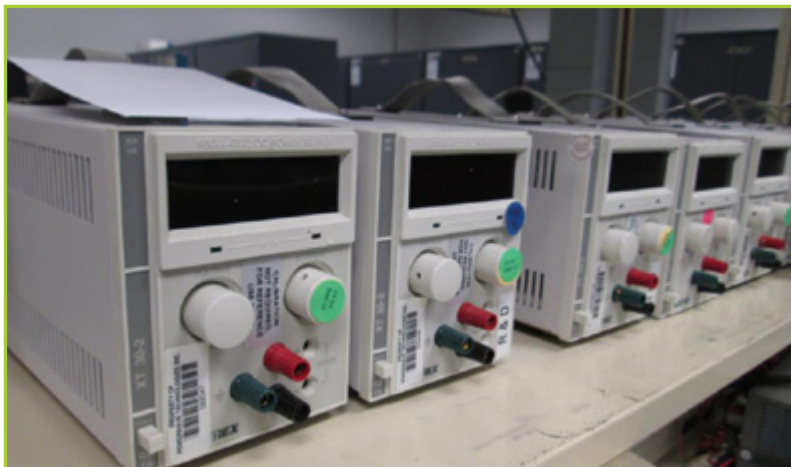
XANTREX XT 30-2 LOTTO (5) INCLUDE DC POWER SUPPLIES