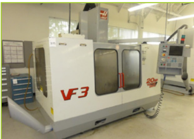
HAAS VF 3 2000 CNC MILLING MACHINE

Complete Machine Shop with Tooling from Bridgeport, Mori Seiki, Okuma, Mazak, and others.