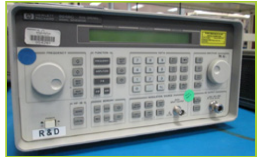
HEWLETT PACKARD 8648D SIGNAL GENERATOR