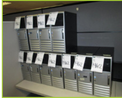
HEWLETT PACKARD DC7600 MINITOWER PC'S

Lot – (1) Epson EX71 (3LCD Multimedia Projector, Case, Native WXGA Resolution 16:10 up to 1680 x 1250, 2500 Lumens Color Light Output, 2500 Lumens White Light Output), (1) Hitachi CP-S225 Multimedia Mobile LCD Projector (Case, 800x600 1100 Lumens, 300:1)