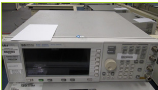
HEWLETT PACKARD ESG 2000A SIGNAL GENERATOR