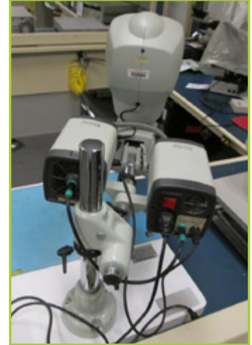
VISION ENGINEERING LYNX STEREO STEREOSCOPE

Large Quantities of Microscopes from Olympus, Meji, Unitron, Leica, Vision Engineering, Zeiss, and others. Go Online For Complete Asset List.