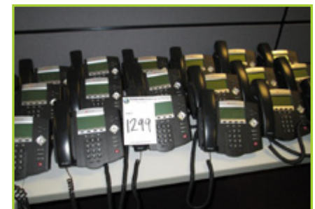
ASSORTED POLYCOM PHONES