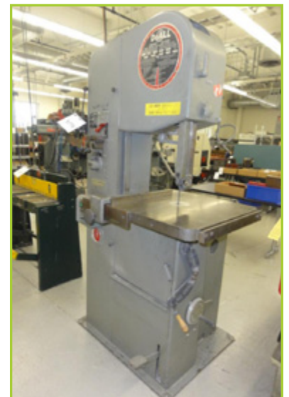
DOALL DBW-15/1612 VERTICAL BAND SAW