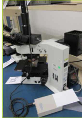
OLYMPUS BX60F5 MICROSCOPE WITH (2) WH10X/22 EYEPIECES