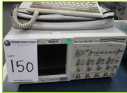
HEWLETT PACKARD E4404B ESA-E SPECTRUM ANALYZER