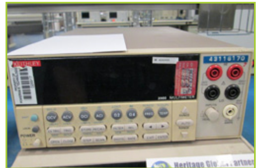
KEITHLEY 2000 MULTIMETER