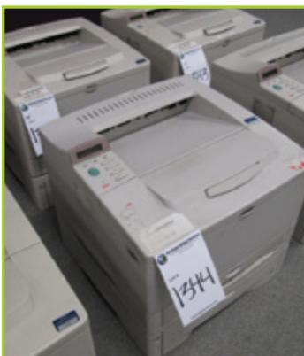
HEWLETT PACKARD 5000N LASERJET PRINTERS