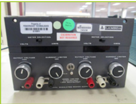
LAMBDA LGD-422 DUAL REGULATED POWER SUPPLY