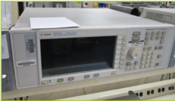
AGILENT N5182A MXG VECTOR SIGNAL GENERATOR

Large Quantities of High End Test Equipment consisting of Network Analyzers, Spectrum Analyzers, Power Meters, Power Sources, Signal Generators from HP, Agilent, Tektronix, Yokogawa, Rhode & Schwartz, Giga-tronics, IFR, and others.