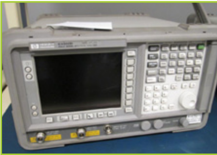
HEWLETT PACKARD E4404B ESA-E SPECTRUM ANALYZER