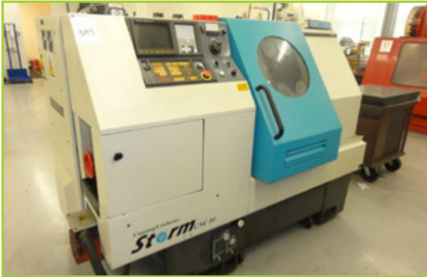
CLAUSING/COLCHESTER STORM 80 CNC SLANT BED LATHE