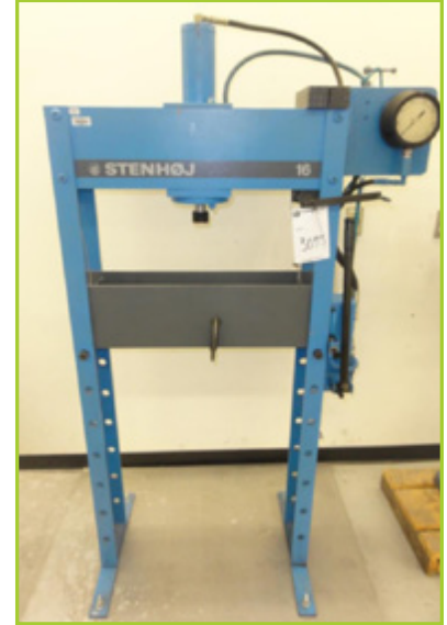
STENHOJ HYDRAULIC H-FRAME PRESS