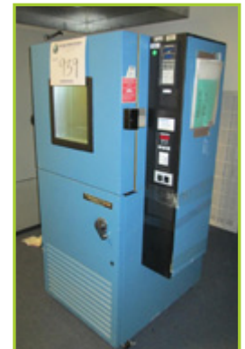
THERMOTRON S-4-SL ENVIRONMENTAL TEST CHAMBER