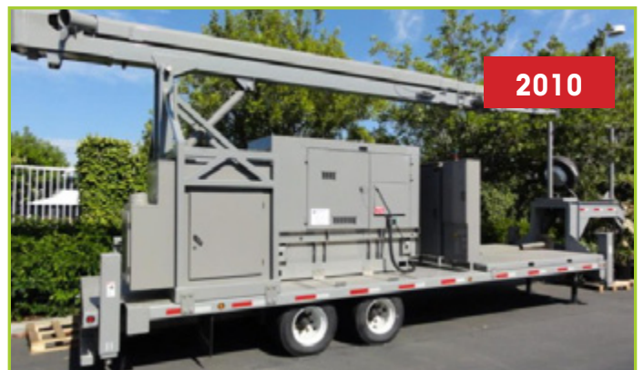
2010 MILITARY GRADE RAPID MOBIL CELLPHONE TOWER

1 – 2010 Rapid Mobile Cell Tower Deployment Trailer , Commercial Grade, Trailer Type Fox, Model 828FH-9 Gooseneck Trailer, 2-Axles, w/ Hydraulic Leveling Pads, Cell Tower Deployment Unit Contains (1) Whisperwatt Diesel Generator, Model DB10071, Single Phase, Rated Output 56kW, Rated Voltage 120/240V, generator Engine Type Model ISUZU4JJ1X, 4-Cylinder 85-HP, w/ Basler Digital Genset Controller w/ Push Pad Controls, Enclosure, (1) 30m Telescoping Cellphone Tower, (1) Cellphone Cable Reel w/ Enclosure, (1) 3-HP Hydraulic Pump w/ 20-Gallon Cap. Hydraulic Fluid Reservoir, Enclosure, (2) Electrical Control Boxes, VIN 5DEFH2825B1004781