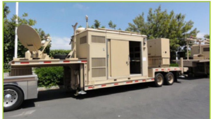
MILITARY GRADE RAPID MOBIL CELLPHONE TOWER