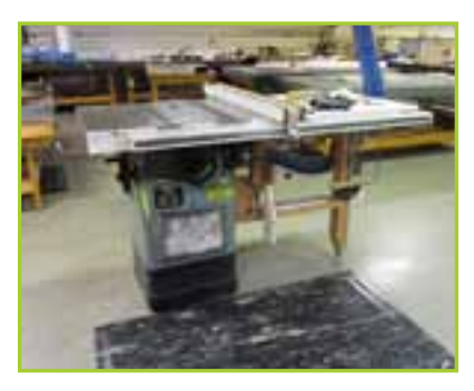
DELTA 83-621 UNISAW TABLE SAW