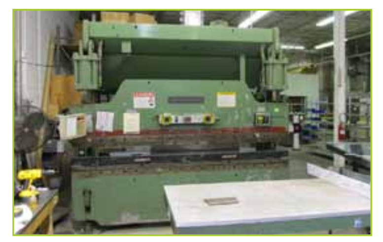
CINCINNATI 135CB X 8' CNC HYDRAULIC PRESS BRAKE AUTOMEC CNC 99 CONTROLS, 8" STROKE, 135-TON