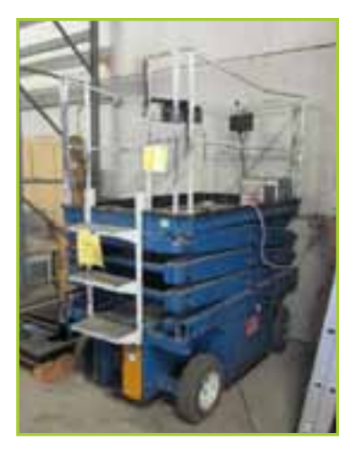
ELECTRIC MAN LIFT, W/ CHARGER