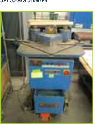
VERSAFIX 254 HYDRAULIC NOTCHER