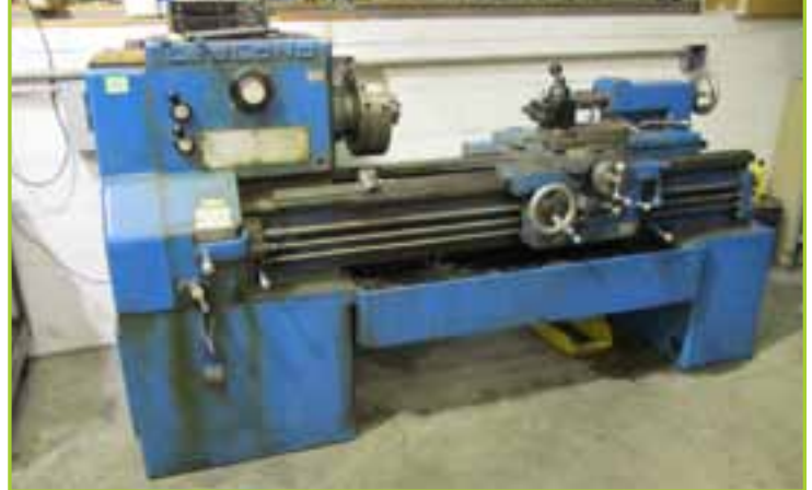
LEBLOND ENGINE LATHE, W/ (2)- 4-JAW & (1)-3-JAW CHUCKS, TOOL HOLDERS