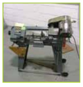
RF MBS-92285B METAL CUTTING BAND SAW