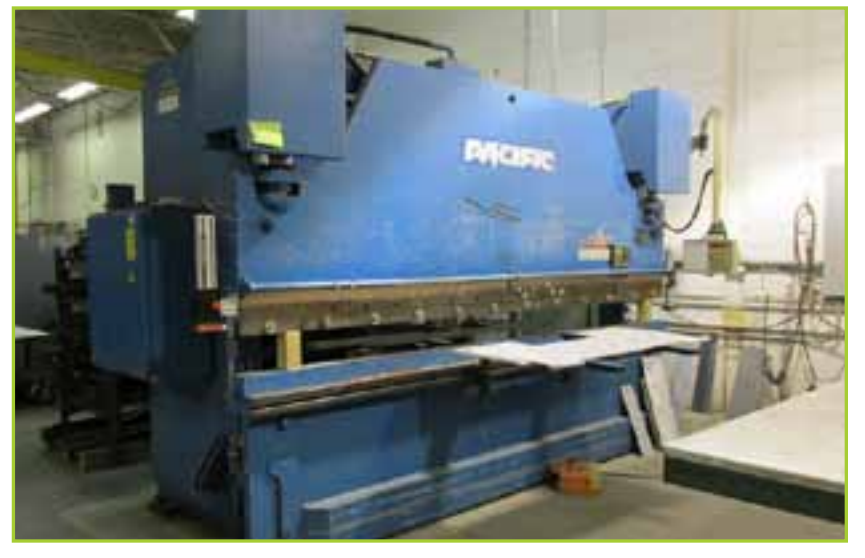
PACIFIC J230-12 CNC HYDRAULIC PRESS BRAKE , AUTOMEC CNC 99 CONTROLS, MAX CAP 5/16". MS.PL.X10'-0"..LG.

PEXTO 12-U-4J SHEAR, 49'W CAP., 12-GA SOFT STEEL CAP