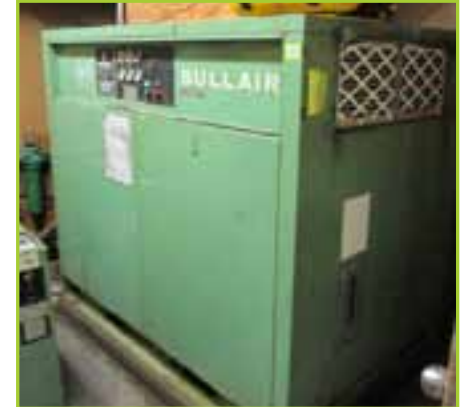
SULLAIR 12BS-40L AIR COMPRESSOR, 40-HP, 11/110 PSIG