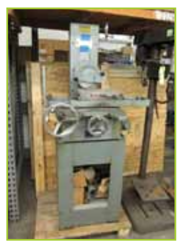
SANFORD HAND FEED SURFACE GRINDER