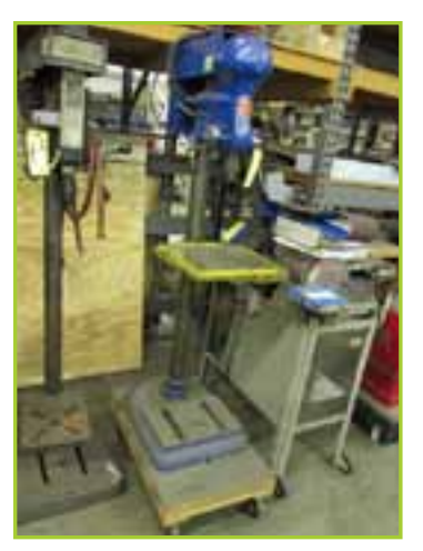
FAMCO PEDESTAL TYPE DRILL PRESS