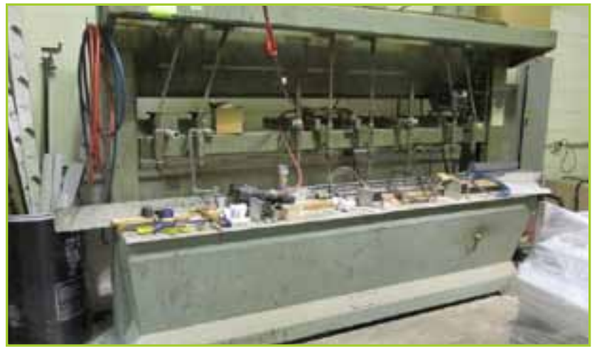
CEMCO 6-HEAD DRILLING MACHINE