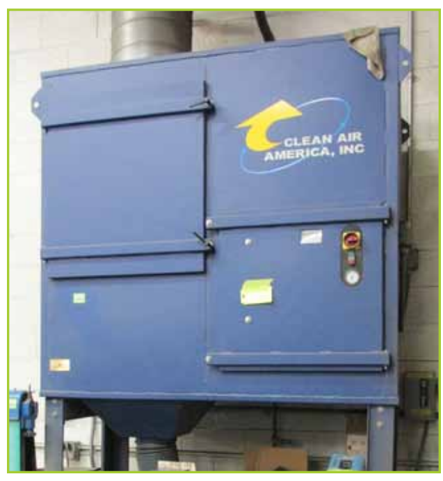
CLEAN AIR AMERICA FUME COLLECTOR