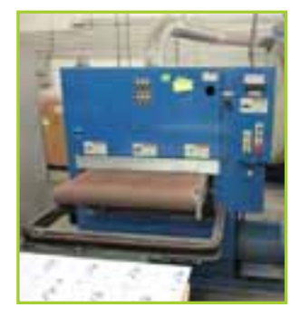
AEM 36" SANDER, W/TORIT DUST COLLECTOR