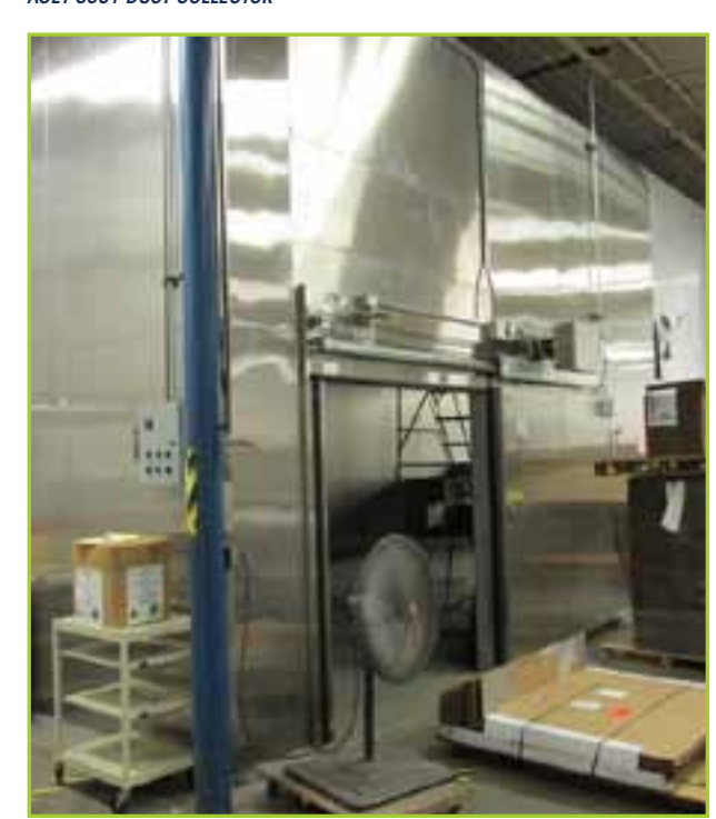
THERMO FISHER SCIENTIFIC AP-5158 WALK-IN COOLER, 59'X 23'-6" X 15' OD