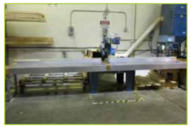
DEWALT 20" RADIAL TABLE SAW, 42", 144" TABLE