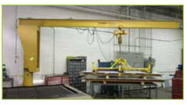
GORBEL 1/2-TON FREE STANDING 1/2-TON JIB CRANE, W/ HARRINGTON 1/2-TON CHAIN HOIST