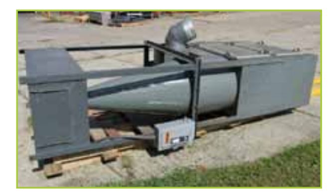
AGET 3051 DUST COLLECTOR