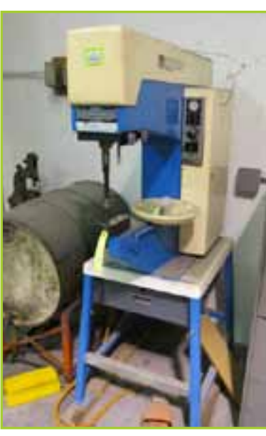
PENN SERIES 4 PREMSERTER PUNCH, 6-TON CAP