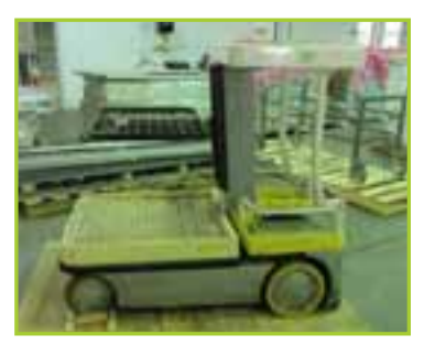
CROWN UL583E ELECTRIC LIFT