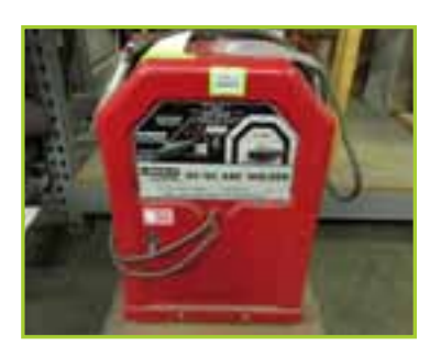
LINCOLN ELECTRIC AC/DC 225/125 ARC WELDER