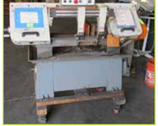
WILTON 7014 HORIZONTAL BAND SAW