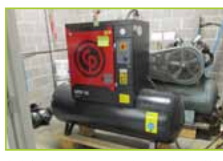
CP QRS10 TANK MOUNTED HORIZONTAL AIR COMPRESSOR