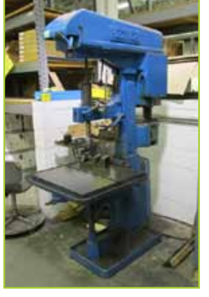
FOSDICK DRILL PRESS