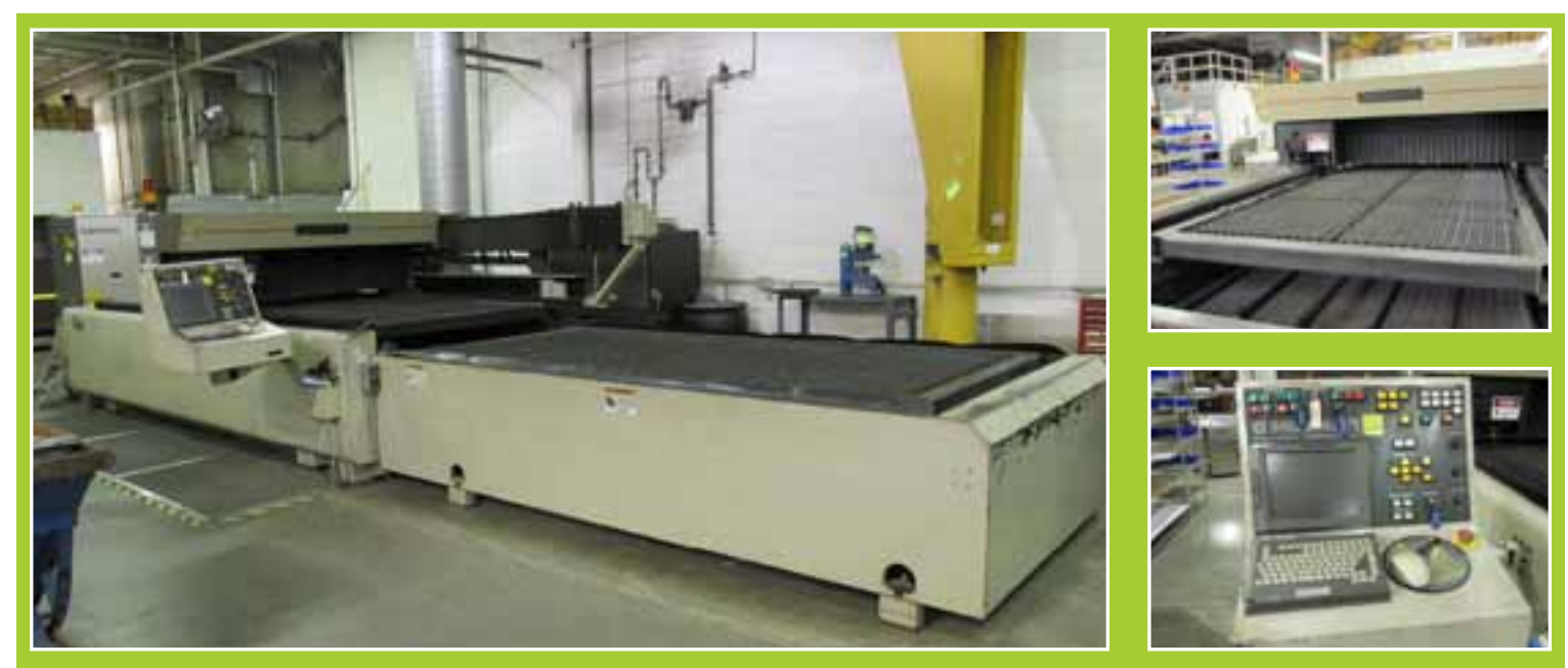
CINCINNATI CL-6 CNC LASER CUTTING MACHINE, W/ GE FANUC LASER MOD C2000C, INVISIBLE: MAX OUTPUT - 5000W, PULSE DURATION 100US-CW, EMITTED WAVELENGTH 10.6UM, LASER MEDIUM CLASS IV LASER, C02/N2/HE=5/55/40%, VISIBLE: L5MW, CW, 0,6~0.7UM, W/ 2-TRANSFORMERS, KOOLANT KOOLERS