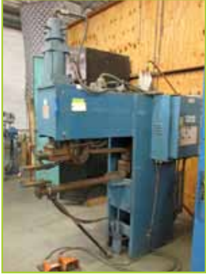
FEDERAL PA-1-36 SPOT WELDER