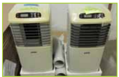
EVERSTAR MPA-06CR LOT (2) COOLERS