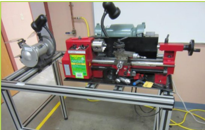
KUBOTA L35 FIELD TRACTOR, DIESEL, YEAR: 2003