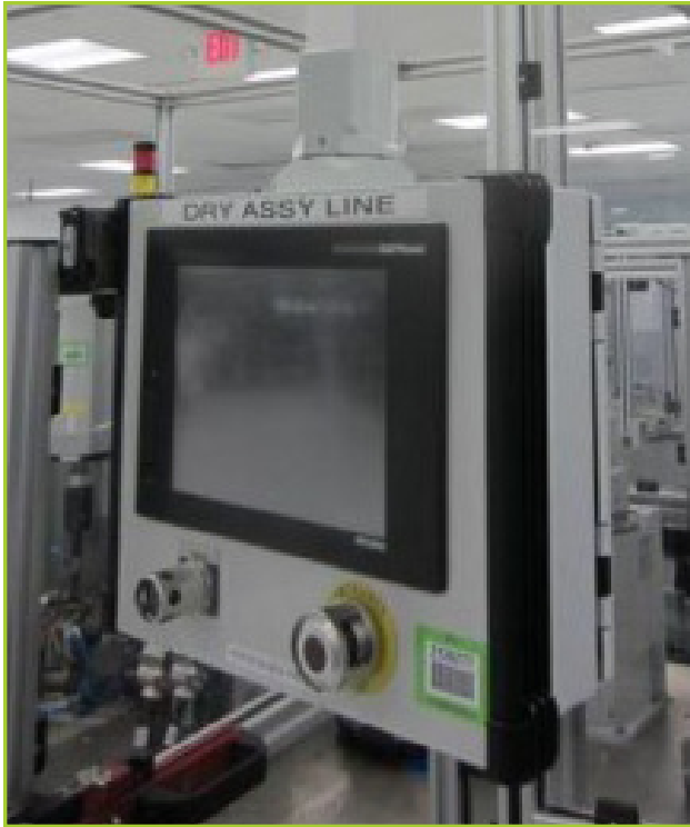
VERMEER V120 TRENCHER/BACKHOE , DIESEL ENGINE, ROPS, ALL-TERRAIN TIRES, HYDRAULIC OUTRIGGERS, 1128 HOURS EST. YEAR: 2003