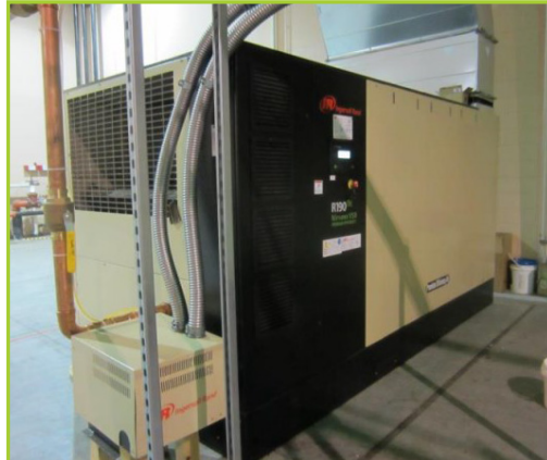
INGERSOLL RAND R190NEA AIR COMPRESSOR & DRYER