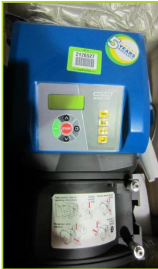
WATSON MARLOW 720U PERISTALTIC PUMP. W/ WATER TIGHT MODULE