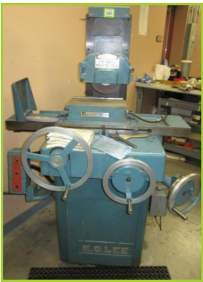
K.O.LEE PART # 6714RE SURFACE GRINDER. 8" SURFACE GRINDER WITH 6" X 12" MAGNETIC BASE