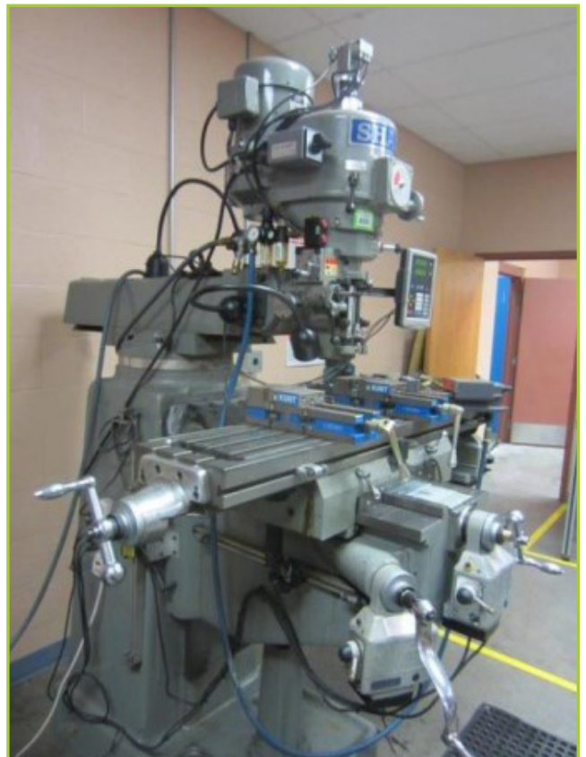
SHARP TMV VERTICAL MILLING MACHINE. 10 X 48" BED, NEW WALL DIGITAL READ OUT, WITH CLAMP SET & 3 VISES