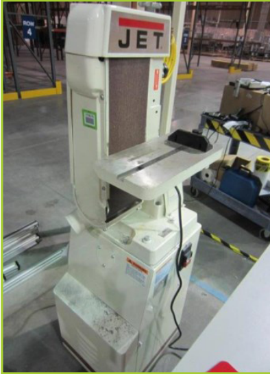
JET J-4300A 6" INDUSTRIAL BELT SANDER. 1.5HP 115V. FINISHING MACHINE