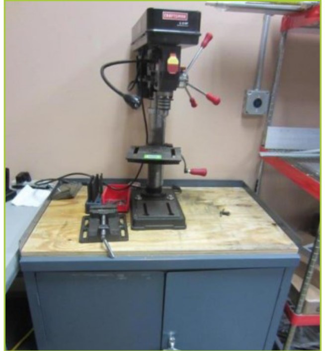
VERMEER FLEXTRACK 115 TRENCHER/PLOW, CRAWLER TYPE, DIESEL, ROPS, W/ REEL CARRIER, 2636 HOURS, YEAR: 1996