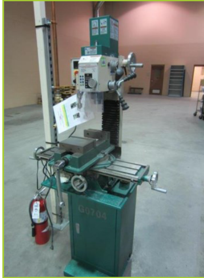
GRIZZLY G0704 DRILL MILL