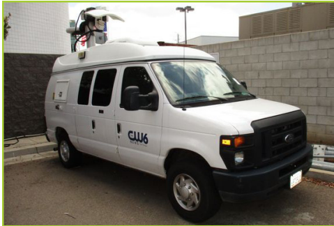
2013 FORD E-250 SERIES MICROWAVE VAN , GAS, AUTOMATIC 6 GIG TRANSMIT, MRC MICROWAVE DISH, MEPS ENGINE INVERTER, MRC MJX5000 TRANSMITTER, QUICK SET PAN & TILT, MONITORING, AC, 77,509 MILES