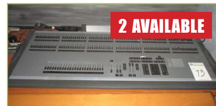
(2) ETC EXPRESS 78/144 DIMMER BOARD