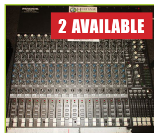
(2) MACKIE 1604-VLZ PRO MIC MIXER