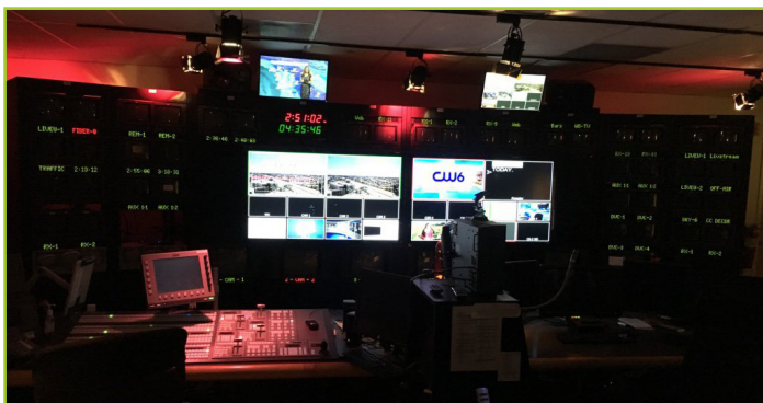
MAIN PRODUCTION CONTROL ROOM