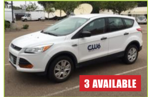
2013 FORD ESCAPE WITH 44,645 MILES