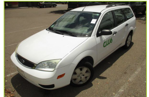
2007 FORD FOCUS , V/N 1FAHP36N97W170423