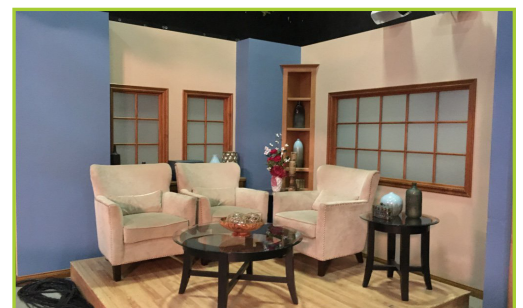
STUDIO SET SIDE CHAIRS W/ GLASS TABLES