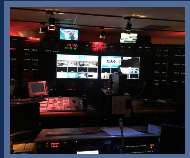
Scan this QR Code with your smartphone for More Information.

HD Live Production Switcher/Overdrive • HD LED WALL • Studio Cameras/ PEDs Lighting/Dimmers/Jib • NG HD Camcorders/Support • Wireless/Intercom • Audio • HD MONITORING/ENG/ SWITCHER • Avid NLE/HD Storage • Microwave Trucks/Vehicles • Backup Generator/UPS/Lifts • Backup Generator/UPS/Lifts