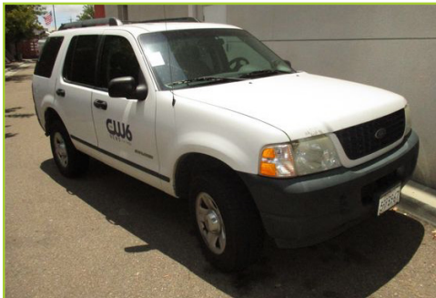
2005 FORD EXPLORER , V/N 1FMZU62E85ZA76684