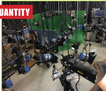
ETC SOURCE FOUR LIGHTS W/36 DEG. LENSES, BATES CONNECTORS, CLAMPS