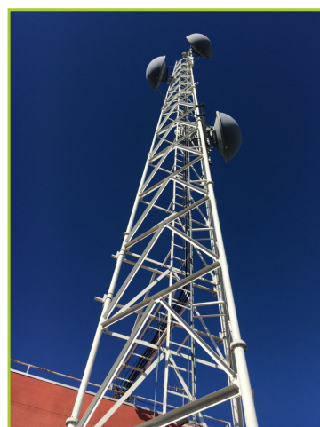
(4) ANDREWS MICROWAVE DISHES