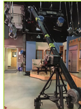
STANTON 15' JIMMY JIB