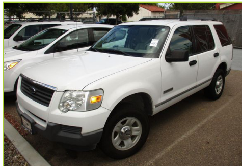
2006 FORD EXPLORER , V/N 1FMEU62E26UA58582