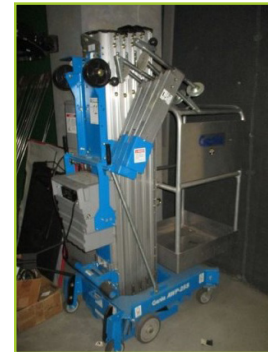
GENIE AWP-25S SELF-CHARGING PERSONNEL MAN LIFT