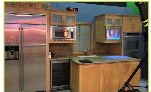
KITCHEN STUDIO SET W/DACOR S.S. 2-DOOR REFRIGERATOR, WINE COOLER, MICROWAVE, 2-DOOR OVEN, CAPPUCCINO MACHINE