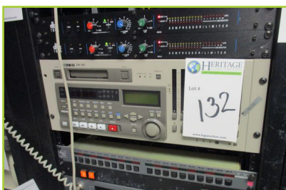
ASCAM DA-98 DAT RECORDER