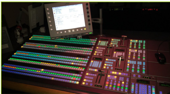
ROSS VISION SWITCHER/OVERDRIVE SYSTEM