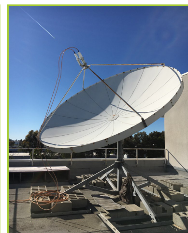
(3) DH RX STEERABLE SATELLITE DISHES