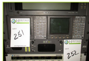
SONY PVW-2800 BETACAM SP VCR