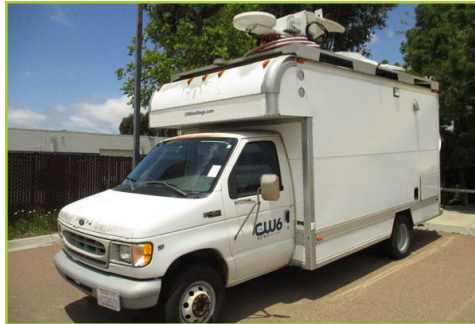
1999 FORD E450 6-WHEEL SNG TRUCK , 97,053 MILES, 18' ALUM. BODY, 1.8 METER 6 GIG MICROWAVE DISH, KU BAND, RX & TX, (2) ONAN MARQUIS 7000 GENERATORS, ELEC. LEVELING JACK, ENG DUAL GENERATOR CONTROL