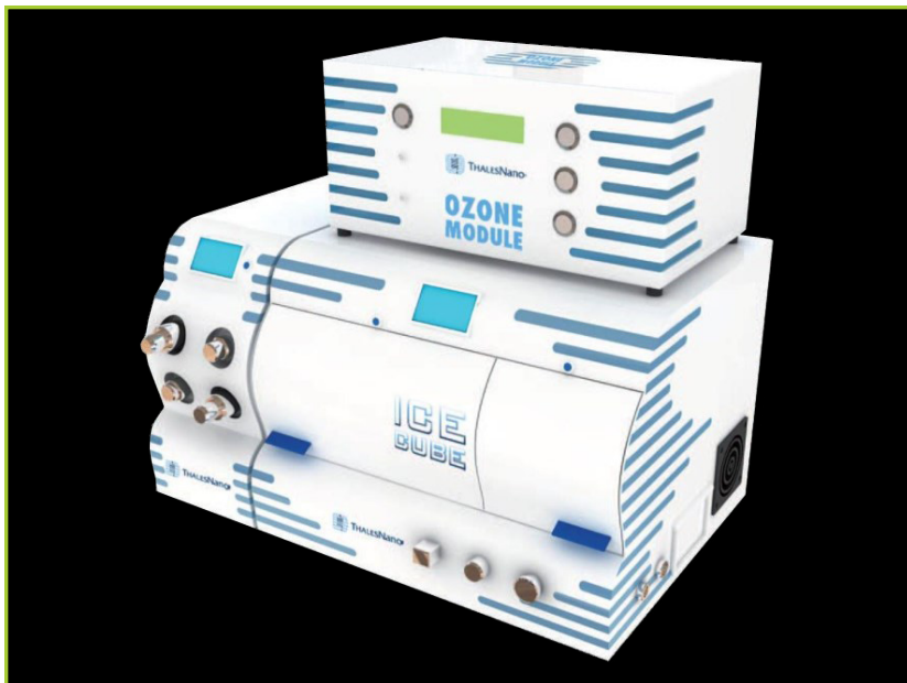
LOT: THALESNANO ICECUBE FLOW REACTOR SYSTEM. NEVER USED. STILL IN BOX. CONTENTS OF (4) BOXES TO INCLUDE: ICECUBE REACTOR MODULE, PUMP MODULE, AND CONTROL UNIT (PRODUCT CODE THS 09030). THE REACTOR HAS 2 REACTION ZONES WHICH CAN BE CONNECTED FOR MULTISTEP REACTIONS. THE FIRST REACTION ZONE HAS A TEMPERATURE RANGE -70° C OR - 50° C (SPECIFIED BY USER ON PO) AND +80° C. THE FIRST REACTION ZONE HAS A MAX VOLUME OF 8ML (-50° C VERSION) OR 4ML (-70° C VERSION). THE SECOND REACTION ZONE HAS A TEMPERATURE RANGE OF -30 - +80° C, AND SUPPORTS A REACTION VOLUME OF 4ML. THE REACTOR MODULE IS USED WITH 1/16" OR 1/8" TEFロン TUBES AND CAN BE PRESSURIZED UP TO 10 BAR. THE PUMP MODULE HAS TWO BUILT IN ROTARY PISTON PUMPS. EACH PUMP HAS FLOW RATES OF 0.2 - 0.4 ML/MIN. BOTH PUMPS ARE CONNECTED VIA 1/8" PTFE TUBES TO THE INLET SWITCH VALVES THAT CONTROL EACH OF THE INPUT LIQUID SOURCES. THE CONTROL UNIT IS A USER INTERFACE THAT CONTROLS ALL PARAMETERS OF A REACTION, AND ALL ASPECTS OF THE CONNECTED MODULES WHICH ARE PART OF THE ICECUBE SYSTEM. THIS UNIT INCLUDES (2) ICECUBE SINGLE PUMP MODULES (PRODUCT CODE THS 09032) THAT FUNCTION WHEN MORE THAN 2 LIQUID FEEDS ARE REQUIRED FOR A REACTION. THIS SEPARATE UNIT CAN BE CONTROLLED INDEPENDENTLY USING FLOW RATE RANGE OF 0.2ML - 0.9ML/ MIN ON THE TOUCH SCREEN OF THE PUMP MODULE OR VIA THE CONTROL UNIT.