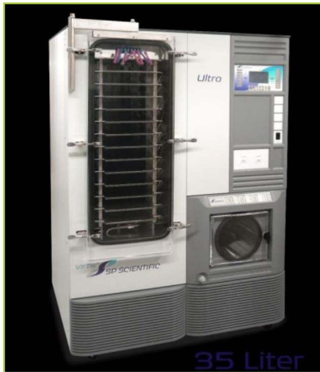
SP SCIENTIFIC MODEL-VIRTIS 35L GENESIS SQ EL-85, LYOPHILIZER WITH ENCORE CONTROL SYSTEM (1200L , 6 SHELF BULK, CLEANROOM NARROW CABINET STYLE). ITEM STILL 'NEW IN BOX AS WRAPPED/PACKAGED FOR SHIPPING BY MANUFACTURER. [LYOPHILIZER: P/N-1.0001.0546 ; S/N-320549 ; YEAR-2016 ; 208-230 VOLTS 1-PHASE 30-AMPS 60-HZ] [INCLUDED: GENESIS MULTI-LEVEL BILL OF MATERIALS BUILD-UP STANDARD REPORT ; ENCORE MULTI-LEVEL BILL OF MATERIALS BUILD-UP STANDARD REPORT ; DRAWINGS/SCHEMATICS ; VALIDATION GUIDE AND WORKBOOK MANUAL ; CALIBRATION AND CONFORMITY CERTIFICATES/DOCUMENTATION ; QC TESTING DATA REPORT ; LYOPHILIZER OPERATIONS MANUAL] [PACKAGED DIMENSIONS APPROX: MAIN UNIT 76"LX35"WX81"H ON CASTERS ; BOX#1 25"LX25"WX38"H ; BOX#2 15"LX14"WX9"H]