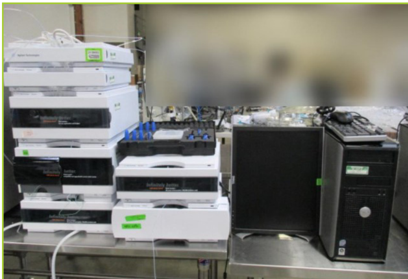
HPLC SYSTEM (6 MODULES): AGILENT 1290/1260/1100 (6-MODULES-TOTAL) HPLC SYSTEM. [WITH MODULES: AGILENT 1260/G1315B DIODE ARRAY DETECTOR VL S/N-DEAAX06706 ; AGILENT 1260-INFINITY/G1312B INFINITY BINARY PUMP S/N-DEACB08937 ; AGILENT 1260/G1329B AUTOSAMPLER S/N-DEAAC30798 ; AGILENT 1290-INFINITY/G1330B AUTOSAMPLER THERMOSTAT S/N-DEBAK21904 ; AGILENT 1100-SERIS/G1322A VACUUM DEGASSER S/N-JP7302310 ; AGILENT 1100-SERIS/G1316A COLUMN COMPARTMENT S/N-DE91609599. ALSO AGILENT 1200-SERIES REAGENT TRAY. INCLUDES AGILENT 1200-INFINITY SERIES TOOLS KIT] [WITH DELL OPTIPLEX-755 COMPUTER ; DELL 19" MONITOR ; KEYBOARD AND MOUSE ]