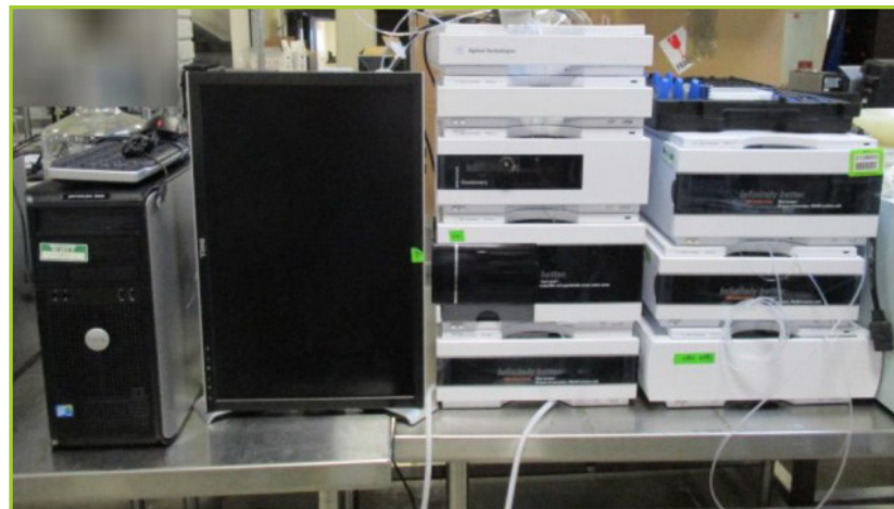
HPLC SYSTEM (7 MODULES): AGILENT 1290/1260/1200/1100 (7-MODULES-TOTAL) HPLC SYSTEM. [WITH MODULES: AGILENT 1200/G1362A REFRACTIVE INDEX DETECTOR S/N-CN60555595 ; AGILENT 1260/G1365D MULTIPLE WAVELENGTH DETECTOR VL S/N-DEAAZ01006 ; AGILENT 1100-SERIES/G1311A QUATERNARY PUMP S/N-DE33223865 ; AGILENT 1100-SERIES/G1322A VACUUM DEGASSER S/N-JP32750041 ; AGILENT 1100-SERIES/G1329A AUTOSAMPLER S/N-DE91605034 ; AGILENT 1290-INFINITY/G1330B AUTOSAMPLER THERMOSTAT S/N-DEBAK21905 ; AGILENT 1100-SERIES/G1316A COLUMN COMPARTMENT S/N-DE23931977. ALSO AGILENT 1200-SERIES REAGENT TRAY. INCLUDES AGILENT 1200-INFINITY SERIES TOOLS KIT] [WITH DELL OPTIPLEX-360 COMPUTER ; DELL 24" MONITOR ; KEYBOARD AND MOUSE ]