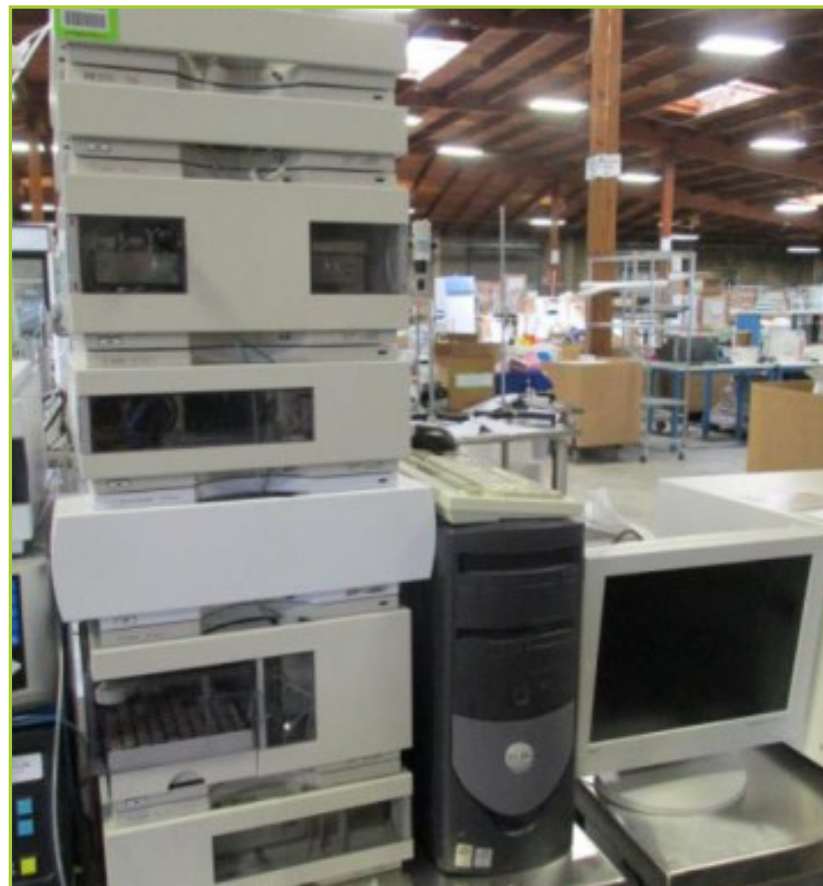
PLC SYSTEM (6 MODULES): AGILENT/HP 1100-SERIES (6-MODULES-TOTAL) HPLC SYSTEM. [WITH MODULES: AGILENT 1100/G1315A DIODE ARRAY DETECTOR S/N- DE91608025 ; AGILENT 1100/G1312A BINARY PUMP S/N-DE91605415 ; AGILENT 1100/G1329A AUTOSAMPLER S/N-DE11106926 ; AGILENT 1100/G1330A AUTOSAMPLER THERMOSTAT S/N-DE82207677AGILENT 1100/G1316A COLCOM S/N-DE03016832 ; HP 1100/G1322A VACUUM DEGASSER S/N-JP73021018. ALSO AGILENT 1100-SERIES REAGENT TRAY] [WITH DELL OPTIPLEX-GX150 COMPUTER, 15" MONITOR AND KEYBOARD].