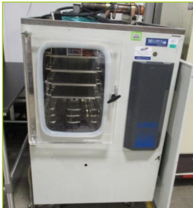
MILLROCK TECH LD85-B3 LYOPHILIZER S/N-LD850906007B3. WITH LEYBOLD TRIVAC #D8B VACUUM PUMP