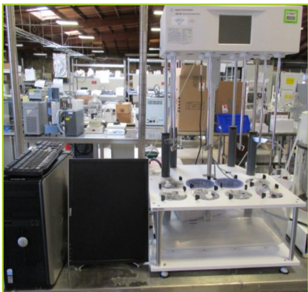
AGILENT 708-DS DISSOLUTION APPARATUS (AGILENT MODEL#G7910A P/N-G7910-60423 ; S/N-MY15278304) (8-POSITION CONFIGURATION/BUT 6-POSITION TESTING ; 1L, MOTORIZED LIFT) (WITH AGILENT #G7986A PUMP). WITH DELL OPTIPLEX-330 COMPUTER, 19" MONITOR AND KEYBOARD