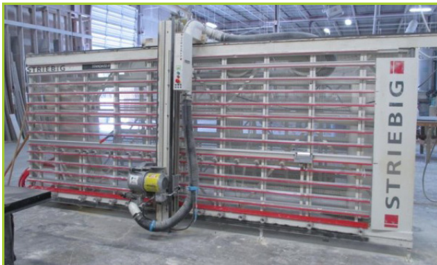
STRIEBIG STANDARD II VERTICAL PANEL SAW WITH 7.5- HP SAW MOTOR, 12' MAX BLADE, 7' H X 15' W CUTTING CAPACITY, MANUAL BRIDGE TRAVEL.