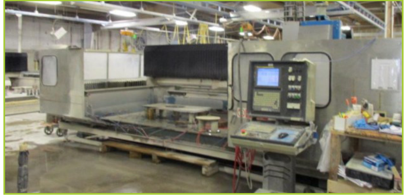
CMS SPEED-2-TAVOLE TWIN-TABLE CNC ROUTER [S/N-3254 ; YEAR-2003]. WITH GE FANUC PANEL #1 CNC CONTROL ; (ALSO INCLUDES EXTERNAL IBM MT-M-9964-ABU PC COMPUTER, DELL 17" MONITOR AND HP 1020 PRINTER) ; 18-HP ; 6,000-RPM ; 40-TAPER SPINDLE ; (2 TOTAL WORK TABLES) FRONT TABLE WORKING AREA 64"X142" AND BACK TABLE WORKING AREA 81"X142" ; CARTER LASER INDICATOR ; 52 STATION TOOL CHANGER AND 13 RESTING PODS ; APPROXIMATELY 5-HP VACUUM PUMP ; COOLANT SYSTEM WITH PUMP