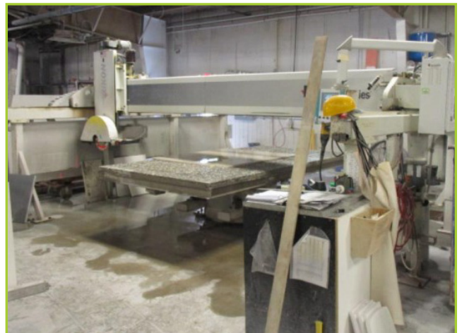
PARK INDUSTRIES YUKON PROGRAMMABLE BRIDGE SAW [S/N-3-04-1570 ; YEAR-2004]. WITH SIEMENS SIMATIC TOUCH-SCREEN PROGRAMMABLE LOGIC CONTROL ; 20-HP SAW HEAD MOTOR ; 24" MAXIMUM BLADE CAPACITY ; 6' X 11' PNEUMATIC TILTING WORK TABLE WITH MANUAL ROTATION ; 12' SAW HEAD CROSS TRAVEL ; 12' GANTRY TRAVEL . APPROXIMATELY 3-HP CROSS TRAVEL & GANTRY TRAVEL MOTORS, SIDE-MOUNTED LASER INDICATOR