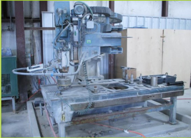
THIBAUT T108 BROKEN ARM ROUTER/POLISHER WITH 5-HP WORK HEAD, 42" THROAT, TYPE C 912, YR 1999, WITH 90" X 40" WORK TABLE