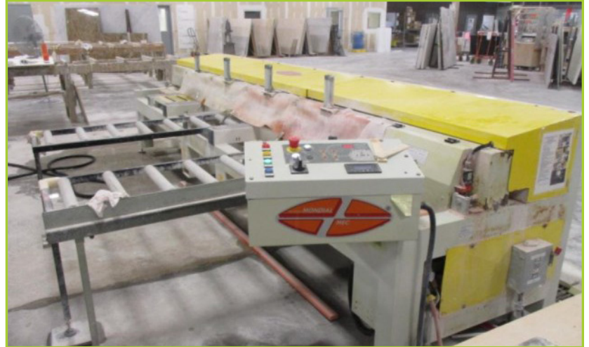
NUOVA MONDIAL MECCANICA FRESA MS45 CROSS-CUT MITER SAW, 12' [S/N-48526-14 ; YEAR-2014]. WITH 7-HP SAW MOTOR ; 15" BLADE CAPACITY ; (4) PNEUMATIC HOLD-DOWNS ; (2) FRONT ROLLER TABLES ; CONTROL PANEL WITH PROGRAMMABLE LOGIC CONTROL & DIGITAL READOUT OF RPM