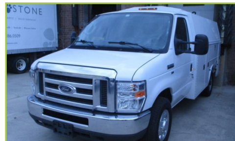
FORD E350 SUPERDUTY 2012 CONVERTED CARGO VAN WITH 5.4-L FLEX FUEL V8 ENGINE, KNAPHEIDE UTILITY BOX BODY, VIN# 1FDSE3FL1CDA41372