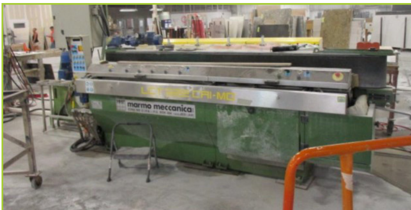
MARMO MECCANICA LCT 522 CAI - MO EDGE/BULLNOSE POLISHER [S/N-6796 ; YEAR-2004]. WITH APPROXIMATELY 3-HP FACING HEAD WITH 90° INDEX ; (2) APPROXIMATELY 2-HP BEVEL HEADS ; APPROXIMATELY 3-HP FACING HEAD WITH MECHANICAL READOUT OF POSITION ; (5) APPROXIMATELY 3-HP POLISHING HEADS ; 12" X 11' VERTICAL FLAT BELT CONVEYOR