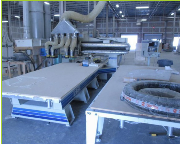
KOMO VR 512 2-HEAD SINGLE TABLE CNC ROUTER WITH KOMO CNC CONTROL, KOMO 12-HP & 10-HP 18,000-RPM ROUTER HEADS EACH WITH KOMO 7.5-HP 18,000- RPM DRILL HEADS, (YR. 1995) 5' X 12' WORK TABLE, 5-HP VACUUM PUMP, SPEEDAIRE APPROX. 3- HP VERTICAL AIR COMPRESSOR, ULTRAFILTER AIR DRYER, MANUAL SETUP TABLE, WISE DUST COLLECTOR, 5-HP, 2-BAG, WITH ALL RELATED DUCT WORK.