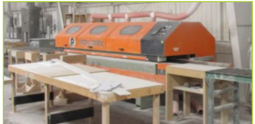
ROFILEMATIC 4-HEAD PROFILER. WITH ALLEN BRADLEY PANELVIEW-300 PROGRAMMABLE LOGIC CONTROL ; (2) 7.5-HP V- GROOVING HEADS ; 3-HP BRUSH HEAD ; 7.5-HP COVE HEAD ; 7.5-HP WORK HEAD (CURRENTLY EMPTY) ; (2) 3/4-HP VARIABLE SPEED CATERPILLAR CONVEYOR DRIVE MOTORS ; POWERMATIC MODEL-075 3-HP 2-BAG PORTABLE DUST COLLECTOR ; (2) 20" X 10' GRAVITY FEED ROLLER CONVEYORS.