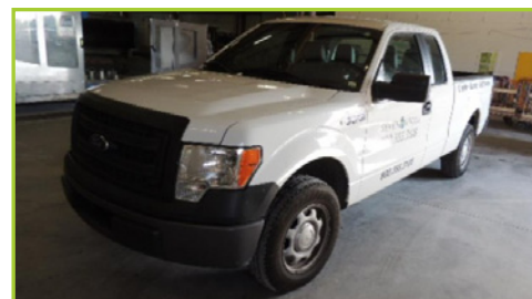
FORD F-150 2013 EXTENDED CAB, SHORT BED , AUTOMATIC TRANSMISSION, 5.0 V8, MILEAGE 106,174, P230-75-R17