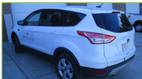
FORD ESCAPE SE 2014 SPORT UTILITY VEHICLE WITH 1.6 L GAS ENGINE, FRONT WHEEL DRIVE, AUTO TRANSMISSION, 10,524-MILES