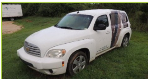
CHEVROLET LS 2008 4 DOOR , AUTOMATIC TRANSMISSION, 4 CYL. ECOTEC ENGINE, MILEAGE UNKNOWN