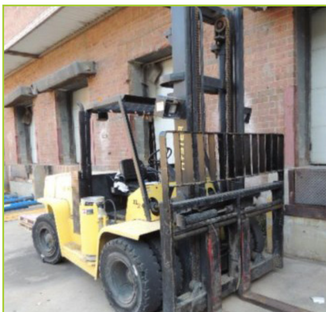
HYSTER H155XL2 PROPANE, 14,100LB CAPACITY, APPROXIMATELY 173" LIFTING HEIGHT, DUAL FRONT TIRES, SIDE SHIFT, 8' FORKS, 2551 HOURS, YR. 1999