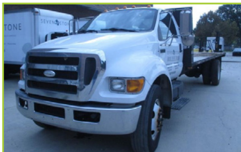
FORD F750XL 2008 FLAT BED TRUCK WITH CUMMINS 6.7-L TURBO DIESEL ENGINE, 142,480-MILES