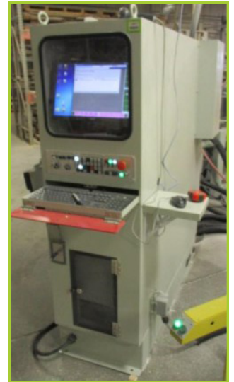
ANDERSON GROUP STRATOS/PRO BRIDGE-TYPE CNC ROUTER [S/N-FAANCST04161 ; YEAR-2015]. [10- POSITION AUTO TOOL CHANGER ; MULTI-FUNCTION ; MAX SPINDLE SPEED 24,000-RPM ; 61" X 145" TABLE ; CONTROLLER CABINET WITH INTERNAL WINDOWS BASED PC CONTROL ; (ALSO INCLUDES EXTERNAL DELL OPTIPLEX-3010 PC COMPUTER AND DELL 22" MONITOR) ; TOSOKU PENDANT CONTROL ; WITH OPTIONAL FEED BELT CONVEYOR SECTION- 67" X 117" ; (2) BECKER 10-HP VACUUM PUMP