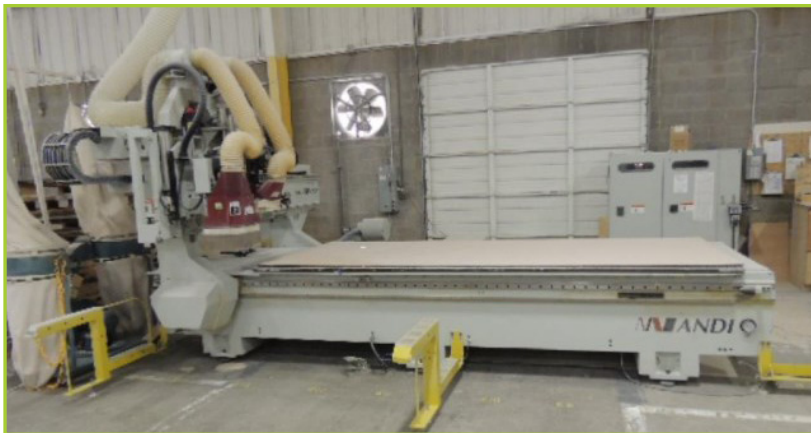
ANDERSON STRATOS PRO -E/ANDI CNC ROUTER WITH FANUC CNC CONTROL, 11 HP 24000 RPM ROUTER HEAD, 2HP 9SPINDLE DRILL HEAD, 5'X12' WORK TABLE, 8 POSITION ROTARY TOOL CHANGER MFG. YR. 2009, BAR CODE SCANNER, BECKER 24HP OIL LESS VACUUM PUMP, MFG. YR. 2013. INCLUDES JET MODEL DC 1900 DUST COLLECTOR 3HP 230V 1PH, INCLUDES WORK STATION, MFG. YR. 2009