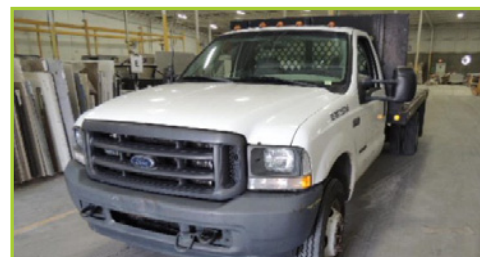
FORD F-550 2003 SINGLE CAB W/ 8'X16' FLAT BED W/ SIDES , 7.3 TURBO DIESEL, DUAL REAR WHEELS, MILEAGE 239,325, AUTOMATIC