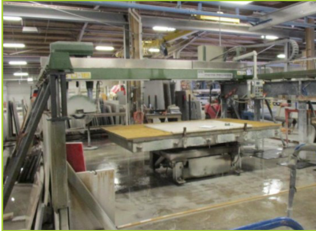
MARMO MECCANICA HTO 1/B PROGRAMMABLE BRIDGE SAW [S/N-5373 ; YEAR-1999]. WITH MARMO MECCANICA PROGRAMMABLE LOGIC CONTROL ; APPROXIMATELY 20- HP SAW HEAD ; 24" BLADE CAPACITY ; 90° SAW HEAD TILT ; APPROXIMATELY 12' SAW HEAD CROSS TRAVEL ; APPROXIMATELY 12' SAW GANTRY TRAVEL ; 60" X 115" POWER TILTING TABLE WITH MANUAL ROTATION ; APPROXIMATELY 2-HP SAW HEAD & GANTRY TRAVEL MOTORS ; SIDE-MOUNTED LASER INDICATOR ; TRANSFORMER ; PENDANT CONTROL