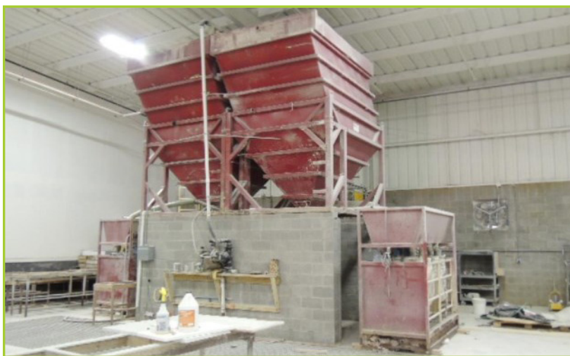
ECS EICH WATER TREATMENT SYSTEM , INCLUDES (2) POLYURETHANE SEDIMENT TANKS, (2) MODEL TSSC8 SEDIMENT BAGGERS, INGERSOLL RAND 2" PNEUMATIC PUMP, SPARE IR 2" PUMP, (3) GRUNDFOS 10HP PUMPS, ROSEDALE FILTER, (2) 1000GAL POLYURETHANE TANKS, ALL RELATED PUMPS, CONTROLS, PROCESS PIPING AND SUPPORT STRUCTURES.