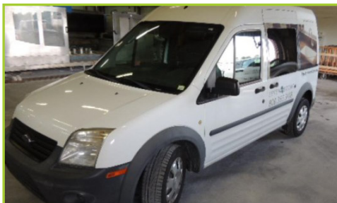
FORD TRANSIT CONNECT 2011 VAN , SLIDING DOORS, EXTENDED HEIGHT, AUTOMATIC TRANSMISSION, V-6, MILEAGE 138,094