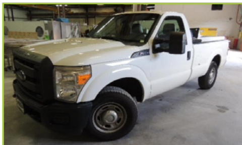
FORD F-250 SUPER DUTY PICKUP , 2012, SINGLE CAB, V-8 6.2 LITER, AUTO TRANS, LONG BED, TOOL BOX, MILEAGE 131,465