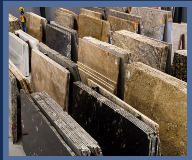
Scan this QR Code with your smartphone for More Information.

Kuka CNC 6 Axis Robot • CMS Maxima 5000 5 Axis Router • Flow 71400-1 CNC Flying Bridge • (2) Marmo Maccanica Programmable Bridge Saw • Komo 512VR CNC Router • (8) Isuzu NPR Box Truck • Ford F750XL, 250XL, (5) F150, Focus • Chevy W3500, Express 2500, (4) HHR • Huge Quantity of Stone & Raw Material Inventory and Much More!