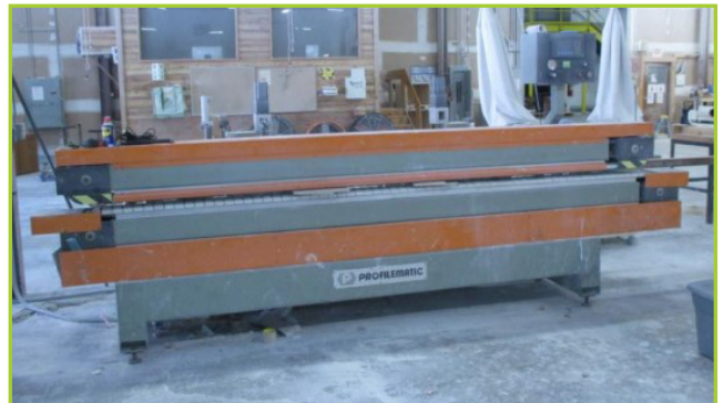
PROFILEMATIC AUTO-MATIC V-GROOVER WITH APROX 7.5-HP SAW HEAD, (4) 7.5-HP SHAPER HEADS, 3/4-HP VARIABLE SPEED UPPER AND LOWER CATEPILLAR DRIVE MOTORS, DIGITAL SAW STATION HEIGHT INDICATORS, CONTROL PANELS, 3 BAG DUST COLLECTOR VACUUM SYSTEM, (4) ROLLER CONVEYOR TABLES.