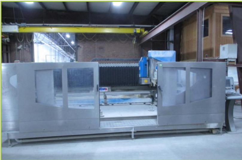
S MAXIMA 5000 TWIN-TABLE, 5-AXIS CNC ROUTER WITH PC-BASED CNC CONTROL, 18-HP 6,000-RPM 40- TAPER SPINDLE, 12' X 16.5', WORK TABLE, 12.5' X 16.5' X 23.6". YR 2008, LP-HFD LASER INDICATOR