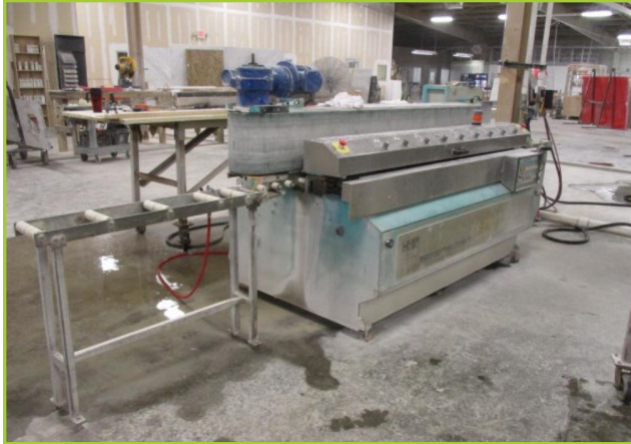
MARMO MECCANICA LCV MAGNUM EDGE POLISHER. WITH: (1) BEVEL WORK HEAD WITH APPROXIMATELY 3-HP MOTOR ; (6) POLISHING HEADS EACH WITH 3-HP MOTOR ; 2" X 8' VARIABLE SPEED FLAT BELT CONVEYOR WITH APPROXIMATELY 3/4-HP MOTOR, AND CONTROL PANEL