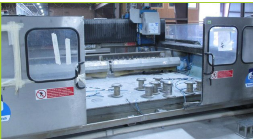
CMS SPEED 2 TAVOLE TWIN-TABLE CNC ROUTER WITH GE FANUC PANEL I CNC CONTROL, 18-HP 6,000-RPM 40- TAPER SPINDLE, (2) 98" X 142" WORK TABLES, E-Z LASER INDICATOR, 52-STATION TOOL CHANGER, 6.4-HP VACUUM PUMP, COOLANT SYSTEM WITH PUMP, ALL RELATED RESTING PODS AND TOOLS INCLUDED. YR 2003.