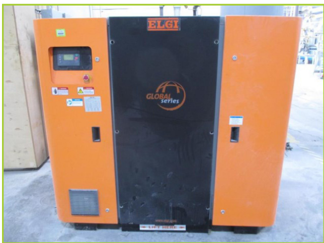
ELGI E37-125 50-HP AIR-COOLED SCREW TYPE AIR COMPRESSOR , (2013), WITH (2) APPROX. 1-HP BLOWERS, PROGRAMMABLE LOGIC CONTROL, 4,021-HOURS REPORTED, ALSO WITH STEEL FAB VERTICAL 250 GAL AIR TANK AND AURORA 2.5 HP REFRIGERATED AIR DRYER MODEL RDV0250-04