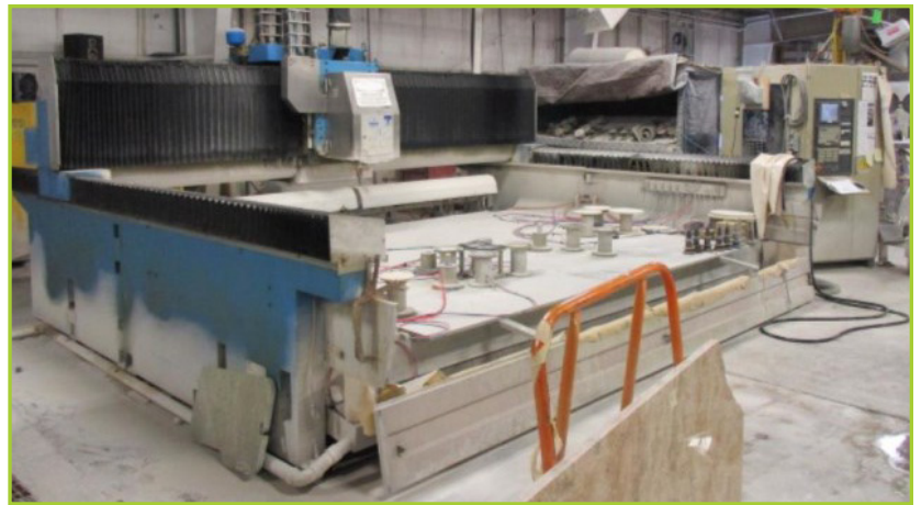
CMS MAXIMA SINGLE-TABLE CNC ROUTER [S/N-2932 ; YEAR-2002]. WITH GE FANUC PANEL #1801-M CNC CONTROL (ALSO INCLUDES EXTERNAL DELL OPTIPLEX-730 PC COMPUTER AND LG 19" MONITOR ) ; 18-HP ; 6,000-RPM ; 40- TAPER SPINDLE ; (1 WORK TABLE) TABLE WORKING AREA 102"X142" ; APPROXIMATELY 98" X 16' X 23.6" TRAVELS ; 26 STATION TOOL CHANGER AND 13 RESTING PODS ; APPROXIMATELY 5- HP VACUUM PUMP ; TRANSFORMER ; COOLANT SYSTEM WITH PUMP