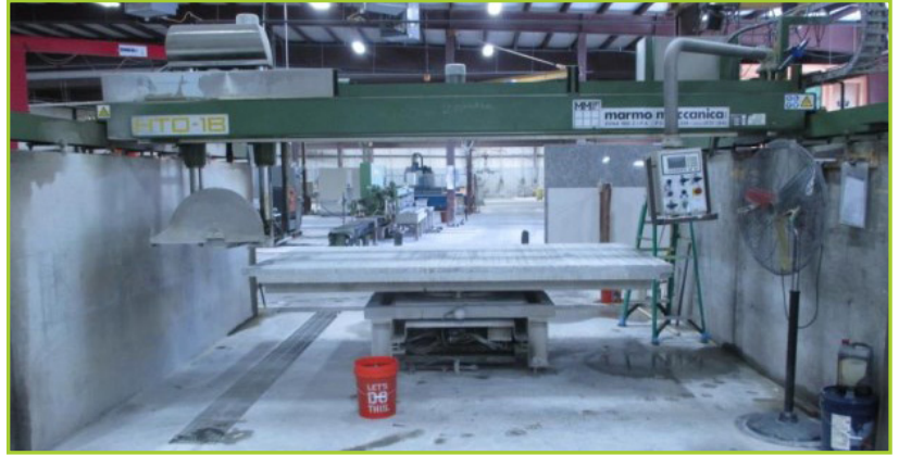
MARMO MECCANICA HTO 1/B PROGRAMMABLE BRIDGE SAW WITH APPROXIMATELY 20-HP SAW HEAD, 24" BLADE CAPACITY, 90° SAW HEAD TILT, APPROXIMATELY 15' SAW HEAD CROSS TRAVEL, APPROXIMATELY 14' SAW GANTRY TRAVEL, 5' X 10' POWER TILTING TABLE WITH MANUAL ROTATION, APPROXIMATELY 2- HP SAW HEAD AND GANTRY, LASER INDICATOR, PENDANT CONTROL. YR 2003