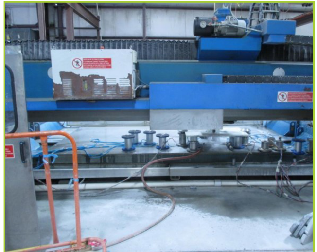
CMS SPEED 2 TAVOLE TWIN-TABLE CNC ROUTER WITH GE FANUC PANEL I CNC CONTROL, 18-HP 6,000-RPM 40- TAPER SPINDLE, (2) 98" X 142" WORK TABLES, E-Z LASER INDICATOR, 52-STATION TOOL CHANGER, 6.4-HP VACUUM PUMP, COOLANT SYSTEM WITH PUMP, ALL RELATED RESTING PODS AND TOOLS INCLUDED. YR 2003, WITH DELL OPTIPLEX GX620 COMPUTER AND EASY STONE SOFTWARE VER. 4.5A8