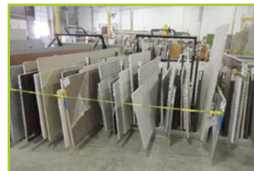
GRANITE, MARBLE, NON GRANITE, QUARTZ, RECYCLED, SOLID SURFACE, WOOD