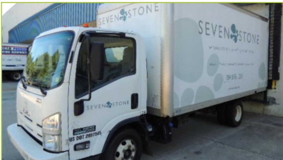
ISUZU NPR ECO-MAX 2011 CABOVER BOX TRUCK , 16' BOX, W/ RAMP, 12000GVW, 4.75 ECO MAX DIESEL TURBO, AUTOMATIC TRANSMISSION, MILEAGE 85,288