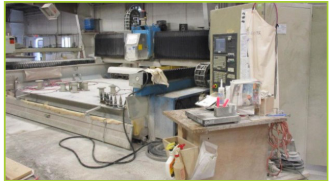
CMS MAXIMA SINGLE-TABLE CNC ROUTER [S/N-2932 ; YEAR-2002]. WITH GE FANUC PANEL #180I-M CNC CONTROL (ALSO INCLUDES EXTERNAL DELL OPTIPLEX-730 PC COMPUTER AND LG 19" MONITOR ) ; 18-HP ; 6,000-RPM ; 40- TAPER SPINDLE ; (1 WORK TABLE) TABLE WORKING AREA 102"X142" ; APPROXIMATELY 98" X 16' X 23.6" TRAVELS ; 26 STATION TOOL CHANGER AND 13 RESTING PODS ; APPROXIMATELY 5- HP VACUUM PUMP ; TRANSFORMER ; COOLANT SYSTEM WITH PUMP.