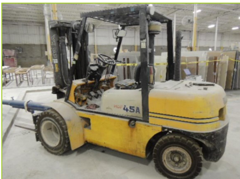
HALLA HDF 45A 8,800LB CAPACITY, 3 STAGE MAST, 185" LIFTING HEIGHT, SIDE SHIFT, 5' FORKS, DUAL FRONT TIRES, 5,600HRS, VESTIL BOOM LIFT ATTACHMENT MODEL LM 1T-4, 4000LB CAPACITY