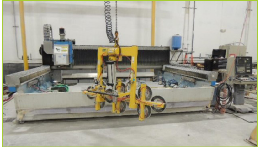
CMS MAXIMA CNC ROUTER , SINGLE TABLE, WITH FANUC SERIES 180 I-M CONTROL, C OR 4 AXIS WITH 360 ROTATION, 18HP 15,000RPM SPINDLE, 142"X118"X16" TRAVEL, 26 POSITION TOOL CHANGER, 90 DEGREE SAW ATTACHMENT, 5.5HP VACUUM PUMP, MFG. YR. 2014, COOLANT PUMP, ALL RELATED WORK RESTING PODS. 480V 3PH. W/ WORK TABLE TOOL BOX AND OTHER ITEMS.