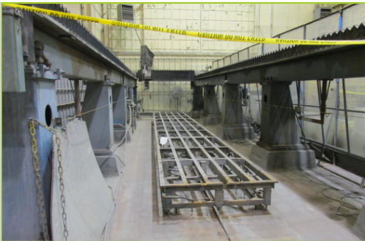
KMT SLV-50R GANTRY TYPE WATER JET CUTTING MACHINE, W/ KMT ADS-500 HOPPER, KMT STREAMLINE SL-V50R PLUS, WILKERSON COMPRESSED DESICCANT AIR DRYER, POLY TANK, 50-HP & 60,000 PSI.