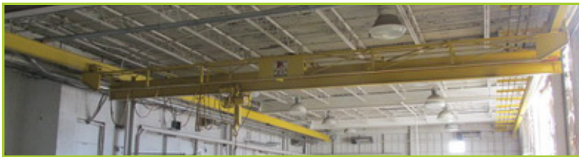
JUSTICE SINGLE BEAM BRIDGE CRANE, W/ 2-TON HOIST