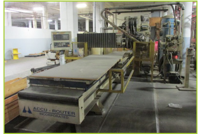
ACC-ROUTER SERIES 3C CNC ROUTER , GE FANUC SERIES 18-M CONTROL, 4' X 12' TABLE, 460V, 3-PHASE, 60 HZ, 70A, TRANSMATIC DUST COLLECTOR & SULLAIR VS-10 AIR COMPRESSOR