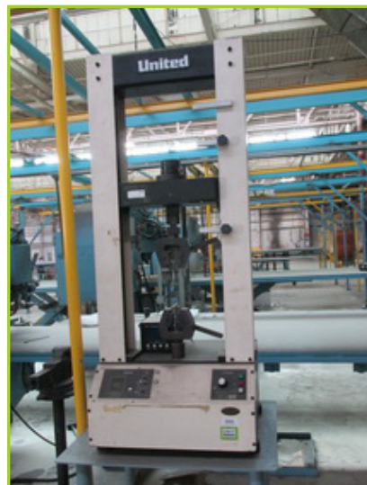
UNITED TM-10 TENSILE TESTER