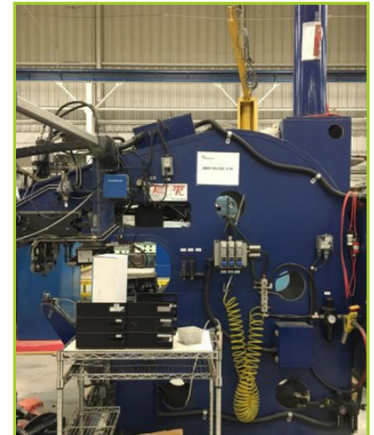
TATCO DRIVMATIC ITC-L2-12-48-S C-FRAME ROUTER/DRILLER , JIB CRANE, 500 LB. CAP, #19, PLC CONTROLS, 48" GANTRY THROAT, 10-HP, 6000 RPM