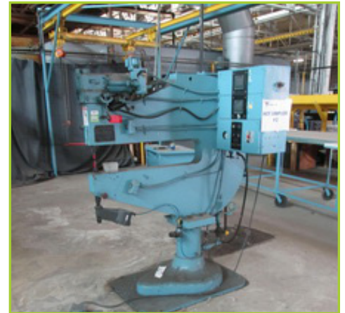
CHICAGO PNEUMATIC CP-450EA C-FRAME HOT DIMPLING MACHINE , # 2, 36" THROAT, 7.5" GAP, 9/16" TOOL HOLE SIZE, COMPRESSION RIVETER