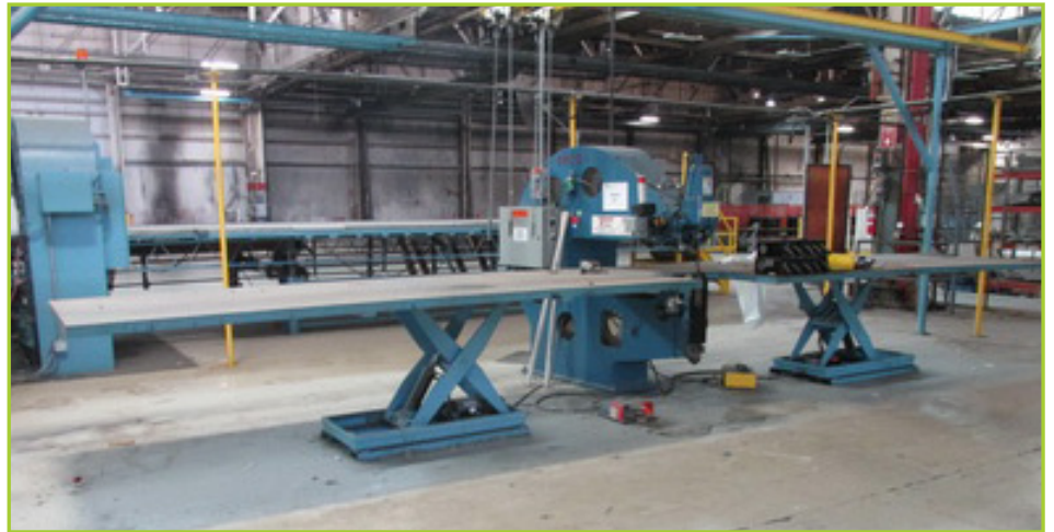
TATCO TA-548E-54 C-FRAME HOT PUNCH & ROUTING MACHINE, ERCO #1, PLC CONTROLS, 54" D