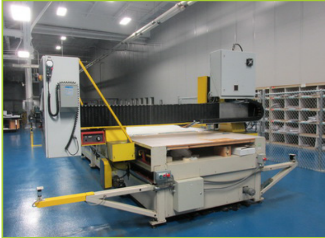
AMERICAN GFM US-40 ULTRASONIC CUTTING/ROUTING MACHINE W/ VIDEOJET EXCEL 2000 INK JET PRINTER , 6' X 56', 5-AXIS, GRM PC