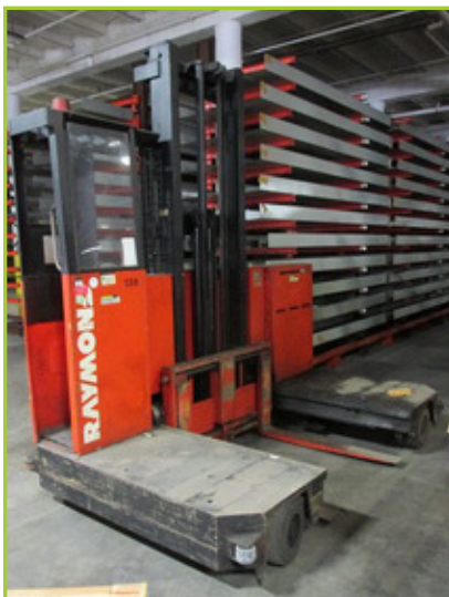
RAYMOND 71-SL60TF ELECTRIC SIDE LOADER FORK TRUCK , 6,000LB CAP, 2-STAGE, 193" REACH