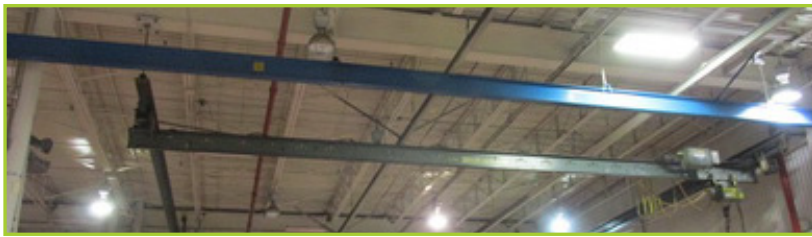
CLEVELAND TRAMRAIL SINGLE BEAM BRIDGE CRANE, W/ 1/2-TON HOIST