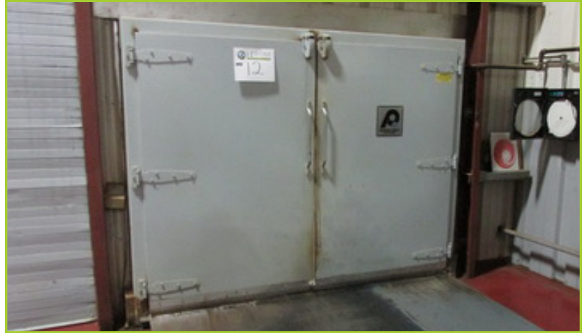
PRECISION QUINCY EC-620-6MM OVEN , 460V, 3-PHASE, 60 HZ, 16.6A, 10-HP, 25' LONG X 10' WIDE X 6' HIGH