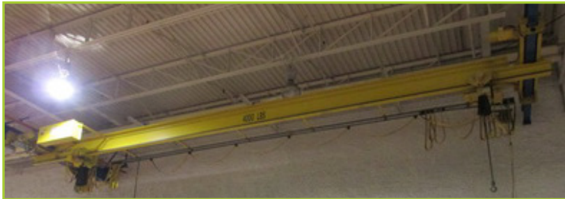
SINGLE BEAM BRIDGE CRANE, W/ (2)- 1-TON HOISTS.