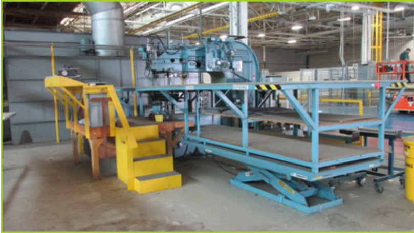
GEMCOR DRIVMATIC G400BCH/39A-60 C-FRAME ROUTER/DRILLER, # 1, PLC CONTROLS, 48" D, 5000 RPM, 10-HP.