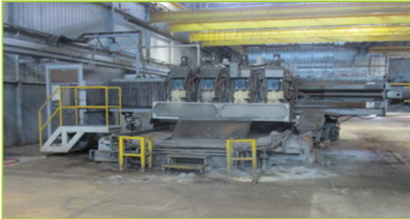
ONSRUD CNC ROUTER , 3-AXIS, Z-25", MACHINEMATE CONTROLS, 12' X 79" BED SIZE, 4-SPINDLES, 100- 7.5K RPM, 60-HP