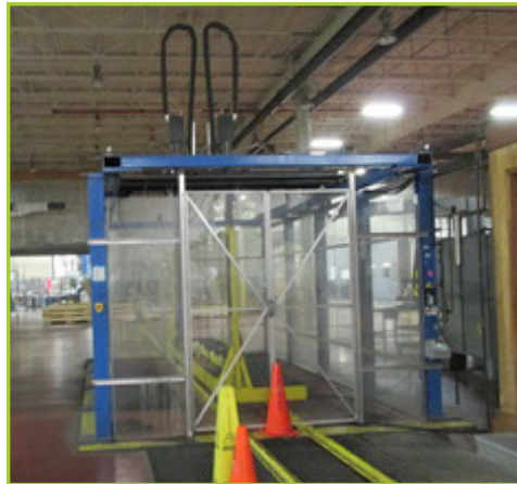
MATEC GANTRY TYPE ULTRASONIC C-SCAN SYSTEM , PC CONTROLS, 11.4' X 19', 3-AXIS