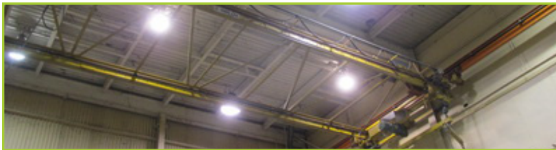
DOUBLE BEAM BRIDGE CRANE, W/ SPREADER BAR