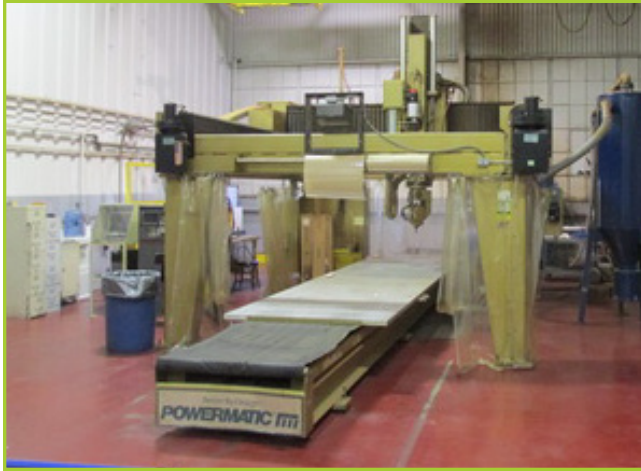
POWERMATIC ROUTER MACHINE , FANUC 15 CONTROLS, 5' X 20' BED SIZE, 1-SPINDLE, 30,000 RPM, 15-HP, Z-37"