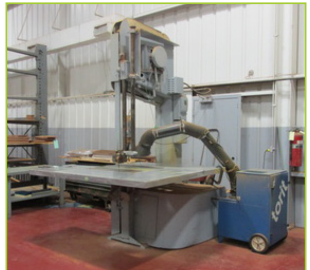
DOALL 36-B VERTICAL BAND SAW , W/ DORIT DUST COLLECTOR