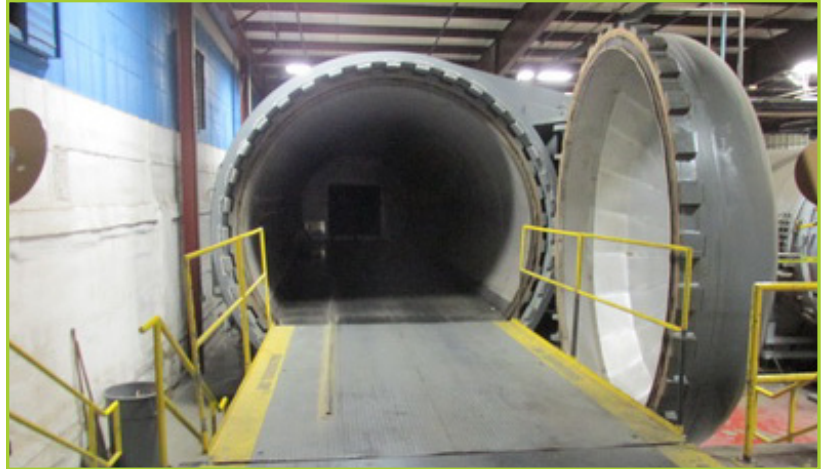
MCBEE AMERICAN AUTOCLAVE, #5, 300 PRESSURE, 200 VALUE SETTING, MAWP 300 PSI @ 600 DEGREE F, 12' X 80', PC CONTROLS. MFG.YR: 2001