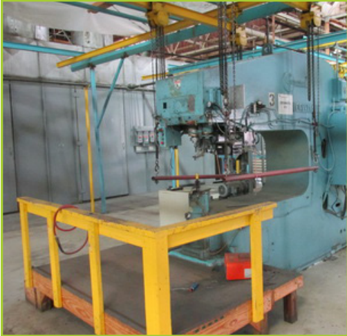
GENERAL DRIVMATIC G-39 C-FRAME ROUTER/DRILLER, # 3, PLC CONTROLS, 48" D, 4000 RPM, 10-HP