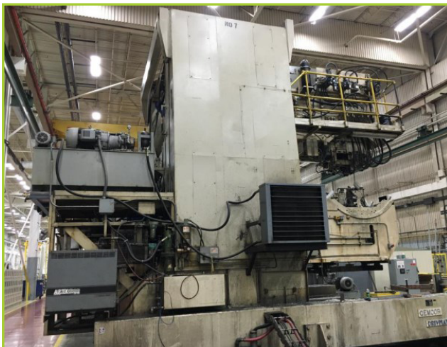
GEMCOR CNC 5- AXIS HORIZONTAL WING AUTO RIVETER , W/ A/B 7320 CONTROLS, 96"D GANTRY THROAT, 11.5' X 80" ENVELOPE, 12K RPM, HIGH SPEED UPPER HEAD TRANSFER, HIGH SPEED DRILL AND SHAVE SPINDLE, HIGH SPEED SERVO BUCK