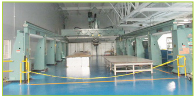
CINCINNATI MILACRON 5-AXIS FLAT TAPE CNC LAYER MACHINE, 26' X 61', AB 975 CONTROLS, TRAVEL: X-AXIS 648", Y-AXIS 200", Z-AXIS 36", ROTATION C-AXIS +/- 190 DEGREE, CUTTER ANGLE D-AXIS +1 TO 181 DEGREE, CUTTER TRAVEL V-AXIS 6" & 12" TAPE 14.25", LONG/TRANSVERSE FEED RATE 0.1 TO 1800IN/MIN, VERTICAL FEED 0.1 TO 600IN/MIN, C-AXIS 0.1-9000 DPM, D-AXIS 0.1-10,800DPM, V-AXIS 0.1 - 1200IN/MIN, U-AXIS 0.1-1800IN/ MINZ2TRACK 150N/MIN, WORK SURFACE 648" X 200", WORK HEIGHT 27" TO 63", 8-SPINDLE.