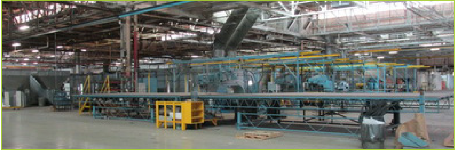
GEMCOR DRIVMATIC G-400/39-96DP C-FRAME ROUTER DRILLER , #5, PLC CONTROLS, 96"D, 4000 RPM, 10-HP