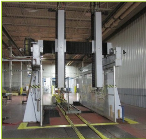
ADDIS XR125 GANTRY TYPE ULTRASONIC C-SCAN SYSTEM , PC CONTROLS, 13.3' X 24.8', 4-AXIS