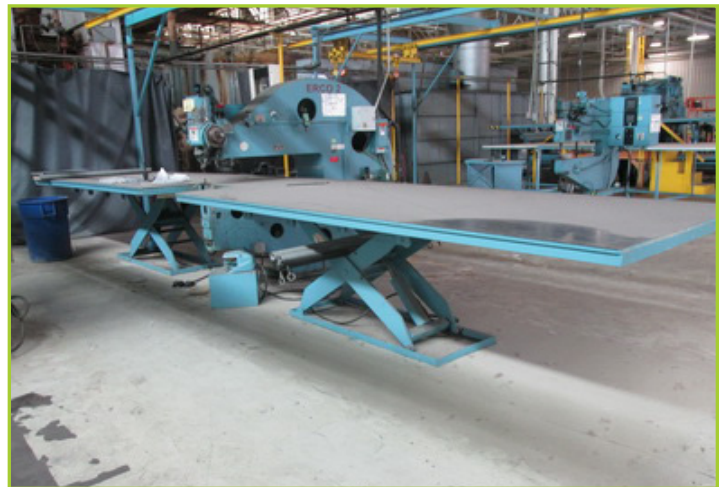
MARCHANT 848E C-FRAME HOT PUNCH & ROUTING MACHINE, ERCO #2, 48" D