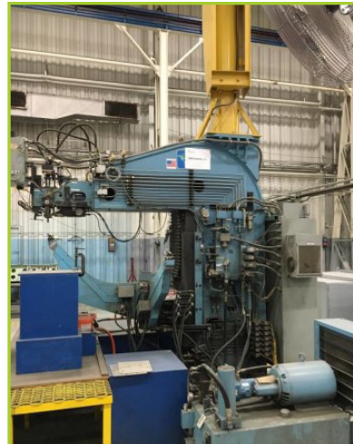
TATCO DRIVMATIC G200BCHXR/400 C-FRAME ROUTER/DRILLER , JIB CRANE, 500 LB. CAP, #18, PLC CONTROLS, 48" GANTRY THROAT, 10-HP, 5000 RPM