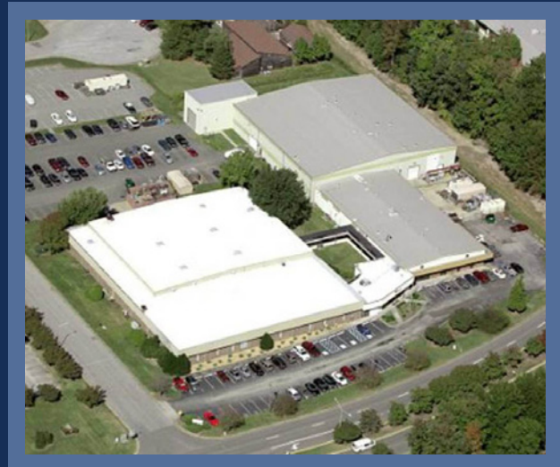
Scan this QR Code with your smartphone for More Information.

Cell Sorter • Cell Analyzer • Sampler System • ScanScope • Multilabel Counter • Benchtop Bioreactors • Coulter Counter • Microscopes • Centrifuges • Incubators • Freezers • BioSafety Cabinets • Sterilizer • Encapsulators • Shakers • Stirrers • Balances • Scales • Hot plates • Mixers • Flame Cabinets • Large Quantity of Glassware • Larger Quantity of Consumables • And More