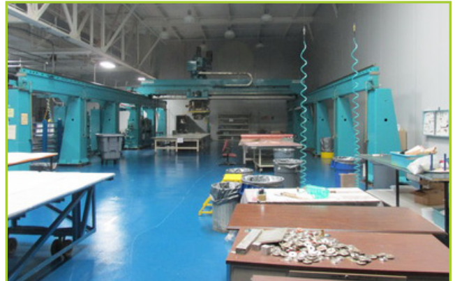
CINCINNATI MILACRON AE 3-AXIS, G/T CNC TAPE LAYER MACHINE, 20' X 54', AB 8200 CONTROLS, 400 SQ. FT. PER HOUR, FINGER SENSORS, 8-SPINDLE.

AIR DRYERS, CABINETS, CANTILEVER RACKS, SHOP TOOLS, JIB CRANES, CUTTING TOOLS, FORKLIFTS, AIR COMPRESSORS AND MUCH MORE!