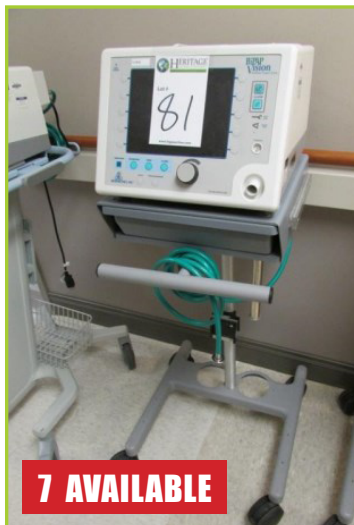
RESPIRONICS BIPAP VISION INTEGRATED DISPLAY SCREEN DISPLAYS REAL-TIME GRAPHICS IN WAVEFORM OR BAR SCALE FORMAT