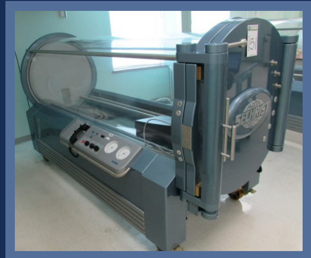
Scan this QR Code with your smartphone for More Information.

Patient Rooms • Radiology • Rehabilitation • Nursing Stations • Intensive Care Units • Pharmacy • Respiratory Therapy • IT Equipment • Kitchen • Exam Rooms • Equipment Rooms • Dialysis • Bariatrics Equipment • Materials Management • Much More!