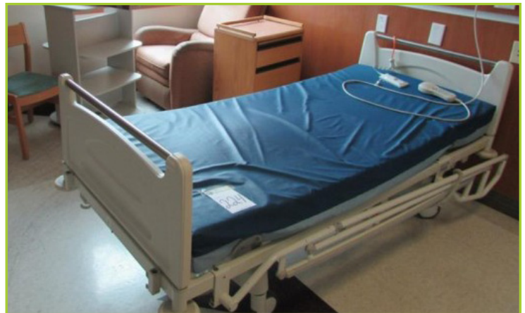
HUNTLEIGH PATIENT BED AND RECLINING CHAIR WITH BEDSIDE TABLE