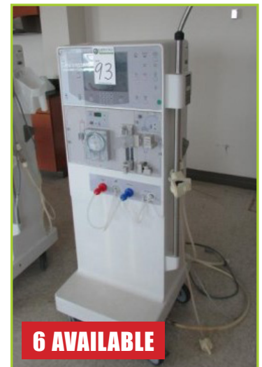
FRESENIUS 2008K HEMODIALYSIS MACHINE WITH TOUCHSCREEN MONITOR