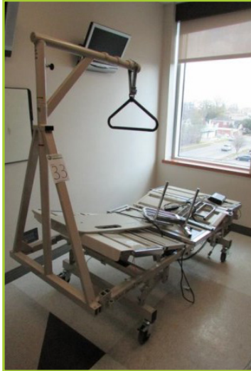
BARTON G 1000 MAXIMUM PATIENT WEIGHT 1000 LBS., TRAPEZE AND TOP RAILS