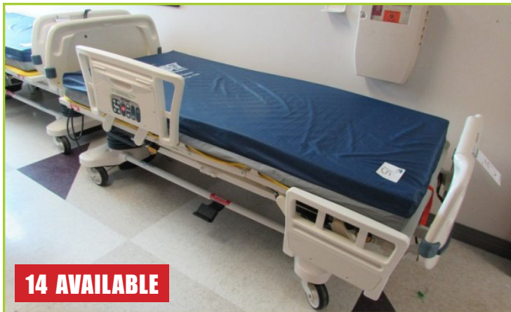
STRYKER SECURE II BACKREST ANGLE INDICATOR, LOCKING-CASTER STEERING, FOUR TRACTION SOCKETS, REMOVABLE HEADBOARD WITH CPR CAPABILITY