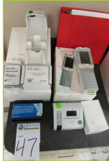
BBOT LABS I-STAT 1 300 HAND HELD BLOOD ANALYZER WITH DOWNLOADER/RECHARGER, EXTRA BATTERY AND PRINTER