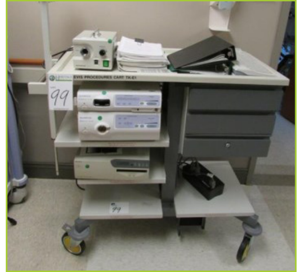
OLYMPUS EVIS EXERA II CV-180, CLV-180, SONY VIDE VIDEOSCOPE SYSTEM TO INCLUDE ALL COMPONENTS WITH CART.