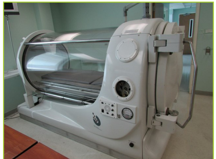
PERRY BAROMEDICAL SIGMA PLUS (NON-OPERATIONAL UNIT, OVER 20 YEARS OLD)