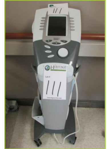
CHATTANOOGA GROUP INTELECT LEGEND XT ELECTROTHERAPY SYSTEM WITH ROLLING CART