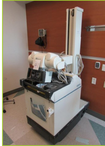
GENERAL ELECTRIC AMX4 MX-75 275K HU X-RAY TUBE WITH A .75MM FOCAL SPOT, GE AMX-IV COLLIMATOR, FORWARD AND REVERSE VARIABLE SPEED