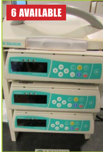
BRAUN INFUSOMAT SPACE LOT OF THREE (3) WITH SPACE STATION