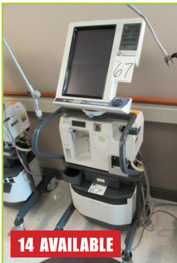
PURITAN BENNETT 840 MODES: ASSIST/CONTROL, SYNCHRONIZED INTERMITTENT MANDATORY VENTILATION, OR SPONTANEOUS, BI-LEVEL