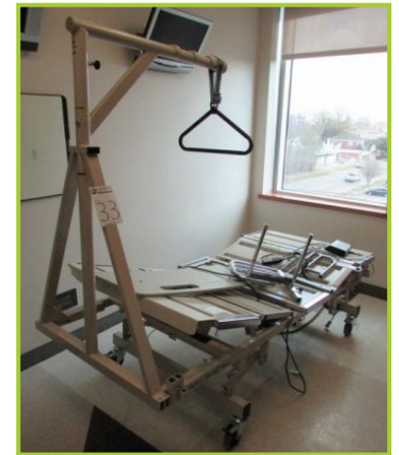
BARTON G 1000 MAXIMUM PATIENT WEIGHT 1000 LBS., TRAPEZE AND TOP RAILS