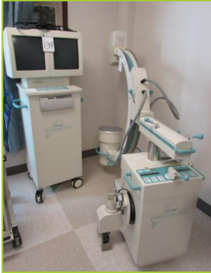
ZIEHM EXOSCOP 7000 C-ARM WITH CONTROL UNIT