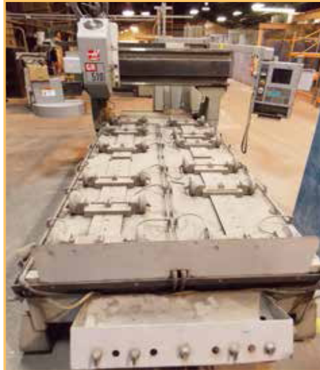
HAAS GR-510 3-AXIS CNC GANTRY ROUTER