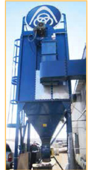
TORIT DUST COLLECTOR