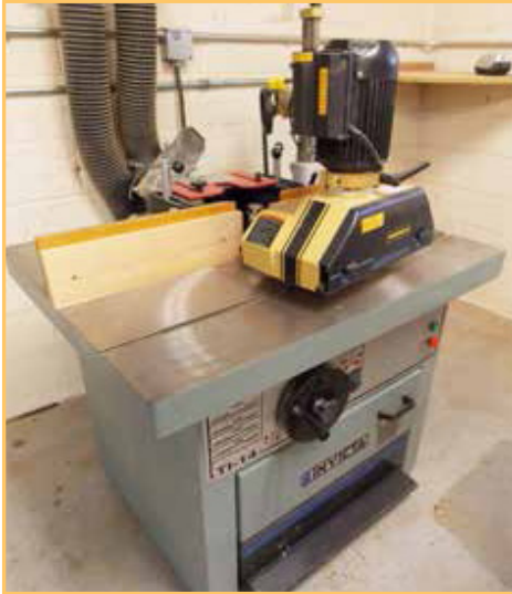
INVICTA TI-14EF WOOD SHAPERS