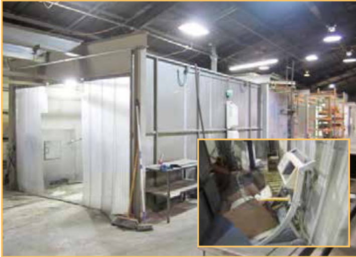
COL-MET POWDER COAT SPRAY BOOTH W/(3) ITW PAINT SPRAYERS