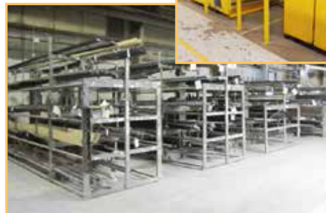
PARTIAL VIEW OF STOCK STEEL