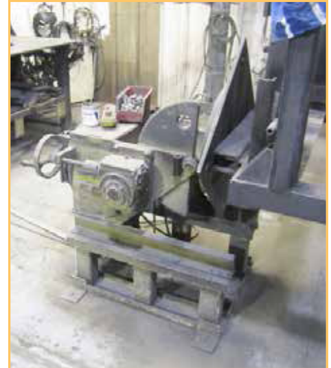
PANDJIRIS WELDING POSITIONER