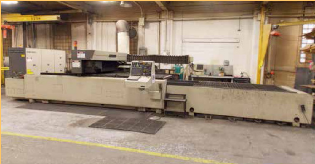
CINCINNATI CL-6 5'X10' 2000 WATT CNC LASER CUTTING MACHINE