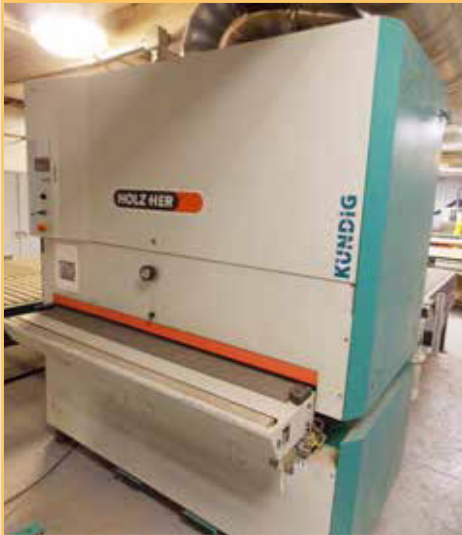
HOLZHER KUNDIG PRIMA HORIZONTAL BELT SANDER