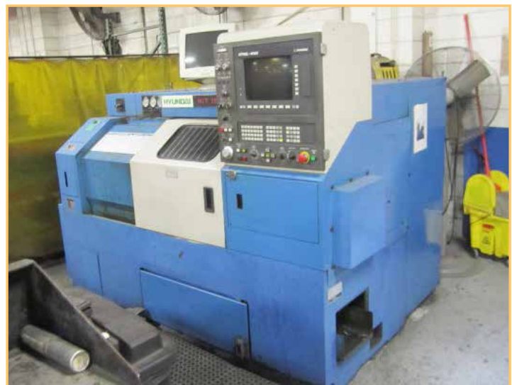
HYUNDAI HIT5S 2-AXIS CNC TURNING CENTER