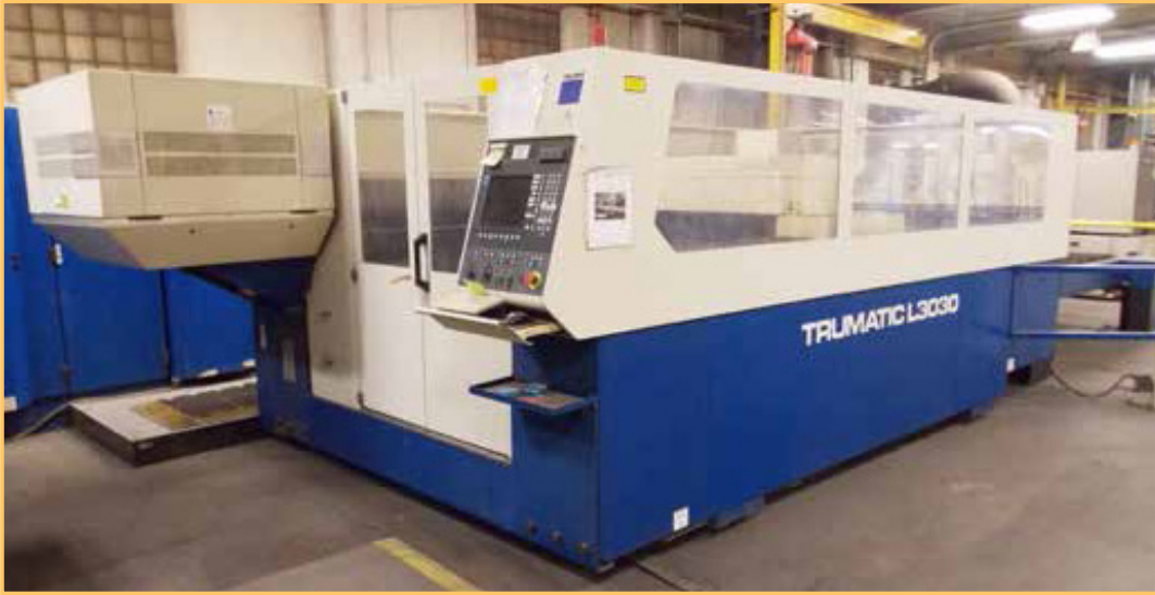
TRUMPF TRUMATIC L3030 5'X10' 4000 WATT CNC LASER CUTTING MACHINE