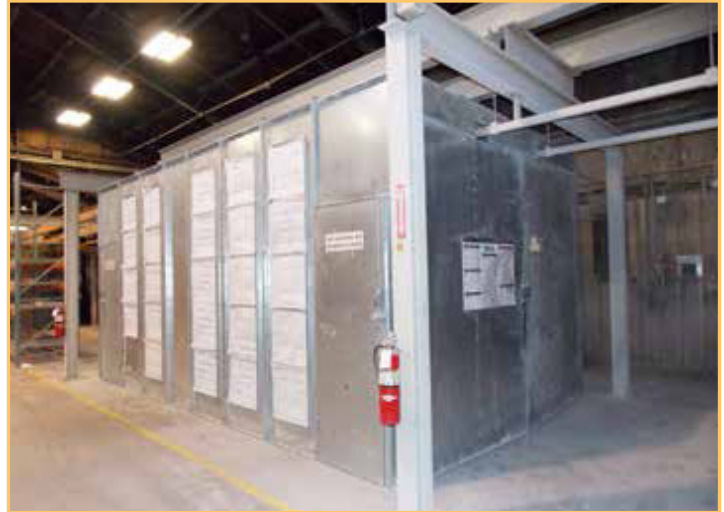
COL-MET GAS FIRED CURING OVEN