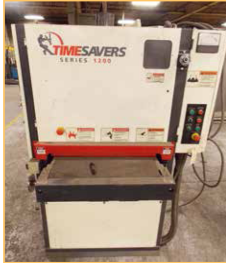
TIMESAVERS WOOD BELT SANDERS