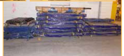
PARTIAL VIEW OF ELEVATOR T-GUIDE RAIL