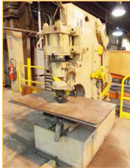
55 TON IRONWORKER