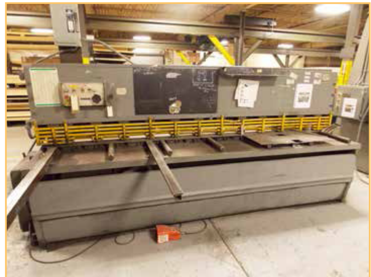
SUMMIT 10' HYDRAULIC SHEAR