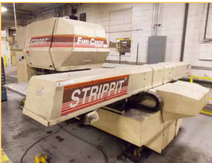
STRIPPIT 30 TON CNC TURRET PUNCH

Wednesday, February 6th, 2013 10:00 am – 4:00 pm Local Time or by appointment.