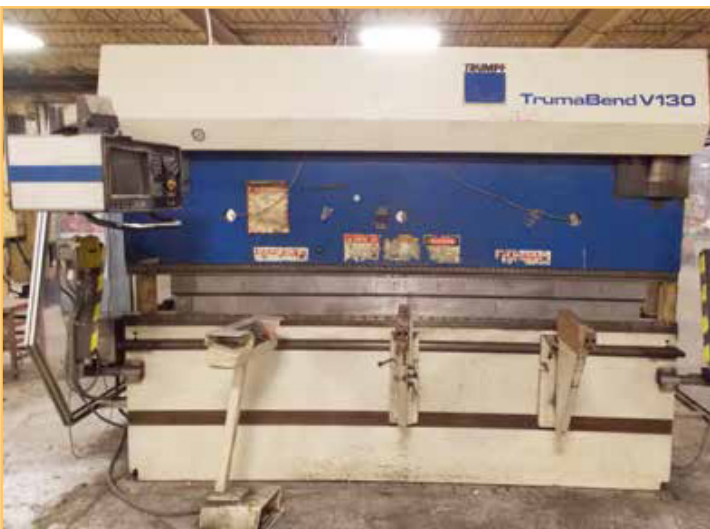
TRUMPF TRUMABEND V130 HYDRAULIC PRESS BRAKE