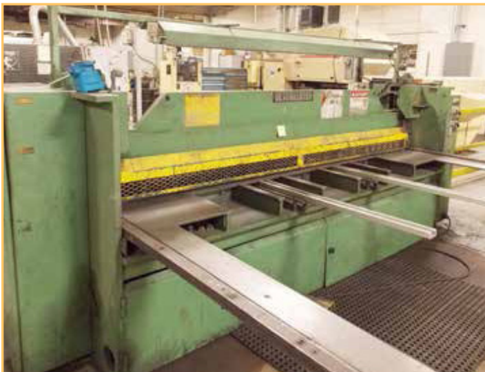
BETEBENDER 10' HYDRAULIC SHEAR