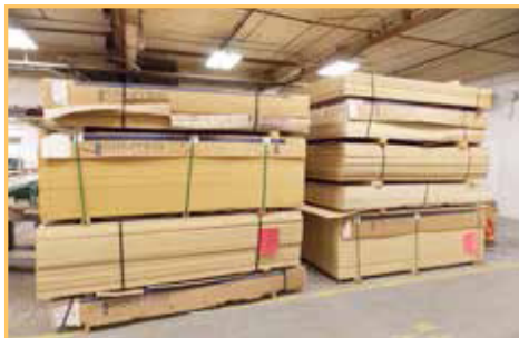
PARTIAL VIEW OF WOOD INVENTORY