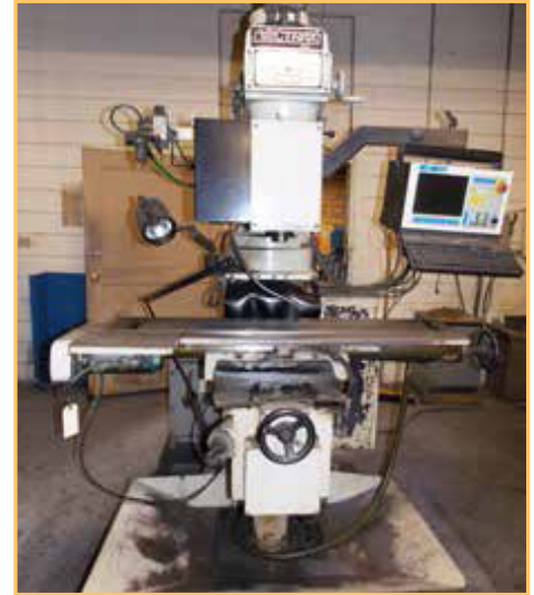
VECTRAX VERTICAL MILLING MACHINES