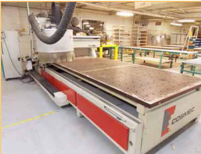
COSMEC CONQUEST 510 5'X10' BRIDGE TYPE CNC ROUTER