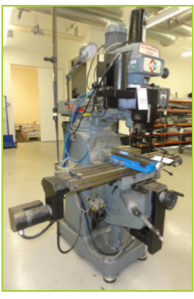
CLAUSING/KONDIA VERTICAL BORING MILL

2 – Haas VF 3 2000 CNC Milling Machine, w/ 32-Tool Holding Carousel, Digital Display w/ Push Pad Controls, Haas Programmable Coolant Dispenser, Screw Chip Extractor, 20-HP Vector Drive, 48 x 18"T-Slot Bed, Kurt 6" Machinist Vise, 5th Axis Hook Up