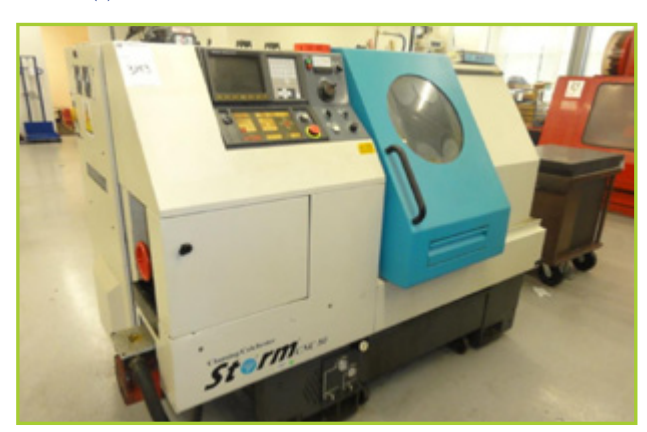
CLAUSING/COLCHESTER STORM 80 CNC SLANT BED LATHE