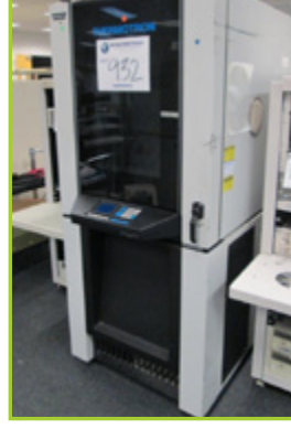
THERMOTRON SE-300-2-2 ENVIRON-MENTAL/TEMP CYCLE CHAMBER