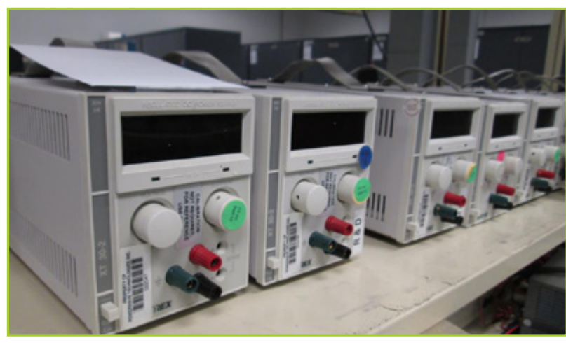
XANTREX XT 30-2 LOT TO (5) INCLUDE DC POWER SUPPLIES

5 - Rhode & Schwartz NRVD Power Meter, 857.8008.02