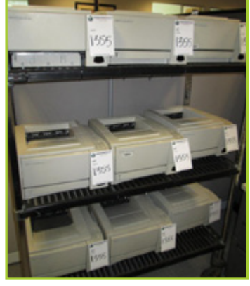
HEWLETT PACKARD 5000N LASERJET PRINTERS HEWLETT PACKARD 2100 LASERJET PRINTERS POLYCOM SOUNDSTATION 2