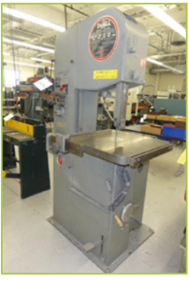
DOALL DBW-15/1612 VERTICAL BAND SAW