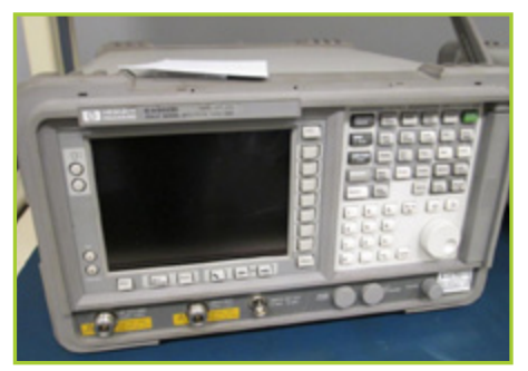
HEWLETT PACKARD E4404B ESA-E SPECTRUM ANALYZER