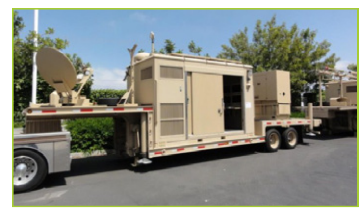
MILITARY GRADE RAPID MOBIL CELLPHONE TOWER

1 – 2010 Rapid Mobile Cell Tower Deployment Trailer, Commercial Grade, Trailer Type Fox, Model 828FH-9 Gooseneck Trailer, 2-Axles, w/ Hydraulic Leveling Pads, Cell Tower Deployment Unit Contains (1) Whisperwatt Diesel Generator, Model DB10071, Single Phase, Rated Output 56kW, Rated Voltage 120/240V, generator Engine Type Model ISUZU4JJ1X, 4-Cylinder 85-HP, w/ Basler Digital Genset Controller w/ Push Pad Controls, Enclosure, (1) 30m Telescoping Cellphone Tower, (1) Cellphone Cable Reel w/ Enclosure, (1) 3-HP Hydraulic Pump w/ 20-Gallon Cap. Hydraulic Fluid Reservoir, Enclosure, (2) Electrical Control Boxes, VIN 5DEFH2825B1004781