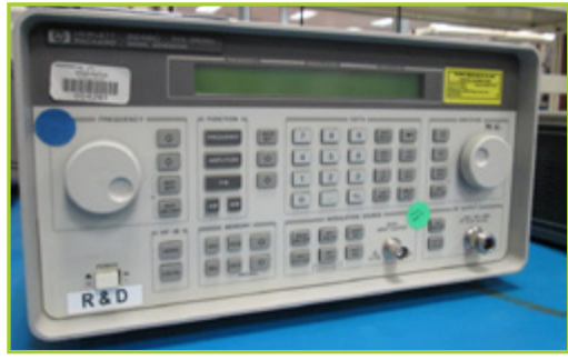
HEWLETT PACKARD 8648D SIGNAL GENERATOR