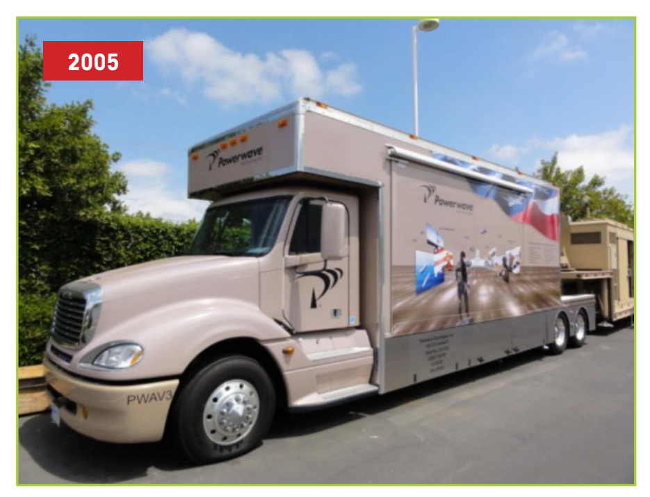
FREIGHTLINER 2005 DIESEL TRUCK, W/ DETROIT DIESEL SERIES 60 ENGINE