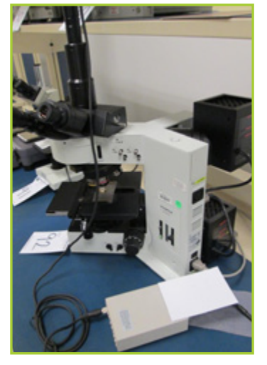
OLYMPUS BX60F5 MICROSCOPE WITH (2) WH10X/22 EYEPIECES

Large Quantities of Microscopes from Olympus, Meji, Unitron, Leica, Vision Engineering, Zeiss, and others. Go Online For Complete Asset List.