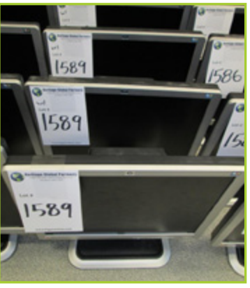
HEWLETT PACKARD L1710 17" FLAT PANEL