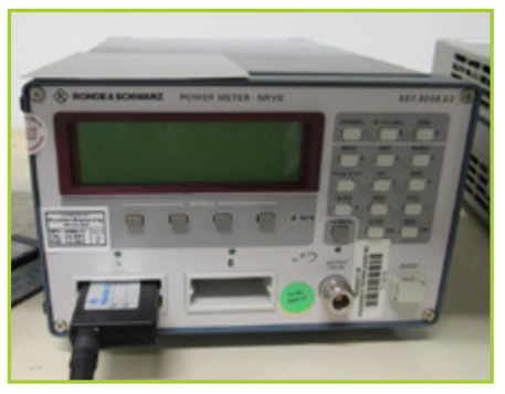
RHODE & SCHWARTZ NRVD POWER METER