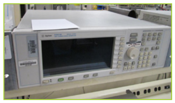
AGILENT N5182A MXG VECTOR SIGNAL GENERATOR

Large Quantities of High End Test Equipment consisting of Network Analyzers, Spectrum Analyzers, Power Meters, Power Sources, Signal Generators from HP, Agilent, Tektronix, Yokogawa, Rhode & Schwarts, Giga-tronics, IFR, and others.