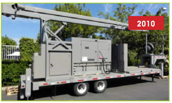
2010 MILITARY GRADE RAPID MOBIL CELLPHONE TOWER