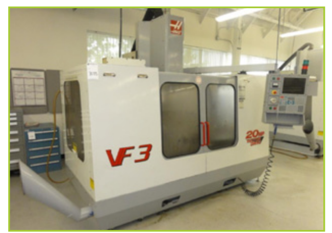
HAAS VF 3 2000 CNC MILLING MACHINE