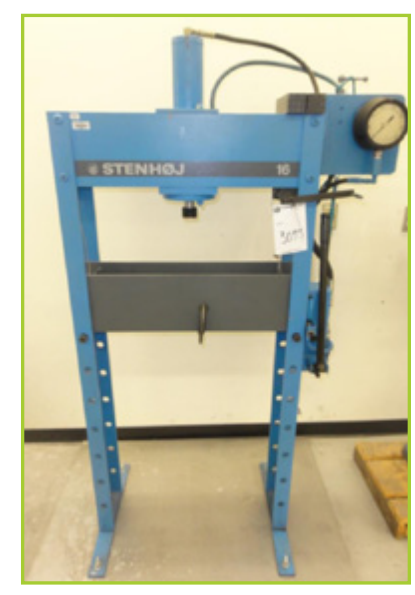
STENHOJ HYDRAULIC H-FRAME PRESS