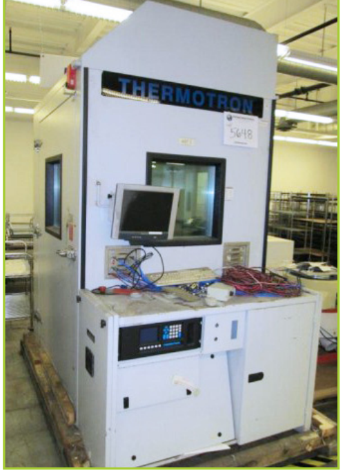
THERMOTRON AST-35-LN2 ACCELERATED TEST SET SYSTEM