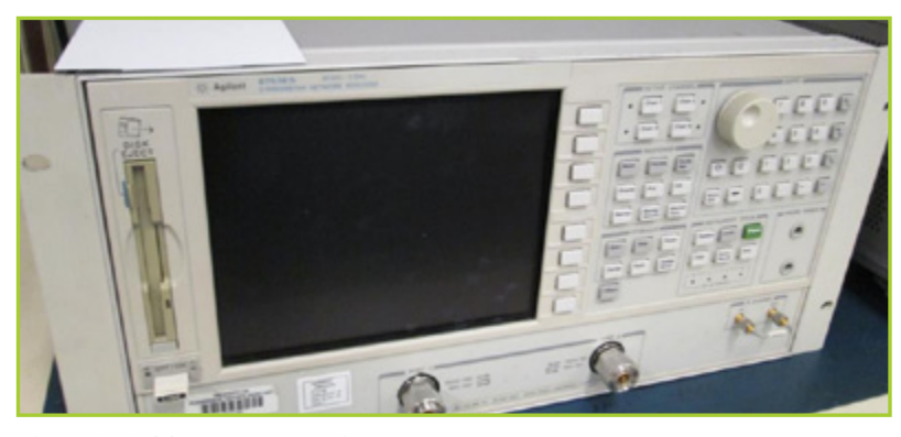
AGILENT 8753ES S-PARAMETER NETWORK ANALYZER

Multi-Lot – Xantrex XT 30-2 Lot to (5) include DC Power Supplies