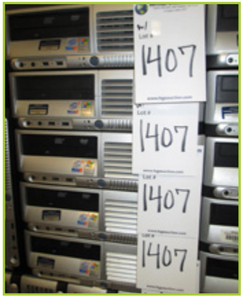
HEWLETT PACKARD DC7100 SFF LOT

Lot - (1) Epson EX71 (3LCD Multimedia Projector, Case, Native WXGA Resolution 16:10 up to 1680 x 1250, 2500 Lumens Color Light Output, 2500 Lumens White Light Output), (1) Hitachi CP-S225 Multimedia Mobile LCD Projector (Case, 800x600 1100 Lumens, 300:1)