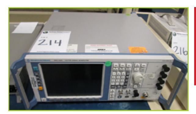
RHODE & SCHWARTZ SMU 200A VECTOR SIGNAL GENERATOR