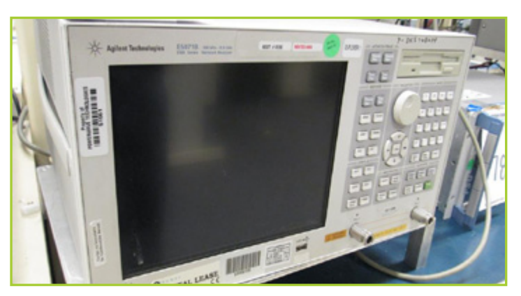
AGILENT E5071B ENA SERIES NETWORK ANALYZER

Large Quantity of Receivers, Antennas, Repeaters, Amplifiers, and Much More. Go Online For Complete Asset List.