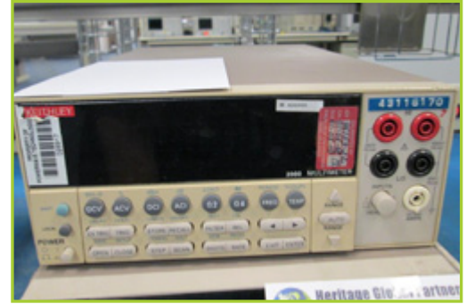
KEITHLEY 2000 MULTIMETER