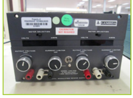
LAMBDA LGD-422 DUAL REGULATED POWER SUPPLY