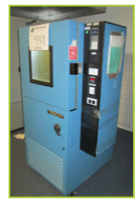
THERMOTRON S-4-SL ENVIRONMENTAL TEST CHAMBER