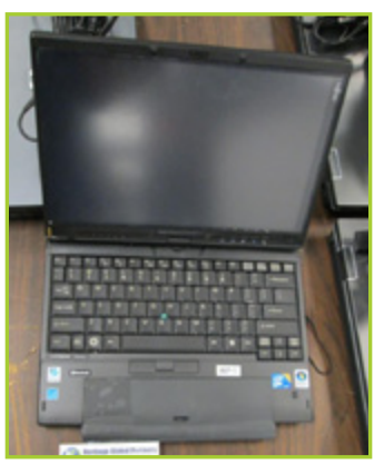
FUJITSU LIFEBOOK T2020 LAPTOP