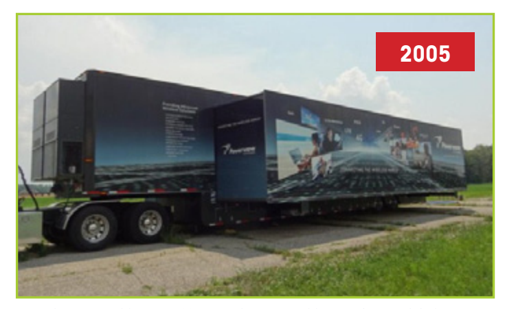
KENTUCKY TRAILER COMPANY 2005 KENTUCKY TRAILER COMPANY SPANDING SHOW / EXPOSITION TRAILER W/ DUAL EXPANDING SIDES