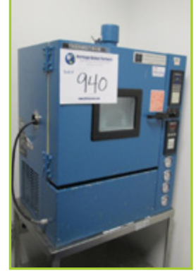
THERMOTRON S-1.2C ENVIRONMENTAL TEST CHAMBER