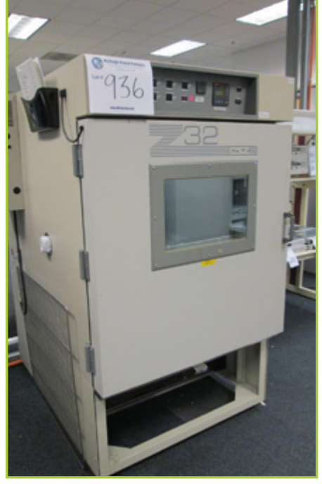
CINCINNATI ZH-32-3-3-H/AC ENVIRONMENTAL TEST CHAMBER