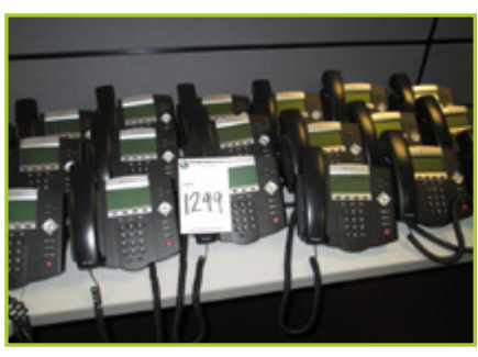
ASSORTED POLYCOM PHONES