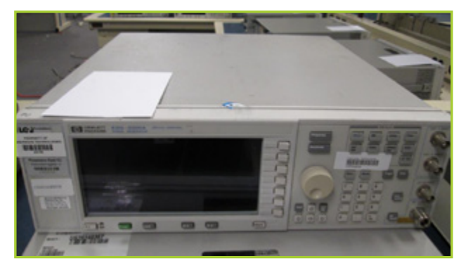
HEWLETT PACKARD ESG 2000A SIGNAL GENERATOR