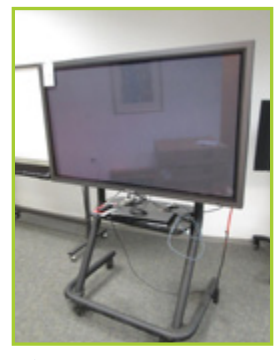
PIONEER PDP-614MX 61" HDTV