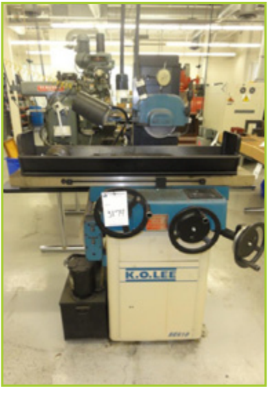
K.O. LEE SE618 SURFACE GRINDER

Complete Machine Shop with Tooling from Bridgeport, Mori Seiki, Okuma, Mazak, and others.