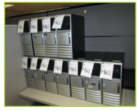
HEWLETT PACKARD DC7600 MINITOWER PC'S