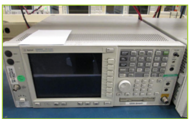
AGILENT E4445A PSA SERIES SPECTRUM ANALYZER