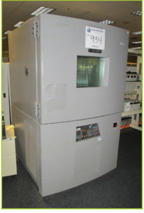
TEST EQUITY 1020C TEMPERATURE CHAMBER