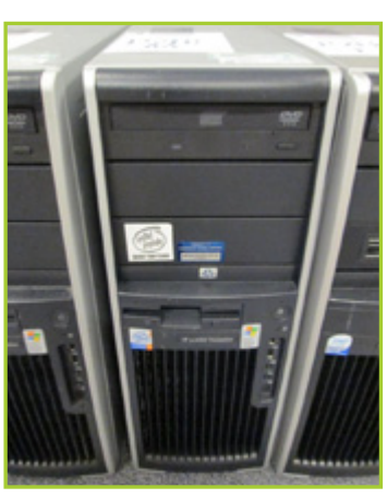
HEWLETT PACKARD XW4400 WORKSTATION