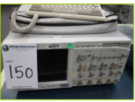
HEWLETT PACKARD E4404B ESA-E SPECTRUM ANALYZER