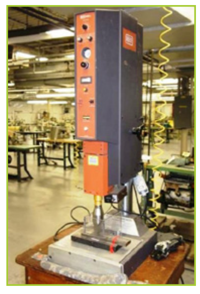
REECE 8400 ULTRASONIC WELDING MACHINE