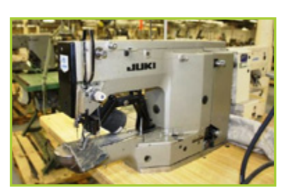
SINGLE NEEDLE CYLINDER ARM BAR TACKER