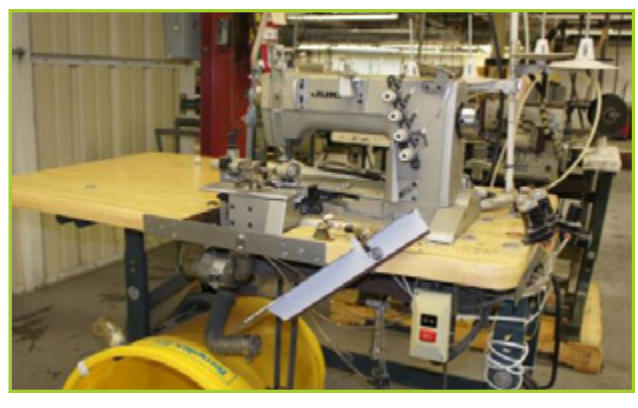
JUKI MFB-2600 CLASS HHM DOUBLE NEEDLE CHAINSTITCH WITH PULLER