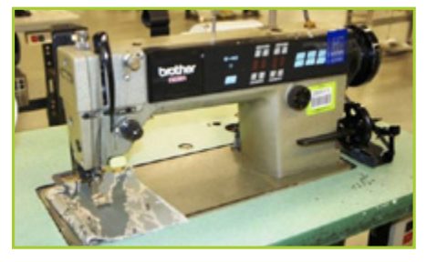
BROTHER DB2-B737-413 MARK II SINGLE NEEDLE LOCKSTITCH