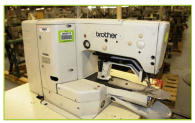
BROTHER LK3-B430A-4 HEAVY DUTY TACKER