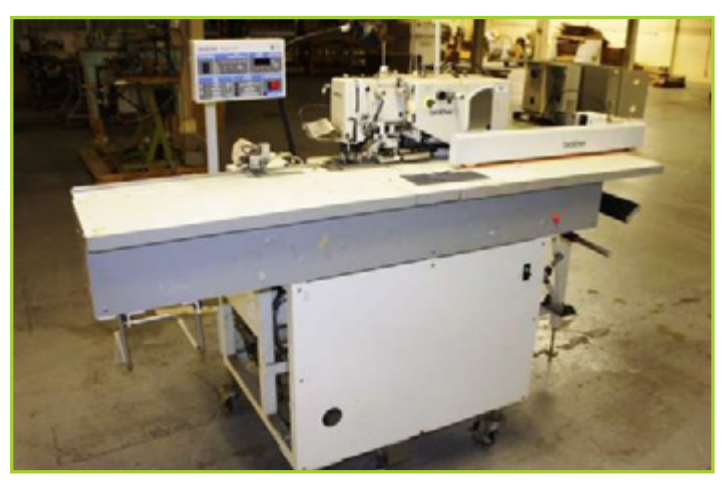
BROTHER BAS-510 AUTOMATIC BUTTONHOLE MACHINE W/ INDEXER

2 – Kansai Special DBF-1412P 12 Needle Waist Banding Sewing Machine