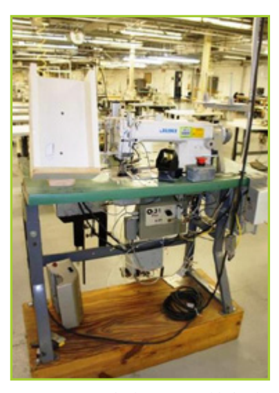
JUKI DDL-5550-7 SINGLE NEEDLE LOCKSTITCH W/ FOOT LIFTER