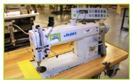
JUKI DLN-5410N-7 WB SINGLE NEEDLE LOCKSTITCH