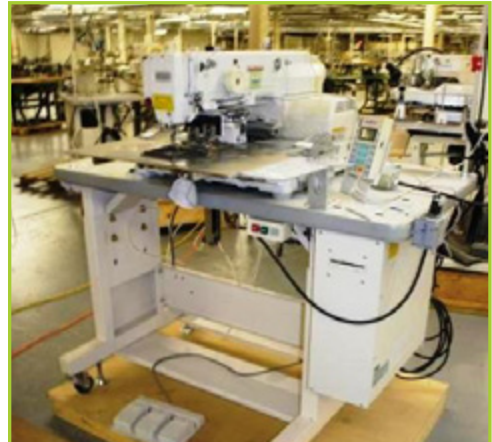
SUNSTAR SPS/B-1811-HS-22 ELECTRONIC PATTERN TACKER