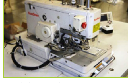
ELECTRONIC FLAT BED TACKER FOR EYELET