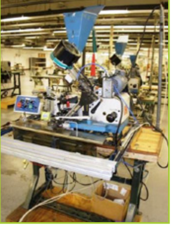
JUKI MB-373 ZO32 BUTTON SEWER