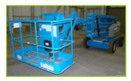
GENIE Z-45/25J AERIAL LIFT, 500LB CAP