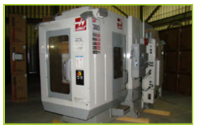
HAAS EC300 CNC HORIZONTAL MACHINING CENTER