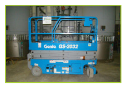
GENIE GS-2032 ELECTRIC MAN LIFT