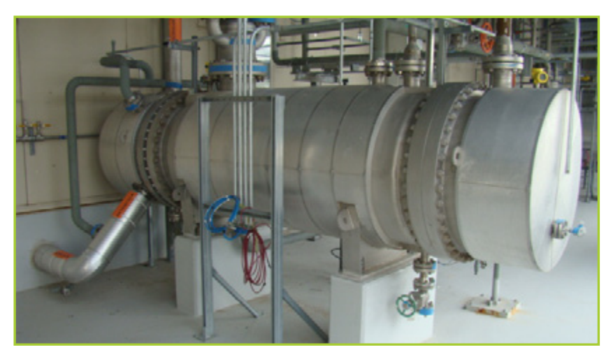
G & R VAPOR CONSOLE