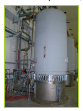
GEC HER 12 CHEMICAL VAPOR DEPOSITION REACTOR, 24-ROD