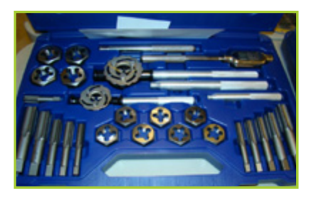
IRWIN HANSON TAP & HEXAGON DIE MASTER SET