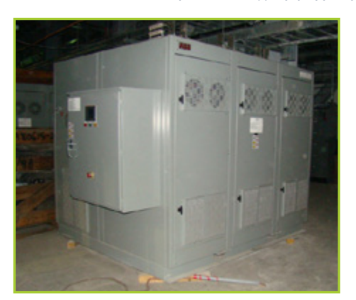
ABB THYRISTOR CONTROLLED POWER SUPPLY