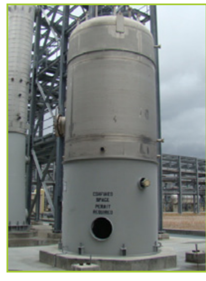
HARRIS THERMAL TRANSFER PRODUCTS MB3630 STORAGE TANK, 10'X 20'