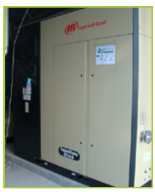
INGERSOLL-RAND IRN150H-OF AIR COMPRESSOR