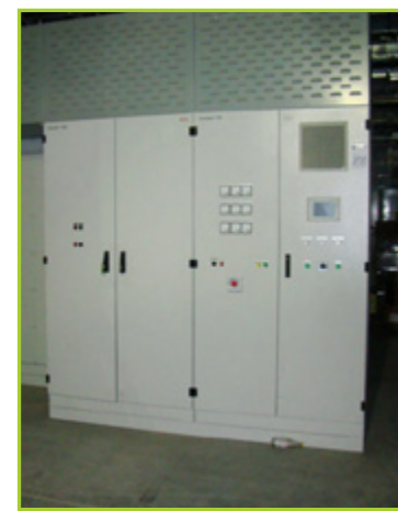
AEG THYROBOX THYRISTOR POWER CONTROLLER