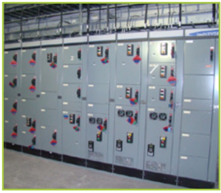
ALLEN-BRADLEY CENTERLINE 2100 MOTOR CONTROL CENTER