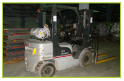
NISSAN MU1F2A25LV FORK TRUCK