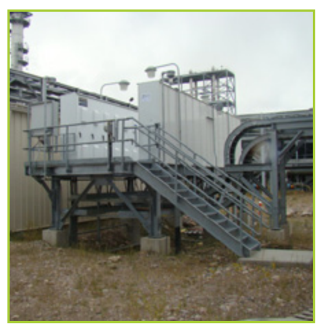
ALLEN-BRADLEY CENTERLINE 2100 MOTOR CONTROL CENTER

Large Quantities of Raw Materials Including: Cabling, Wiring, Scrap Metal and More Available Online.