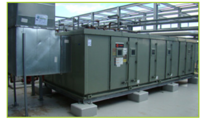
TRANE T-SERIES CLIMATE CHANGER AIR HANDLER