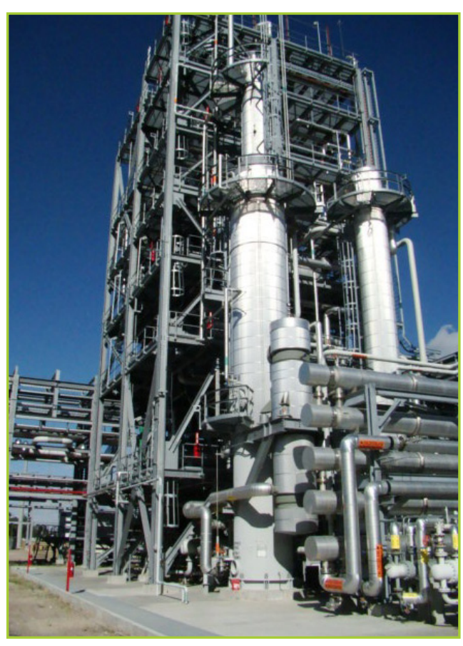
EATON DISTILLATION COLUMN, 7' DIA AT BOTTOM, 3' DIA AT TOP, 17' 6"TOP HEIGHT

Large Quantity of Heat Exchangers and Tanks from: Armstrong, Batiisti, Fabsco, Flowserv, Harris Thermal Transfer Products, Perry, Steeltek, Thompson, and Others.