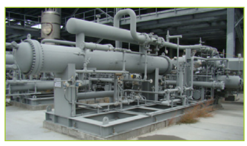
GEA FES REFRIGERATION SKID

Large Quantities of Power Distribution Equipment and Electrical Distribution Panels, from: ABB, General Electric, Siemens, and Others.