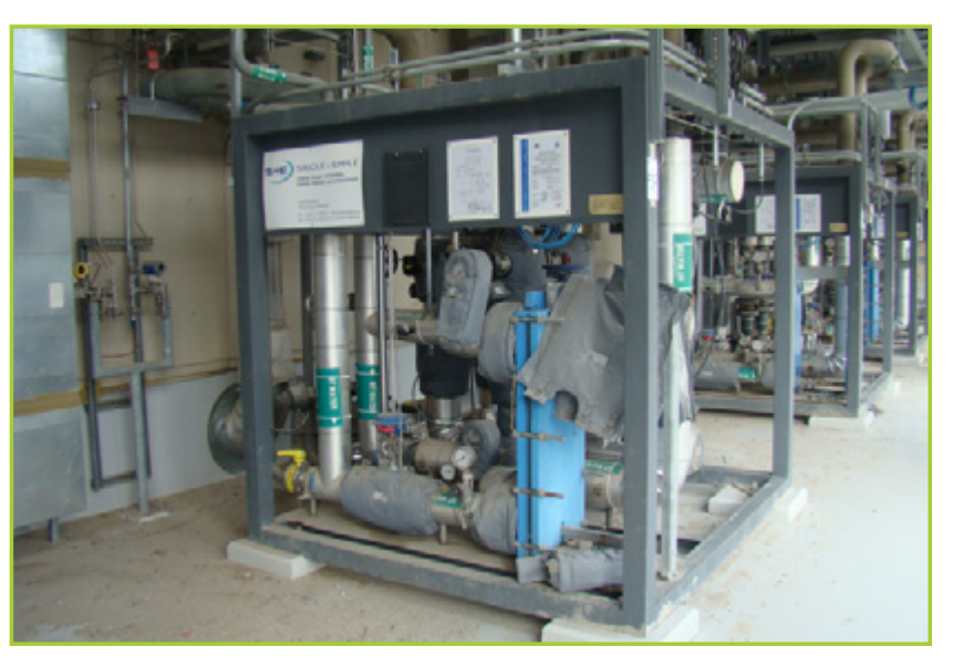
LIBIG HEAT EXCHANGER