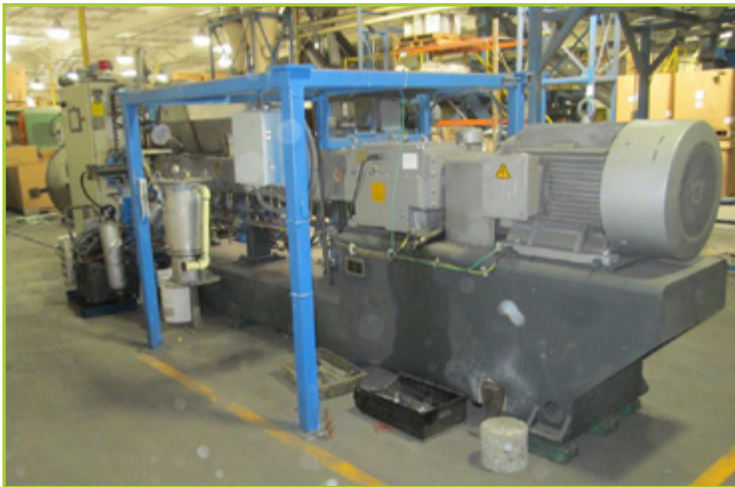
COPERION-KEYA MACHINE CO. LTD. STS-50 TWIN SCREW PLASTIC EXTRUDER

1 – Custom Plastic Extruder Machine. Overall Footprint 4'Lx3'Wx6.5'H