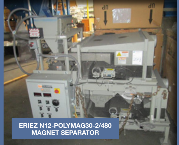
ERIEZ N12-POLYMAG30-2/480 MAGNET SEPARATOR

Coperion 50MM Twin Screw Compounding Line. STS 50. (2006) Approximately 40:1 L/D. Gala Underwater Pelletizing Line. • 4,000 lb/hr Recycled Plastics Wash Line. Zerma Wet Granulator, 75kw drive. (7) Gala Spin Dryers 30-16. Sweco Vibratory Screeners. Agitated Tanks. Eriez Metal Separators. • Dry Granulation and Separation Line. Holzmag Single Rodader Shredder, 52", 100hp. Entolater Granulator, 200hp. Rotex vibratory screener. (2) Kice Air Classifier. • BOY 50 M Injection Molding Machine • Gardner Denver Air Compressor • Gloucester Engineering Blender • Krebs Cyclone • CPU-MOD/T Waste Treatment System • Machine Tools • Rolling Stock • Spare Parts • and Much Much More!