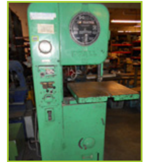
ASSORTED MACHINE TOOLS