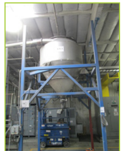
HOPPER WITH STEEL FRAME AND GATE VALVE