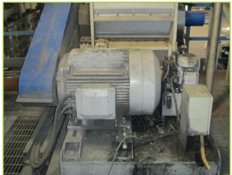
ZERMA GSH600/800 GRANULATOR, 3 PH MOTOR, 460V, 60 HZ