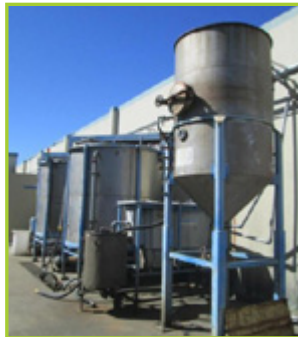
WASTE WATER MANAGEMENT SYSTEM