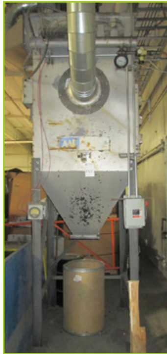
AMERICAN AIR FILTER FABRI-PULSE BAGHOUSE