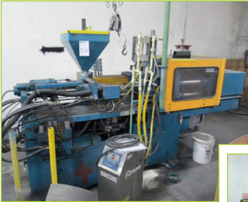
BOY MACHINES INC. 50M HORIZONTAL INJECTION MOLDER