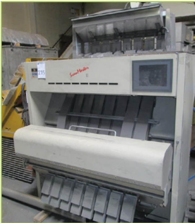
SATAKE SMII-8201EP ESM COLOUR SORTER