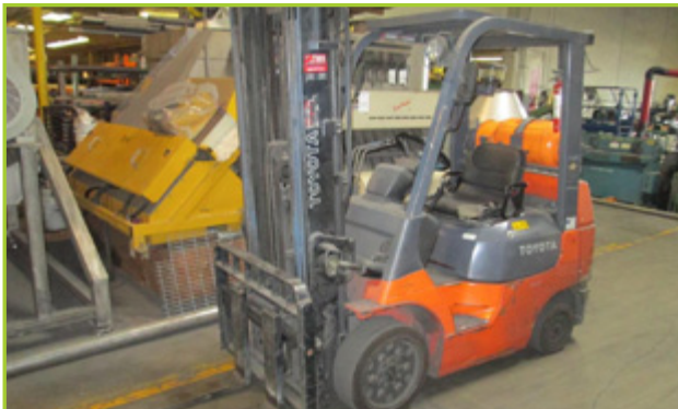
TOYOTA 75GU25 FORKLIFT, 3750 LIFTING CAPACITY, 189 LIFT HEIGHT