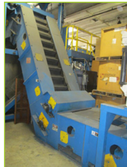
HUSTLER CONVEYOR, 36" WIDE X 27'-5 7/8" LONG FLEXWALL CONVEYOR

1 – Kenmore No.5 Freezer (Chest Type ; Dim 24"Lx22"Wx34"H)