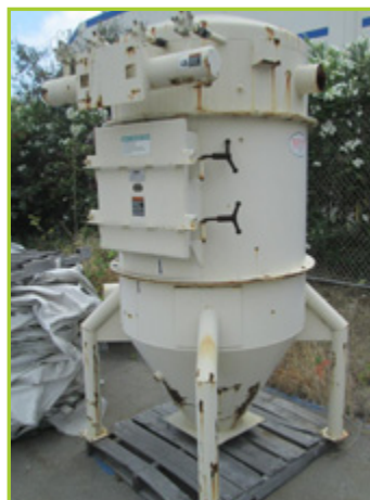
MAC 19AVRC14 PROCESS AIR-VENT FILTER