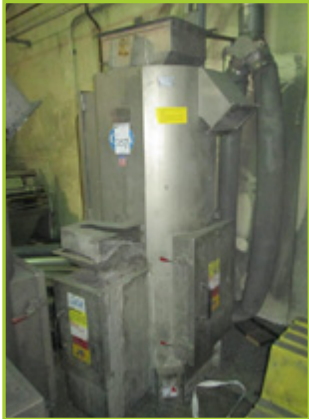
GALA 3016 BF-RD SPIN DRYER