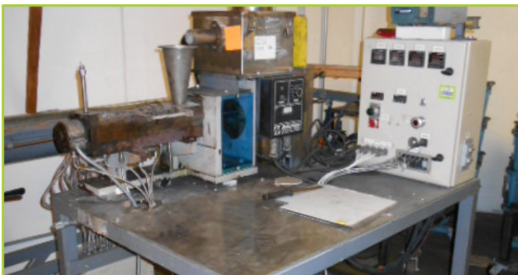
CUSTOM PLASTIC EXTRUDER MACHINE