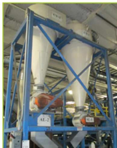
KICE ROTARY AIR LOCK AND HIGH EFFICIENCY CYCLONE COLLECTORS