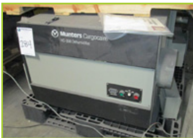
MUNTERS CARGOCAIRE HC-300 DEHUMIDIFIER