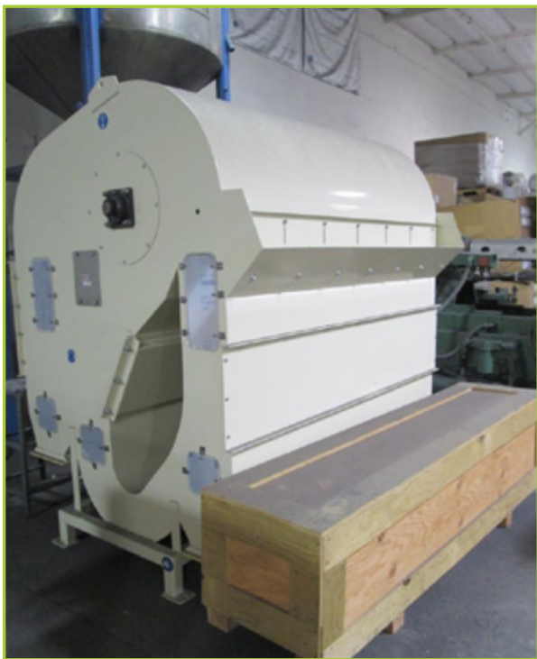
MBA POLYMERS ENCLOSED RETURN AIR PNEUMATIC SEPARATOR