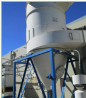
CARTER-DAY RELIANCE ARM-ROTATOR