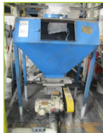
SILO CHARGE STATION