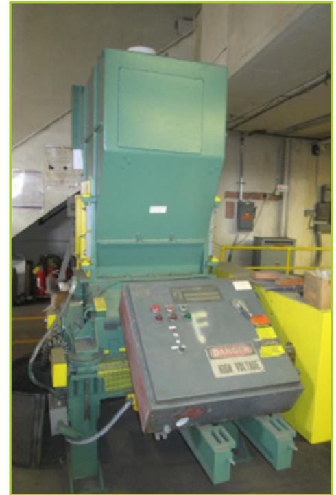
GLOUCESTER ENGINEERING CO. INC. 1428 GRANULATOR