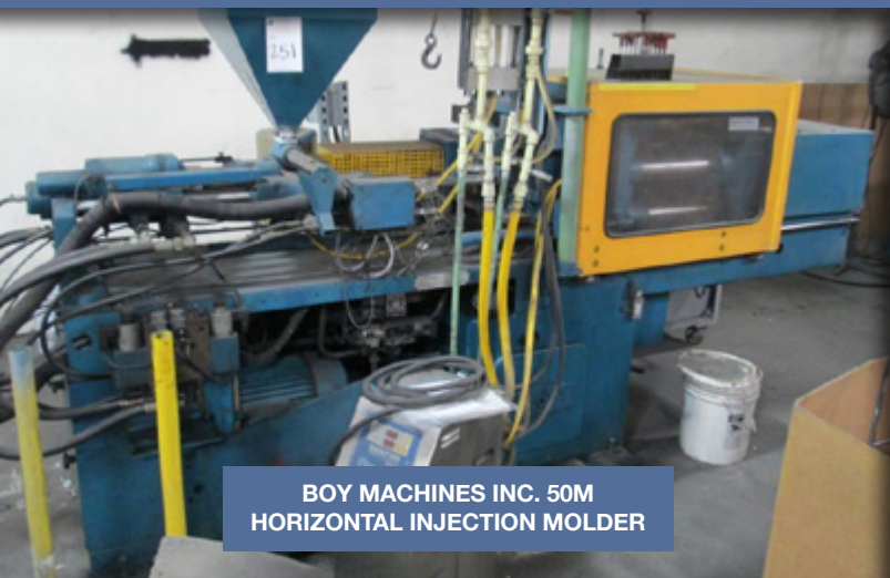
BOY MACHINES INC. 50M HORIZONTAL INJECTION MOLDER

Sale Featuring: Process Lines, Extrusion Lines, Machine Tools, Spare Parts, Rolling Stock, Tanks, Facility Support, and More!