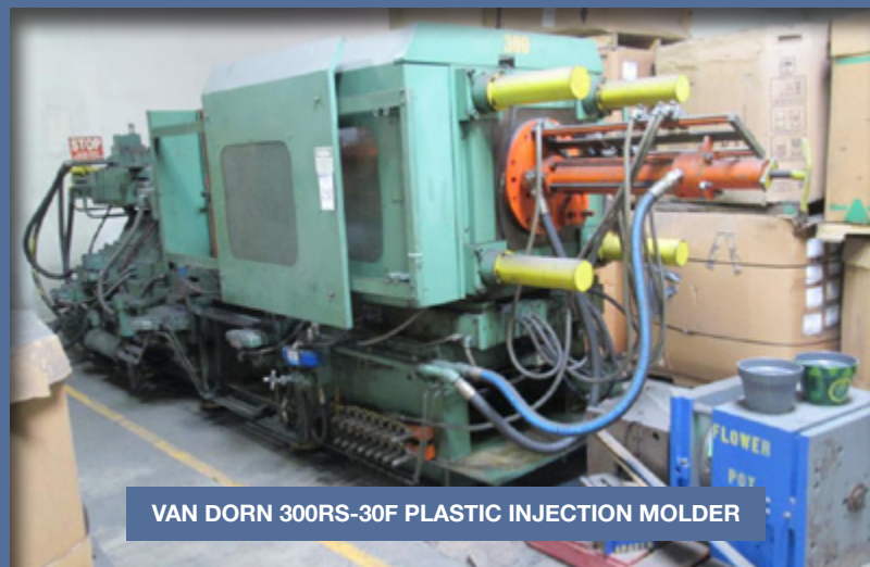
VAN DORN 300RS-30F PLASTIC INJECTION MOLDER