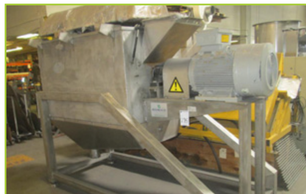
HERMION BV TWISTER 5500 CENTRIFUGAL SPINNER