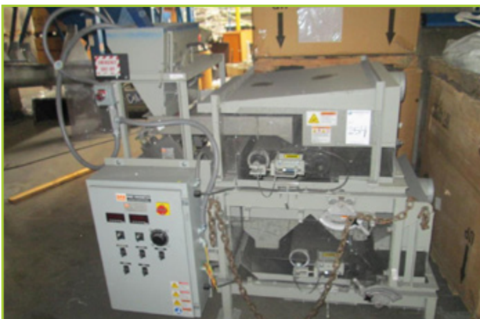
ERIEZ N12-POLYMAG30-2/480 MAGNET SEPARATOR

Motors, Pumps, Hoppers, Rolling Stock, Spare Parts and More Available Online @ www.hgpauction.com