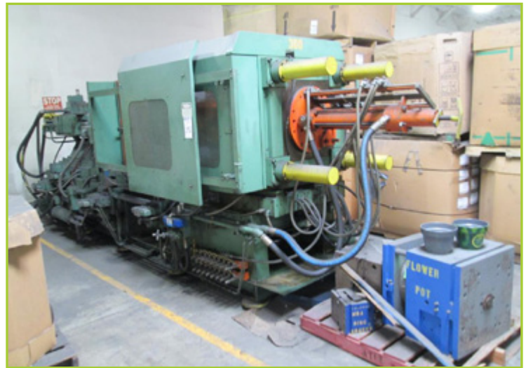
VAN DORN 300RS-30F PLASTIC INJECTION MOLDER