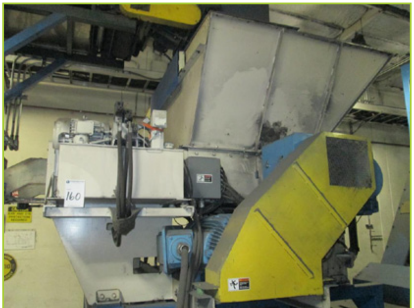
HOLZMAG (METSO) MULTIROTOR MK-300/1400 SINGLE-SHAFT ROTARY SHREDDER