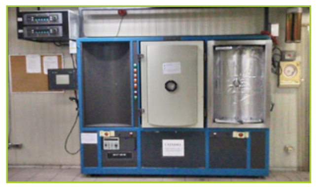
COMPU-VAC SYSTEMS M-C-28 SMALL BATCH FAST CYCLE SPUTTERING VACUUM COATING SYSTEM (METALIZING)