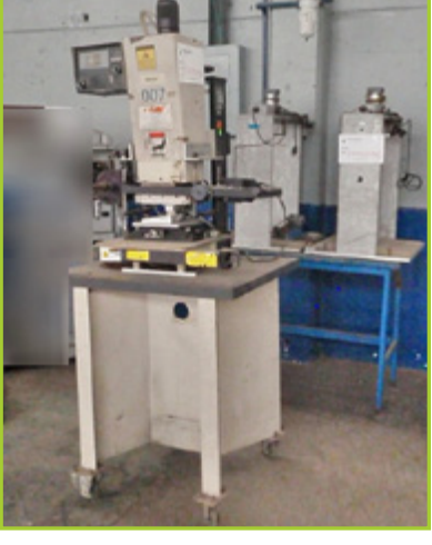
KENSOL FRANKLIN KF1000A HOT STAMPING MACHINE