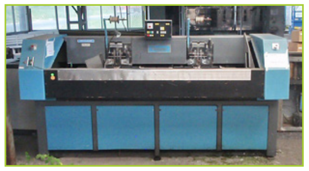
UNIVERSAL INSTRUMENTS CORP AXIAL COMPONENT INSERTION MACHINE