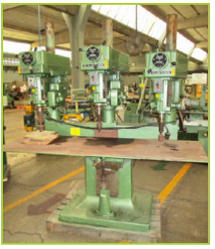
CLAUSING TRIPLE-STATION/5285 VERTICAL DRILL PRESS

2 – Artos CS26A High Speed Linear Wire Feed Cutting & Stripping Machine Lot – (2 Total) Custom Semi-Automatic Dual-Unit Pneumatic Wire End Cutter & Clincher Stations