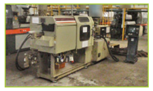
NEGRI BOSSI [NB90 SERIES-19 /NB90 SERIES-SM290]