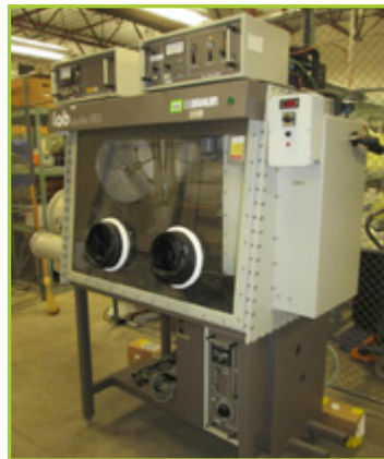
M BRAUN LABMASTER 130