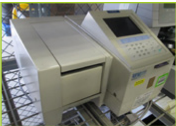
SHIMADZU MINI 1240 UV/VIS SPECTROPHOTOMETER