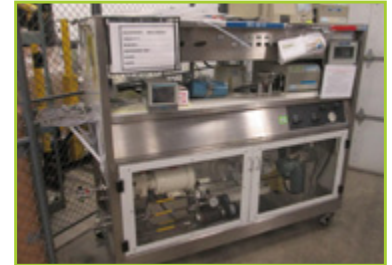
HPLC ELECTRONIC CONTROL CENTER