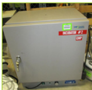
VWR 1510E INCUBATOR