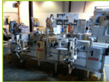
ACCRAPLY LABELING MACHINE