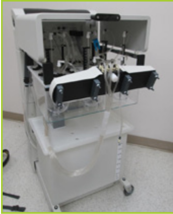
HVI 25-710-130 DISSOLUTION TESTER