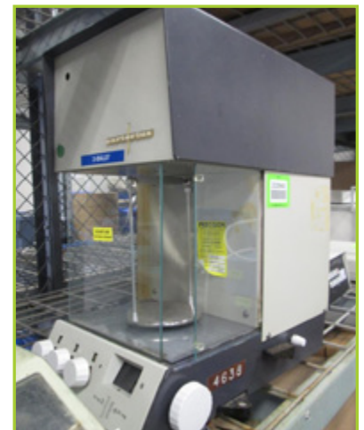
SARTORIUS PRECISION BALANCE TYPE 2602