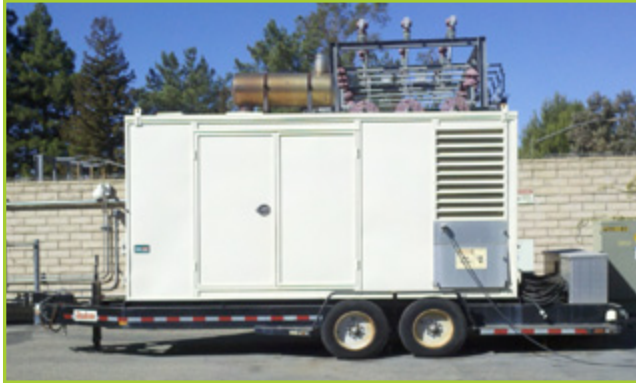
1991 MOBILE CAT MODEL SR4-400KW GENERATOR, 388HRS OF OPERATION

PHARMACEUTICAL SECTOR SALE DECEMBER 2013