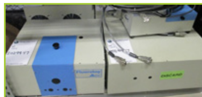
MICROWELL PLATE READER MICRO MAX 384