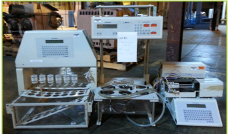
VANKEL LOT INCLUDES (2) DISSOLUTION SYSTEMS