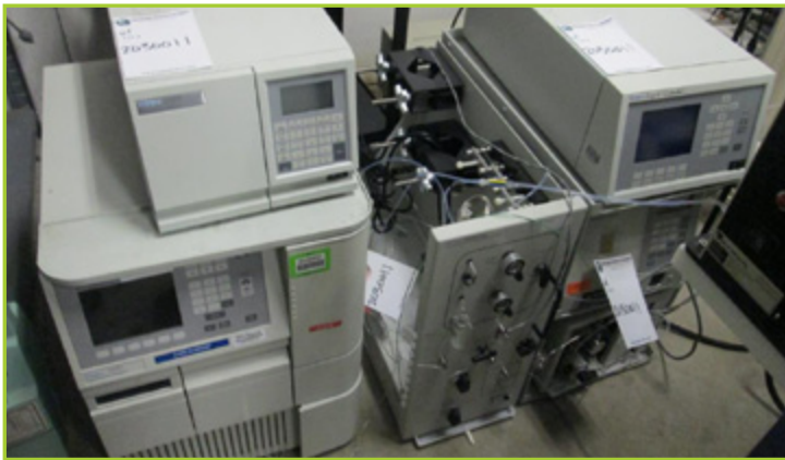
WATERS HPLC LOT