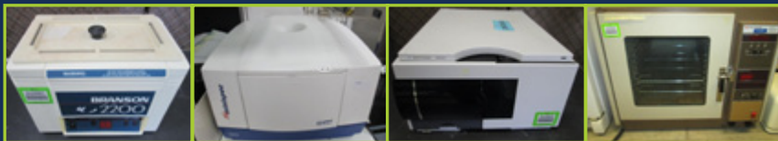
Scan this QR Code with your smartphone for More Information.