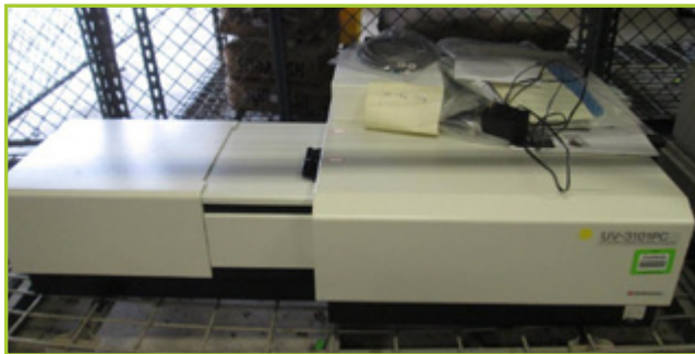
SHIMADZU UV-3101 PC UV-VIS-NFR SCANNING SPECTROPHOTOMETER