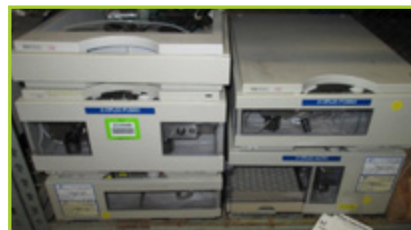
AGILENT 1100 SERIES HPLC