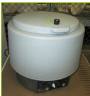
FISHER SCIENTIFIC 225 CENTRIFUG