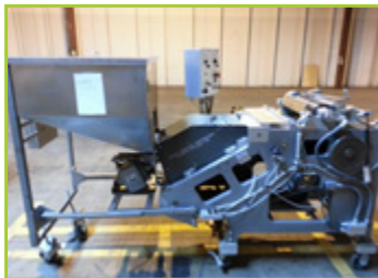
ACKLEY TABLET PRINTING MACHINE