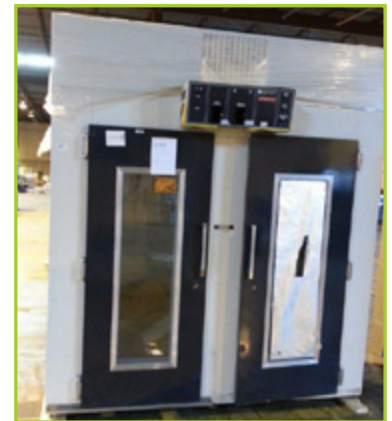
LAB LINE STABILITY CHAMBER (DOUBLE DOOR)