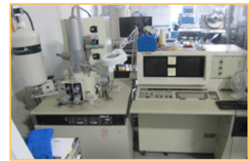
HITACHI S-4000 SCANNING ELECTRON MICROSCOPE