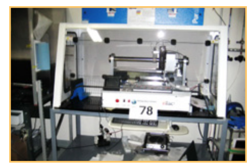
NTACT R-RAD EXTRUSION DEPOSITION SYSTEM / SLOT COATER