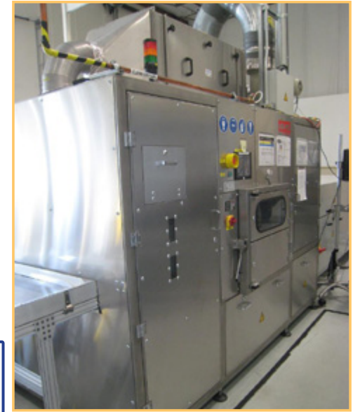
ALL4-PCB KU 455-CDCI CDCI2 SPRAY COATER

BUYER'S PREMIUM: 15% cash buyers; 18% for credit card purchasers (Refer to Term 7 in the Auction Terms and Conditions for details) SALE WILL BE CONDUCTED IN ENGLISH AND WILL ACCEPT US CURRENCY ONLY