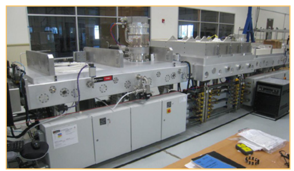
GENERAL PLASMA BACK CONTACT SPUTTER SPUTTERING SYSTEM