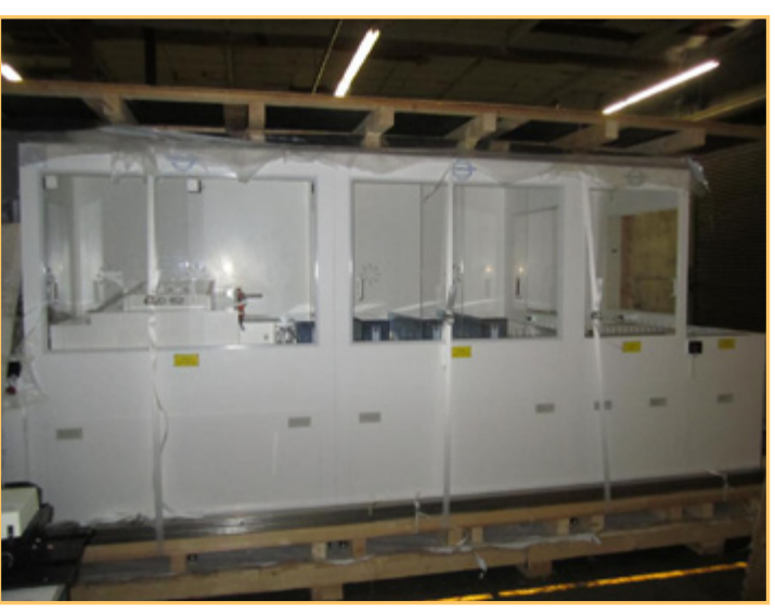
JENOPTIK VOTAN SOLAS MULTI AUTOMATED P1 - P4 LASER ABLATION, SCRIBE, AND EDGE MACHINE RAMGRABER GMBH INLINE STAR MODEL 2009 POLYPRO (LINE ETCH) 5 MODULE SYSTEM