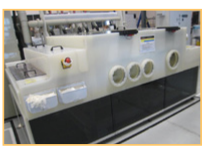
ALL4-PCB EDTA ETCH WET PV WET PROCESS STATION