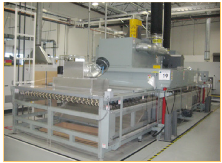
INFRARED HEATING TECHNOLOGIES, INC. (IHT) ITICBO1Z-110KVA-ASP-01 CDTE DRYER.