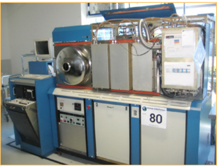
MATERIAL RESEARCH COMPANY 603 VACUUM COATER SPUTTER SYSTEM