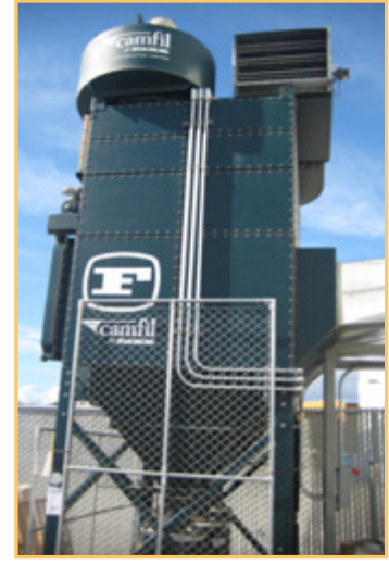
FARR CAMFIL GOLD SERIES DUST COLLECTION