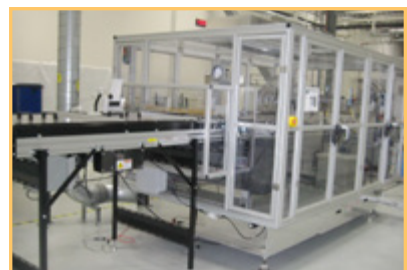
NTACT CDTE SLOT COATER, DIE COATER