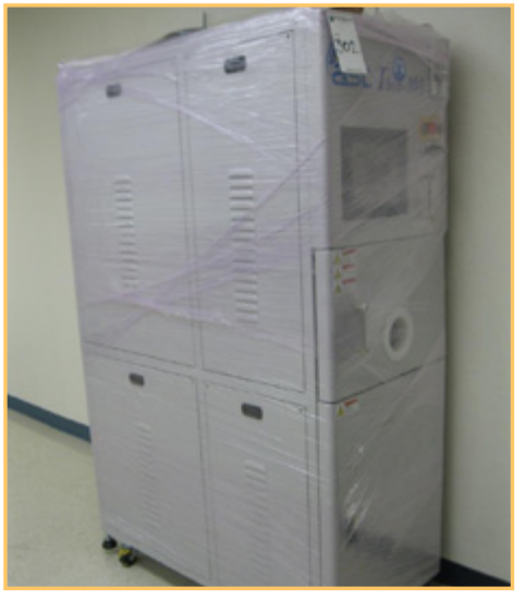
ADVANCED SYSTEM TECHNOLOGY TBON-100 BONDER, NEW