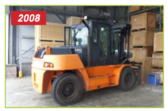
DOOSAN 130 - DB1305-5 HEAVY DUTY FORK LIFT YARD TRUCK

HAND TOOLS INCLUDING – ASSEMBLIES, INSERTION & EXTRACTION TOOLS, PNEUMATIC TOOLS, MICROMETERS AND MORE! MACHINE SHOP FURNISHINGS – TOOLING STORAGE, SURFACE TABLES, STORAGE BINS, CHAIRS, SAFETY ACCESS STEPS AND MORE! ALSO – GAUGES, STANDS, METERS, TESTERS, VALVES, PUMPS, PRESSES, AIR COMPRESSORS, SCALES, CRANES, WELDING AND MORE!