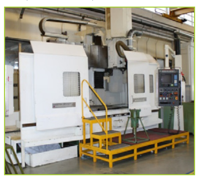
WEBSTER & BENNETT R/S SERIES 1600MM RAM TYPE CNC VERTICAL BORING & GRINDING MACHINE

Vacublast International Special Auto Shot Peener Robotic Programmable Media Dry Shot Peen Blast System Comprising 4200mm x 3500mm x 2850mm Walk In Chamber with Double Door Entry & Internal Multi Axis ABB Robot with 2 x Heads, 1 x Rotary Table, Filtration, Manual Blast Option, 27kva, 380v, 50Hz, serial no. 2043-00-00, Operators Control Console with Schneifder Magelis Operators Screen, Operators Pendant Control, ABB Robot with Control & Pendant (Calibrated to July 2014), Model IRB3000/M91A, 3 x 415v, 50/60Hz, 3.1kva, Ref. R241.3153-001, 2 x Foot Controls, Peen recovery & Recirculation & Extraction System, with Access Steps, Donaldson Tornt Model 3DF12-R 380v Freestanding Dust Collection Unit, 2900 rpm, serial no. CMP12063, Spares & Accessories.