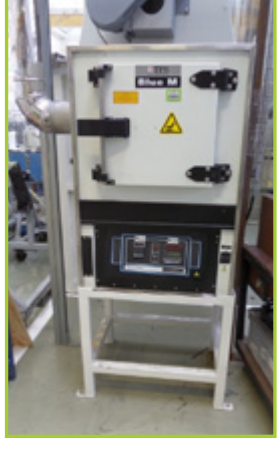
BLUE M/TPS DC-146-NY-UP550 ELECTRIC INDUSTRIAL OVEN