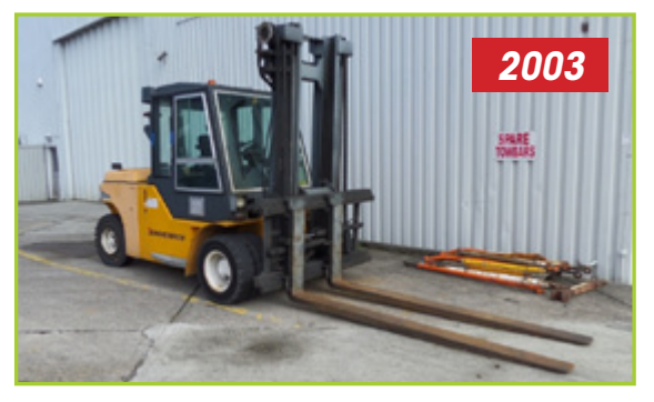
JUNGHEINRICH TFG90/DFG-90DK LPG FORK LIFT TRUCK, 2003