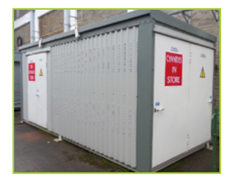
FREESTANDING RELOCATABLE CHEMICAL STORES