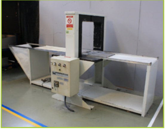
MAGNAFLUX 3B2824/12T DEMAGNETISER UNIT