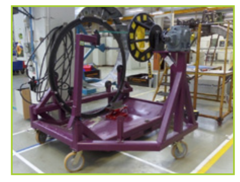
MOBILE STEEL ENGINE STAND