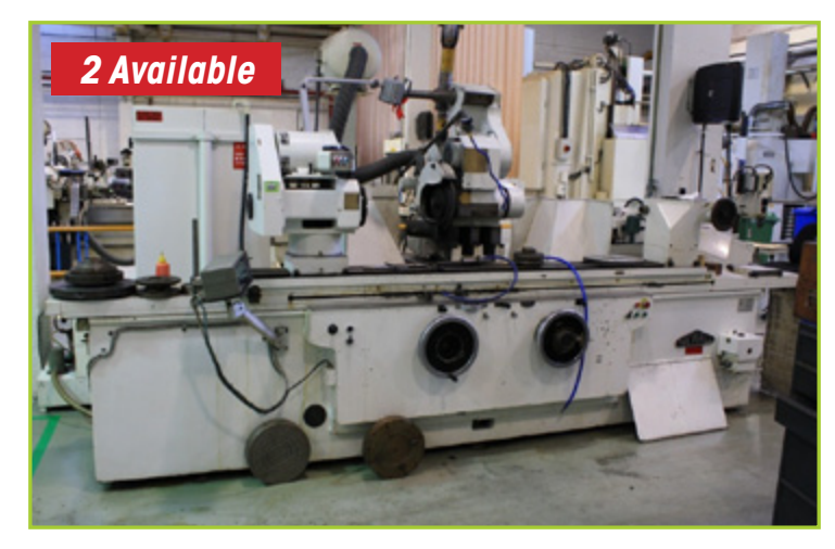
NEWALL SEMI AUTOMATIC CYLINDRICAL & INTERNAL GRINDER