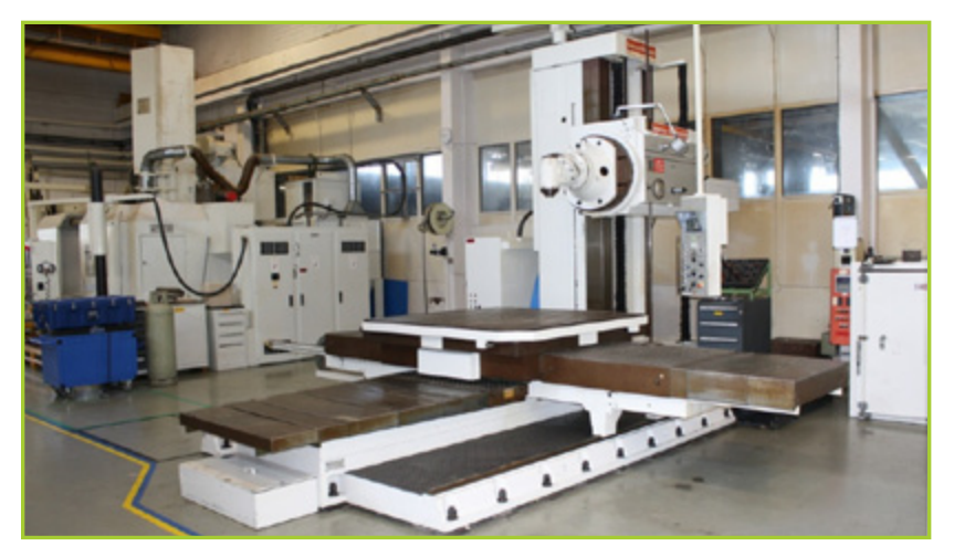
KEARNS RICHARDS SF125L TABLE TYPE HORIZONTAL BORING & MILLING MACHINE