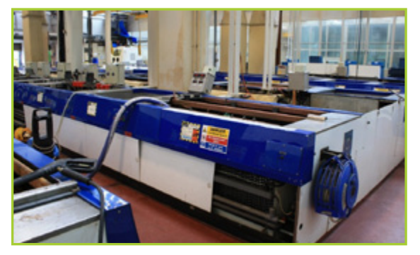
STAINLESS STEEL MULTI TANK CLEANING & PLATING