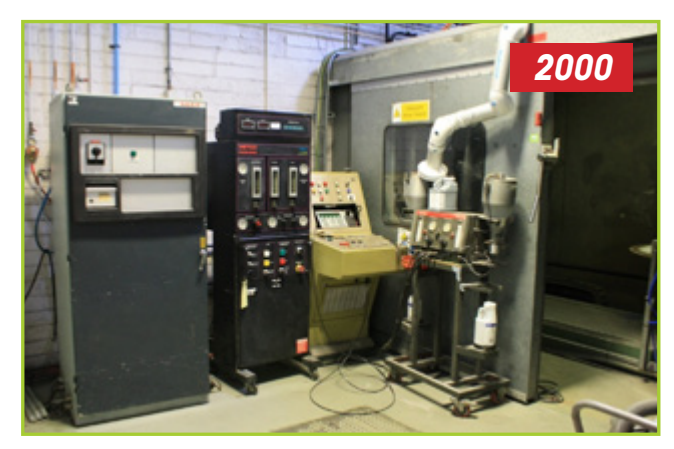
SULZER METCO THERMAL PLASMA SPRAY COATING SYSTEM

FACILITY SUPPORT – AIR COMPRESSORS, AIR DRYERS, STORAGE TANKS, PALLET RACKING, CRANES, ENGINE STANDS, PORTABLE BUILDINGS, MOBILE TRANSFORMERS, FLEET OF FORK LIFTS & HANDLING EQUIPMENT