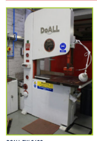
DOALL ZW-3620 VERTICAL METAL BANDSAW

FACILITY SUPPORT – AIR COMPRESSORS, AIR DRYERS, STORAGE TANKS, PALLET RACKING, CRANES, ENGINE STANDS, PORTABLE BUILDINGS, MOBILE TRANSFORMERS, FLEET OF FORK LIFTS & HANDLING EQUIPMENT