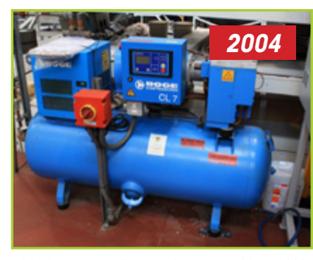
BOGE CLD 7-270 RECEIVER MOUNTED AIR COMPRESSOR