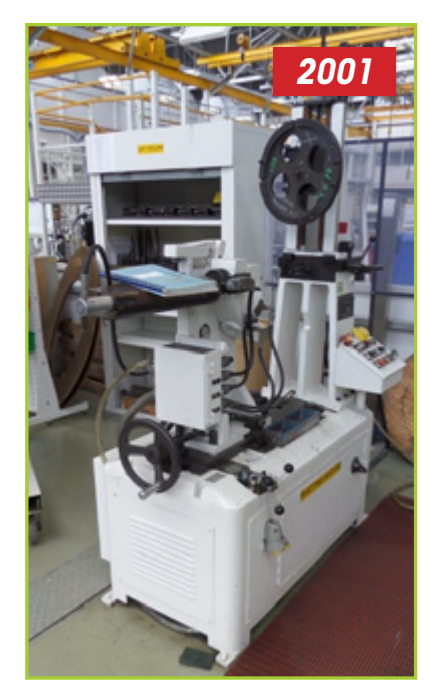
DVANCE MFG CO. LTD ADTV-1 TAB BENDING & RIVET FLARING MACHINE