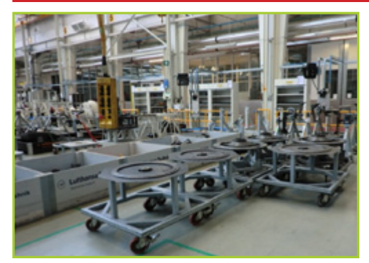
EXTENSIVE QUANTITY CFM 56-3 PROPRIETARY TOOLING