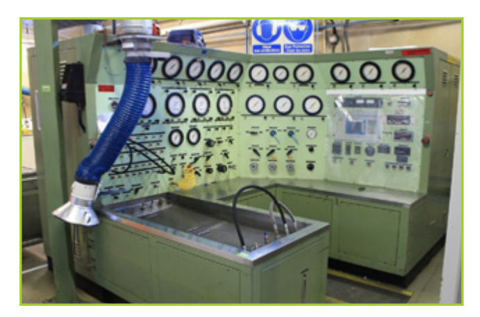
BAUER 1535002 LOW FLOW FUEL ACCESSORIES TEST STAND