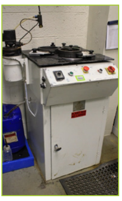
ARBRALAP LTD 400MM CABINET MOUNTED HORIZONTAL LAPPING MACHINE