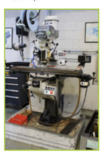
BRIDGEPORT SERIES 1 2 HP VARIABLE SPEED TURRET MILLING MACHINE