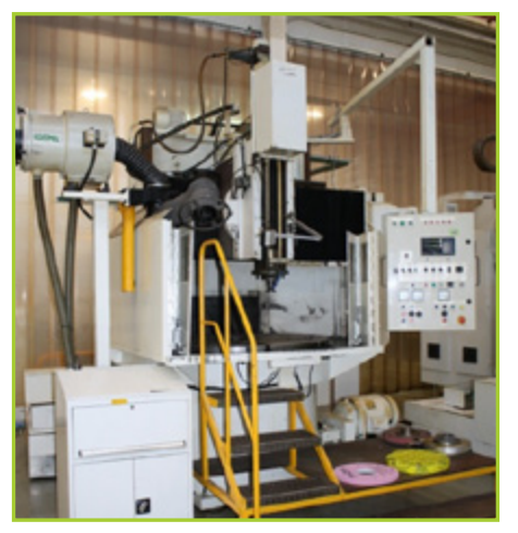
RUSSIAN/STANKO ID/OD VERTICAL SPINDLE ID/OD GRINDER