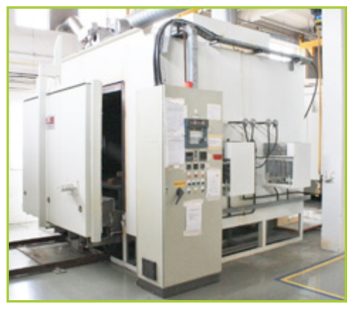
JLS ELECTRIC INDUSTRIAL TEMPERING FURNACE