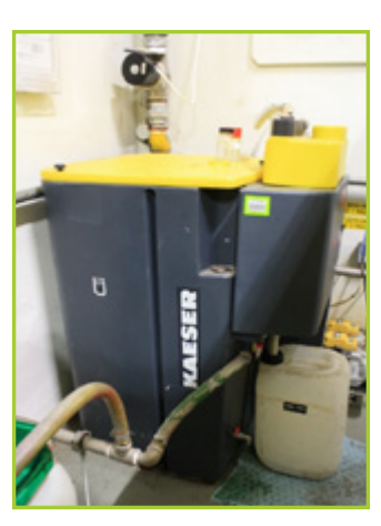
KAISER AQUAMAT CF75 OIL & WATER SEPARATION UNIT