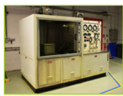
BAUER BEI-1378D OIL FLOW TEST STAND