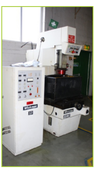
WICKMAN EMD. 1 DIE SINKER/SPARK EROSION MACHINE