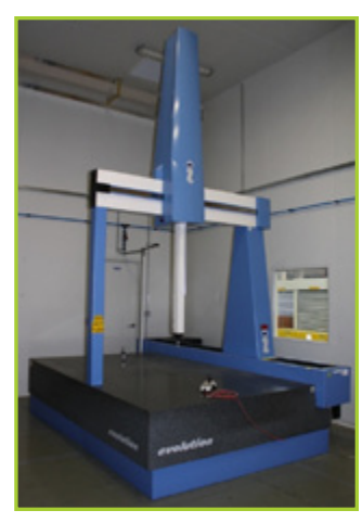
WEPACKIT MPTS 300 CASE SEALER