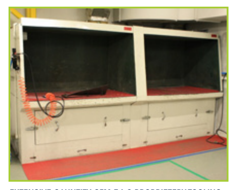
EXTENSIVE QAUNTITY CFM 56-3 PROPRIETERY TOOLING