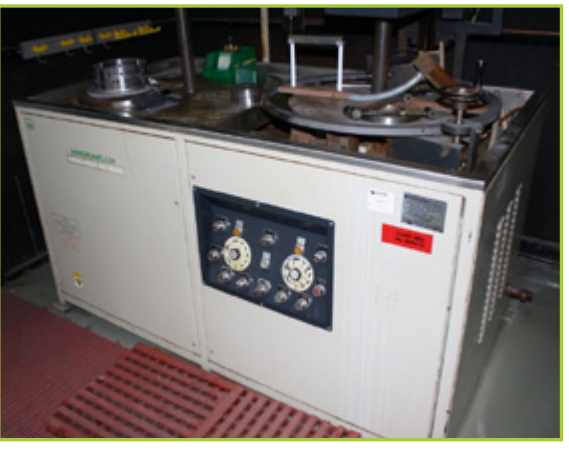
MAGNAFLUX HWSL 1889 40 SERIES NON DESTRUCTIVE TESTING MACHINE