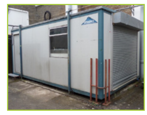
MULTIPLE PORTABLE OFFICE BUILDINGS