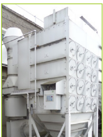
DCE TORIT DFT4-32R 20B FREESTANDING HEAVY DUTY DUST COLLECTION UNIT