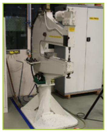
HARDWARE INSERTION/RIVETING PRESS, 36"