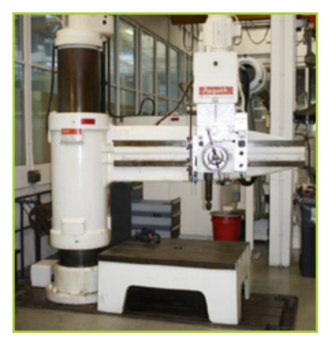
ASQUITH OD1 MK2 16/72 RADIAL ARM DRILL