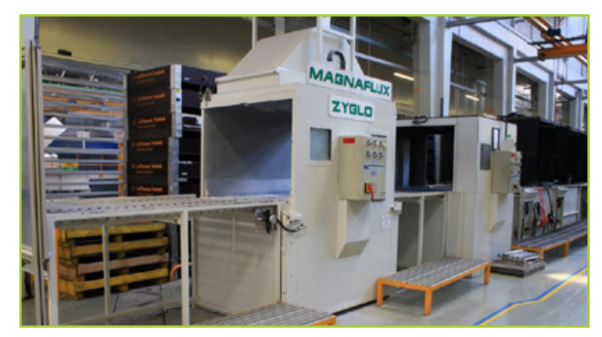
MAGNAFLUX ZA.869 TWIN TRACK FLUORESCENT ZYGLO PENETRANT CRACK DETECTION LINE