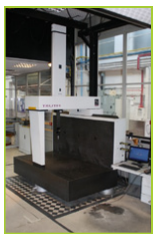
ELEY METROLOGY TRUTH 3 AXIS COORDINATE MEASURING MACHINE

Magnaflux ZA.869 Twin Track Fluorescent Zyglo Penetrant Crack Detection Line, Two Sided, First Part - 10 x Units & 13 x Process Stages, Post Emulsifier penetrant Stages, 1, 2, 6, 7, 8, 9, 10, 11, 12, 13, 14 & 15 - Water Wash penetrant Stages, 1, 4, 5, 10, 11, 12, 13, 14 & 15 - Design Component parameters, 45"Long x 39" Wide x 24" High - Max Component Parameters, 1145mm Wide x 1400mm Long x 950mm High - Temp Range 60-80Degc, 10 Min Cycle Time - Electrics 380v/3ph/50Hz - 18kw Heating Power x 4 Banks, Right to Left - NDT Dye Penetrant Extension Line Running From Left To Right, 12 Station, 1 - Draintray, 2 & 3 - Water Wash Station & Canopy, 4 - Draintray, 5 - Emulsifier Tank, 6 - Draintray, 7 - Water Dip Tank, 8 - Draintray, 9 - Dryer, 10 - Cooling Station, 11 - Powder Storm, 12 - Unload Station, YoM 2001Enclosure with Roller Shutter & Pedestrian Access Doors, Internal Lighting & Power