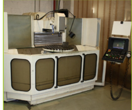
DECKEL FP50CC TOOLROOM MILLING MACHINE