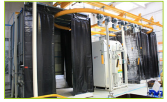
MANUAL POWDER SPRAY BOOTHS