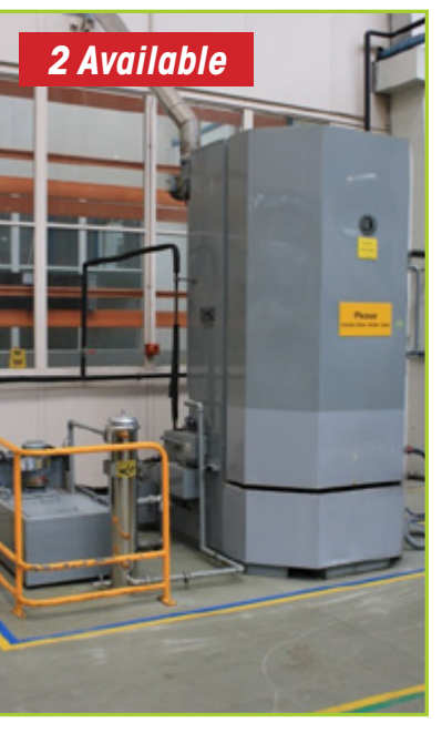
BETTER ENGINEERING BIO CLEAN FREESTANDING STAINLESS STEEL 1000MM DEGREASING SYSTEM