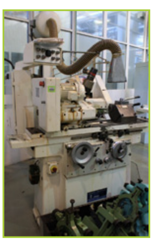
JONES & SHIPMAN 1311 CYLINDRICAL & INTERNAL GRINDING MACHINE

Vacublast International Special Auto Shot Peener Robotic Programmable Media Dry Shot Peen Blast System, Comprising 4200mm x 3500mm x 2850mm Walk In Chamber with Double Door Entry & Internal Multi Axis ABB Robot with 2 x Heads, 1 x Rotary Table, Filtration, Manual Blast Option, 27kva, 380v, 50Hz, serial no. 2043-00-00, Operators Control Console with Schneifder Magelis Operators Screen, Operators Pendant Control, ABB Robot with Control & Pendant (Calibrated to July 2014), Model IRB3000/M91A, 3 x 415v, 50/60Hz, 3.1kva, Ref. R241.3153-001, 2 x Foot Controls, Peen recovery & Recirculation & Extraction System with Access Steps