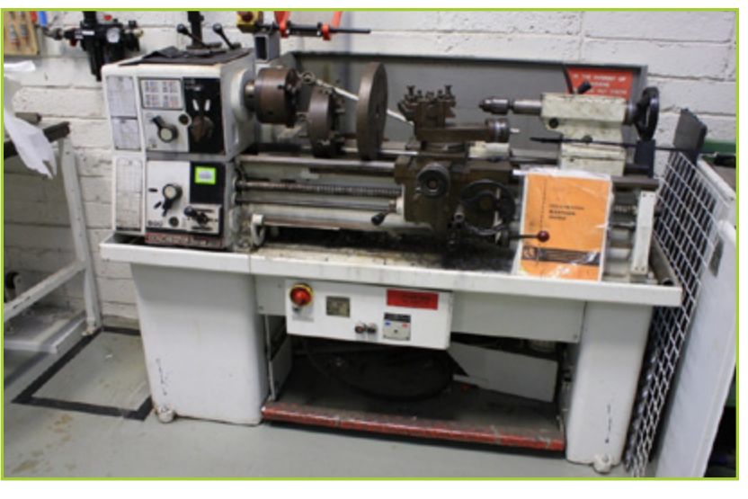
COLCHESTER BANTAM 2000 13" OB X 30" B.C. 18" SWING IN GAP - GAP BED CENTRE LATHE