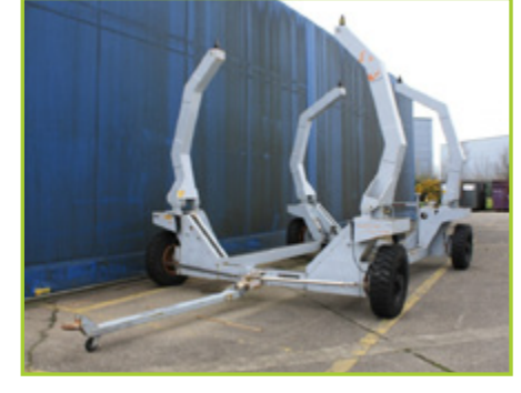
CENTRAL ENGINEERING COMPANY (CENCO) MOBILE BIG BIRD TO SUIT JT9D/PW4000 ENGINES