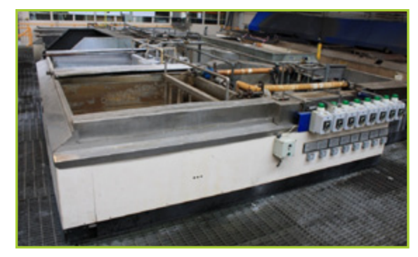
STAINLESS STEEL 14 TANK DEGREASING/CLEANING SYSTEM