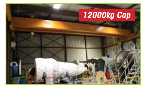
HOISTECH TWIN BOX SECTION OVERHEAD TRAVELLING CRANE