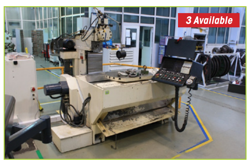
(3) DECKEL FP42NC TOOLROOM MILLING MACHINE

(10) Cazeneuve HB575 Gap Bed Centre Lathe, 1000mm B.C., 540mm Swing, 760mm Swing in Gap, 18 Spindle Speeds, 25 - 2000rpm, Quick Change Tool Post, Coolant, Lo-Vo Lamp, Sony 2 x Axis DRO, 50mm Spindle Bore, Foot Brake, 3 & 4 Jaw Chucks, Face Plates, Chuck Guard