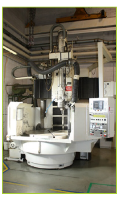
DORRIES SCHARMANN VSE160 1600MM VERTICAL SPINDLE ID/OD CNC GRINDER