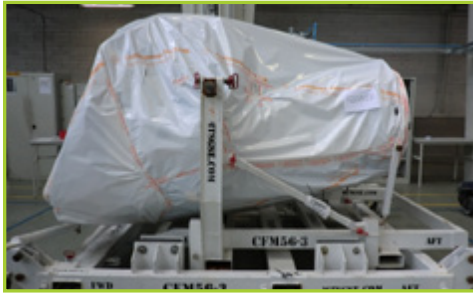
CFM56-3B1 SERVICEABLE JET ENGINE