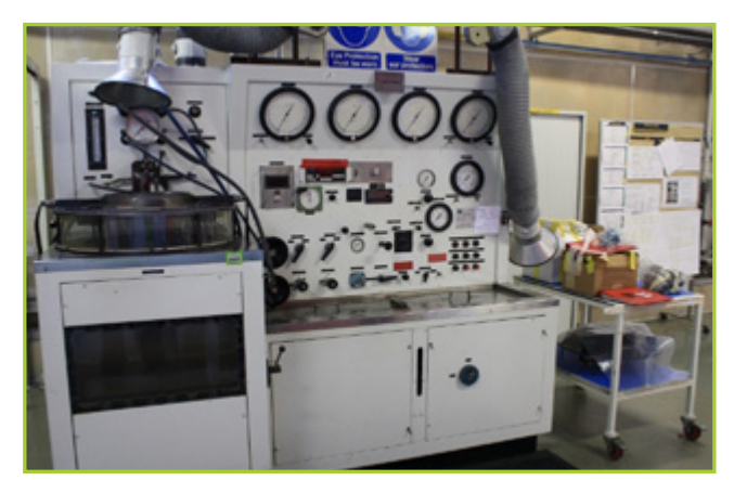
BAUER 1579N FUEL NOZZLE TEST STAND