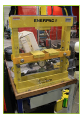
ENERPAC VIP SERIES BENCH MOUNTED HAND HYDRAULIC WORKSHOP PRESS