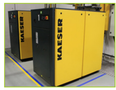
KAISER TF202 SKID MOUNTED PACKAGED AIR DRYER