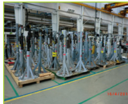
FULL RANGE OF JT9D TOOLING