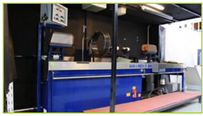
BAUGH & WEEDON EBU3000 5TF/HC HORIZONTAL NDT EBU BENCH