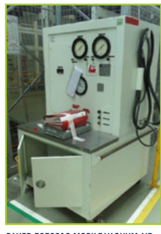
BAUER 5052013 MOBILE VACUUM AIR FLOW TEST STAND