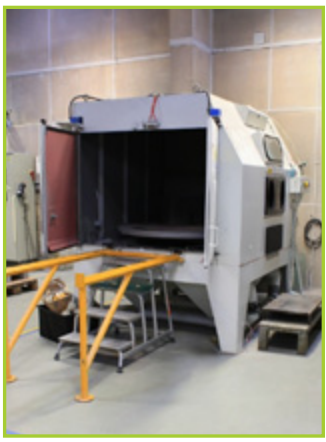
ABRASIVE SHOT BLAST CABINETS