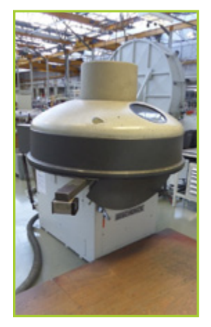
SCHENCK VE4L VERTICAL DYNAMIC BALANCING MACHINE