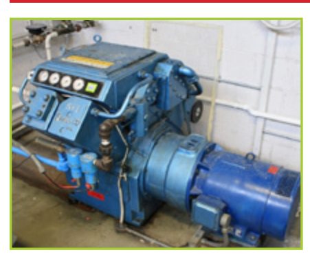
COMPAIRREAVELL 5000 HP V TWIN AIR COMPRESSOR