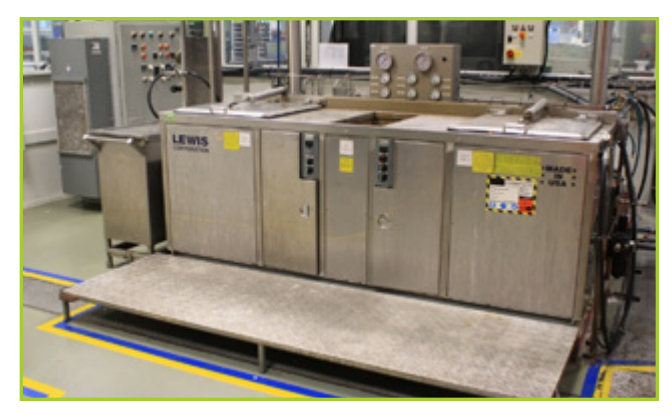
LEWIS CORPORATION STAINLESS STEEL 3 TANK ULTRASONIC CLEANER

Location: Naas Road, Rathcoole, Co. Dublin. Ireland