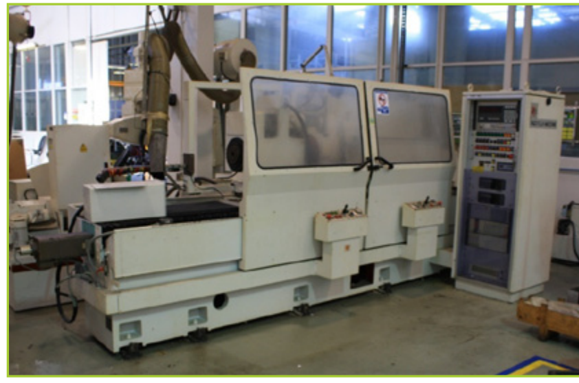
FAGGFELLA MACCHINE U-1030/18 CNC AUTOMATIC UNIVERSAL CYLINDRICAL GRINDER