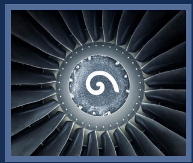
Scan this QR Code with your smartphone for More Information.

Storz, Everest VIT & GE Borescope Equipment • Cenco Engine Test Cell with Tooling, Bellmouths, Fixtures, etc. • Webster & Bennett and Berthiez Borers, Cazeneuve Lathes, Deckel & Huron Milling Machines • MagnaFlux NDT Lines • Schenck Dynamic Vertical & Horizontal CNC Balancing Machines • Superb range of Inspection Equipment • Baugh & Weedon Magazon MPI Bench • Kaiser Packaged Air Compressor Plant • Dorries Scharmann Model VSE160 1600mm Vertical Spindle ID/OD CNC Grinder • And More!