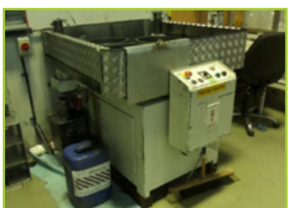
PRECISIONLAP 900 900MM HORIZONTAL LAPPING MACHINE