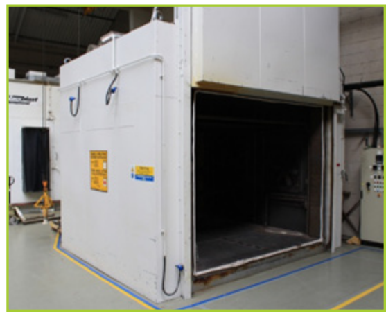
LS 3300MM X 2900MM X 2400MM ELECTRIC OVEN