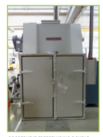
COOPERHEAT FREESTANDING DOUBLE DOOR ELECTRIC INDUSTRIAL OVEN