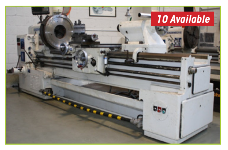
(10) CAZENEUVE HB725 GAP BED CENTRE LATHE