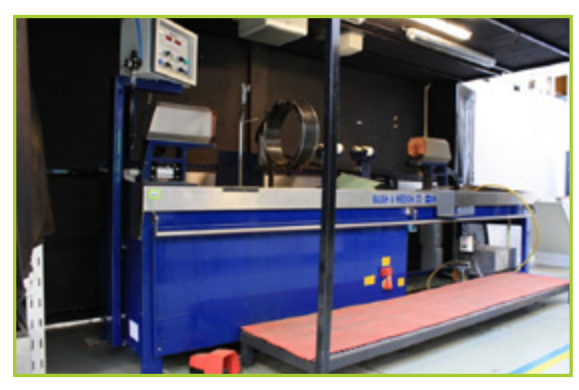
BAUGH & WEEDON EBU3000 5TF/HC HORIZONTAL NDT EBU BENCH