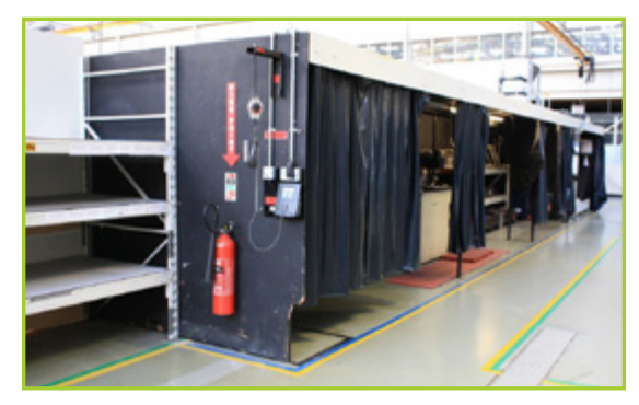
MULTIPLE BLACKOUT INSPECTION BOOTHS