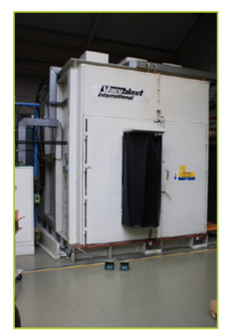
VACUBLAST INTERNATIONAL SPECIAL AUTO SHOT PEENER ROBOTIC MEDIA DRY SHOT PEEN BLAST SYSTEM