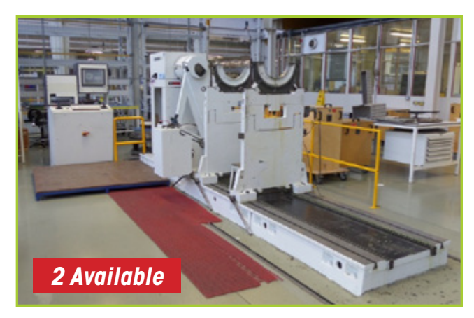
SCHENCK HL50UB CNC HORIZONTAL DYNAMIC BALANCING MACHINE

Location: Naas Road, Rathcoole, Co. Dublin. Ireland