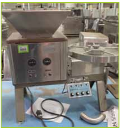
DEITZ 714R PHARMA-FILL ELECTRONIC TABLET COUNTER WITH SYNTRON F-T01A MAGNETIC TABLET DEDUSTER