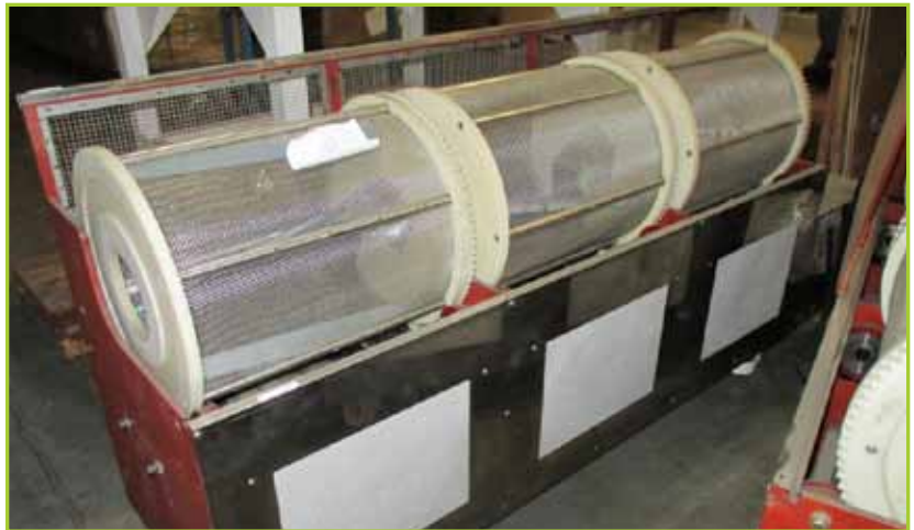
LOT INCLUDES (2) SOFTGEL HEAT TUNNELS