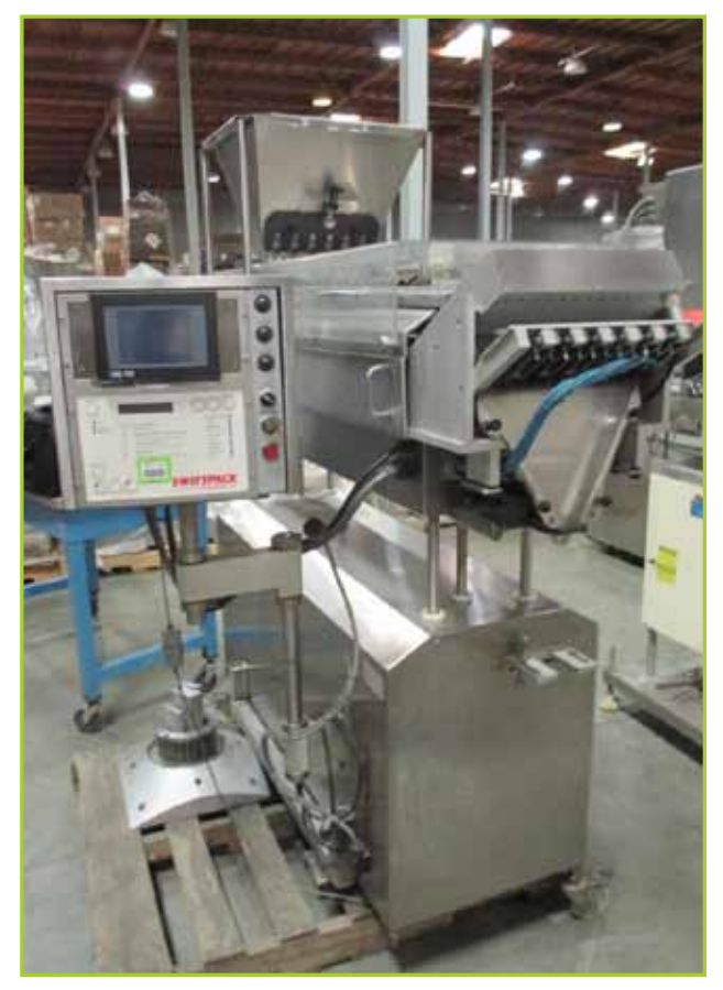
KALISH 8106 SWIFTPACK SPC 12P3 LANE COUNTER