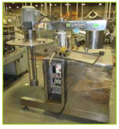
BOCHANG MEDIA MIXER