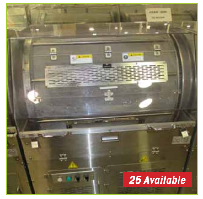
KAMATA INDIVIDUAL BASKET SOFTGEL TUNNEL DRYER