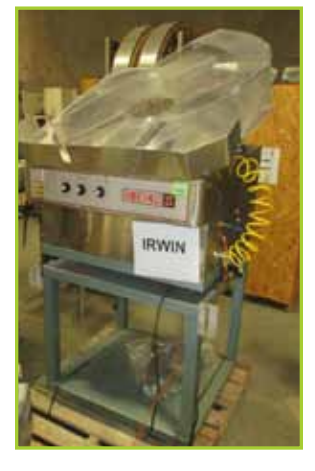
FAIRCHILD II 33A DUAL DROP FILLER