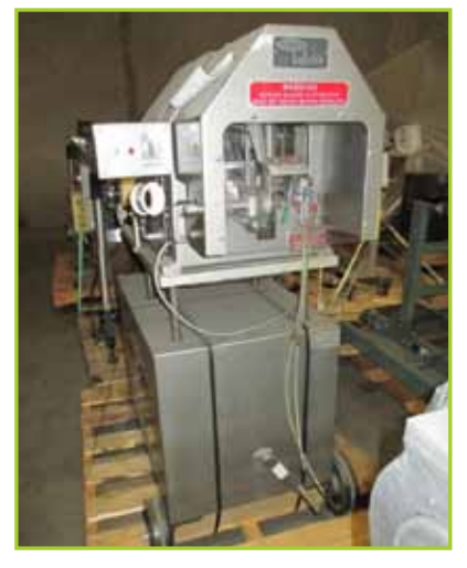
LAKSO PACKAGE BOTTLE COTTON INSERTER