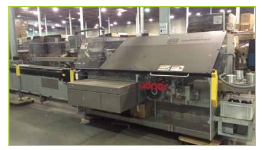
JONES / IWKA CARTOPACK SC4 HORIZONTAL CARTONER WITH BOTTLE KNOCK DOWN WHEEL, ALLEN BRADLEY 1500P VERSAVIEW, PLC, NORDSON VISTA GLUE SYSTEM