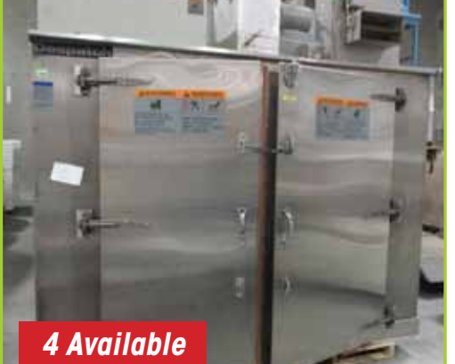
HEATCRAFT INC AHS26FC AIR HANDLER DESPATCH OVEN