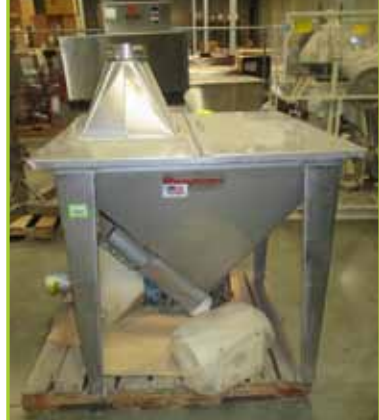
FLEXICON BAG UNLOADER WITH BALDOR GEAR MOTOR