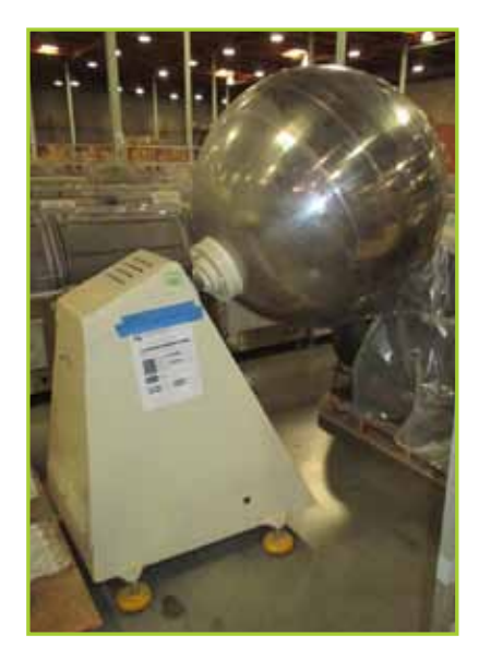
PAN COATER / POLISHER WITH LEESON SPEED MASTER