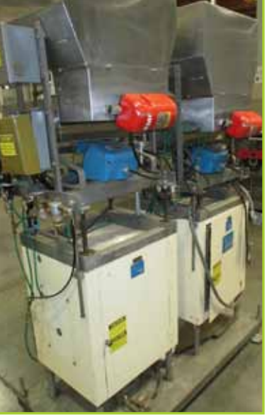
INGERSOLL-RAND SSR-EP50SE OILED AIR COMPRESSOR MERRILL 15-10AH TWIN DESICCANT FEEDER