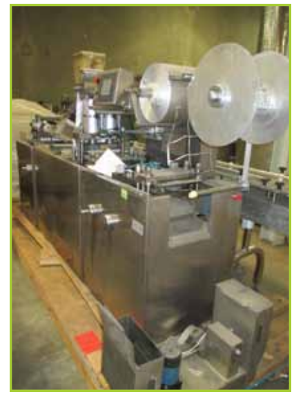
JIANGNAN PACKING DPP-250D II TYPE AUTOMATIC BLISTER PACKING MACHINE