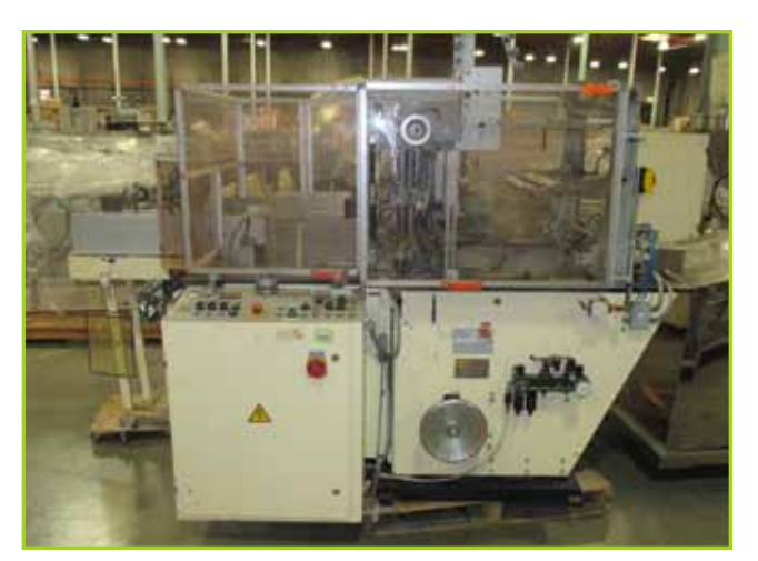
SOLLAS HOLLAND INLINE BUNDLER