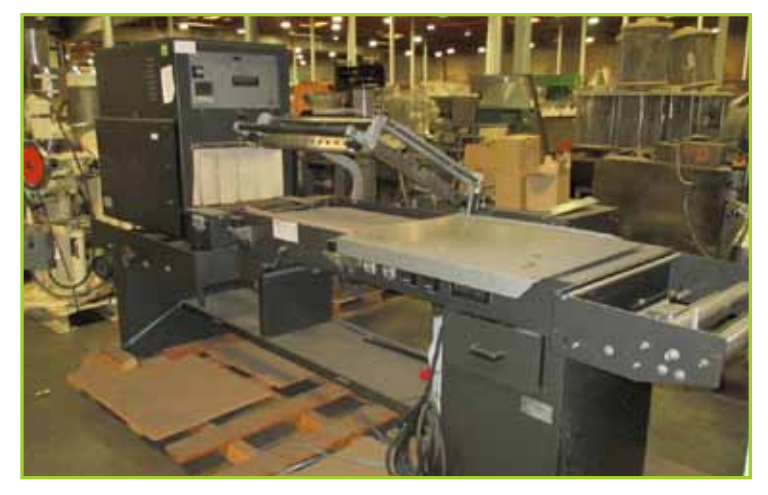
EASTEY EM28TTK L-BAR SEALER WITH HEAT TUNNEL