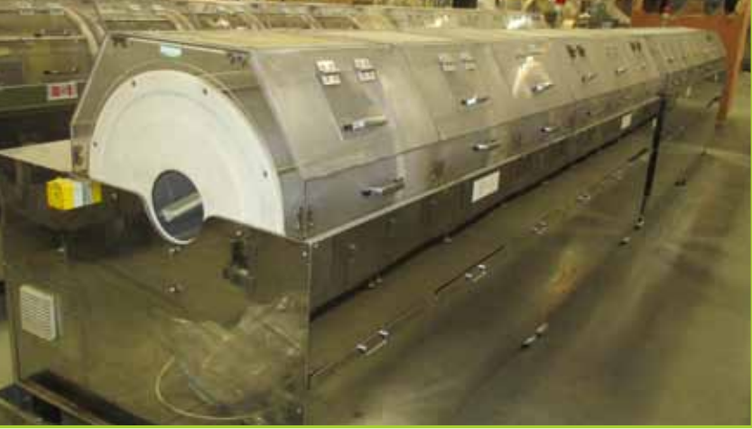
SEC/SEMICONDUCTOR EQUIPMENT CORP 830 DIE/SMD PICK & PLACE SYS. (MANUAL BAR STACKER 20X6" TRAVEL WITH VIDEO FEED, 6" GRIP-RING VACUUM EJECTOR, 4" GELPAK STATION) YEAR 2012