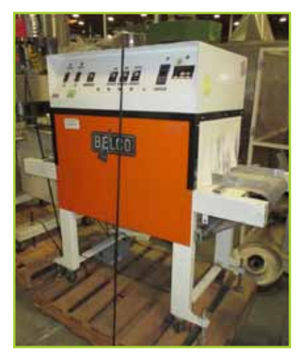
BELCO PORTABLE HEAT TUNNEL