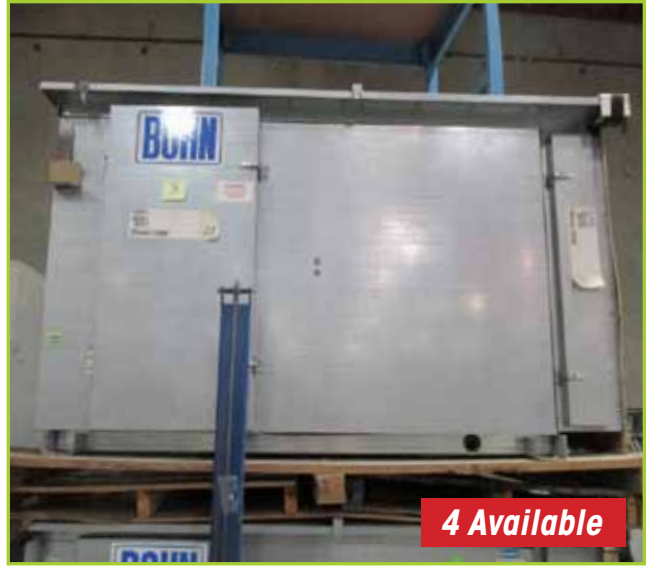
HEATCRAFT INC AHS26FC AIR HANDLER