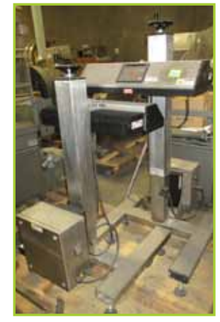
SC PACKAGING AUTO LABEL APPLICATOR