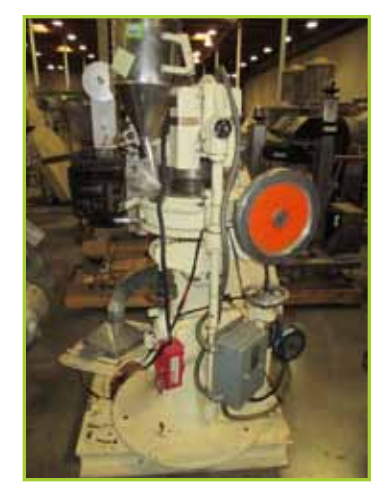
FJS ROTARY TABLET PRESS, 16 STATION