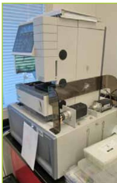
ESKIGENT NANOLC-2D LIQUID CHROMATOGRAPH