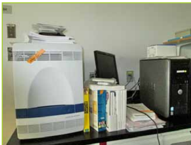
ABI/APPLIED BIOSYSTEMS VIIA7 PCR SYSTEM. WITH 384 AND 96 WELL BLOCKS. WITH DOCUMENTATION