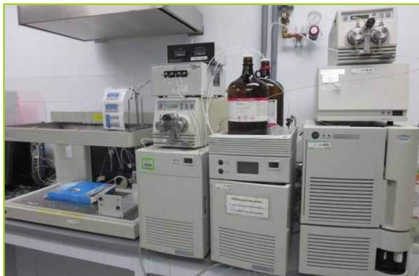
JONES / IWKA CARTOPACK SC4 HORIZONTAL CARTONER WITH BOTTLE KNOCK DOWN WHEEL, ALLEN BRADLEY 1500P VERSAVIEW, PLC, NORDSON VISTA GLUE SYSTEM