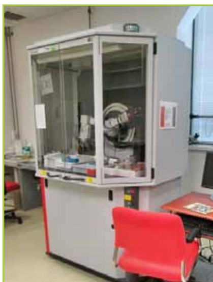
BRUKER D8-ADVANCE X-RAY DIFFRACTOMETER SYSTEM, W/ ANSYCO #SYCOS H-HOT HUMIDITY CONTROLLER SYSTEM