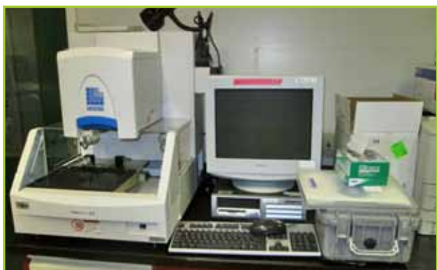
MATRIX PLATEMATE-2X2 PLATE WASHER SYSTEM