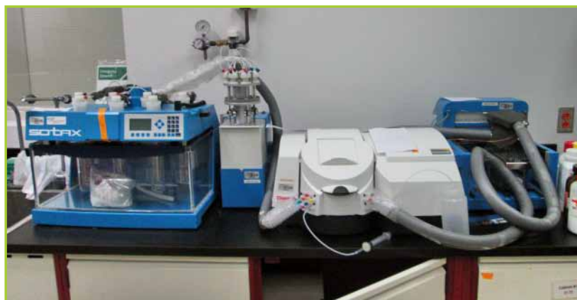
SOTAX AT7-SMART DISSOLUTION/PHOTOMETRIC MEASUREMENT SYSTEM, WITH FRACTION COLLECTION. CONSISTING OF: SOTAX#AT7-SMART DISSOLUTION SYSTEM ; SOTAX #CY7-50 PISTON PUMP ; SOTAX #C613 FRACTION COLLECTOR ; THERMO SCIENTIFIC EVOLUTION-300 UV-VISIBLE SPECTROPHOTOMETER