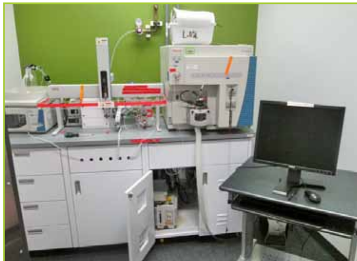
THERMO ELECTRON T SQ-VANTAGE MASS SPECTROMETER