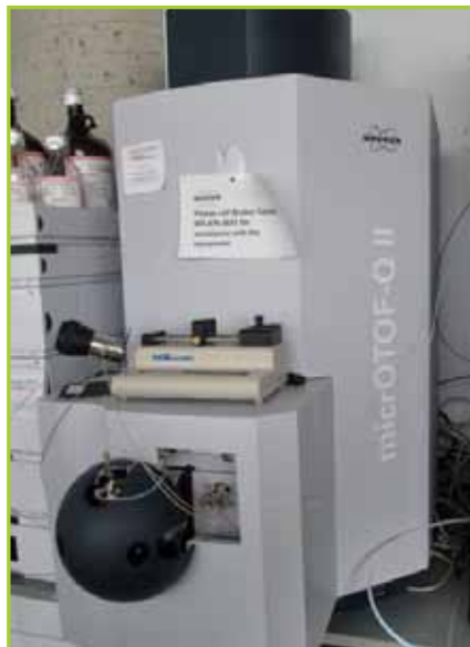
BRUKER DALTONICS MICROTOF-QII MASS SPECTROMETER SYSTEM