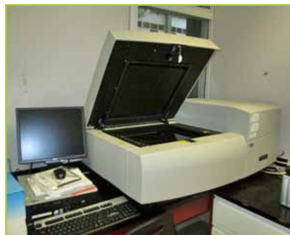
GE HEALTHCARE BIOSCIENCES TYPHOON-TRIO VARIABLE MODE IMAGER, MOLECULAR DYNAMICS IMAGE ERASER, HP COMPAQ COMPUTER SYSTEM