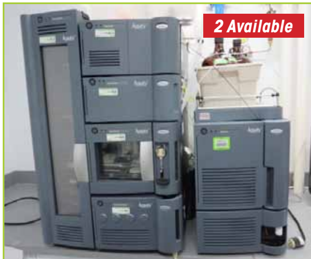
WATERS ACQUITY-UPLC-SQ MASS DETECTOR