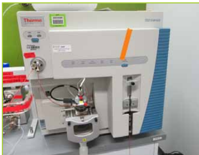
THERMO SCIENTIFIC TRANSCEND(1250/3VLVTX15K) ELUTING PUMP WITH VALVE INTERFACE MODULE