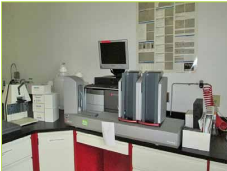
TECAN GENEIOS-PRO PLATE READER. WITH DOCUMENTATION