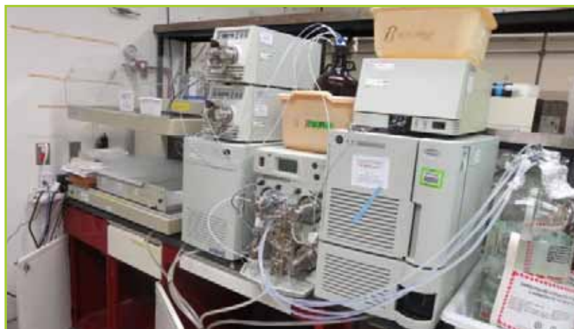
WATERS LC/MS SYSTEM . WITH WATERS 3100 MASS DETECTOR, LEYBOLD SV40VACUUM PUMP, WATERS 2998 PHOTO DIODE ARRAY DETECTOR, WATERS 515 ISOCRATIC HPLC PUMP, WATERS 515 ISOCRATIC HPLC PUMP, WATERS 2545 BINARY GRADIENT MODULE, WATERS SFO SYSTEM FLUIDICS ORGANIZER, WATERS 2767 SAMPLE MANAGER, LENOVO MTM- 8816-A22 COMPUTER WITH LENOVO 19" MONITOR