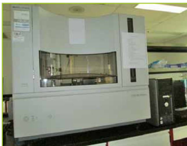
ABI/APPLIED BIOSYSTEMS 3730 DNA ANALYZER. WITH DELL COMPUTER SYSTEM