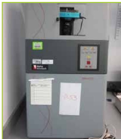
ALPHA INNOTECH FLOURCHEM HD2 VISION SYSTEM WITH CAMERA & BELL SCIENCES ILLUMINATOR.