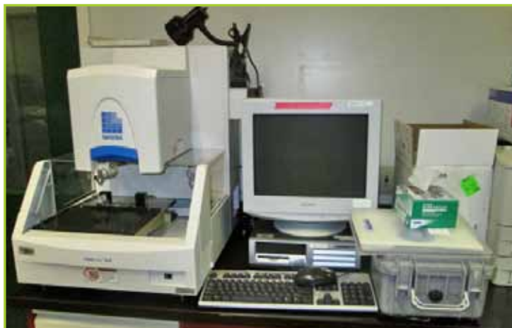
MATRIX PLATEMATE-2X2 PLATE WASHER SYSTEM