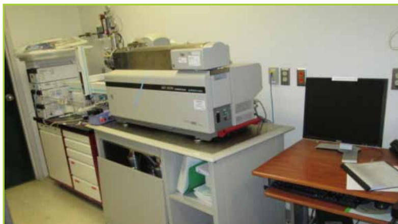
APPLIED BIOSYSTEMS/ABI API 5000 LC/MS/MS SYSTEM S/N-AG01268007, WITH HPLC