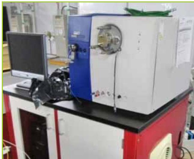
MICROMASS PLATFORM-LCZ MASS SPECTROMETER, R - (IONIZATION CHAMBER MISSING). WITH EDWARDS #28 VACUUM PUMP. SWITCH IBM TOWER COMPUTER SYSTEM