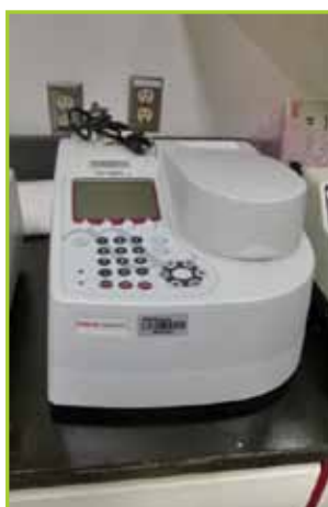
THERMO SPECTRONIC BIOMATE-3S UV/VIS SPECTROPHOTOMETER