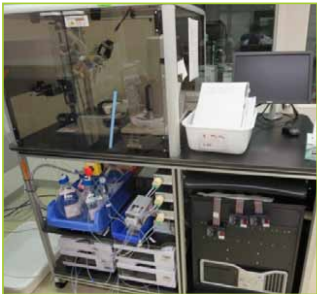
AGILENT G1310A LOT CONTAINS HPLC LC MS SYSTEM CONSISTING OF 6 ITEMS: AGILENT G1310A ISO PUMP SN#-DE62957903; BIOCIUS LIFE SCIENCES MASS SPECTROMETER RF200 RAPIDFIRE WITH POWER SUPPLY APC SMART UPS 1000, ISO Matic 832 C PUMP SN#-RF-MS27; AGILENT G1379B DEGASSER SN#-JP82010279; AGILENT G1310A ISO PUMP SN#-DE62958192; AGILENT G1310A ISO PUMP SN#-DE62958170; DELL T3400 AND KEYBOARD