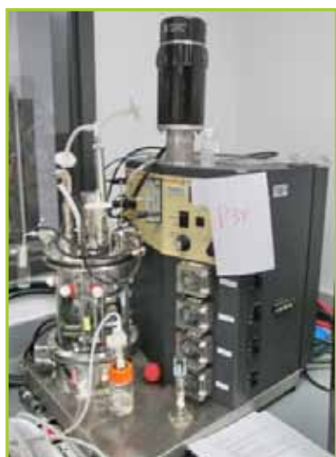
NEW BRUNSWICK SCIENTIFIC BIOFLO-II BATCH/ CONTINUOUS FERMENTER