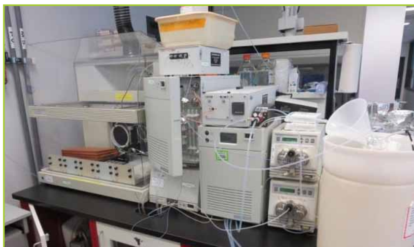
WATERS HPLC. WITH: WATERS 2998 PDA DETECTOR. WATERS 515 ISOCRATIC HPLC PUMP. WATERS 2545 BINARY GRADIENT MODULE. WATERS SFO SYSTEM FLUIDICS ORGANIZER. WATERS 2767 SAMPLE MANAGER. LENOVO MTM-8816-A22 COMPUTER WITH LENOVO 20" MONITOR AND KEYBOARD