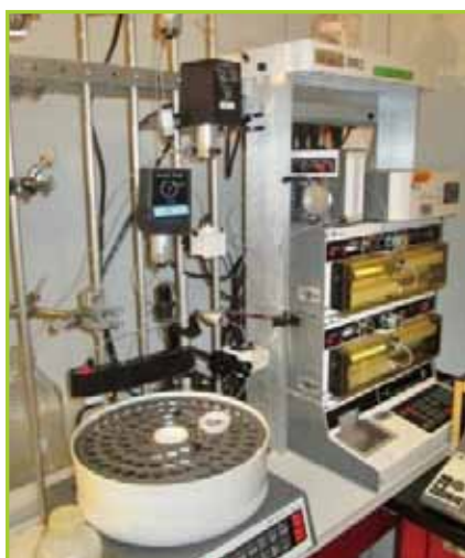
PHARMACIA FPLC SYSTEM, WITH REC-100 CHART RECORDER.