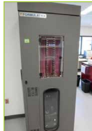
FORMULATRIX R11000 FORMULATRIX IMAGING STATION