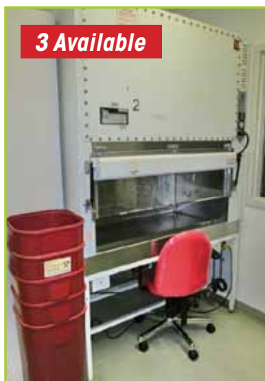
CANADIAN CABINET BM42A-49 BIO SAFETY CABINET