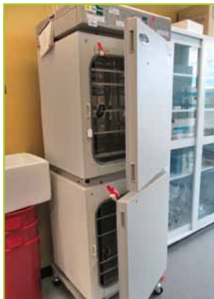
SHEL-LAB DUAL-STACK/1565 INCUBATOR