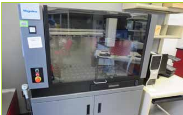
RIGAKU ALCHEMIST II/2008 CRYSTALLIZATION SCREEN MAKER, WITH DELL T3400 PC & SAMSUNG 720N MONITOR. S/N-474. YEAR 2008