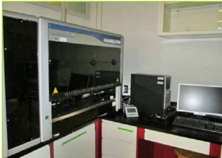
GORBEL 1/2-TON FREE STANDING 1/2-TON JIB CRANE, W/ HARRINGTON 1/2-TON CHAIN HOIST