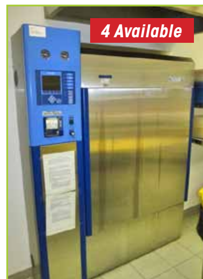
GETINGE 733LS STEAM STERILIZER