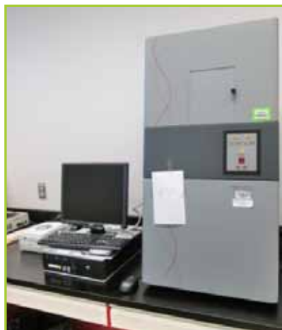
ALPHA INNOTECH FLOURCHEM-HD2 VISION SYSTEM. WITH HP COMPUTER

1 – Molecular Devices Spectramax-Gemini-XS Microplate Fluoro Meter. With HP DC7800 Computer System