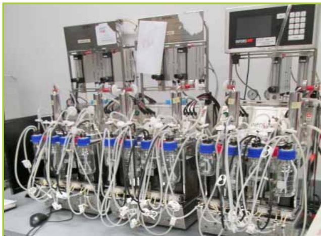
INFORS-HT (3-STATIONS) MULTIFORS/2008 DISSOLUTION SYSTEM