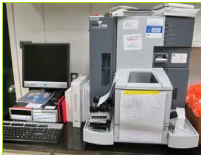
GE HEALTHCARE BIACORE-T100 PROTEIN INTERACTION ANALYZER. WITH HP COMPUTER SYSTEM