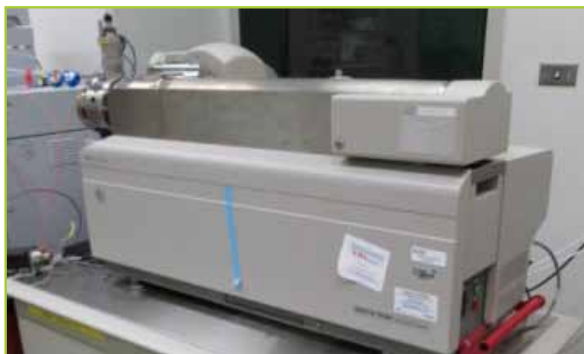
APPLIED BIOSYSTEMS/ABI 4000 Q TRAP LC/MS/MS SYSTEM