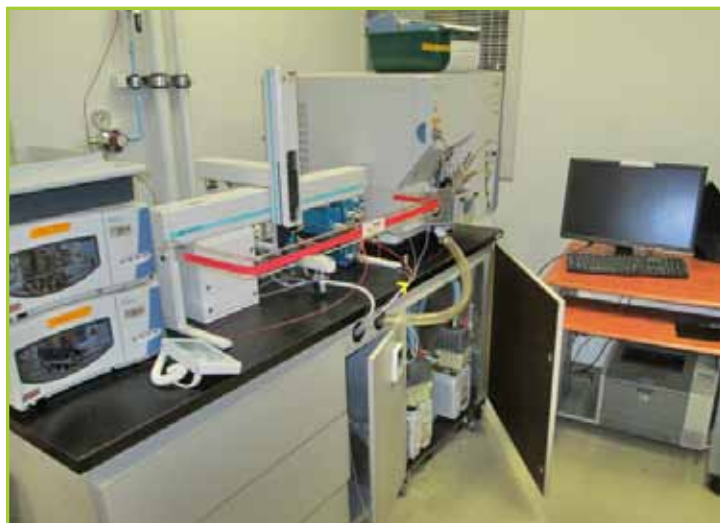
THERMO ELECTRON FINNIGAN-TSQ-QUANTUM-ULTRA MASS SPECTROMETER