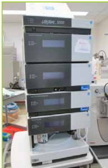
WATERS ACQUITY UPLC SYSTEM