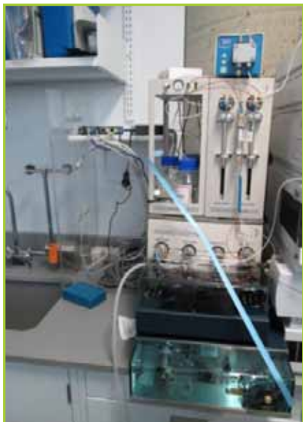
BRUKER BSFU-HP LC-NMR INJECTOR