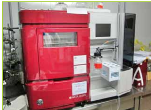
GE HEALTHCARE AKTA AVANT FPLC. WITH HP COMPUTER. WITH DOCUMENTATION