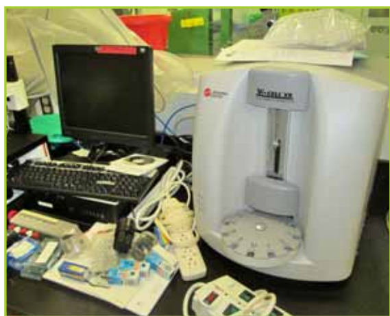
BECKMAN COULTER VI-CELL-XR(383556) CELL VIABILITY ANALYZER. WITH HP DC700 COMPUTER SYSTEM