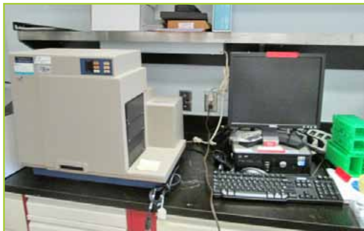
MOLECULAR DEVICES FLEXSTATION3 PLATE READER, WITH DELL COMPUTER SYSTEM