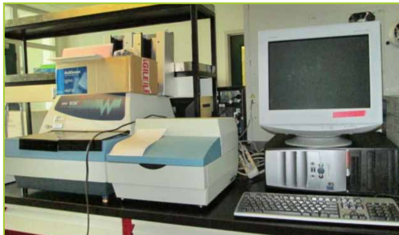
WALLAC VICTOR2-V/1 420 MULTILABEL HTS COUNTER. WITH COMPAQ COMPUTER SYSTEM

ALL ASSETS HAVE BEEN POWERED DOWN, DECOMMISSIONED, BY THE ORIGINAL MANUFACTURER OR BY ONESOURCE