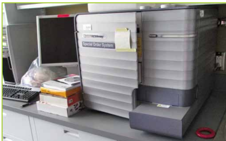
SEC/SEMICONDUCTOR EQUIPMENT CORP 830 DIE/SMD PICK & PLACE SYS. (MANUAL BAR STACKER 20X6" TRAVEL WITH VIDEO FEED, 6" GRIP-RING VACUUM EJECTOR, 4" GELPAK STATION) YEAR 2012