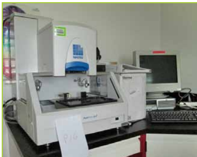
MATRIX PLATEMATE-2X2 PLATE READER. WITH HP COMPAQ COMPUTER SYSTEM