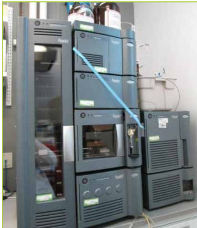
WATERS ACQUITY UPLC/MS SYSTEM. WITH WATERS ACQUITY-UPLC-SQ MASS DETECTOR WITH ADIXEN/ALCATEL PASCAL-2005SD DRY PUMP, UPLC: WATERS ACQUITY-PDA PHOTO DIODE ARRAY DETECTOR, WATERS ACQUITY-UPB BINARY SOLVENT PUMP MANAGER, WATERS ACQUITY-SM UPLC SAMPLE MANAGER, WATERS ACQUITY-SM UPLC SAMPLE MANAGER, WATERS ACQUITY-SO UPLC SAMPLE ORGANIZER, LENOVO MTM-7835-B62 COMPUTER, WITH HP 20" MONITOR AND KEYBOARD WITH DOCUMENTATION