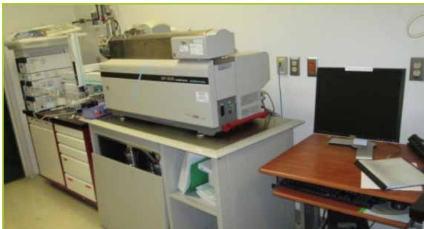
APPLIED BIOSYSTEMS/ABI API 5000 LC/MS/MS SYSTEM, WITH HPLC