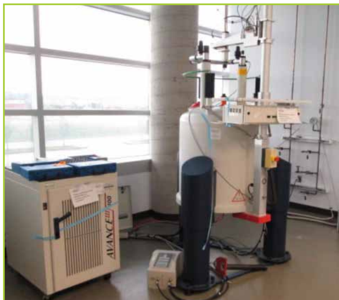
BRUKER BIOSPIN 400MHZ/54MM NMR SPECTROMETER (MAGNET MODEL-ULTRASHEILD-PLUS-400, S/N-118, YEAR 2007) (CONTROL CONSOLE: AVANCE-III-400, #H03128MB/00/0.00/0097). WITH HPPR/2 AMPLIFIER UNIT AND B-ACS-120 AUTOSAMPLER SYSTEM. WITH BRUKER BBI-400MHZ-S1-5MM NMR PROBE S/N-Z49383. WITH HP XW4300 COMPUTER WITH HP 19" MONITOR AND KEYBOARD S/N-CZC647048J. WITH DOCUMENTATION