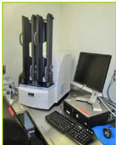
PERKIN ELMER ENVISION-21030010 MULTILABEL READER