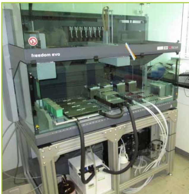
TECAN FREEDOM-EVO-150 LIQUID HANDLER WORKSTATION, (4) INHECO MULTI-TEC TEMP AND RPM CONTROLLER, FRYKA KUHLEIMHEIT-110V/400 CIRCULATOR/CHILLER