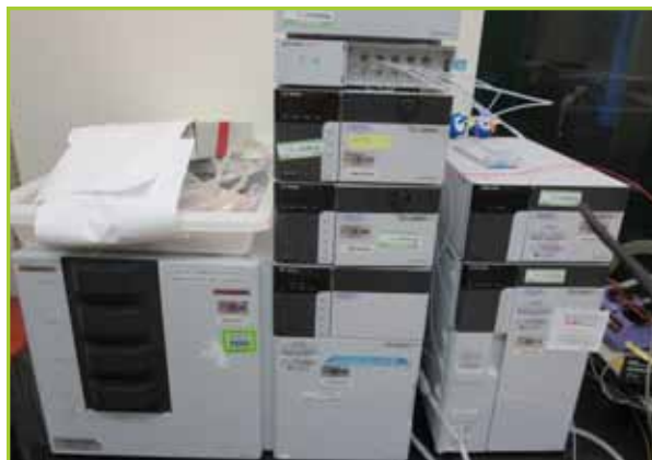
SHIMADZU CBM-20A LOT: SHIMADZU HPLC SYSTEM CONTROLLER MOD. CBM-20A, SHIMADZU FORCED AIR COLUMN OVEN MOD. CTO-20A, SHIMADZU C MODEL RACK CHANGER, SHIMADZU MOD. SIL20AC SAMPLER W-COOLER, (QTY2) SHIMADZU MOD. LC20AB PUMP, DELL PC COMPUTER SYSTEM MOD. MDX SCIEX, YEAR 2006