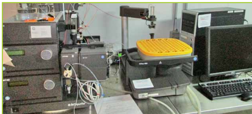
GE HEALTHCARE BIOSCIENCES AKTA PURIFIER 10 (28-4062-64) FPLC, WITH FRACTION COLLECTOR AND HP COMPAQ COMPUTER SYSTEM. YEAR 2007