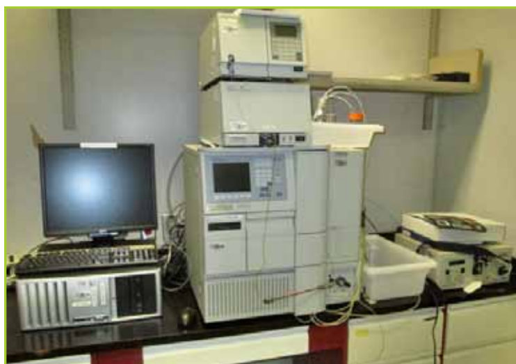
WATERS 2695-SEPARATIONS MODULE, HPLC SYSTEM. WITH 2420 ELS DETECTOR, 99 + PDA DETECTOR, WATERS COLUMN COMPARTMENT, IN/US B-RAM-4 RADIO HPLC DETECTOR AND HP COMPAQ COMPUTER