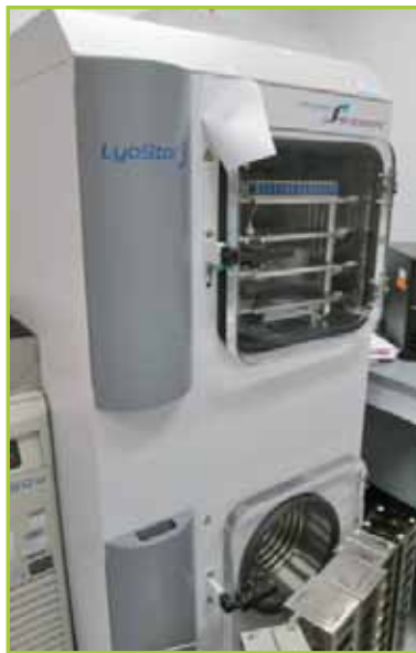
FTP/SP-SYSTEMS LYOSTAR 3/2012 LYOPHYLIZER