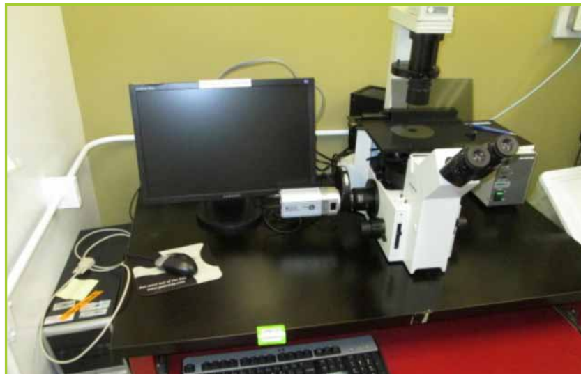
OLYMPUS IX50-S8X INVERTED FLUORESCENT MICROSCOPE 0" ..LG.