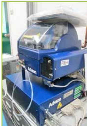
ADVION BIOSYSTEMS TRIVERSA NANOMATE (LC/MS) ESI-CHIP-BASED FRACTION COLLECTOR