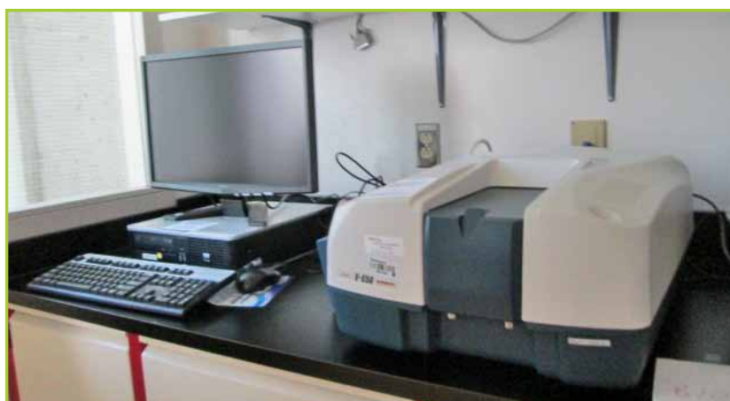
JASCO V-650 SPECTROPHOTOMETER. WITH HP COMPUTER SYSTEM