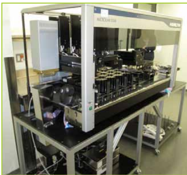
HAMILTON COMPANY MICROLABSTAR LIQUID HANDLER. WITH DOCUMENTATION