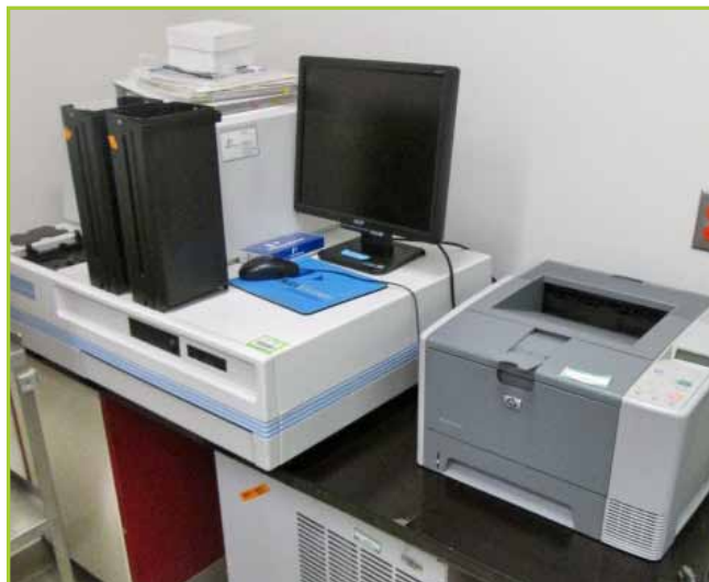
PERKIN ELMERTOPCOUNT-NXT-HTS MICROPLATE SCINTILLATION AND LUMINESCENCE COUNTER. TOPCOUNT NXT COOLER (83318). WITH HP 2420DN PRINTER