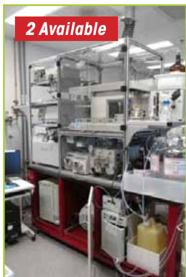
WATERS/THARSFC SFC/MS SSYSTEM