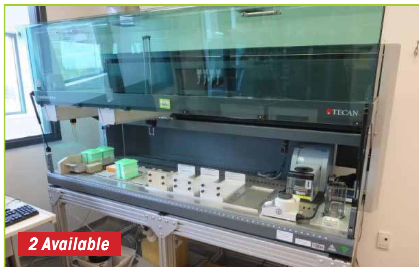
TECAN EVO 200 FREEDOM EVO 200 WORKSTATION