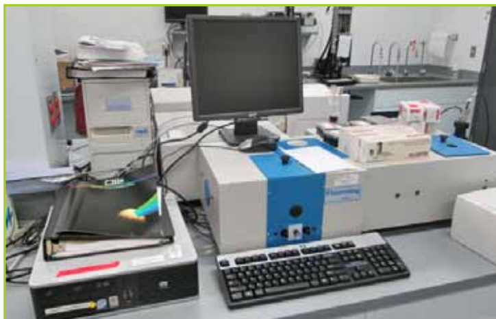
HORIBA FL3-22/2008 HORIBA SPECTROFLUOROMETER SYSTEM, WITH SPECTRACQ COMPUTER. WITH HP-COMPAQ DC7800 COMPUTER SYSTEM AND DONGLE KEY AND HP 1160 PRINTER.