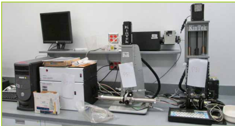
KINTEK SF-2004/RQF3/RPL3/2009 CHEMICAL QUENCH FLOW / RAPID PHOTOLYSIS SYSTEM