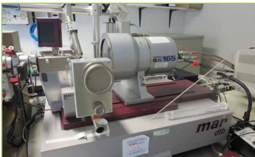
RIGAKU / MAR / RAYONIX 2010 LOT CONTAINS: X-RAY SYSTEM