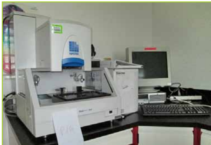
TECAN GENEIOS-PRO PLATE READER. WITH DOCUMENTATION