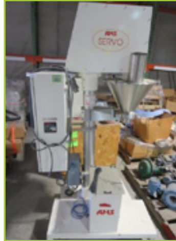
BULK CONTAINER SYSTEM 610001 BARREL DUMPER. STAINLESS STEEL DESIGN FOR 30 GAL BARRELS