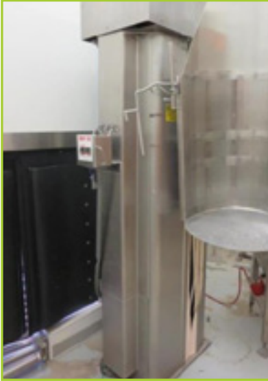
BULK CONTAINER SYSTEM 610001 BARREL DUMPER. STAINLESS STEEL DESIGN FOR 30 GAL BARRELS