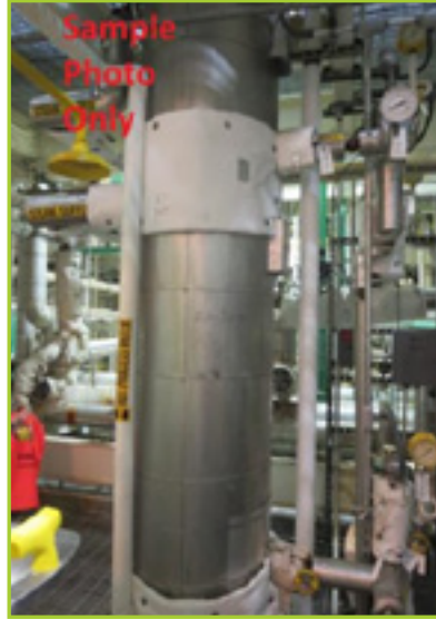
BUSS SMS TYPE LNO350 CANZLER THIN FILM EVAPORATOR