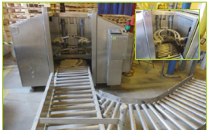
FRYMA CUSTOM FRYMA COLLOID MILL. WITH MIXER & 65 LITER TANK, HAKKE HEATER, HAKKE WATERBATH, MIXING TANK, CLEAN IN PLACE SKID WITH SCALE SKID