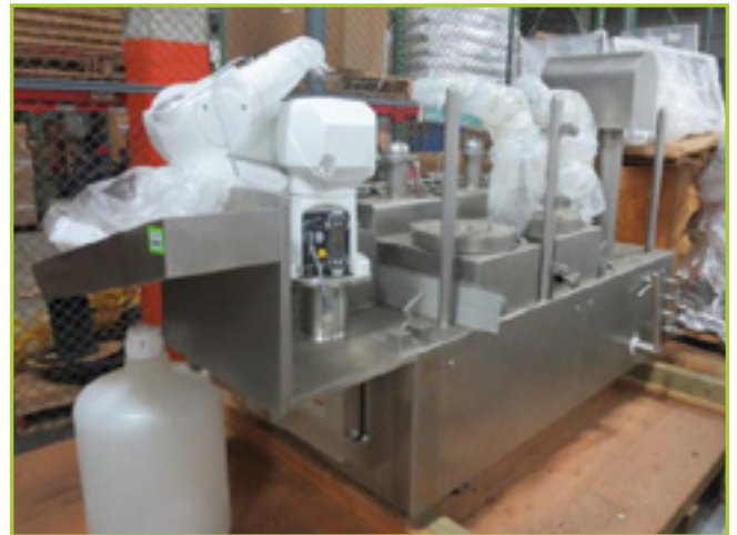
BAUSCH TYPE 534 THE BAUSCH TYPE 534 FILLING MACHINE IS PRIMARILY DESIGNED FOR DOSING CONTAINERS. THE CONTAINER TRANSPORT SYSTEM CONSISTS OF A ROTARY INFEED TABLE, A WALKING BEAM TRANSPORT, AND A ROBOT ASSISTED DISCHARGE. EXPOSED SURFACES OF THE EQUIPMENT ARE COMPOSED OF 316L STAINLESS STEEL OR OTHER CORROSION RESISTANT MATERIALS (NON-METALLIC); AN ALLEN BRADLEY CONTROL LOGIX PLC CONTROLS THE TYPE 534. ENTERING PARAMETERS AND MACHINE SPEEDS, VIEWING FAULT MESSAGES, AND OPERATING OF THE MACHINE ARE PERFORMED USING THE AB VERSAVIEW TOUCH SCREEN. THE MACHINE IS CURRENTLY CONFIGURED TO FILL 10ML SERUM VIALS WITH FILL RANGES OF 1.1ML TO 9.9ML VIA A FLEXICON PD121 PUMP.

BAUSCH TYPE 534 THE BAUSCH TYPE 534 FILLING MACHINE IS PRIMARILY DESIGNED FOR DOSING CONTAINERS. THE CONTAINER TRANSPORT SYSTEM CONSISTS OF A ROTARY INFEED TABLE, A WALKING BEAM TRANSPORT, AND A ROBOT ASSISTED DISCHARGE. EXPOSED SURFACES OF THE EQUIPMENT ARE COMPOSED OF 316L STAINLESS STEEL OR OTHER CORROSION RESISTANT MATERIALS (NON-METALLIC); AN ALLEN BRADLEY CONTROL LOGIX PLC CONTROLS THE TYPE 534. ENTERING PARAMETERS AND MACHINE SPEEDS, VIEWING FAULT MESSAGES, AND OPERATING OF THE MACHINE ARE PERFORMED USING THE AB VERSAVIEW TOUCH SCREEN. THE MACHINE IS CURRENTLY CONFIGURED TO FILL 10ML SERUM VIALS WITH FILL RANGES OF 1.1ML TO 9.9ML VIA A FLEXICON PD121 PUMP. CHANGE PARTS ARE AVAILABLE FROM BAUSCH FOR OTHER VIAL SIZES. THE SEQUENCE OF THE INDIVIDUAL STEPS IS AS FOLLOWS: CONTAINER REGISTRATION; GAS FLUSHING WITH VACUUM EXTRACTION; CHECKING FOR SUFFICIENT GAS AND VACUUM LEVELS; CONTAINER DOSING; CONTAINER CLOSING WITH STOPPER AND CHECKING FOR THE PRESENCE OF A STOPPER; CAP PLACEMENT AND CHECKING FOR THE PRESENCE OF A CAP; CONTAINER CLOSING WITH CRIMP CAPS AND CHECKING FOR THE PRESENCE OF A CAP; CAPINTEC TRANSFER; CONTAINER DISCHARGE/REJECT/SAMPLING