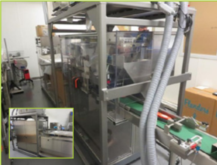
IMA / PRECISION GEARS LTDTR 100 XL BLISTER PACKER. STAND ALONE BLISTER MACHINE (UP TO 150 BLISTERS/MIN) FLEXIBLE FEATURES, FOR SMALL TO MEDIUM PRODUCTION RUNS, MADE ENTIRELY OF STAINLESS STEEL, THIS INTERMITTENT WORKING & PLATEN-SEALING MACHINE CAN WORK WITH ALL KINDS OF MATERIALS ON A SINGLE OR MULTI- LANE BLISTER PRODUCTION. INCLUDES ENTRY CONVEYOR & (1-HASKRIS R050 CHILLER S/N-HB21949). APPROX 15FT L X 4FT W X 5FT HIGH. YEAR NEW: 2006