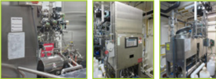
FRYMA CUSTOM FRYMA COLLOID MILL. WITH MIXER & 65 LITER TANK, HAKKE HEATER, HAKKE WATERBATH, MIXING TANK, CLEAN IN PLACE SKID WITH SCALE SKID