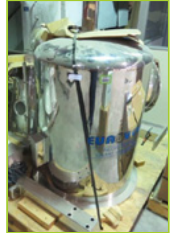
EUROVENT 25 FLUID BED DRYER