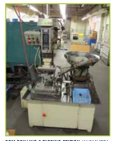
SGM DRILLING & TAPPING STATION, W/ 21" VIBRATOR BOWL FEEDER & 7" POWER CHIP CONVEYOR