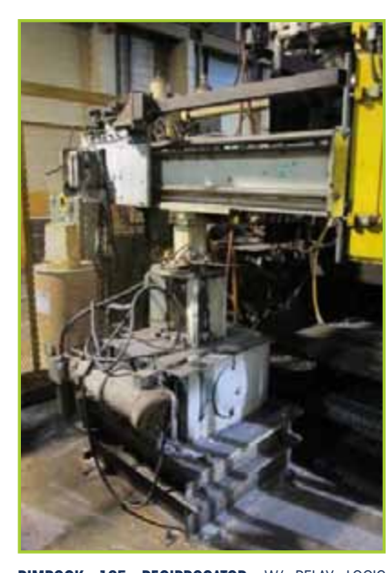
RIMROCK 195 RECIPROCATOR, W/ RELAY LOGIC CONTROLS, 55" STROKE YEAR: 1991