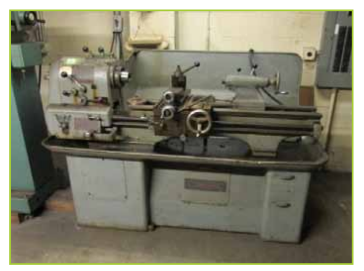
CLAUSING 13" ENGINE LATHE