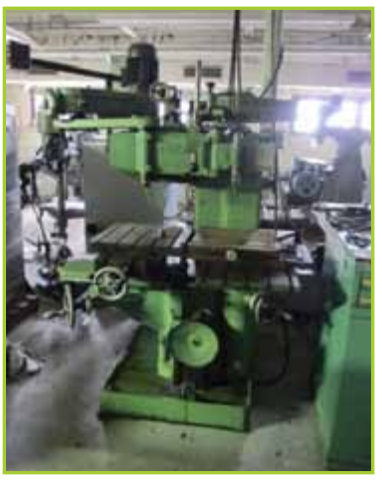
DECKEL COPY MILLING MACHINE KF2 DECKEL COPY MILLING MACHINE