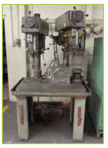
CLAUSING 2285 DUAL HEAD DRILLING/ TAPPING MACHINE