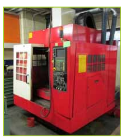
MATSUURA CNC MACHINING CENTER CNC MACHINING CENTER