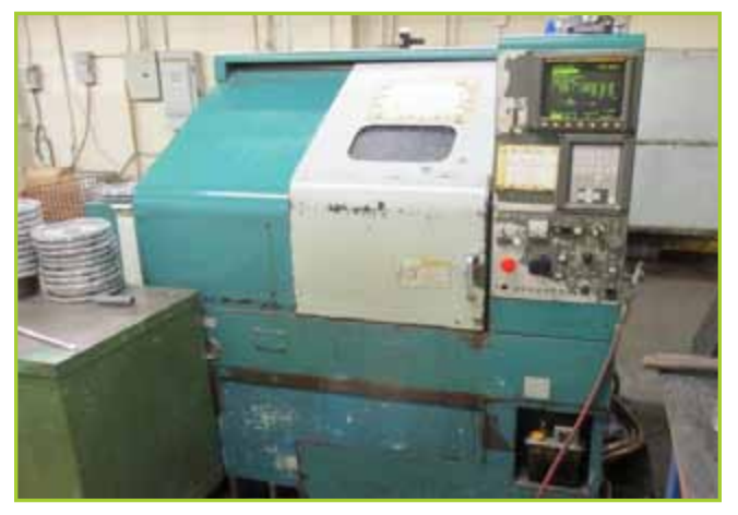
NAKAMURA TMC-18 CNC LATHE, 2-AXIS, CHUCK SIZE 8", SWING 15.74", BAR CAP 2", MACHINING LENGTH 12", 15-HP, 4500 RPM