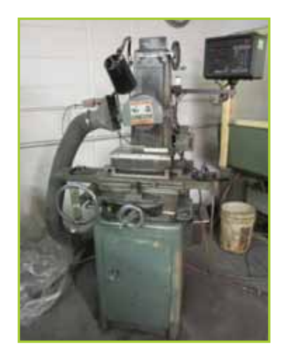
HARIG 612 SURFACE GRINDER, W/ ACU-RITE CONTROLS, 6" X 12" MAGNETIC CHUCK