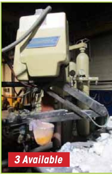
RIMROCK 305 LADLER, W/ MICROLOGIC CONTROLS, 26" STROKE