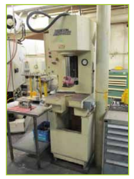
DENISON SO85LC2 MULTIPRESS, 8-TON, 5-HP, 18" DAYLIGHT 7"THROAT 2 25" RAM DIA