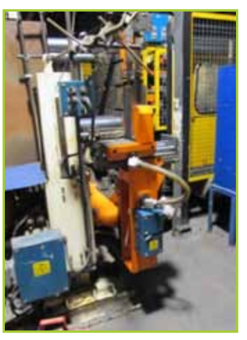
EPAC2 ROBOT, STROKE 70", 38LB CAP, W/ ALLEN BRADLEY SLC5104 CONTROLS