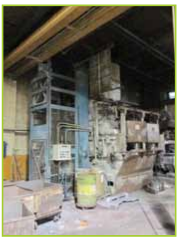
STRIKO PA15480 FURNACE