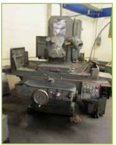
GALLMEYER & LIVINGSTON 470 HYDRAULIC SURFACE GRINDER, 12" X 24" MAGNETIC CHUCK