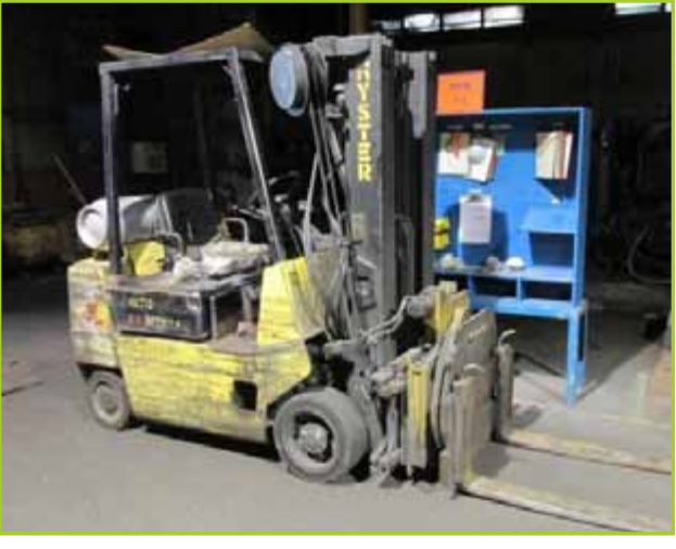
HYSTER S50XL LIFT TRUCK, 4750LB CAP, SIDE SHIT, SOLID TIRES, LPG, W/ SWIVEL FORK ATTACHMENT