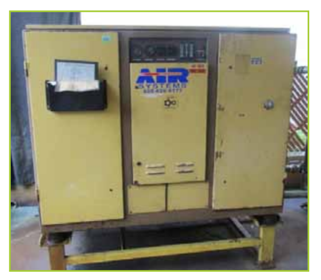
KAESER CS120 ROTARY SCREW AIR COMPRESSOR, 100-HP, 390 CFM, REBUILT 2008