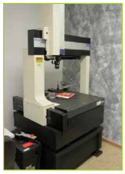
BROWN & SHARPE MICRO XC COORDINATE MEASURING MACHINE, W/ PROBE