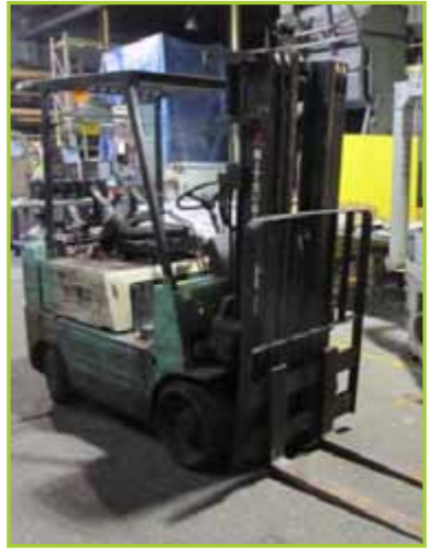
MITSUBISHI FGC25 LIFT TRUCK, 5000LB CAP, LPG, SOLID TIPES