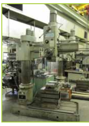
BENCHMASTER MN1 MILLING MACHINE