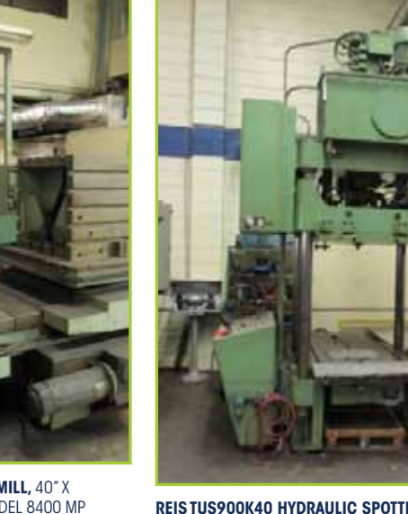
REIS TUS900K40 HYDRAULIC SPOTTING PRESS, 36" X 50" TABLE