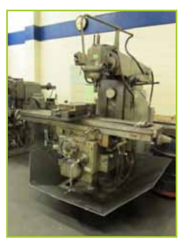
FAMCO PEDESTAL TYPE DRILL PRESS