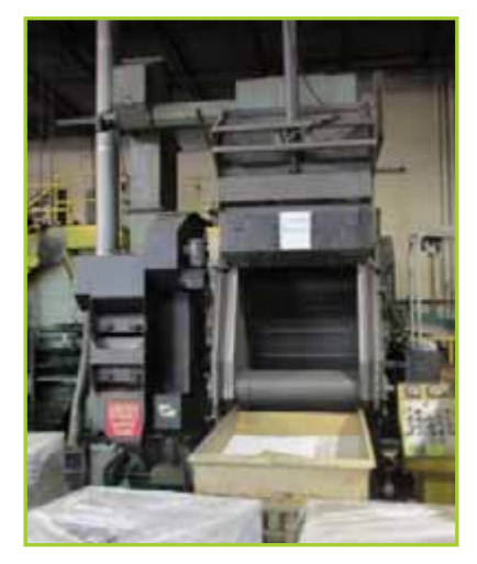
GOFF 12FD TUMBLE BARREL BLAST MACHINE, 12 CU FT