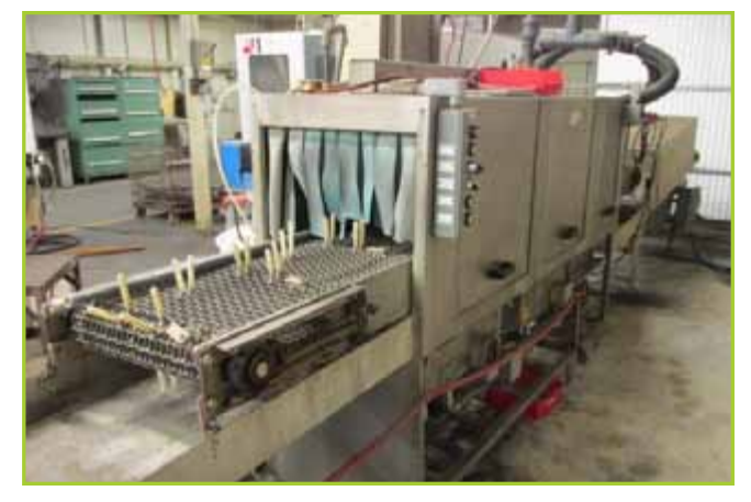
CHAMPION PARTS WASHER & DRYER, WASHER 18" X 141", DRYER 14" X 72", WASH TEMP 140 DEGREE F, FINAL RINSE 140 DEGREE F, CHLORINE 50PPM, FINAL RINSE 20PPM