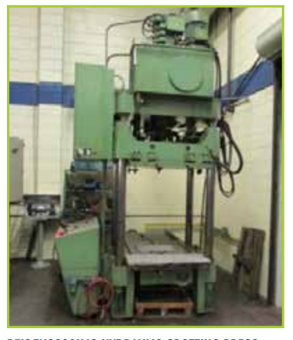
REIS TUS900K40 HYDRAULIC SPOTTING PRESS,