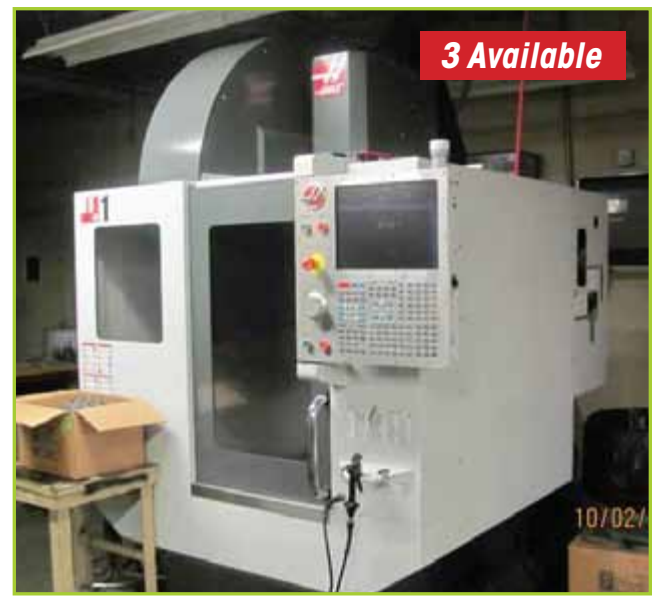
HAAS DT-1 CNC DRILL/TAP MACHINING CENTER, 15,000 SPINDLE SPEED, 15-HP, 15' X 26" TABLE, 20+1 TOOL CHANGER, FEEDRATES: MAX RAPIDS 2400 IPM, MAX CUTTING 1200 IPM, TRAVELS: X-20", Y-16", Z-15.5", CNC CONTROLS, BT30 TAPER, AUGER CHIP CONVEYOR, AUTO AIR GUN, RENISHAW WIRELESS TOOL-SETTING PROBE, YEAR: 2011