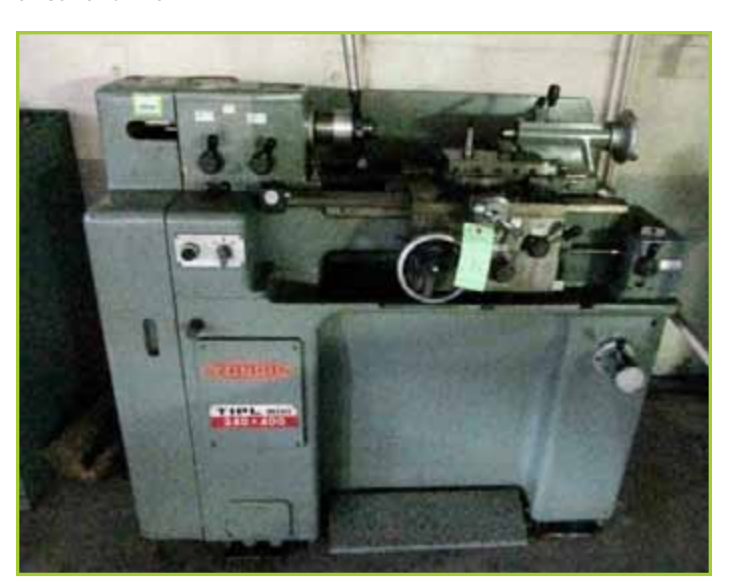
TONSIL TIPL MINI 240 X 400 ENGINE LATHE