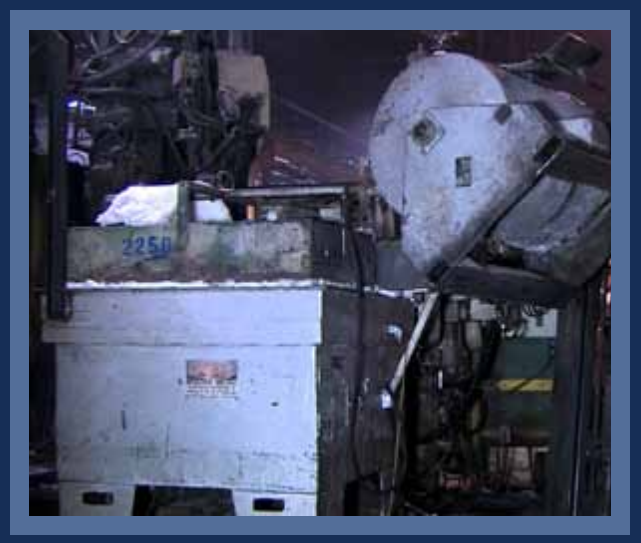
Scan this QR Code with your smartphone for More Information.

Cold Chamber Die Cast Machines • CNC Vertical Mills • Robodrills • Robots • Extractors • Trim Presses • Multipresses • Furnaces • Ladlers • Hot Oil Transfer Carts • Grinders, Lathes & Mills • Forklifts • Dies • And More!