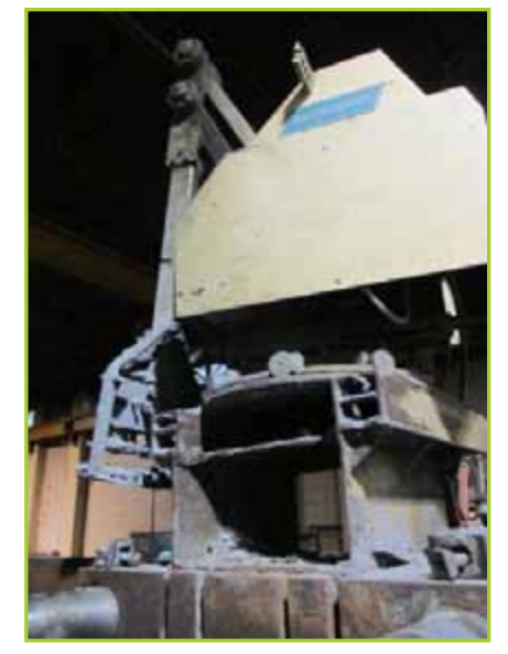
RIMROCK 310 RECIPROCATOR, W/ MICROLOGIC CONTROLS, 60" STROKE