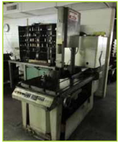
MARVEL SERIES 8 MARK II VERTICAL BAND SAW