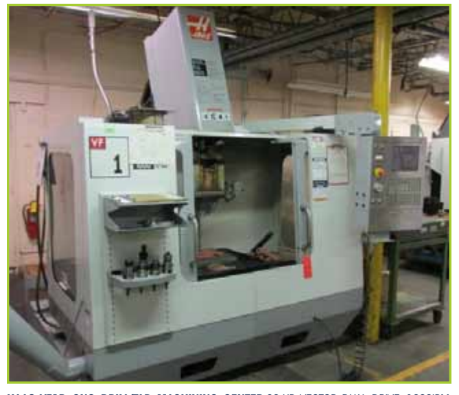
HAAS VF1D CNC DRILL/TAP MACHINING CENTER, 20-HP, VECTOR DUAL DRIVE, 1000IPM, 0-7500 SPINDLE SPEED, 14" X 26" TABLE, 20+1 TOOL CHANGER, FEEDRATES: 0 TO 650IPM, TRAVELS: X-20", Y-16", Z-20", CNC CONTROLS, BT30 TAPER, AUGER CHIP CONVEYOR, YEAR: 2006