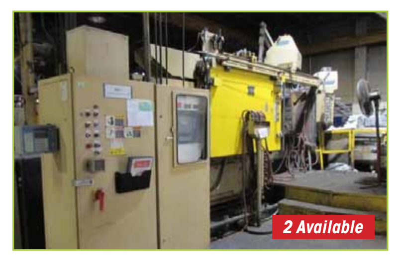
IDRA OL560 COLD CHAMBER DIE CAST MACHINE, 600-TON, ALLEN BRADLEY PLC5 CONTROLS, W/PANEL VIEW SN# 7005. YEAR: 1996