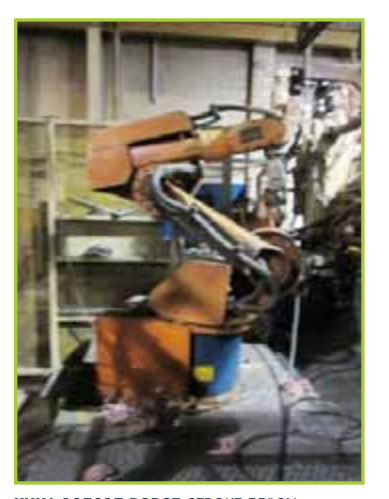
KUKA 105917 ROBOT, STROKE 55" SN# 17289.YEAR: 2000