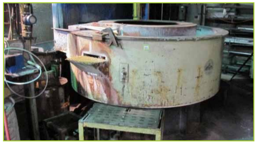
SWECO FMS20 LR VIBRATORY TUB FINISHER, 20 CU FT YEAR: 1987