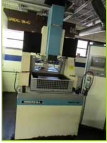
INGERSOLL GANTRY 500 GANTRY TYPE EDM MACHINE, 3R TOOLING, REMCOR CHILLER