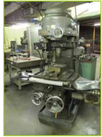
SANFORD HAND FEED SURFACE GRINDER