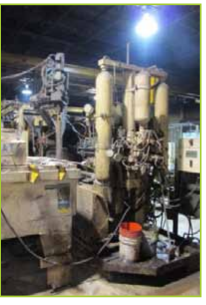
IDRA OL560 COLD CHAMBER DIE CAST MACHINE, 560-TON, ALLEN BRADLEY PLC5 W/ PANEL VIEW CONTROLS