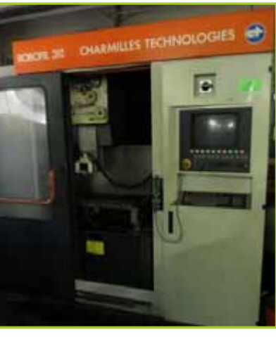
CHARMILLES ROBOFIL 310 CNC WIRE EDM MACHINE, 3R TOOLING & CABINET, & ADVANCE CHILLER