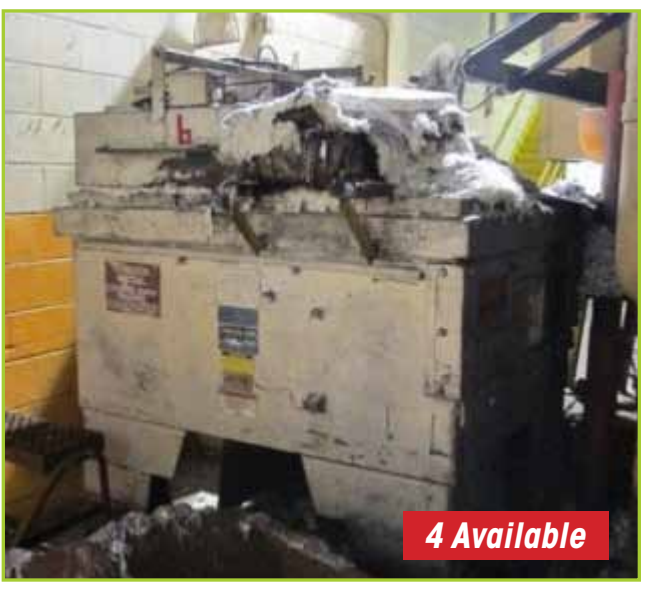
DIE CASE FURNACE & LID, FURNACE 53%57% X 61.5%, ELECTRIC LID 46%31% X 10.25%, W/ HONEYWELL 2500 SERIES DIGITAL DISPLAY CONTROLS & LID