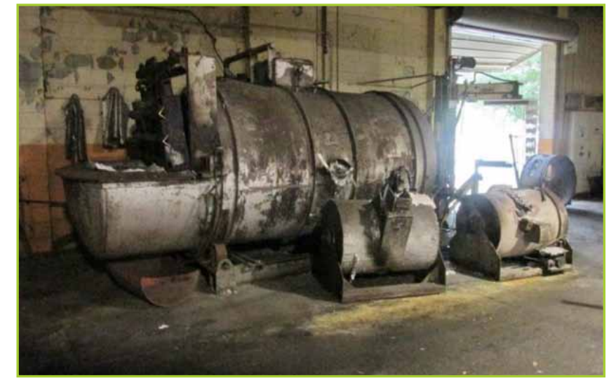
CROWN 30WBTT TRUCK FORK LIFT "WALKY STACKER" ELECTRIC. CAPACITY 3000LBS., MAX HEIGHT 154"