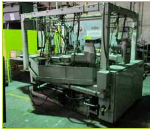
DIAL MACHINE, 6-POSITION, DRILLING AND TAPPING, DIAL BASE