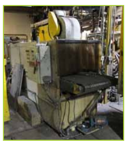
PRAB COOLING STATION, 30" X 12'