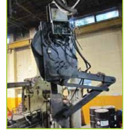
RIMROCK 305 LADLER, MICROLOGIC CONTROLS

LARGE QUANTITIES OF MACHINE TOOLS, MOTORS & PUMPS, GRANITE SURFACE PLATES, SCALES, GAGES, TESTERS, TRANSFORMERS, HOISTS, WORK TABLES, PARTS RETRIEVAL SYSTEM AND MUCH MORE!