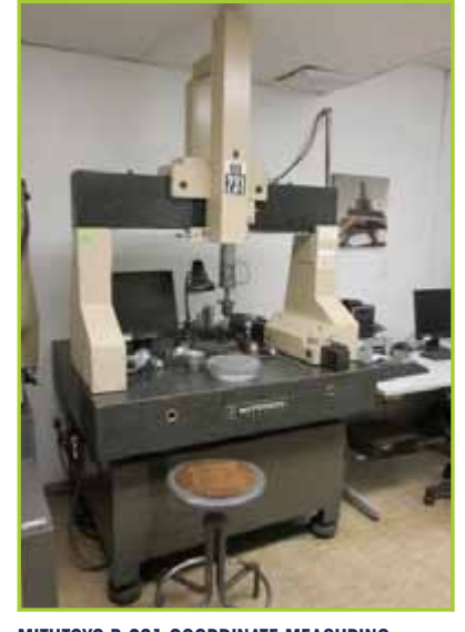
MITUTOYO B-231 COORDINATE MEASURING MACHINE, W/ PROBE