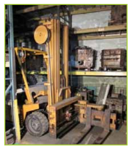
KOMATSU FG35SI TYPE G LIFT TRUCK, 14,000LB CAP, SIDE SHIFT, SOLID TIRES