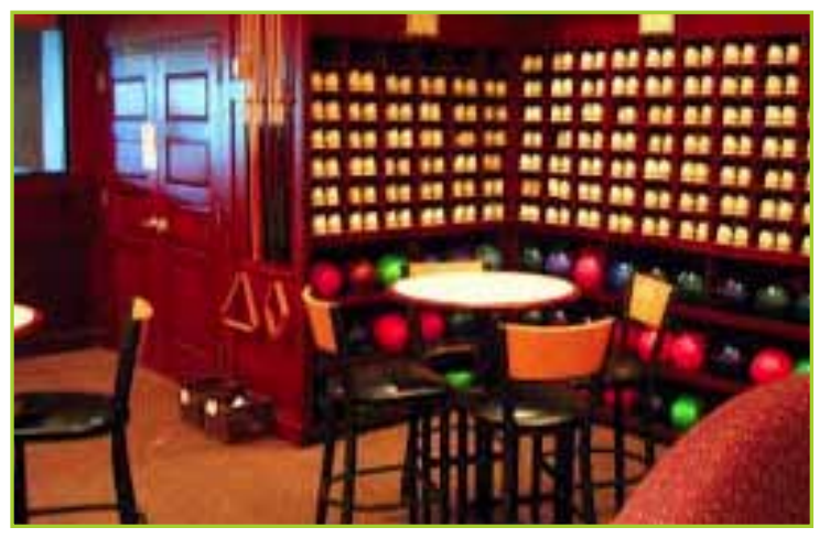
THE LIVING ROOM CREATES THE MOST IMAGINATIVE, EXCITING, AND MEMORABLE ENTERTAINMENT VENUE IN KANSAS CITY. COMBINE THE APPEAL OF BOWLING WHILE INFUSING A SENSE OF SOPHISTICATION, WHIMSY, HIGH STYLE AND FUN...IT'S THE LIVING ROOM.