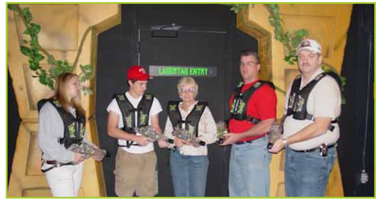
THE PHAROAH'S TOMB: LASER TAG STRATEGY, PLANNING, TEAM BUILDING. LET US AT INCRED-A-BOWL SOLVE YOUR TEAMBUILDING ISSUES. LASER TAG IS THE PERFECT EVENT TO STRENGTHEN EMPLOYEE MORALE, EFFICIENCY AND COMMUNICATION. WITH GAMES FOR UP TO 10 PLAYERS, INCRED-A-BOWL IS PUTTING THE "T" BACK IN TEAMWORK. CALL TODAY FOR SOLUTIONS TO YOUR EMPLOYEE TEAM BUILDING PROBLEMS.