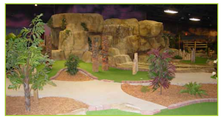
TIKI HUT MINI PUTT WITH TROPICAL SOUNDS TO CREATE THE IDEAL AMBIANCE, A LARGE WATERFALL THAT FEEDS A STREAM THROUGH THE COURSE, A REALISTIC CAVE, BEAUTIFUL DEEP BLUE SKIES, AND PALM TREES, YOU'LL FEEL LIKE YOU ARE MILES AWAY FROM HOME WITHOUT EVEN STEPPING FOOT ON A PLANE. THIS 18-HOLE INDOOR COURSE WAS DESIGNED FOR PEOPLE OF ALL ABILITY LEVELS, AND WITH OVER HALF OF THE HOLES BEING MOVEABLE, YOU'LL HAVE A NEW CHALLENGE EVERY TIME YOU VISIT.