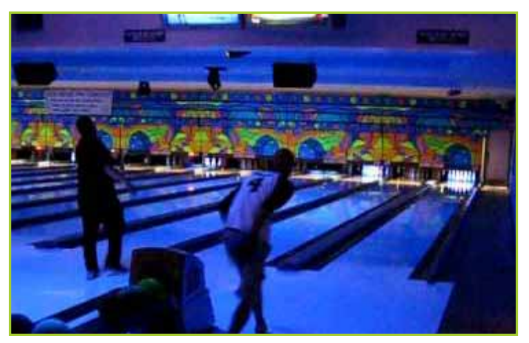
COSMIC BOWL INCRED-A-BOWL IS THE ONLY FACILITY IN THE AREA THAT OFFERS OUR UNIQUE BRAND OF COSMIC BOWL.