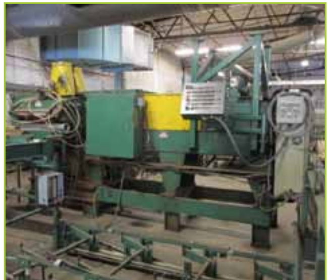
MID-OREGON RIP SAW LINE MID-OREGON RIP SAW LINE. YEAR: 1995