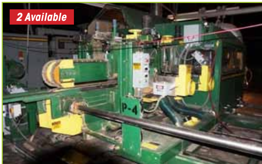
PROGRESSIVE SYSTEMS INCORPORATED 6084 DOUBLE END CNC DOOR LIPPING TENONER. 5 STATIONS. MAIN BASE RIGHT HAND 8 FT CAPACITY. FREE STANDING CONTROLS AND COMPUTER STATION. 4525 HOURS. 460 VOLTS.