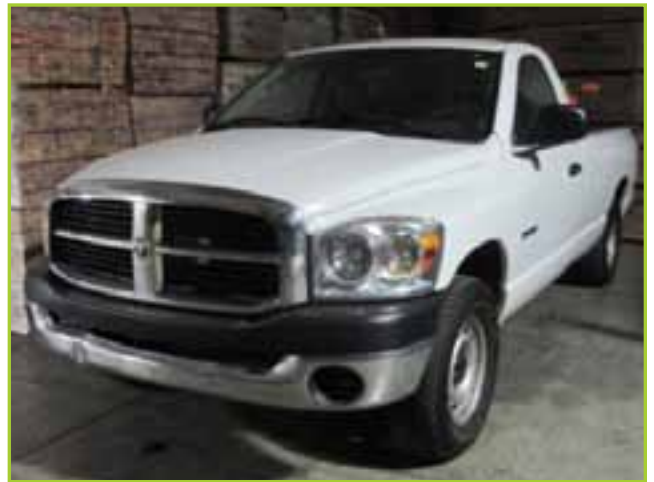
DODGE RAM PICKUP TRUCK, 287,745 MILES. VIN# 1DHU16N38J148400. YEAR: 2007