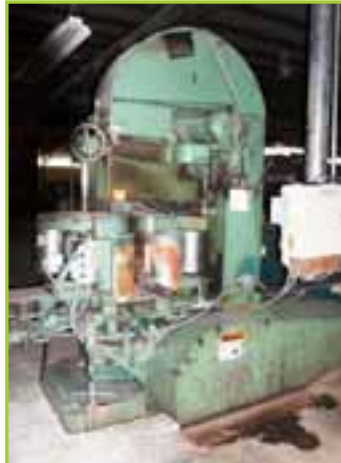
TURNER E48 RE-SAW BAND SAW