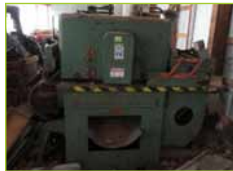
MERREEN-JOHNSON NO 424 GANG RIP SAWA