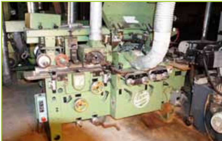
WEINING U 17 AL 5-HEAD THRU FEED HIGH SPEED MOULDER

MILLFAB: 433 E SOUTH ST, STOUGHTON, WI • HOLLEY MOULDING: 137 STATE HIGHWAY 37, SARCOXIE, MO