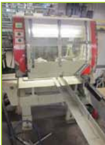
LINARES FEED MASTER 1F-80 FEED SYSTEM