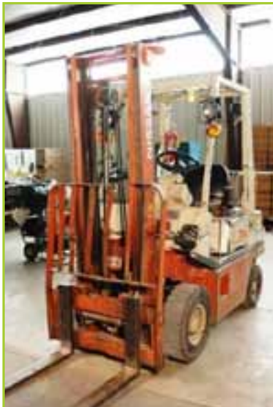
NISSAN PH01A15V 2 STAGE CLEAR VIEW MAST WITH LIFT CAPACITY TO 130"