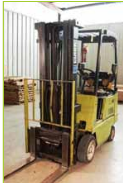
CLARK GCS15 3 STAGE CLEAR VIEW MAST WITH LIFT CAPACITY 2,700# TO 188"