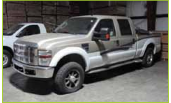
FORD F-250 PICKUP TRUCK, EXTENDED CAB, 5.8L TRITON V10. VIN# 1FTSW21Y48EA78139. YEAR: 2007