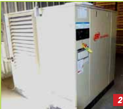
INGERSOLL RAND SSR-EP75 ROTARY SCREW SKID MOUNT AIR COMPRESSOR. YEAR OF MFG. 2004