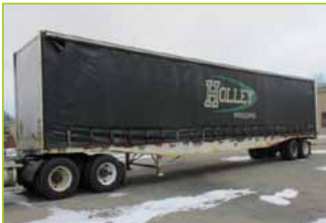
AZTEC TRAILER, TANDEM AXLE, GVWR 50,000, GAWR 22500, TIRES 82.5 X 22.5. VIN# 149BR2A13RM100430. YEAR: 1993