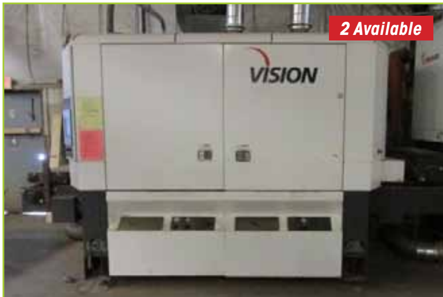
(2) TIME SAVER 7300 SANDER, W/ AC TECH MC TIMESAVER CONTROLS