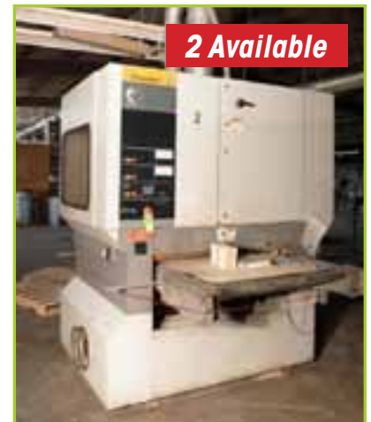
WEINIG RONDAMAT 960 PROFILE GRINDER WITH 16 USED HYALOCK MOULDER HEADS