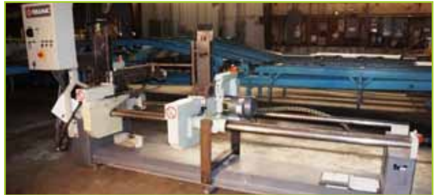
FRIULMAC FN3-2500 HYDRAULIC THROUGH FEED DOUBLE END CUTOFF SAW. YEAR OF MFG. 1996