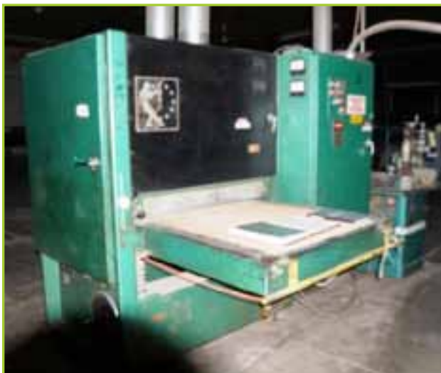
TIMESAVER 337-2 2 HEAD 36" WIDE BELT SANDER