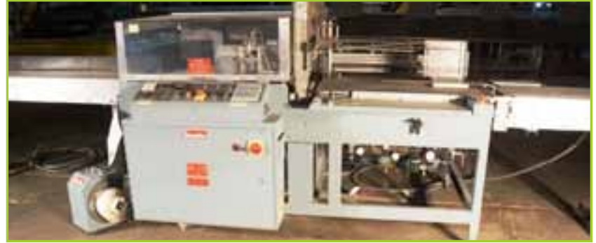
SHANKLIN CF-1 SHRINK WRAP LINE WITH SHANKLIN HEAT SHRINK TUNNEL MDL #T-7XL. YEAR OF MFG. 1997