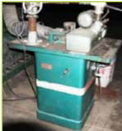
POWERMATIC 26 SHAPER WITH INCOR 3-ROLL POWER FEEDER