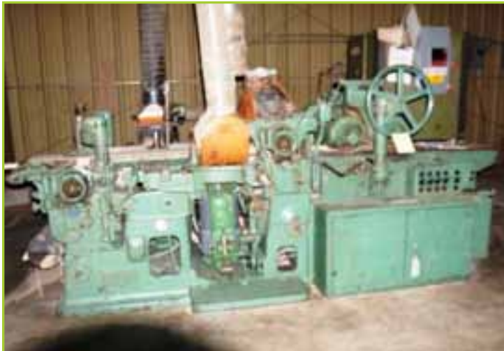
MATTISON 226 4-HEAD 12" MOLDER