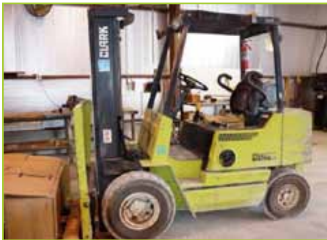
CLARK GPX25 3 STAGE CLEAR VIEW MAST WITH 188" LIFE NIGHT CAPACITY