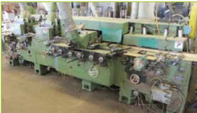
WEINIG U22B MOULDER MACHINE, 7-HEADS, FEEDTHROUGH W/TABLE