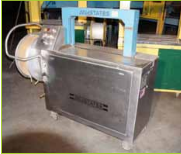
MIDSTATES 790 CYKLOP AUTOMATIC STRAPPING MACHINE. YEAR OF MFG. 1996

MILLFAB: 433 E SOUTH ST, STOUGHTON, WI • HOLLEY MOULDING: 137 STATE HIGHWAY 37, SARCOXIE, MO