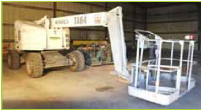
TEREX AERIALS TA64 KNUCKLE BOOM LIFT, SELF-PROPELLED

MILLFAB: 433 E SOUTH ST, STOUGHTON, WI • HOLLEY MOULDING: 137 STATE HIGHWAY 37, SARCOXIE, MO