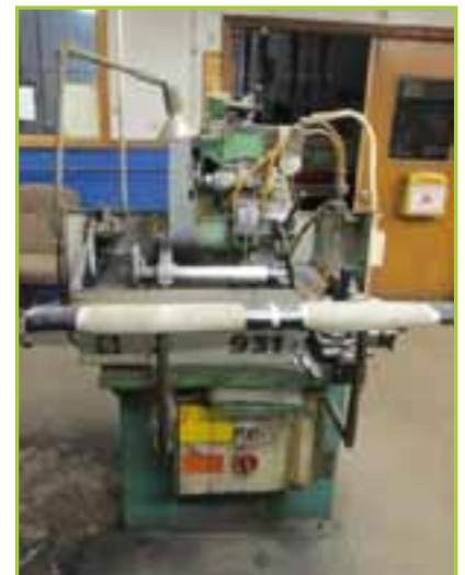
WEINIG 931 PROFILE GRINDER