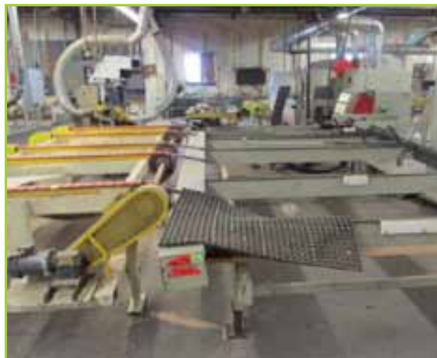
ASSORTED TRANSFER TABLES