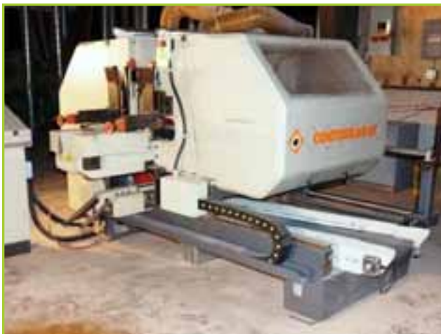
FRIULMAC CONTOURAMAT DOUBLE END AUTOMATIC CUT PROFILING MACHINE