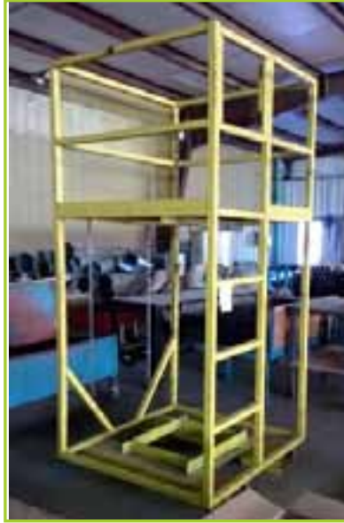
MAN LIFT FORKLIFT ATTACHMENT