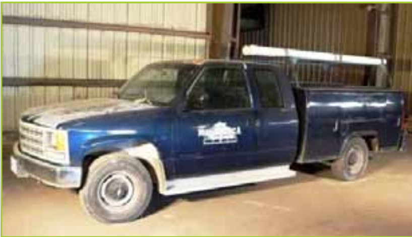
CHEVROLET CHEYENNE C/K CREW CAB PICKUP TRUCK WITH STAHL GRAND CHALLENGER TOOL BOX INSERT