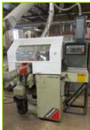
LINARES STAR SP-150 SPLITTER SAW