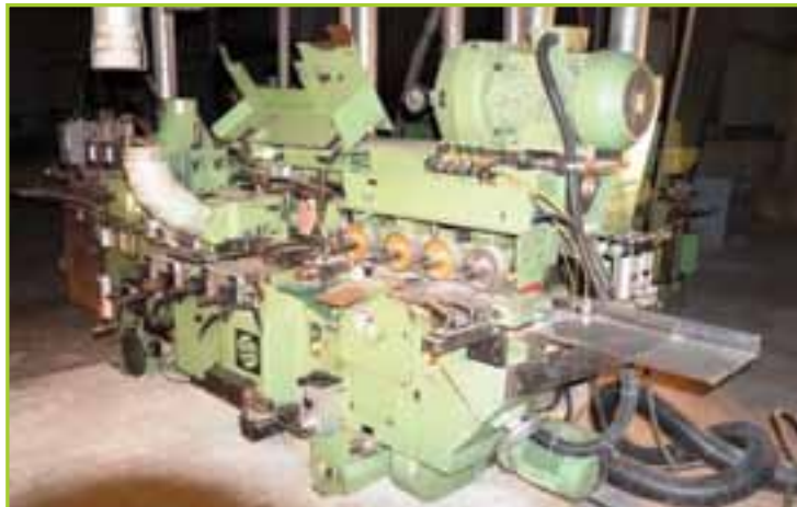
WEINING H 22 AL HYDROMAT WITH OUT- FEED FLAP SANDER