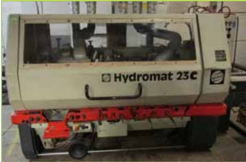
WEINIG HYDROMAT H23C 6-HEAD MOULDER MACHINE W/TABLE