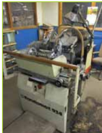
WEINIG 934 PROFILE GRINDER