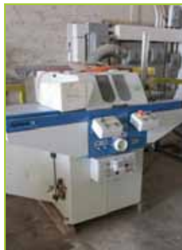
OMGAN T188 TILE MACHINE