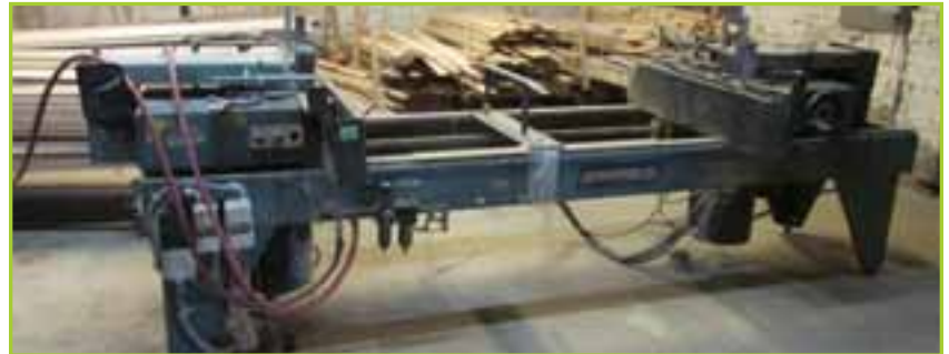
NORFIELD 1020 DOUBLE END MITER TRIM SAW