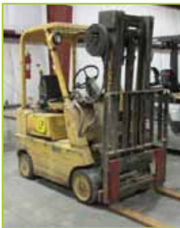
HYSTER S40F FORK TRUCK, LPG, SIDE SHIFT, SOLID TIRES