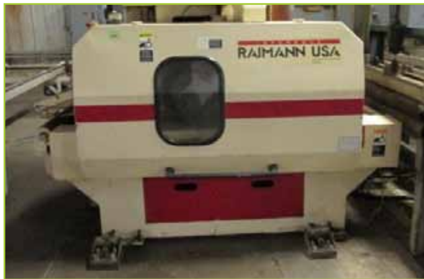
INTERHOLZ RAIMANN KRUS 18" BV/KR GANG SAW, MAX TOOL 11.8", MIN TOOL 9.8", 87 PSI, 460V, 60 HZ