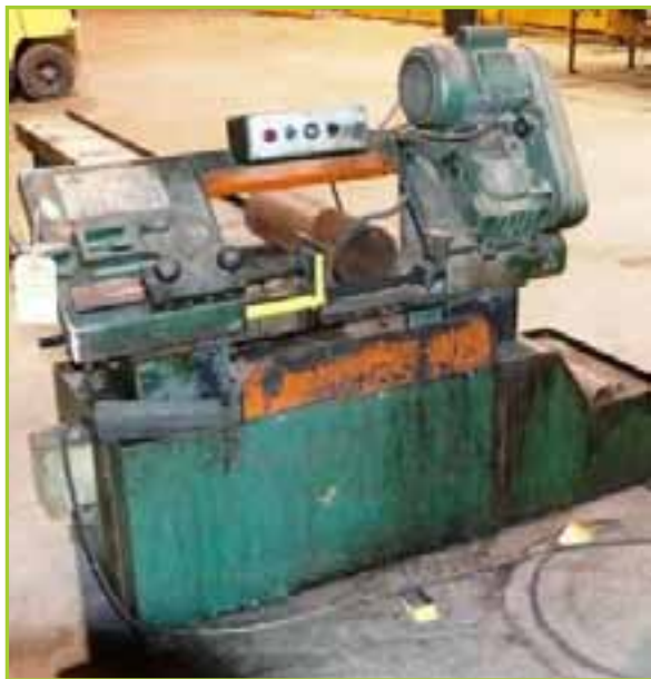
HORIZONTAL METAL CUTTING BAND SAW