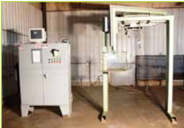
BURR MULLIN 6-CHAIN COMPU-RIP SYSTEM WITH 6-CHAIN LANDING AREA, CANTED ROLL CASE INFED TO GANG SAW WITH COMPUTER CONTROLLED FENCE

1 – Ingersoll Rand NLM300 Module Filter. Year of Mfg. 2004