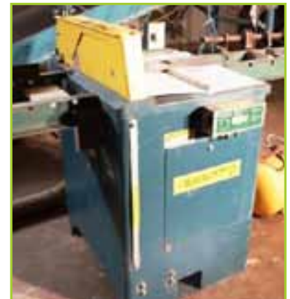
P&H 25 TON BLOCK AND HOOK, 7 SHEAVE