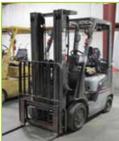
NISSAN MCP1F2A25LV FORK TRUCK