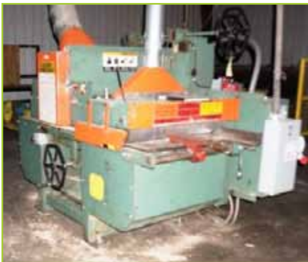
MEREEN JOHNSON 424DC STRAIGHT LINE GANG RIP SAW