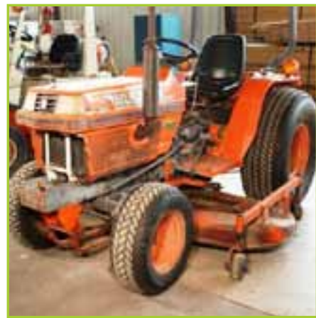
KUBOTA B2150 TRACTOR WITH MOWER DECK. HYDROSTATIC TRANSMISSION