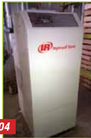
INGERSOLL RAND NVC400A400 R404 REFRIGERATION. YEAR OF MFG. 2004