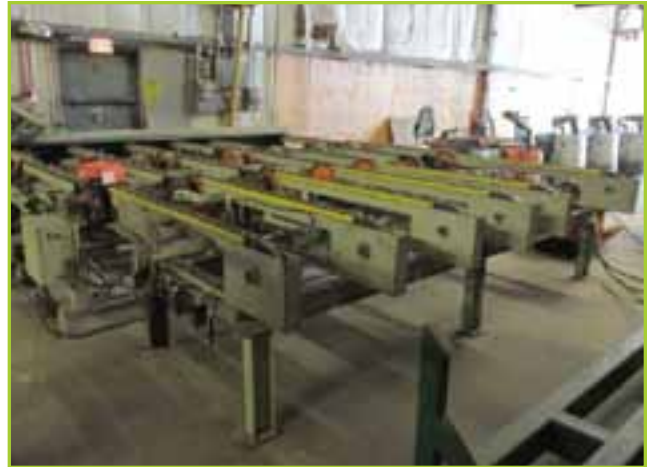
(2) TRANSFER TABLE, 16' X 16'