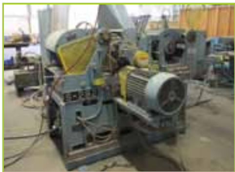
NEWMAN WHITNEY S-282 RIP SAW LINE