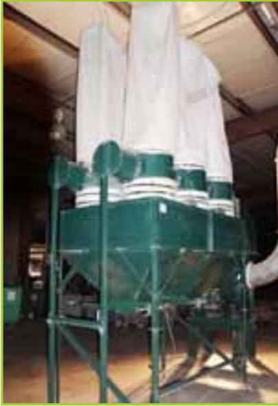
BAG DUST COLLECTOR; USED WITH TENONERS