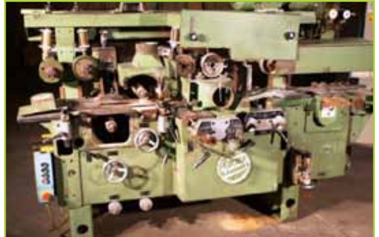
WEINING 143 AL 77 5-HEAD MOULDER. YEAR OF MFG. 1985