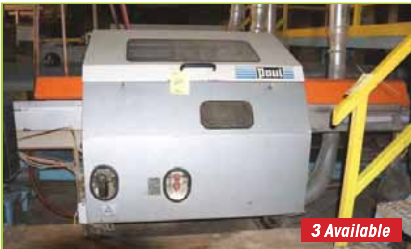
PAUL 11MKL KICKER STATION, SORTING CHUTE & PLATFORM. ROOF TOP DELIVERY CHAIN CONVEYOR DECK. 480-500 MM CARBIDE SAW BLADES. WORK PIECES; MIN 500 MM LENGTH, 200 MM WIDTH, 80 MM THICKNESS. YEAR: 1996