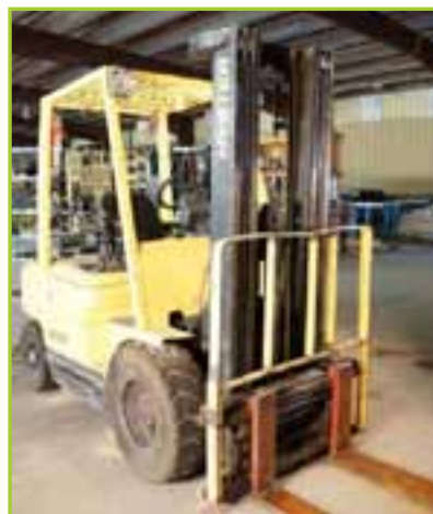
PROGRESSIVE SYSTEMS I