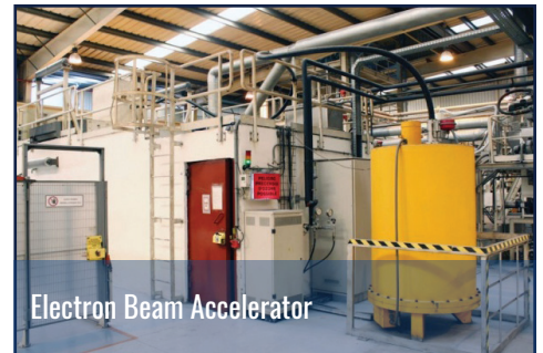
Electron Beam Accelerator