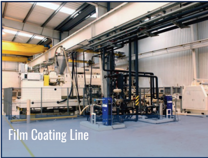
Film Coating Line

Immediately Accepting Bids ENDS: April 29, 2016 - 3:00 CEST