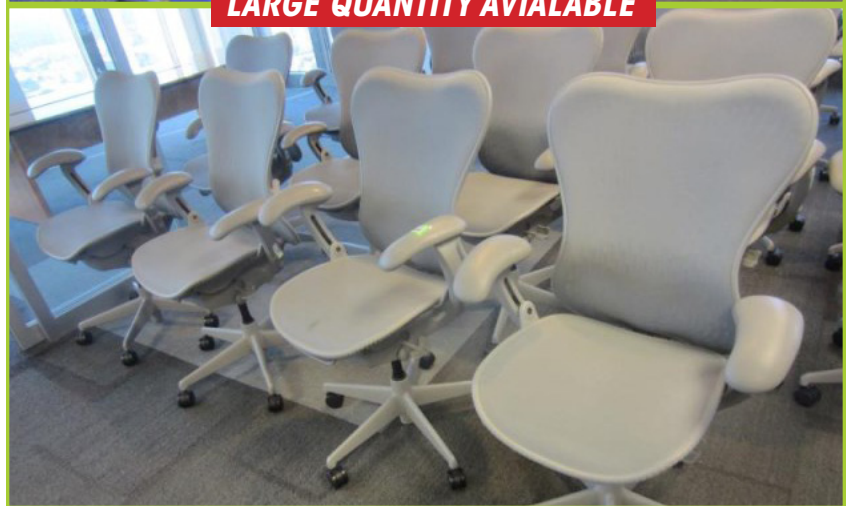
HERMAN MILLER MR133AAF CHAIRS, GRAY COLOR. YEAR NEW: 2006