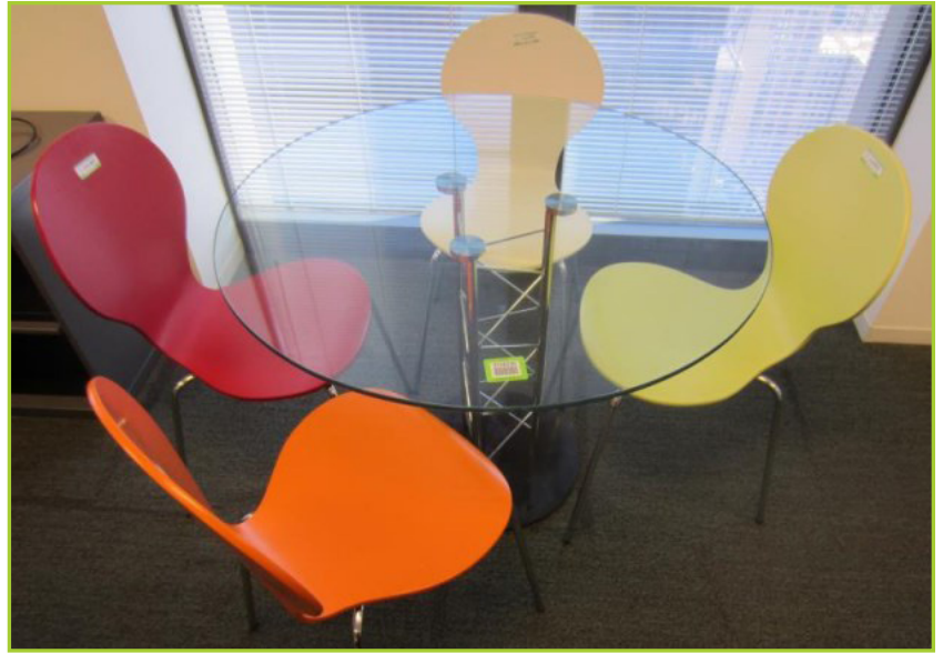
LOT CONTAINS 4 ITEMS: (1) GLASS TOP 39" DIA X 30"TABLE & (3) CHAIRS