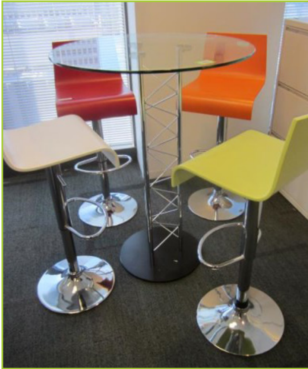
LOT CONTAINS 5 ITEMS: (1) GLASSTOP 32" DIA X 42 1/2"TABLE & (4) CHAIRS