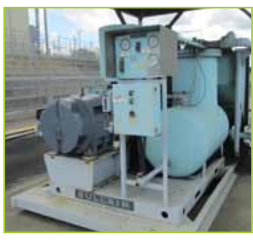
SULLAIR 32-25014 AIR COMPRESSOR SKID, MFG 1980, P/N 41503 WITH 250 HP MOTOR AND INTAKE STATION AIR COMPRESSOR TANK