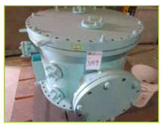
CHANNEL CAROLINA ENERGY SOLUTIONS CHANNEL , HEAT EXCHANGER, FRONT INLET/OUTLET