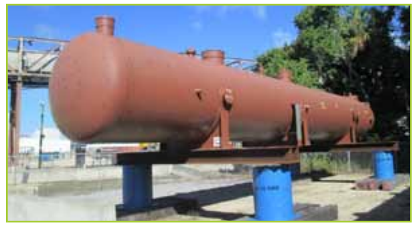
HEAT EXCHANGERS YUBA, SPX HEAT TRANSFER LOT TO INCLUDE (2) HEAT EXCHANGERS, TEST PRESSURE PSI SHELL 445, TUBES 650, TEST TEMPERATURE MIN DEGREE F SHELL 70, TUBES 70, CUSTOMER ITEM EH-5A, MFG. S/N 10-H-468-1A, FEEDWATER HEATERS