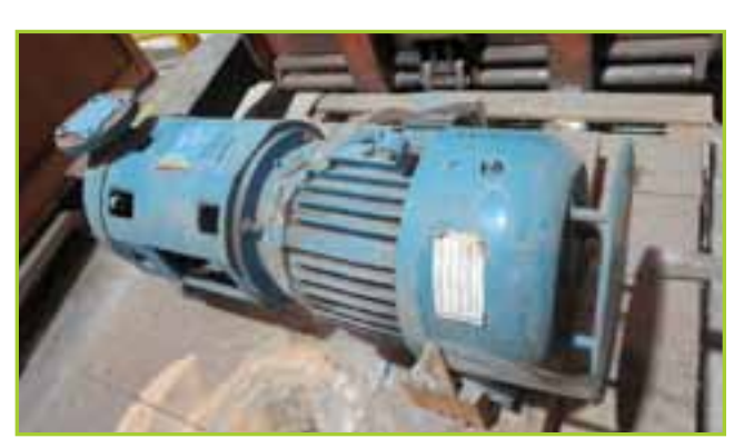
PUMP INGERSOLL-DRESSER PUMP PUMP, WITH 7.5 HP MOTOR, 3X1.5X6 VOC2 3600RPM