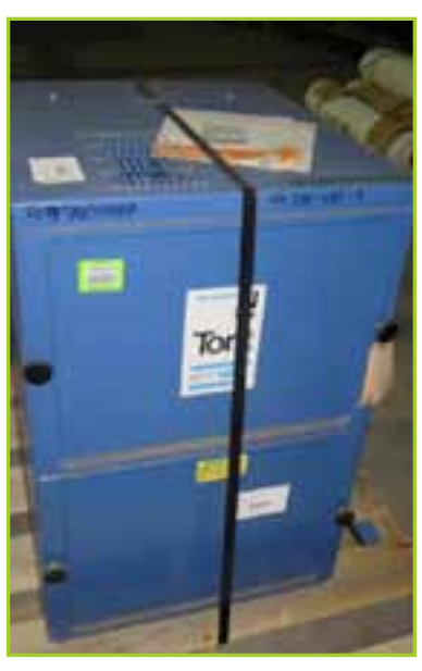
TORIT 64 DUST COLLECTOR, TORIT 3/4HP