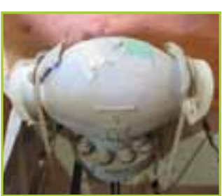
OPEN MARKET 4-MSR-V-145 SWING CHECK VALVE, A216WCB, BWE, DC 6"900 HIRA CS BW YR 1979