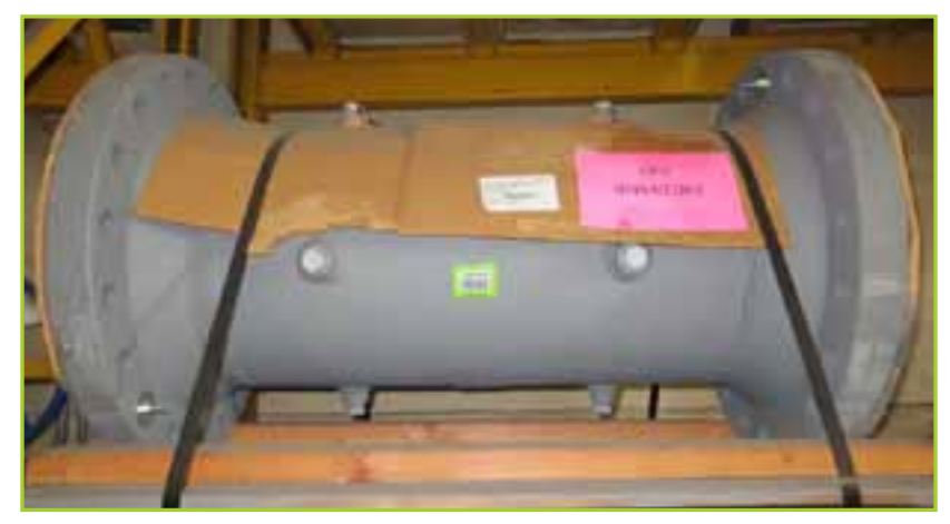
VANE FLUIDIC TECHNIQUES INC VANE, STRAIGHTENING, SPOOL PIECE, FLANGED BOTH ENDS, 16 IN, 300 LB, ASTM A106