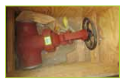
GATE VALVE CRANE-ALOYCO INC 47-1/2-XU-F VALVE, GATE 6"150 47-1/2XU-F .A216 WCB BODY, BWE