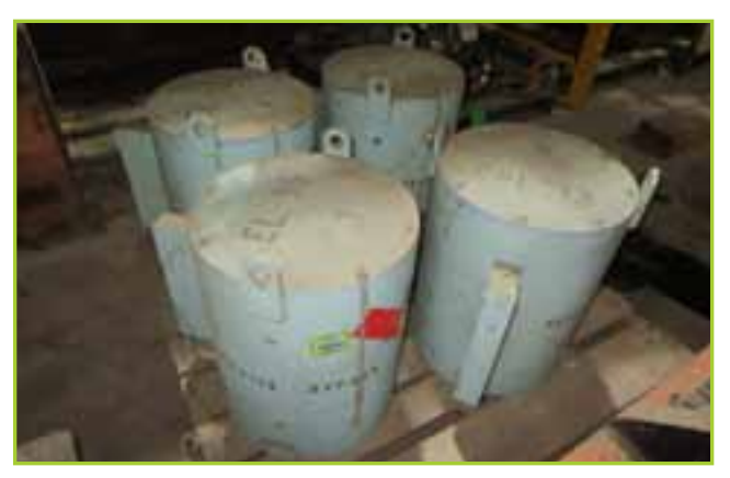
CASK LOT CONTAINS 4 CASKS, LEAD PASS EQUIPMENT