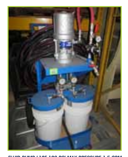
FLUID PUMP L12F 120 PSI MAX PRESSURE 1.5 GPM