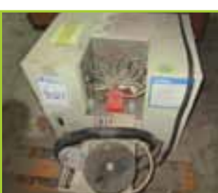
SPECTROMETER PERKIN-ELMER ZEEMAN 5000 SPECTROMETER