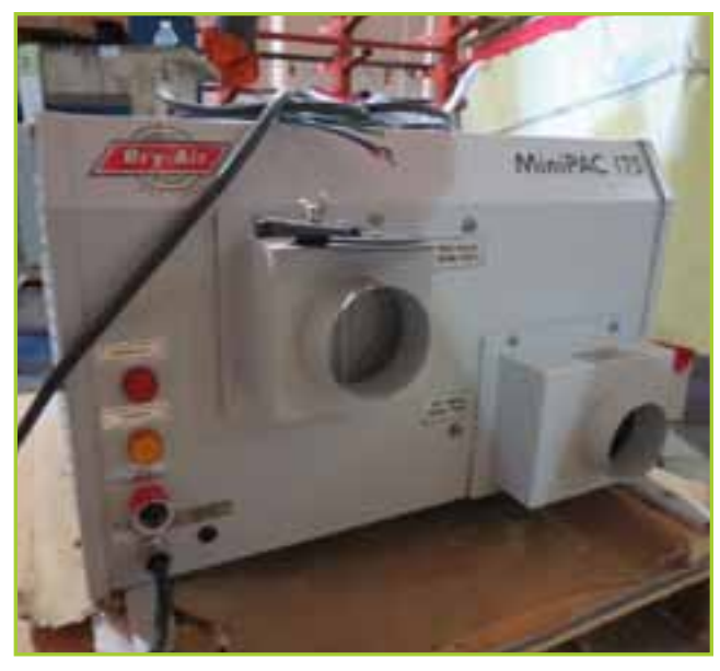
BRY-AIR MP-175 DEHUMIDIFIER, 175 CFM, 208-240V / 1PH / 60 HZ, 5.9 LB/HR, WITHOUT WEATHERPROOFING