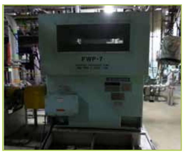
AUXILIARY FEEDWATER PUMP, 900 HP MOTOR, 3510 RPM, 4000V, 800 GPM AT 3300 TDH - TOTAL DESIGNED SPEED