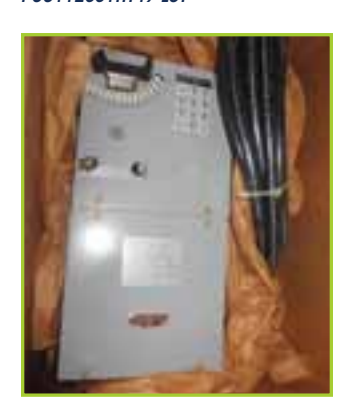
PHONE GAI-TRONICS 770-101-K91-020 LOT CONTAINS 4 PHONES WITH PORTABLE W/AMP SPEAKER, 3 IN ORIGINAL BOX