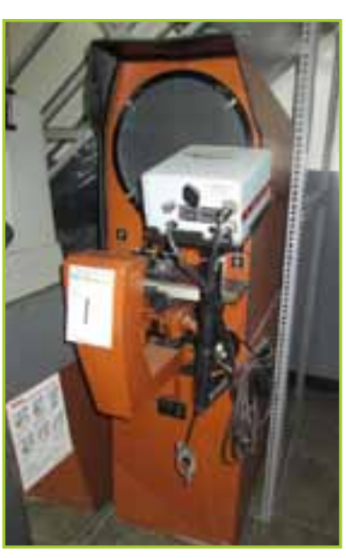
MICRO VU M14 OPTICAL COMPARATOR