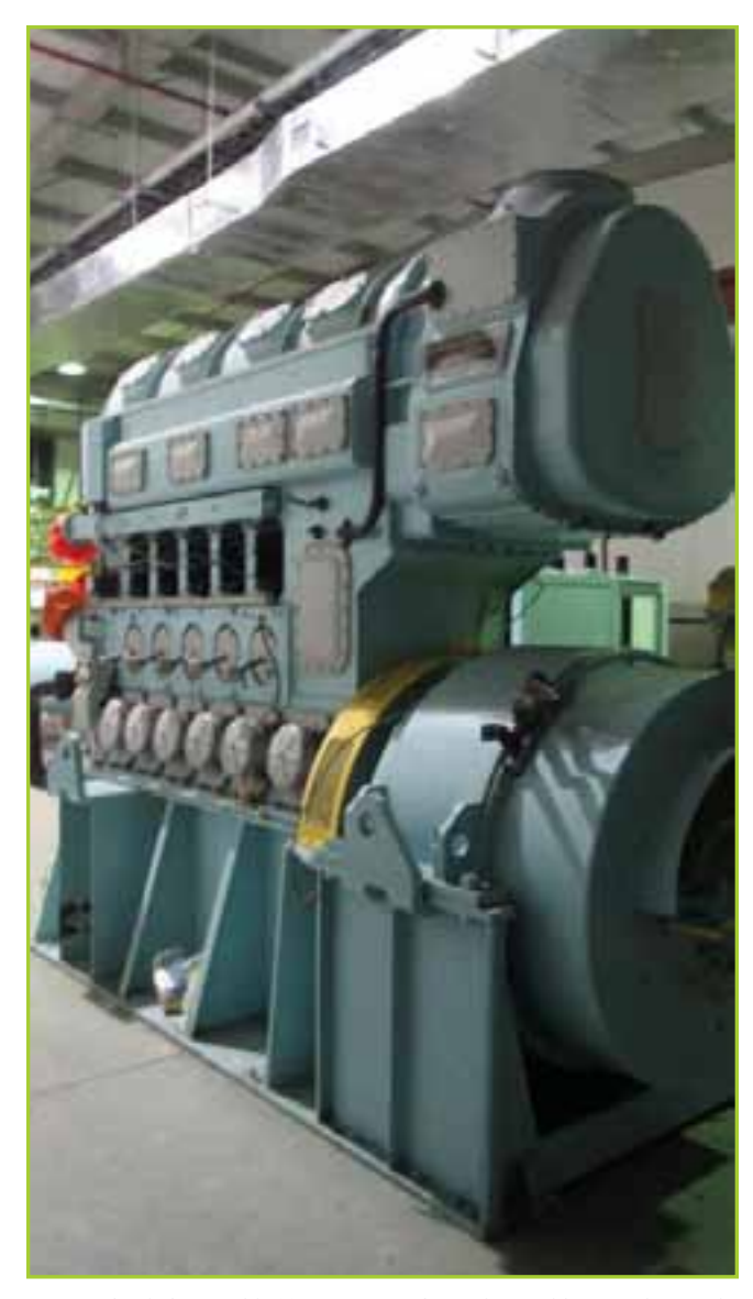
FAIRBANKS MORSE AND CO. 38 N-D8 1/8 DIESEL ENGINE BLOCK WITH GENERATOR, 713 HP, 720 RPM