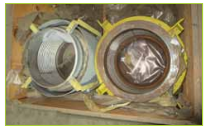
EXPANSION JOINT TEMP FLEX LOT CONTAINS 2 EXPANSION JOINTS, 12"