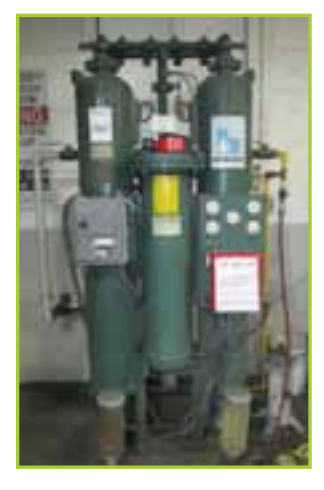
HANKISON 1915 BREATHING AIR PURIFIER