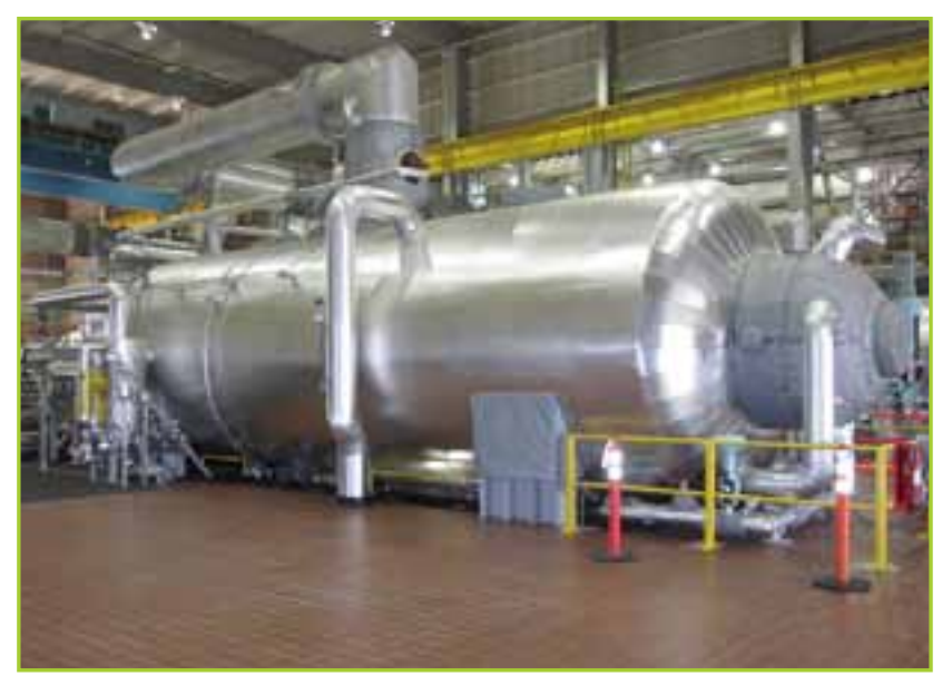
MOISTURE SEPARATOR REHEATER THERMAL ENGINEERING INTERNATIONAL LOTTO INCLUDE (4) 390-INCH BY 15-INCH MOISTURE SEPARATOR REHEATERS (MSRS)