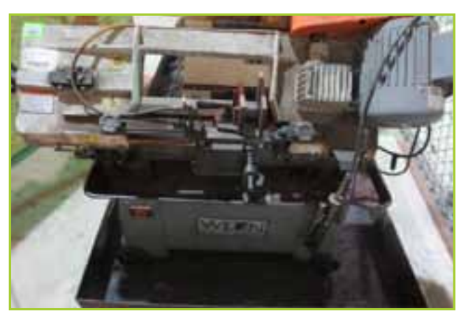
HORIZONTAL BAND SAW WILTON 3410 HORIZONTAL BAND SAW 8/12