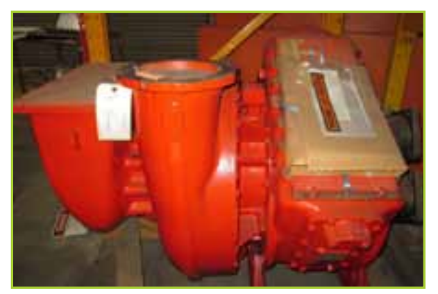
COLTEC IND. INC, ABB 16706850 TURBOCHARGER, ABB TURBO SYSTEMS LTD. TYPE VTC304-13, HZTL 428 765 P2