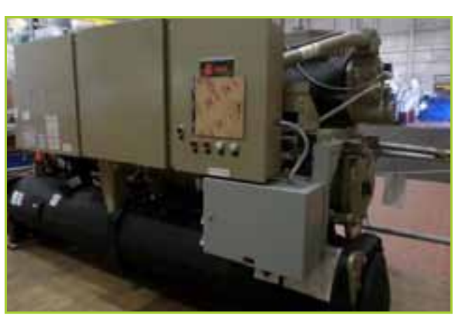
CHILLERS TRANE RTWD200F2A03 LOTTO INCLUDE (2) 200T HELICAL ROTARY CHILLERS, 460V, (2) PASS CONDENSER WITH 8" FLG CONN, (2) 18 X 18 ELASTOMERIC ISOLATION PADS