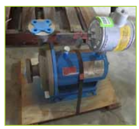
PUMP CRANE CO, CHEMPUMP DIV GB-3K-1S PUMP