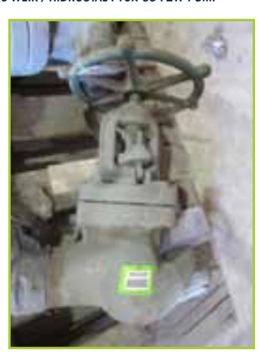
ROCKWELL LOT, 5 CARBON STEEL VALVES