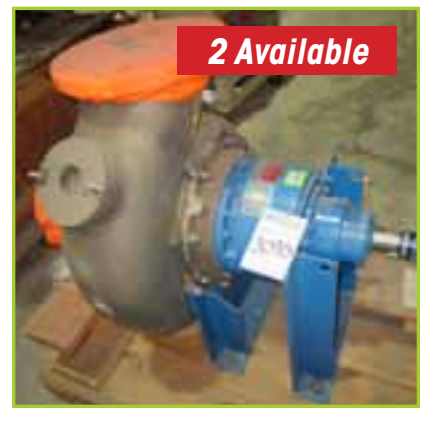
PUMP WEMCO F10K-SS PUMP, COMPLETE ASSEMBLY, 10 X 10 WEIR / HIDROSTAL F10K-SS-F2W PUMP