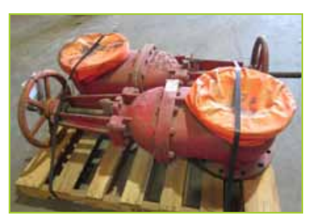
GATE VALVE M & H VALVE CO. LOT CONTAINS 2 GATE VALVES, 10"175 MH HW BB