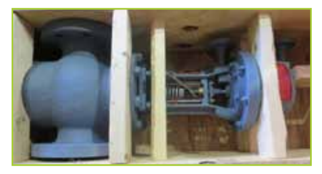
VALVE RUGGLES-KLINGEMANN MFG CO FIG K62526 VALVE, REGULATING, RELIEF / GOVERN, 4 IN, 300 LB, CS BODY, RUGGLES KLINGMANN FIG K80510