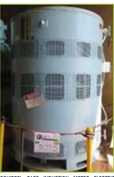
SQUIRREL CAGE INDUCTION MOTOR ELECTRIC MACHINERY HEAVY DUTY MOTOR, PUMP, 2000 HP, 3 PH, 4000V, 60 HZ, 1185 RPM, 5523V FRAME, CL B NS. 1.15 SF. 250 AMP