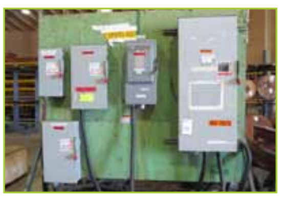
TEMPORARY POWER CART TEMPORARY POWER CART, TPBD-42, 1 MAIN SWITCH AND 9 DISCONNECTS