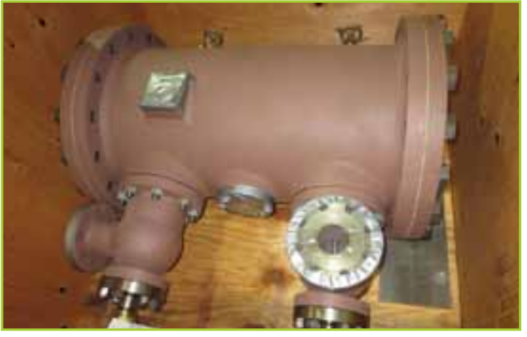
REGULATOR VALVE WESTINGHOUSE 90694 REGULATOR VALVE, P/N-4918D99G01 COMPLETE ASSEMBLY