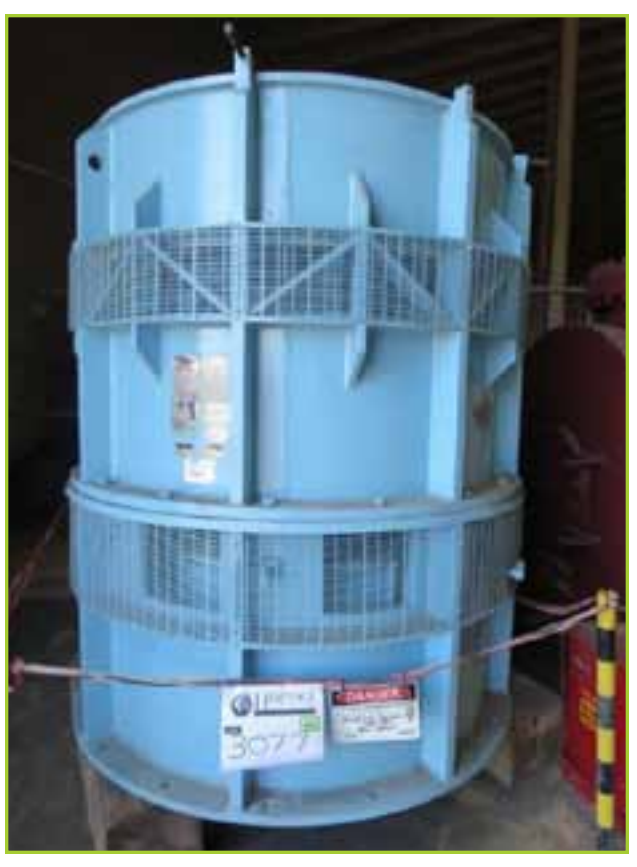
SQUIRREL CAGE INDUCTION MOTOR ELECTRIC MACHINERY HEAVY DUTY MOTOR, PUMP, 2000 HP, 3 PH, 4000V, 60 HZ, 1185 RPM, 5523V FRAME, CL B NS, 1.15 SF, 250 AMP

BIDDERS ARE WELCOME TO BID ON-SITE AT THE AUCTION OR ONLINE VIA BIDSPOTTER.COM