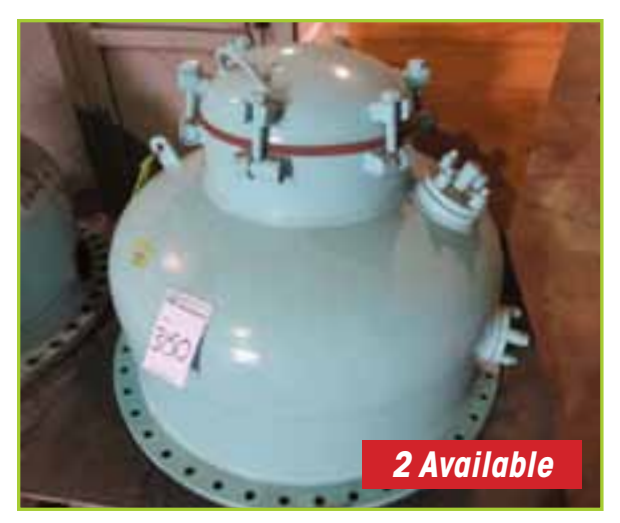
CHANNEL CAROLINA ENERGY SOLUTIONS CHANNEL, HEAT EXCHANGER, RETURN REAR ASSEMBLY, SERVICE WATER HEAT EXCHANGER MFG DATE 2011