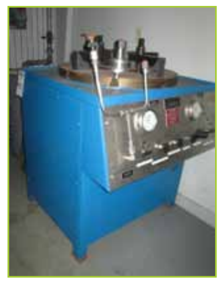
TYCO TB-3000-1 TYCO TB-3000-1 VALVE RESURFACING MACHINE WITH PRESSURE TESTING CAPABILITIES, SINGLE STATION TEST BENCH