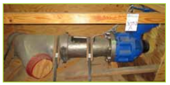
GLOBE ANGLE VALVE EDWARDS VALVE CO 735277 GLOBE ANGLE VALVE, 10 IN, BUTT WELD, CLASS 2, 2500 PSIG, SA351, GRADE CF8M, MANUAL, OS&Y,STANDARD OR FULL PORT, DATE OF MFG: 8/2011