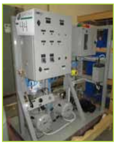
MGP INSTRUMENTS MONITORING SYSTEM SKID, (2) PUMPS, (2) 1/2 HP BALDOR MOTORS