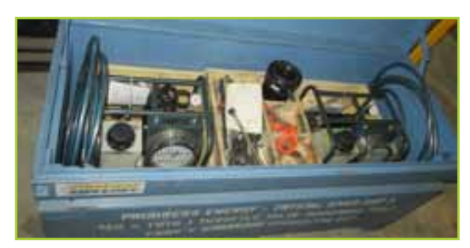
HYDRATIGHT SWEENEY PUMP WITH CASE, HYDRAULIC SYSTEM PUMP