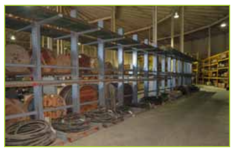
CANTALEVER RACKS LOT CONTAINS 18 CANTILEVER RACKS UPRIGHTS WITH 72 - 36" ARMS AND 48-CROSS MEMBERS