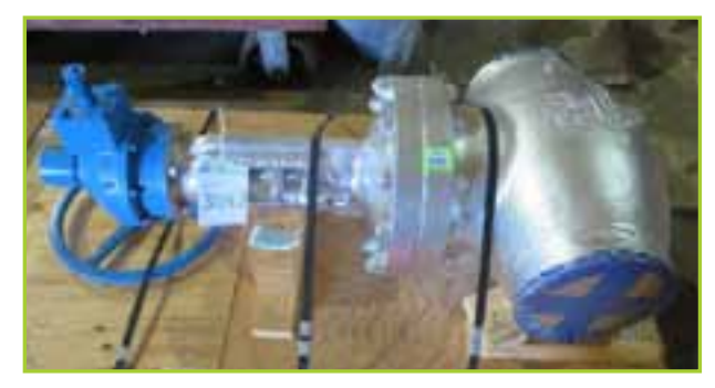
GATE VALVE VELAN VALVE B16-1064C-06TS VALVE, GLOBE, 10 IN, SCHEDULE 40, BUTT WELD, ANSI CLASS 300, CHROME-MOLY, ASTM A217, GR WC9, MANUAL