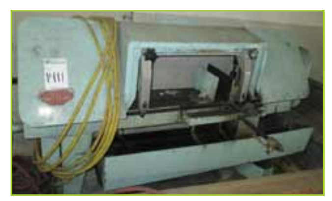
KALAMAZOO 13AW HORIZONTAL BANDSAW 13" ROUND CAP