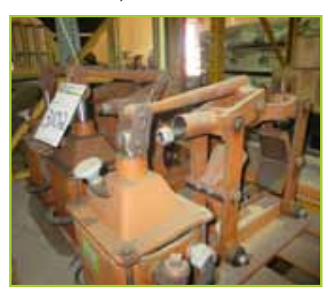
8" SESA BRAKE WHITING CORP 300482C LOT CONTAINS 4 BRAKES, 8" SESA BRAKE, W/SOLENOID