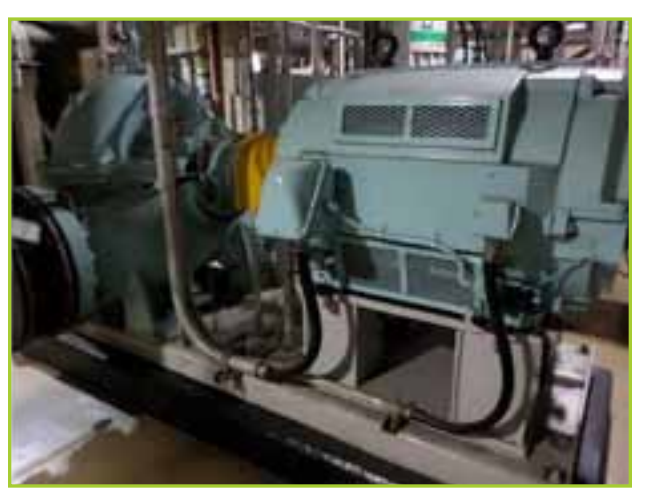
PUMP SKID INGERSOL RAND LOT TO INCLUDE (2) 600 HP RELIANCE ELECTRIC MOTORS, 5808S FRAME, 1192 RPM, 4000V, WEIGHING APPROX. 5100 LBS. EACH, SCP 1A AND 1B, SECONDARY COOLING UNITS