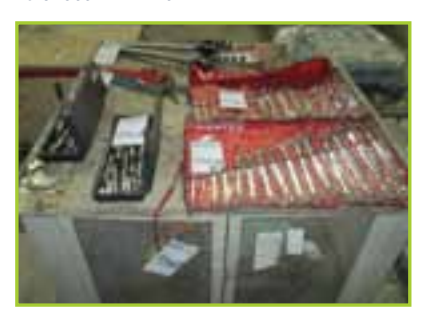
LOT TO INCLUDE (1) CART W/ ASSORTED HAND TOOLS