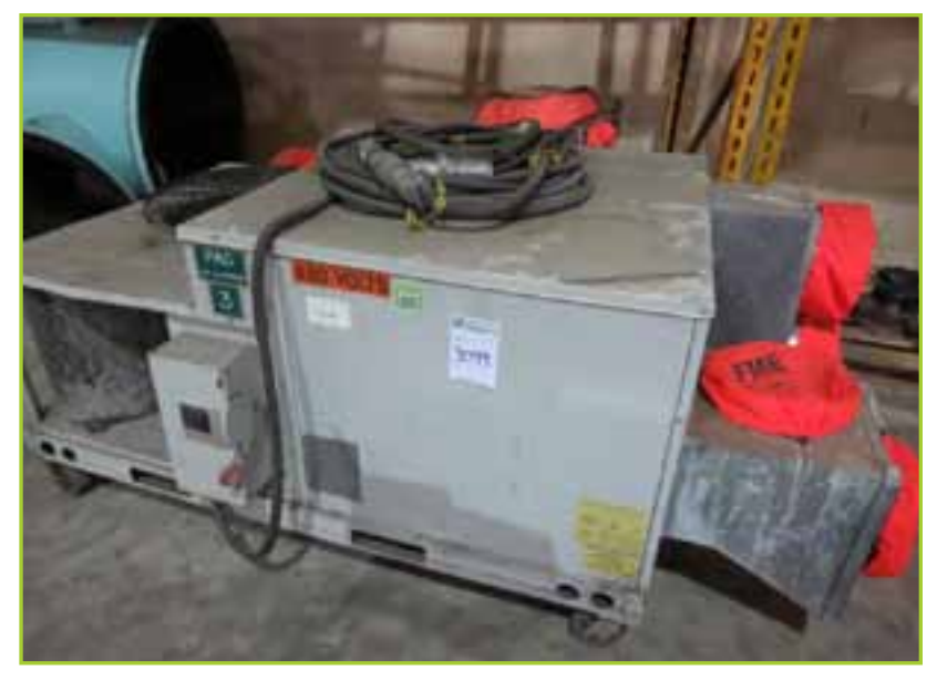
CARRIER 50TJ-006-601 PORTABLE AC UNIT, AIR CONDITIONER, SELF CONTAINED, 5 TON, 460 VOLT