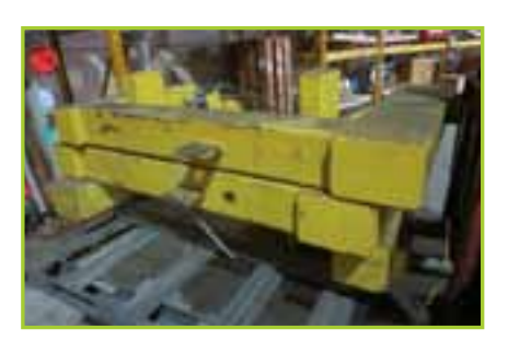
J HOOKS FOR D RING WALLS LOT CONTAINS 5 PALLETS CONTAINING (11) 'J'HOOKS FOR 'D' RING WALLS