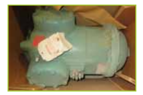
COMPRESSOR CARRIER CORP MDL06DM8186AC0600 LOT CONTAINS 2 COMPRESSORS