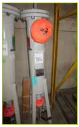
FILTER SYSTEM COMPONENTS CORP PCC112001HT49 LOT