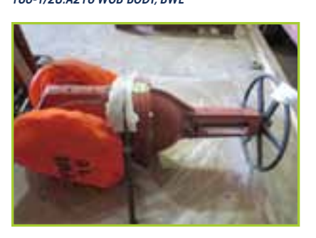
GATE VALVE CLOW CORP F6136 GATE VALVE, 10", 200 PSI WORKING PRESSURE, RESILIENT WEDGE OS&Y DESIGN. CI BODY FLGD ENDS