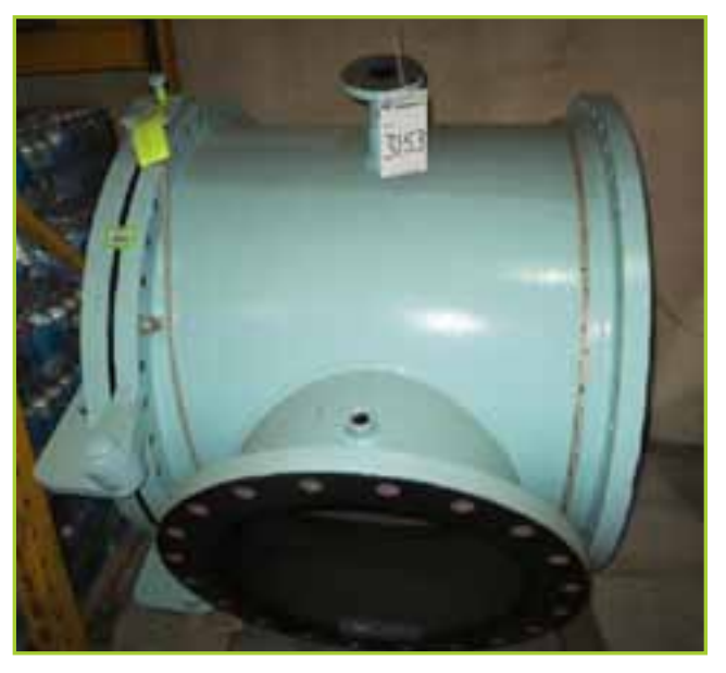
HEAD STODDARD HEAD, CHANNEL, INLET OR OUTLET, WITH HINGED COVER AND 12^{\prime\prime} INSPECTION PORT