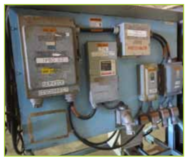
TEMPORARY POWER CART TEMPORARY POWER CART, TPBD-52, 1 MAIN SWITCH, 4 DISCONNECTS & TRANSFORMER