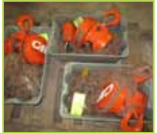
CHAIN HOIST CM HOIST 646-4627 LOT CONTAINS 3 CHAIN HOIST, CM HOIST SERIES 646, 3 TON, 20' LIFT, WITH LOCKING FINGER ON HOOK