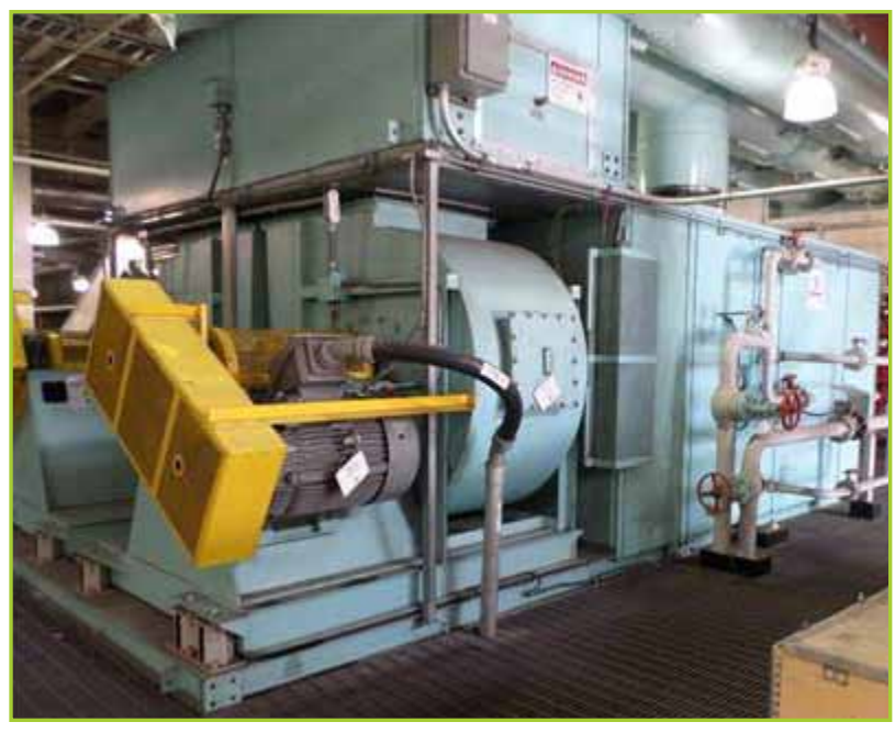
ISO PHASE BUSS DUCT COOLING SKID