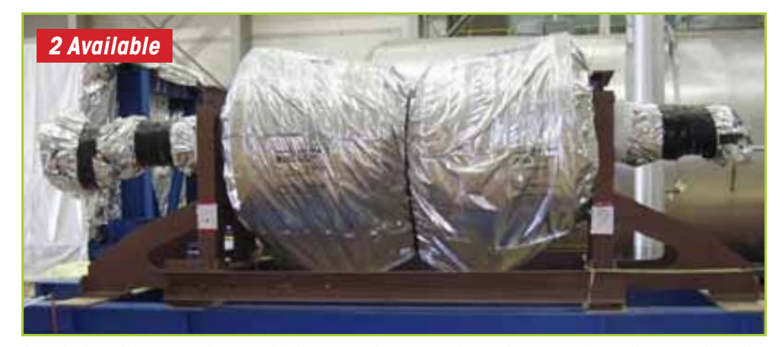
SIEMENS HIGH PRESSURE TURBINE EQUIPMENT: ROTORS, UPPER AND LOWER HP INNER CYLINDERS, UPPER AND LOWER HP GUIDE BLADE CARRIERS, ASSEMBLY HARDWARE, HP GLAND CASINGS, ASSEMBLY PARTS, INLET SEALS, THREADED RINGS AND TURBINE HARDWARE