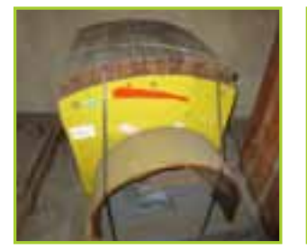
WESTINGHOUSE FIXTURE, TURBINE RIGGING