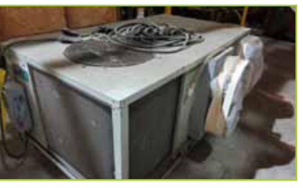
PORTABLE AC UNIT TRANE TCH060C400BC, SELF CONTAINED, 5 TON, 460 VOLT