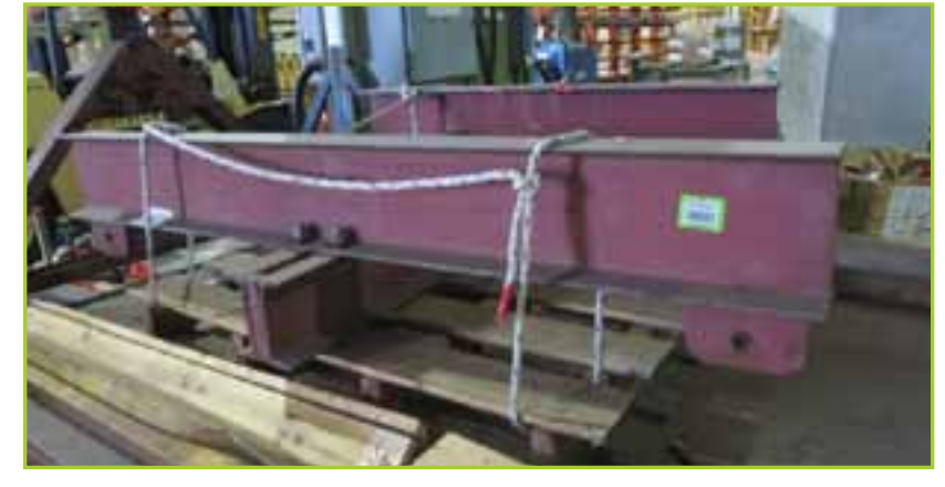
LIFTING RIG ASSEMBLY LIFTING RIG ASSEMBLY 10,000LB CAPACITY.