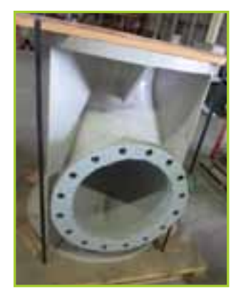
HEAD SULZER BINGHAM PUMP INC. 5110118 HEAD 75, DISCHARGE, FOR BW PUMP 18 X 34B TYPE VCM