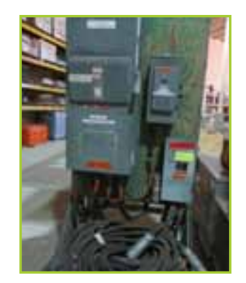
TEMPORARY POWER CART TEMPORARY POWER CART WITH 480V 600AMP 1 MAIN SWITCH, AND & 6 DISCONNECTS