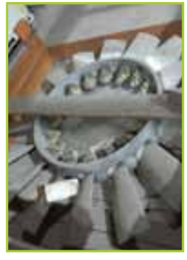
JOY MFG CO NPR 85766 LOT CONTAINS 2 BLADES