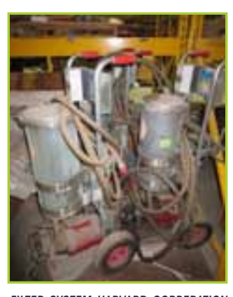
FILTER SYSTEM HARVARD CORPERATION 87T LOT CONTAINS 3 FILTER SYSTEMS