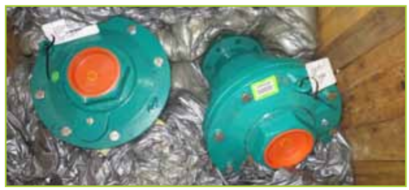
VALVE CRISPIN VALVE AL41 LOT CONTAINS 2 VALVES, COMPLETE, AIR & VACUUM SERVICE, 4"-125#, CAST IRON