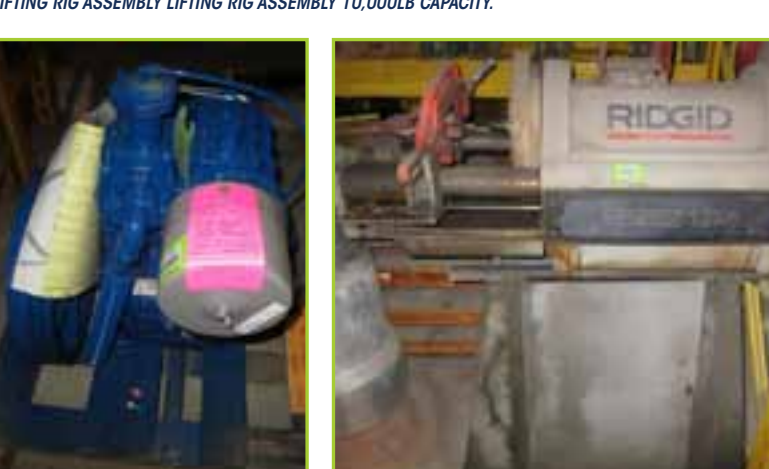
PIPE THREADER RIGID 1224 ELECTRIC PIPE THREADER