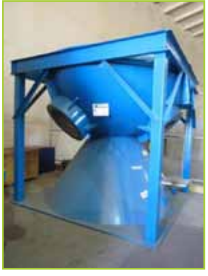
TRAINING MOCK UP DRY VESSELL BABCOCK & WILCOX CO BYDESCRIPTION LOT CONTAINS ITEMS: (1-ASSEMBLY, HEAD, UPPER AND UPPER SHELL, FOR OTSG TRAINING MOCK-UP), (1- LOWER FRAME FOR OTSG TRAINING MOCK-UP), (1- LOWER FRAME FOR OTSG TRAINING MOCK-UP)