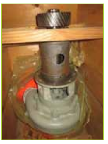
WATER PUMP COLT IND. P/N-16602931