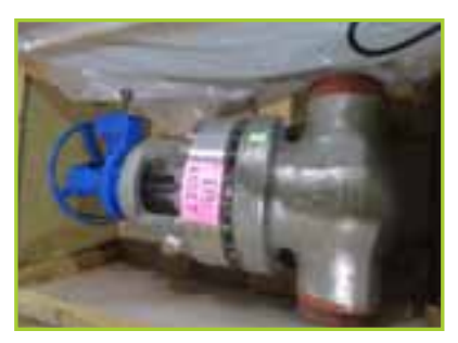
GATE VALVE ANCHOR DARLING 4002221 GATE VALVE, 10 IN, BUTT WELD, CLASS 2, 2500 PSIG, SA351, GRADE CF3M, MANUAL, OS&Y, STANDARD OR FULL PORT DATE OF MFG: 8/2011