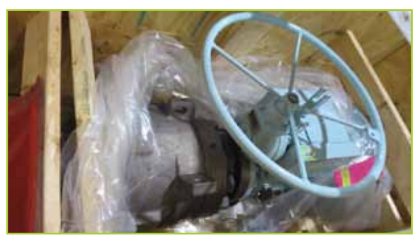
VALVE ASSEMBLY MASONEILAN 88N-41445A VALVE ASSEMBLY , ANGLE,8 IN SCH 80 INLET X 12 IN SCH 60 OUTLET,ASME SA-216,GRADE WCC, MFG. 2011