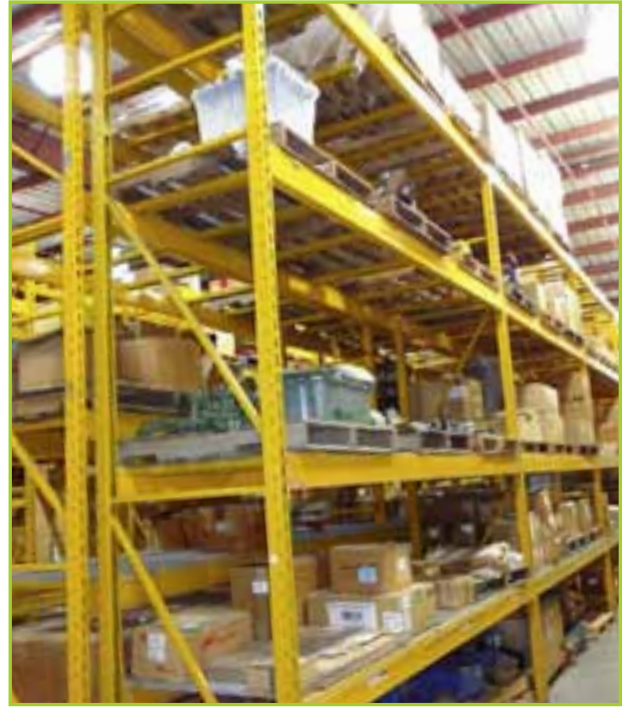
PALLET RACKING LOT CONTAINS 64 SECTIONS WITH MINIMUM 3 SHELVES EACH AND 1 SECTION 8FT WIDE WITH 4 SHELVES