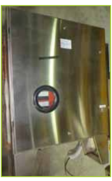
RECTIFIER INTEGRATED RECTIFIER TECH ADASET12100BLPC13W RECTIFIER, ASSEMBLY, CATHODIC PROTECTION, AIR COOLED, 480V, 60 HZ. 3 PH AC INPUT