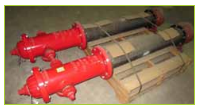
FIRE HYDRANT CLOW CORP 2545 LOT CONTAINS 2 FIRE HYDRANT: ASSEMBLY, UL/FM APPROVED, CLOW MEDALLION 2545, 5 1/4" WITH 4'6" BURY