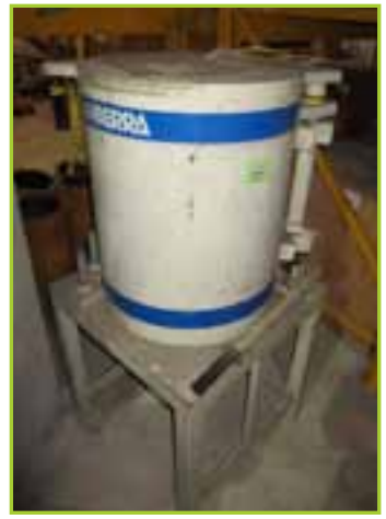
CANBERRA STORAGE MODULE