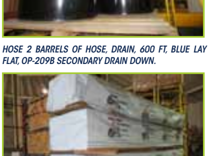
LUMBER LOT CONTAINS 10 BUNDLES OF LUMBER: (9 -BUNDLES 2 X 6 X 16'LUMBER), & (1-BUNDLE OF 2 X 4 X 16'LUMBER)