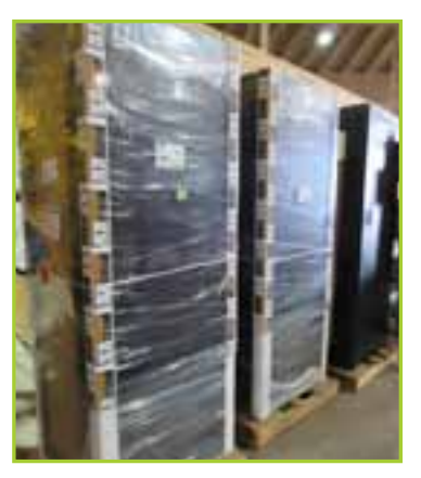
HOFFMAN ENC2178S LOT CONTAINS 3 NETWORK CABINETS