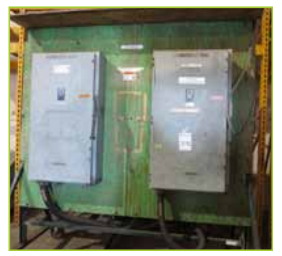
TEMPORARY POWER CART TEMPORARY POWER CART, TPBD-32, 3-400AMP DISCONNECTS & 1 - 200AMP DISCONNECT