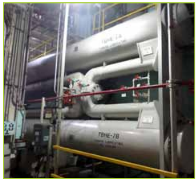
TURBINE LUBRICATING OIL COOLER HOLTEC INTERNATIONAL TURBINE LUBRICATING OIL COOLER FOR TUBE BUNDLES, HEAT EXCHANGERS WITH NEW HEADS AND NEW COILS