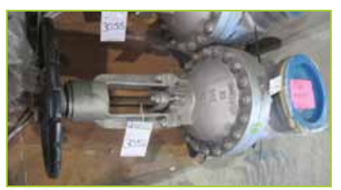
GATE VALVE WILLIAMS 30W-2 C5 GO (12") GATE VALVE, FLEXIBLE WEDGE, 12 IN, BUTT WELD, SCHEDULE 40, ANSI CLASS 300, CHROME-MOLY, ASTM A217, GR C5, TRIM 8, MANUAL, OS&Y