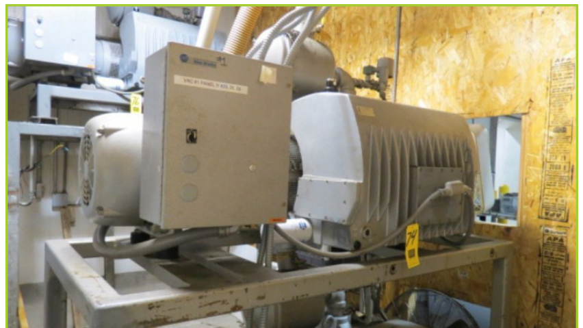
(3) BUSCH VACUUM PUMP, MODEL: 0630CA2A1, 24 HP