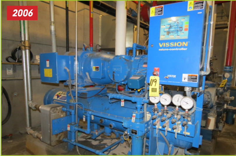
2006 VILTER 125 HP SCREW AMMONIA COMPRESSOR, MODEL: V5M361, S/N: 4145, WITH VISION MICROCONTROLLER AND RAM STARTER