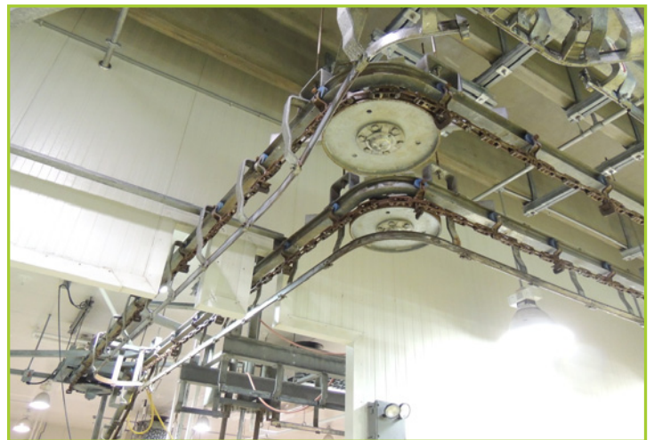
APPROXIMATELY 450' MEAT RAIL SYSTEM, WITH INCLINE, SWITCHES, DRIVE CHAIN, LOWERATOR AND DRIVES