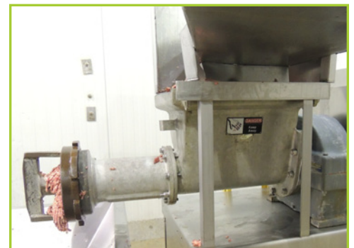
WESTON ELECTRIC MEAT GRINDER, MODEL: 08-2201-W