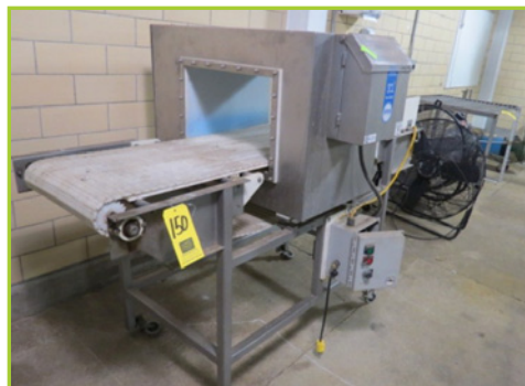
LOMA IQ2 METAL DETECTOR, WITH CONVEYOR AND 19 1/2" X 12" APERTURE