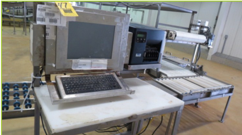
(2) RICE LAKE 10,000 LB CAPACITY DIGITAL OVER UNDER UNITS, MODEL: CW801-2A

(24) Sections 2-Deep Roll-Back Pallet Racking, approx. 18' high (26) Sections Pallet Racking, approx. 18' high (60) Pallet Rack Cross Braces; (18) 2-Deep Roller Beds; Assorted Pallet Rack Rollers and Bed Components