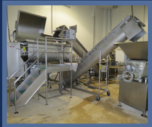
Scan this QR Code with your smartphone for More Information.

2006 Formax Model Pfm6 Patty Former • 2006 Weiler Grinders • 2006 Amfec Mixer/Blender, Augers & Dump Systems • Vemag Stuffer, Portioner & Skinner • Meat Saws & Trim Tables • 2006 Cryovac Old Rivers Vacuum Packager & Additional Packaging • Refrigeration • Conveyor Systems & Meat Rail System • Weighing Systems - Labeler • Air Compressors & Boilers • Vacuum Pumps • Material Handling - Pallet Racking • General Plant - Shop - Offices