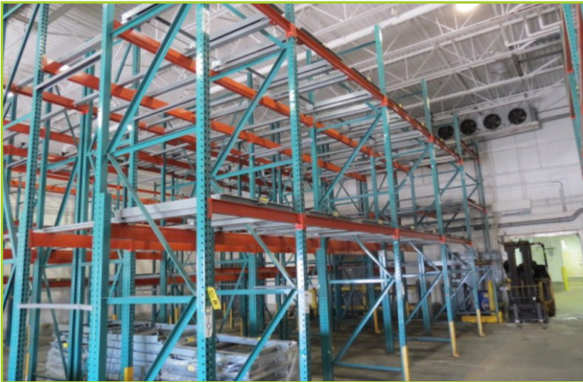
SECTIONS PALLET RACKING, APPROXIMATELY 18' HIGH, WITH (5) UPRIGHTS, (22) CROSS BRACES, AND (22) WIRE BEDS