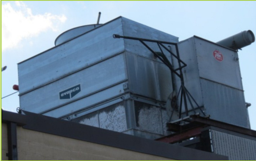
EVAPCO EVAPORATIVE CONDENSER, MODEL: ATC-442B S/N: 8-384012