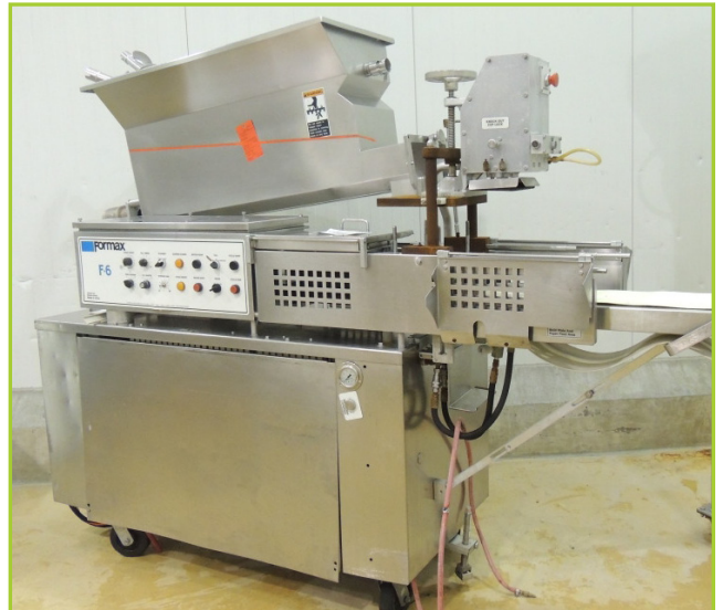
FORMAX PATTY FORMER, MODEL: PFM-6, S/N: 123, WITH ACCESSORIES.