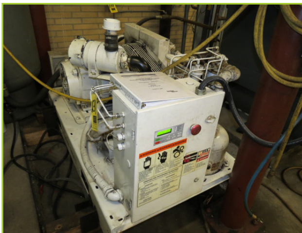
GARDNER DENVER 30 HP SCREW AIR COMPRESSOR