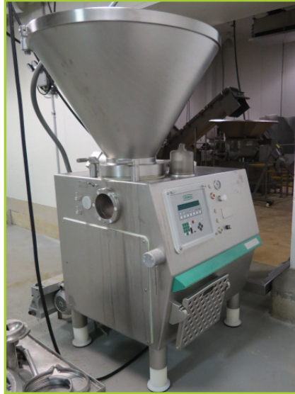
TRIANGLE VEMAG STUFFER, MODEL: HP-10C, W/ BUSCH VACUUM PUMPS & DUMPER, FILL & SEAL MACHINE