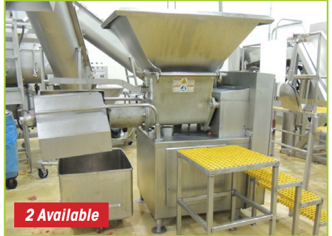
2006 WEILER GRINDER, MODEL: 878