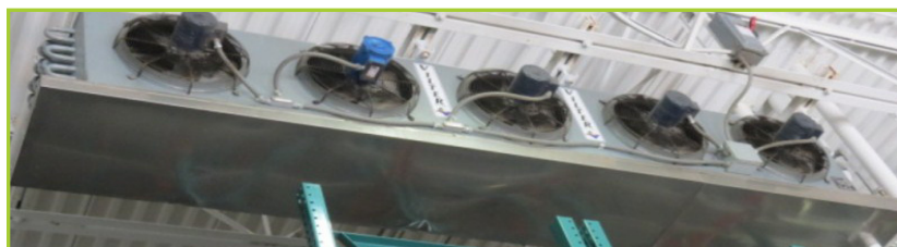
(19) 2006 VILTER AMMONIA BLOWERS