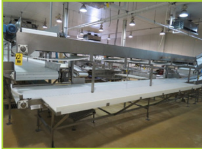
APPROXIMATELY 41' X 30" S/S BI-LEVEL TRIM TABLE, WITH INTERLOX BELT, CUTTING BOARDS, AND DRIVES

2006 Weiler Grinder, Model: 878, S/N: 06-1970 2006 Weiler Grinder, Model: 1176, with Square D S/S Safety Switch and Size 4 Starter Weston Electric Meat Grinder, Model: 08-2201-W, S/N: W2210080451 Assorted Weiler Grinder Plates and Knives