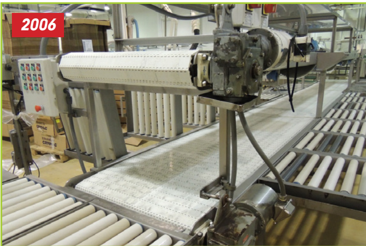
S/S FRAME CONVEYOR SYSTEMS - NEW 2006