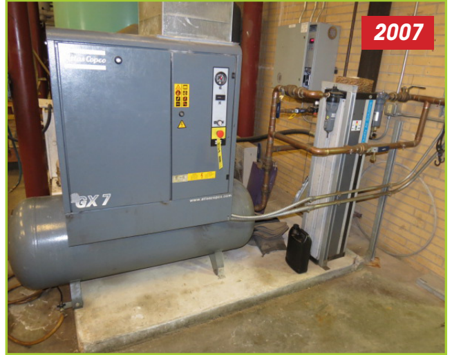
2007 ATLAS COPCO AIR COMPRESSORS