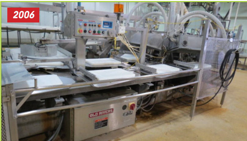
2006 CRYOVAC OLD RIVERS 6-HEAD VACUUM PACKAGER, MODEL: 8600B-18-264, WITH VACUUM PUMP