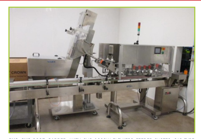
CVC CVC-1205 CAPPER. WITH CVC 1200W ELEVATOR FEEDER [NOTES: CAP TYPE: PLASTIC, METAL, OR CRC / CAP RANGE: 25MM - 77MM / BOTTLE HEIGHT: 2" - 8.5"; BOTTLE DIAMETER 1.25" - 4.5" / MAX 120BPM]. WITH SLAT TOP CONVEYOR SECTION (APPROX 4.5"W X 29'L)