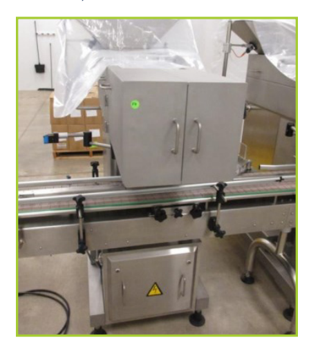
CVC CVC1220 CAPSULE COUNTER#1, YEAR-2013 [NOTES: MAX 55BPM ON A COUNT UP TO 100]. WITH CVC 1101 ELEVATOR FEEDER