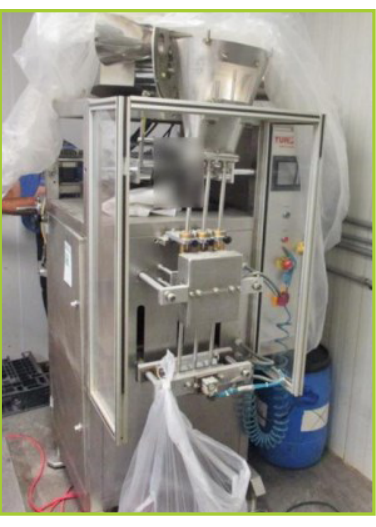
WESTERN SLOPES TURN AROUND CONVEYOR