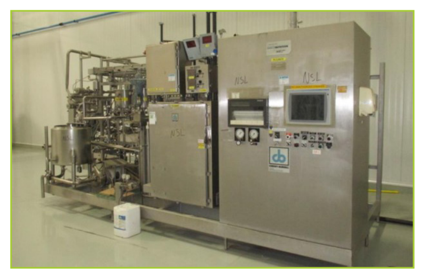
CHERRY-BURRELL 750 SKID-MOUNTED HTST ASEPTIC PASTEURIZER 25-GPM, WITH ALLEN BRADLEY CONTROLS (FOOTPRINT 22'LX8'W). WITH ONLY SHELL & TUBE HEAT EXCHANGER.