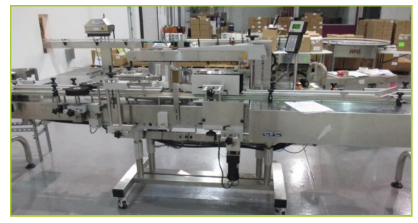
CVC CVC-430CS WRAP LABELER [NOTES: MAX 175BPM]. WITH VIDEOJET 8.4-CLARITY/DATAFLEX-6420 PRINT CODER [NOTES: CODE ON LABEL]. WITH SLATTOP CONVEYOR SECTION (APPROX 4.25"W X 11'L).