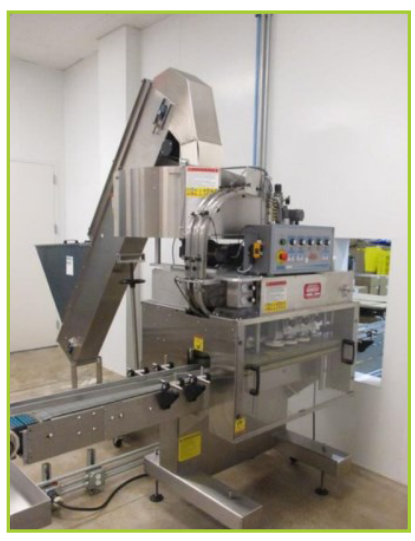
KAPS-ALL A6 LARGE PROFILE CAPPER [NOTES: 120MM] MAX CLOSURE]. WITH KAPS-ALL FS-B CAPPER ELEVATOR FEED STATION S/N-7697-B. WITH SLAT TOP CONVEYOR SECTION 5.5"W X 16.5'L.

PILL FILLERS, TABLET COUNTERS, BAG FILLERS, SHRINK WRAP MACHINES, CONVEYORS, COTTONERS, PORTABLE TOOLBOXS, PORTABLE METAL DESKS, FACILITY SUPPORT EQUIPMENT AND MORE!