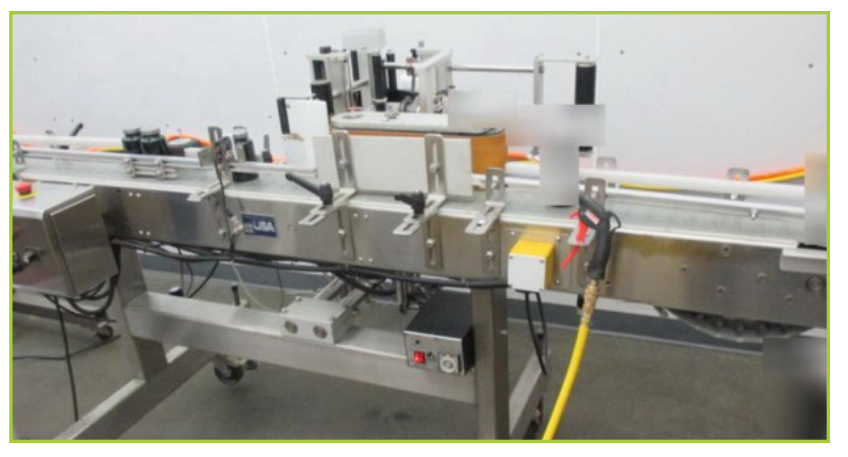
QUADREL Q-10 LABELER, WITH TENACIOUS MACHINERY FOIL PRINTER AND INCLUDES MANUALS. FOOTPRINT 8'LX6'W ON WHEELS