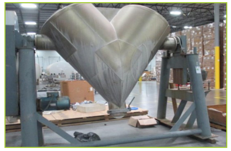
PATTERSON KELLEY 60-CUFT V-SHELL BLENDER, WITH CONTROL CABINE