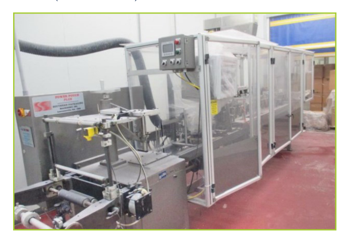
BARTELT / SOUTHERN PACKAGING POWER-POUCH-PLUS/IMF-7-14 HORIZONTAL FORM FILL SEAL MACHINE (FUNNEL POUCH MAKER/FILLER CONVEYOR), YEAR-1997