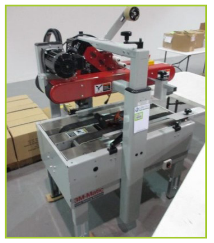
3M/LIL DAVID 700A CASE SEALER