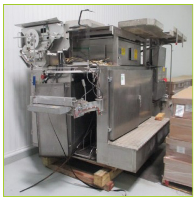
JAGENBURG 105-1U STRAIGHT LINE GLUER, LINE SPEED 1.300 BFPM, CARTON RANGE LENGTH 3"TO 48.25", CARTON RANGE WIDTH 2"TO 48.25". YEAR 1989