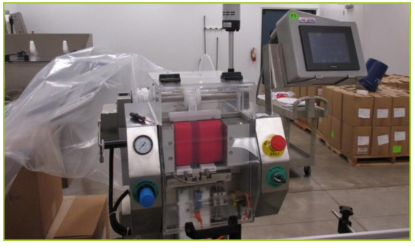
CVC CVC1103-R DESICCANT FEEDER, [NOTES: 1 GRAM DESICCANT @ MAX 120BPM