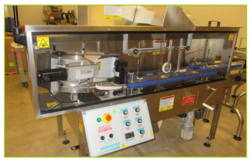
KAPS-ALL AU-3C/ORIENTAINER UNSCRAMBLER-CLEANER [NOTES: MAX 3" DIAMETER / MAX 6" TALL / MAX 300BPM]