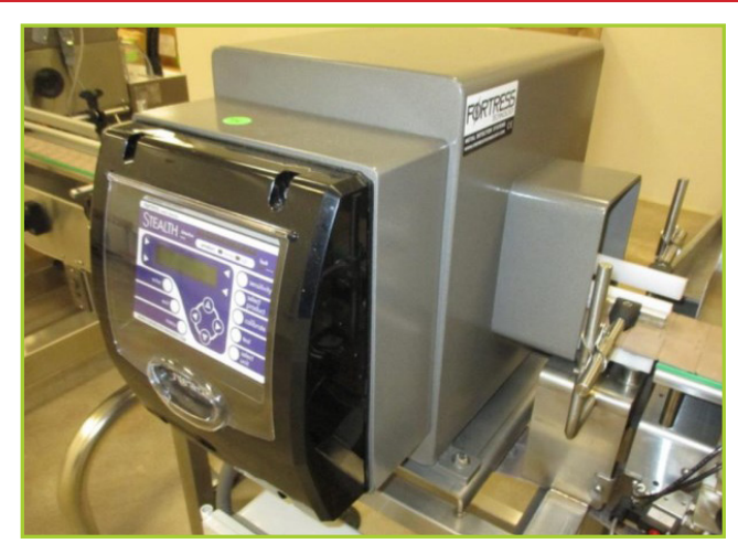
ROTARY STAINLESS STEEL TABLE (APPROX 34" FORTRESS STEALTH METAL DETECTOR [NOTES: REJECT STATION]