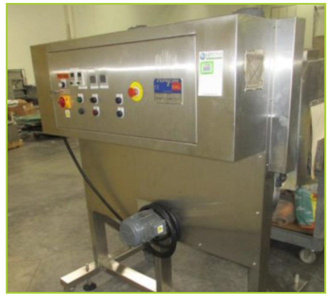
NAFM-OAL OES-200 RADIANT HEATTUNNEL (FOOTPRINT 5'LX4'W)