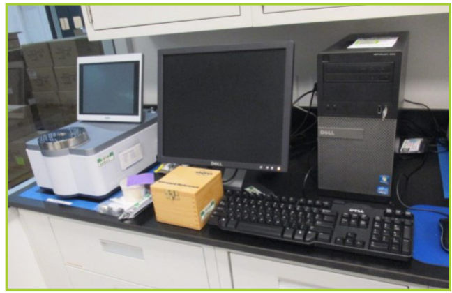
FOURIER TRANSFORM NEAR-INFRARED SPECTROMETER (S/N-200266 ; P/N-1014812/20). WITH ACCESSORIES: BRUKER STANDARD REFERENCE; BRUKER SPARE LAMP; BRUKER REFLECTIVE STAMP(LIQUIDS). WITH FT-NIR USB DONGLE KEY; DELL OPTIPLEX-390 DESKTOP COMPUTER WITH HARD DISK DRIVE; DELL 17" MONITOR.