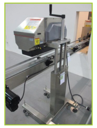
AUTO MATE AM-250 INDUCTION SEALER W/LARGE PROFILE HEAD