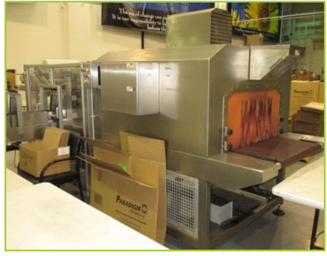
TEKKRA SYSTEMST-230-60 SHRINK BUNDLER SYSTEM [NOTES: 3-PACK 75CC BOTTLES / 12-PACK SQUARE DAIRY / 3-PACK 200CC]. WITH ALLEN BRADLEY PANELVIEW PLUS-400 CONTROL PANEL. WITH CONVEYOR BELT APPROX 28"WIDE