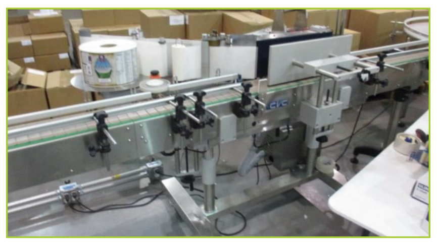
CVC CVC310C6 LABELER [NOTES: VACUUM WRAP STATION / MAX 160BPM]. WITH VIDEOJET DATAFLEX 6420 PRINT CODER [NOTES: PRINT ON LABEL]. WITH SLAT TOP CONVEYOR 6"WX11'L. WITH DOCUMENTATION