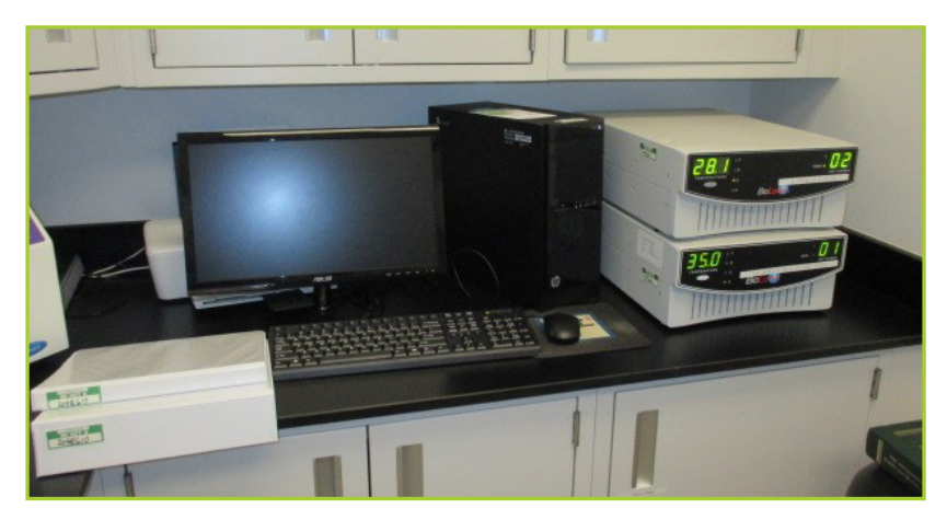
BIOLUMIX AUTOMATED MICROBIOLOGICAL PRODUCTTESTING (2 -INSTRUMENT CABINETS) SYSTEM, S/N-492 & 5219. WITH: BIOLUMIX VALIDATION DOCUMENTATION BINDER; BIOLUMIX REFERENCE DOCUMENTATION BINDER; HP #110-014 DESKTOP COMPUTER WITH HARD DISK DRIVE; ASUS 20" MONITOR; HP #1010 DESKJET PRINTER.