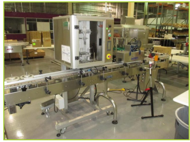
UNIQSEAL TE-100 SHRINK NECK BANDS MACHINE [NOTES: BUTTERFLY FOR 38MM, 45MM, 53MM / MAX 80BPM]. WITH MARBURG GR-6000 SHRINK TUNNEL. WITH SLAT TOP CONVEYOR SECTION (APPROX 4.25"W X 19'L)