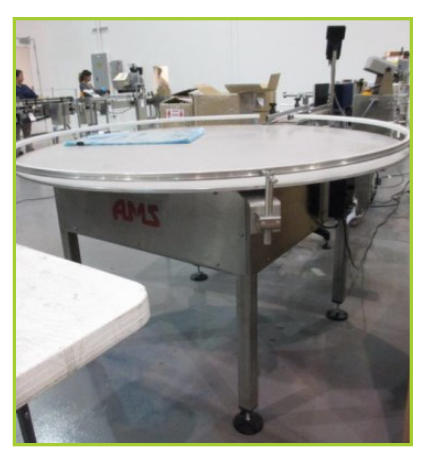
AMS FILLING SYSTEMS PACKOUT TABLE 60" DIAMETER