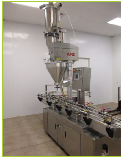
AMS FILLING SYSTEMS A-500 AUGER FILLER [LIFT STATION; WITH DUAL HEAD FRAME; VACUUM FEEDER; LARGE FORMAT CONVEYOR - 0.75"WX12L SLAT TOP] WITH PNEU-COM INFIN-A-TEK VACUUM HOPPER/FEEDER.