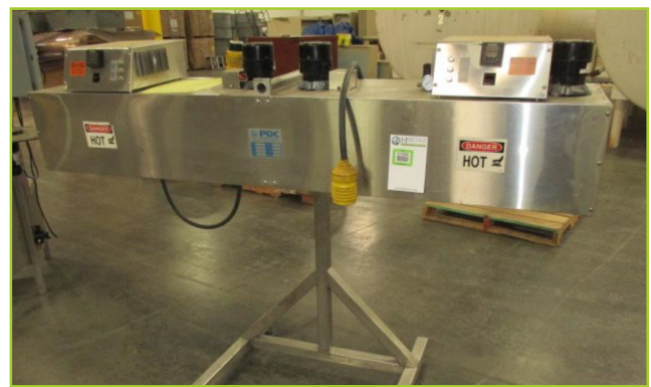
PDC INTERNATIONAL RAD/KR02472 RADIANT HEAT TUNNEL (FOOTPRINT 6'LX3'W)