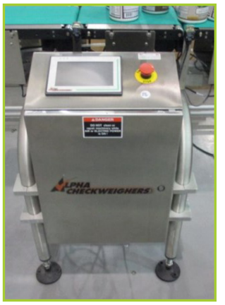
ALPHA CHECKWEIGHERS EW-8 CHECK WEIGHER