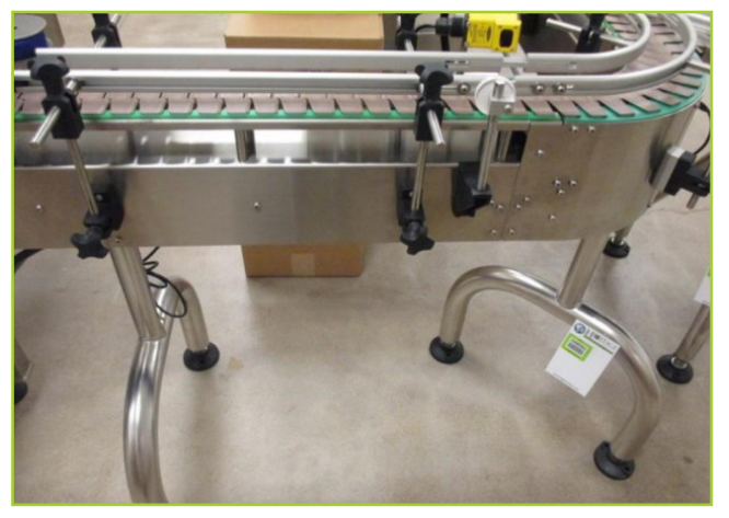
SLAT TOP CONVEYOR SECTION (APPROX 4.25"W X 17'L)