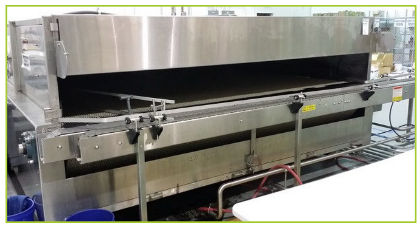
COOLING TUNNEL, CHILLED WATER; 10'X25' INTERLOX TYPE BELT WITH CONTROLS AND HEAT EXCHANGER