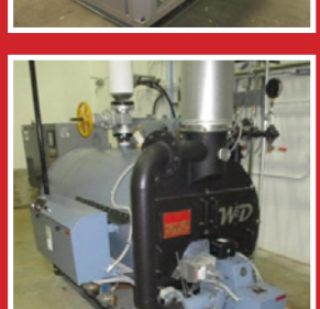
COMPLETE LISTING ONLINE

PILL FILLERS, TABLET COUNTERS, BAG FILLERS, SHRINK WRAP MACHINES, CONVEYORS, COTTONERS, PORTABLE TOOLBOXS, PORTABLE METAL DESKS, FACILITY SUPPORT EQUIPMENT AND MORE!