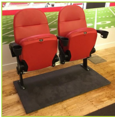
(2) ICONIC RED LEATHER STADIUM SEATING WITH FLOOR MOUNT