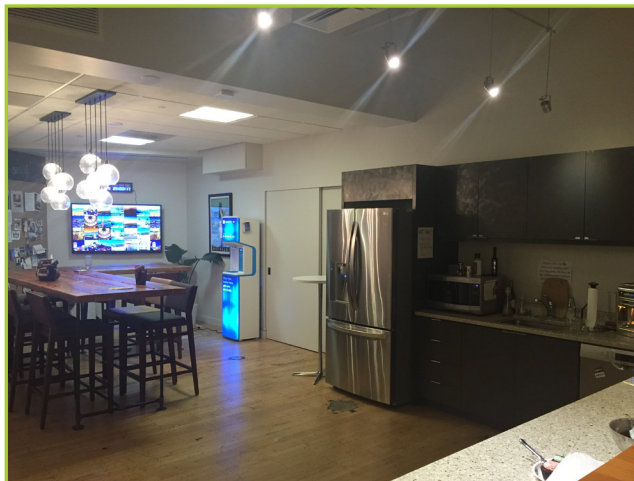
HIGH END KITCHENETTE INCLUDING REFRIGERATOR, DISHWASHER, AND OTHER APPLIANCES