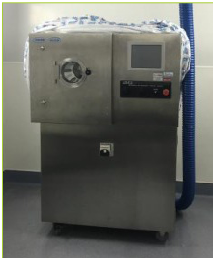
FREUND VECTOR LDGS HI-COATER LABORATORY DEVELOPMENT COATING SYSTEM WITH 1.5L (11.5") PAN + INLET/EXHAUST DUCTS; 8L (17.8") PAN + INLET/EXHAUST DUCTS