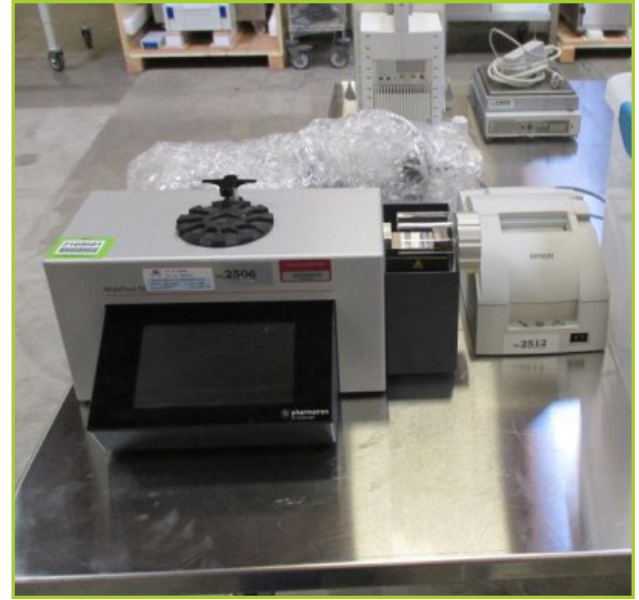
SOTAX PHARMATRON MULTITEST 50 G2 TABLET HARDNESS TESTER WITH FCD 5KP AND 20KP HARDNESS CALIBRATION; 2MM & 10MM THICKNESS CALIBRATION; (1) EPSON TM-220D PRINTER