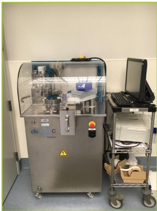
CAPSUGEL CFS 1500 C CAPSULE AND FILLING SYSTEM WITH SIZE CHANGE KIT AND PROTECTIVE COVERS KIT, MANUALS