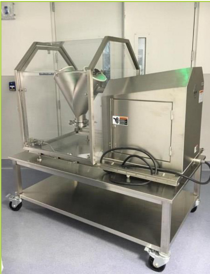
PATTERSON-KELLY MVP5 V-BLENDING SYSTEM WITH 16QT SHELL, 8QT SHELL, AND 4QT SHELL