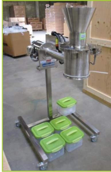
QUADRO COMIL MILLING SYSTEM WITH ROUND IMPELLER, R032 SCREEN, R039 SCREEN, R045 SCREEN. YEAR 2014