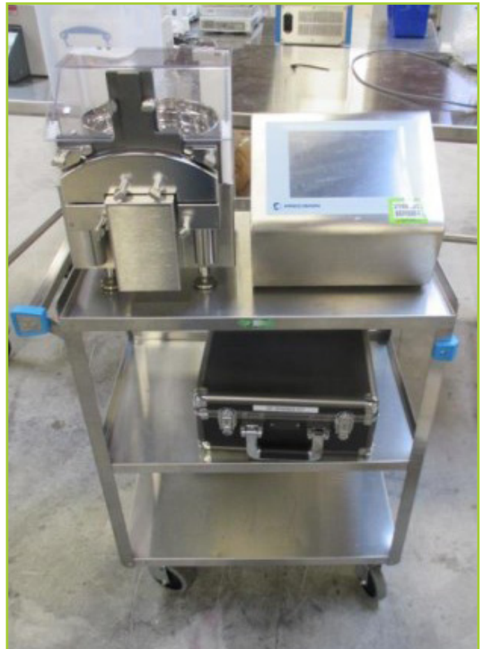
SADE SP-B40 TABLET / CAPSULE WEIGHT SORTER WITH SPARES KIT AND S.S CART