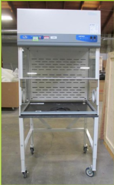
LABCONCO BALANCE HOOD WITH PORTABLE TABLE