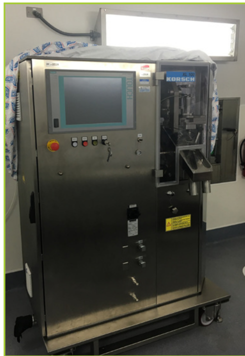
KORSCH XL 100 TABLET PRESS