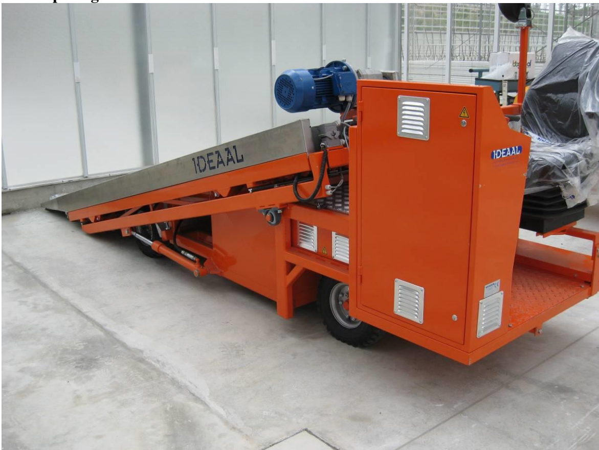
Block spacing machine

A link to see the movie: Block spacing machine