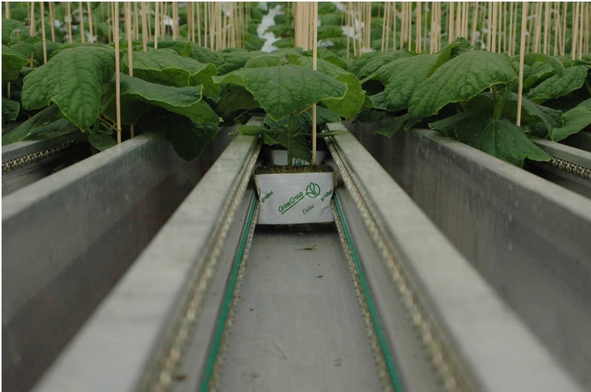
Picking-up upper deck

Combination software so the driving part of the equipment could also be used for the picking-up / re-spacing equipment.