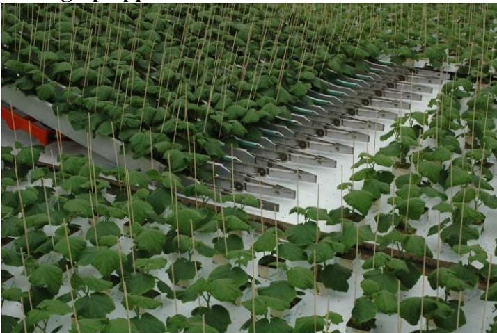
Picking-up upper deck