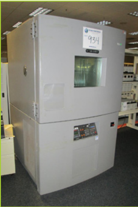
TEST EQUITY 1020C TEMPERATURE CHAMBER

Large Quantities of Microscopes from Olympus, Meji, Unitron, Leica, Vision Engineering, Zeiss, and others. Go Online For Complete Asset List.