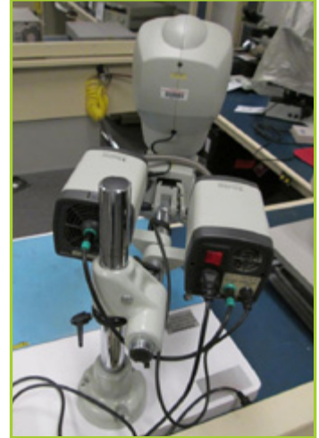
VISION ENGINEERING LYNX STEREO STEREOSCOPE

Large Quantities of Microscopes from Olympus, Meji, Unitron, Leica, Vision Engineering, Zeiss, and others. Go Online For Complete Asset List.