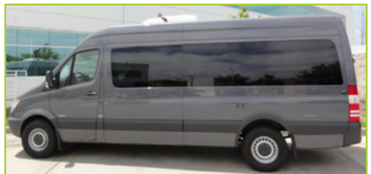
MERCEDES BENZ SPRINTER 2500 2011 12-PASSENGER VAN