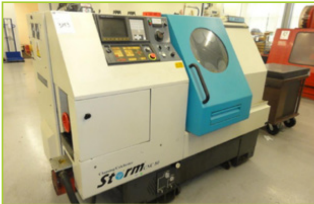
CLAUSING/COLCHESTER STORM 80 CNC SLANT BED LATHE