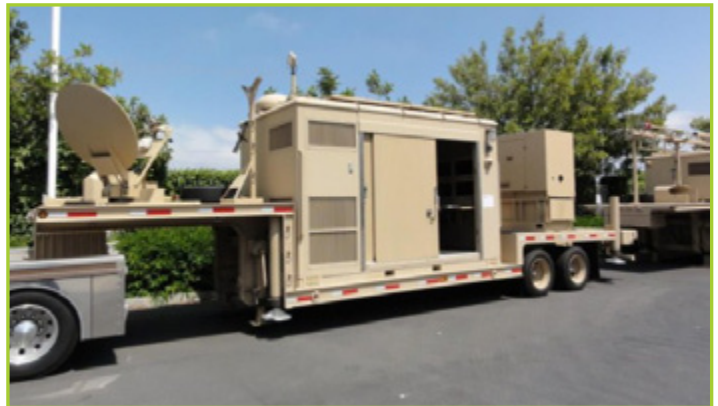
MILITARY GRADE RAPID MOBIL CELLPHONE TOWER