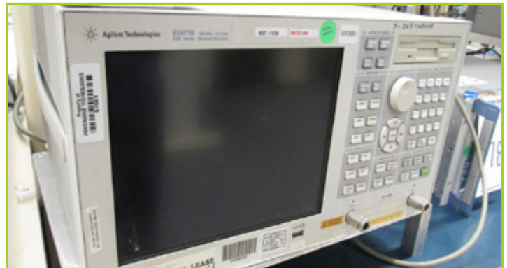
AGILENT E5071B ENA SERIES NETWORK ANALYZER

Large Quantity of Receivers, Antennas, Repeaters, Amplifiers, and Much More. Go Online For Complete Asset List.