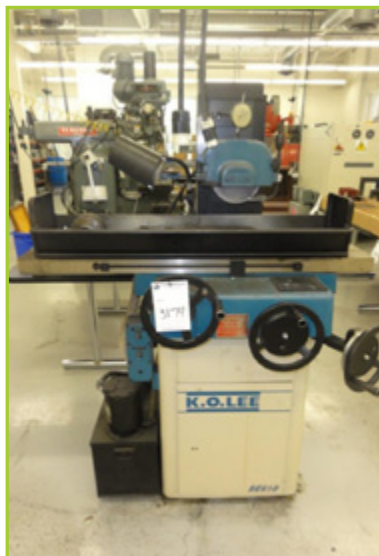
K.O. LEE SE618 SURFACE GRINDER