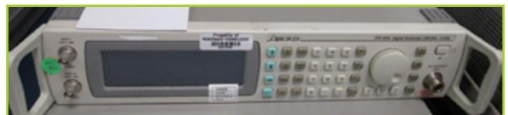
AEROFLEX IFR 3416 SIGNAL GENERATOR