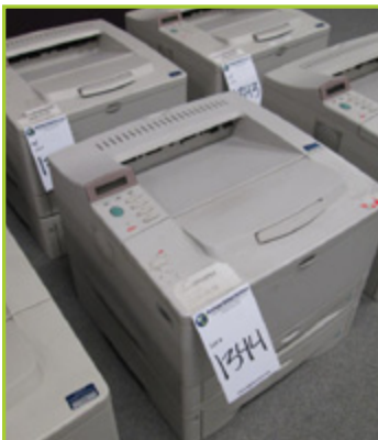
HEWLETT PACKARD 5000N LASERJET PRINTERS